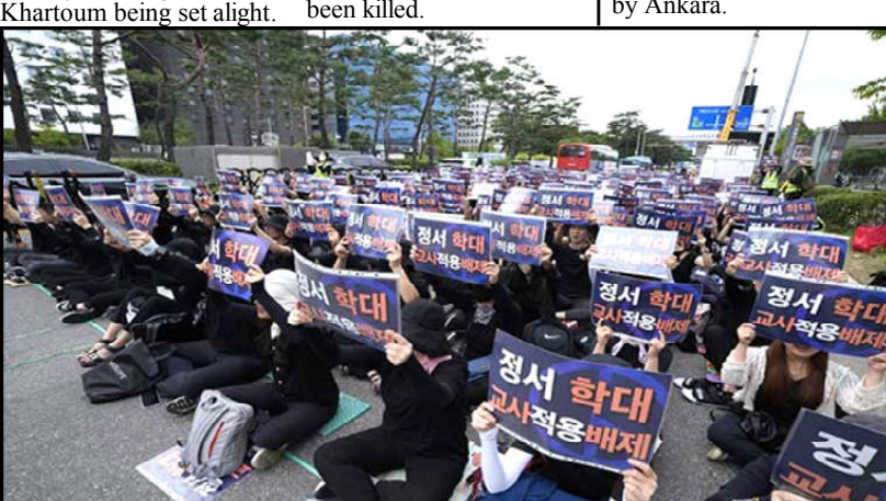
Thousands of South Korean teachers rallying for new laws to protect them

There has been a longrunning Turkish campaign in Iraq and Syria against militants of the PKK, YBS and the Syrian Kurdish YPG militia, which are all egarded as terrorist groups by Ankara