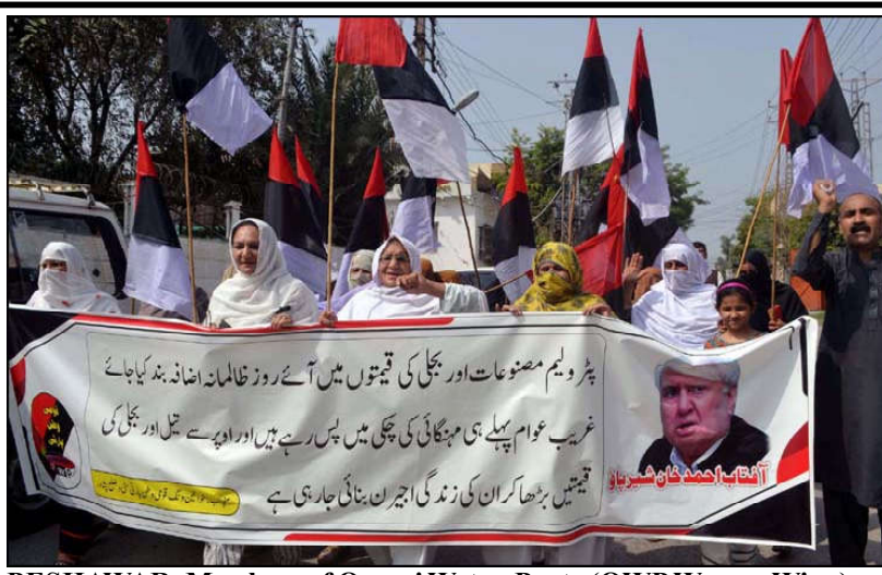
PESHAWAR: Members of Qaumi Watan Party (QWP Women Wing) are holding protest demonstration against massive unemployment, increasing price of daily use products, inflation price hiking and the highly inflated electricity bills, held at Peshawar press club