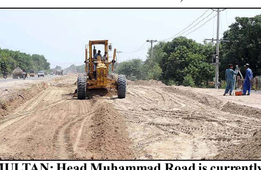
MULTAN: Head Muhammad Road is currently undergoing expansion to ensure smoother traffic flow. This vital route connects several cities in South Punjab, Balochistan, and Khyber Pakhtunkhwa (KPK).

In accordance with statistics provided at the the importance of other provinces adopting reported the most dengue cases—2.627—followed by Punjab (1,961), Sindh (1,014), and Khyber Pakhtunkhwa (234 instances).