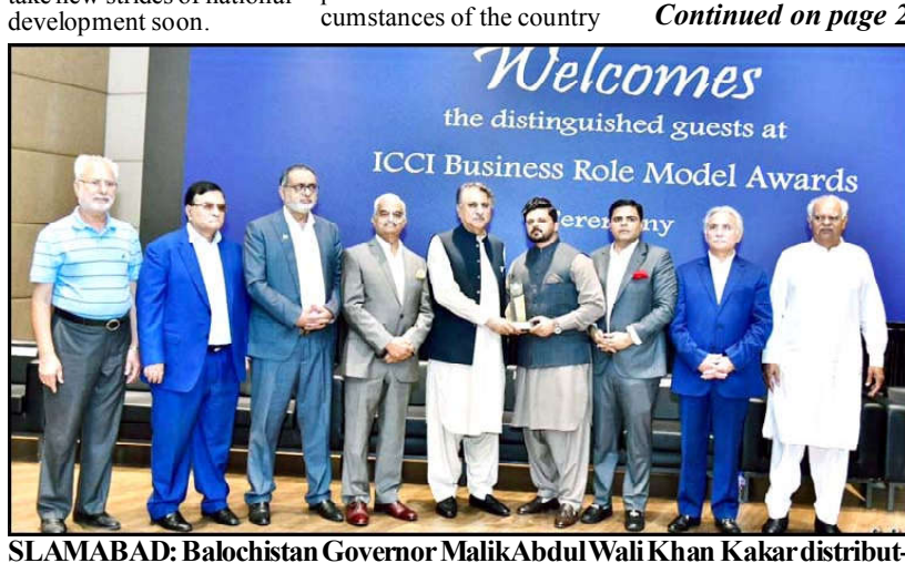
ing awards under organized by Islamabad Chamber of Commerce and Industry