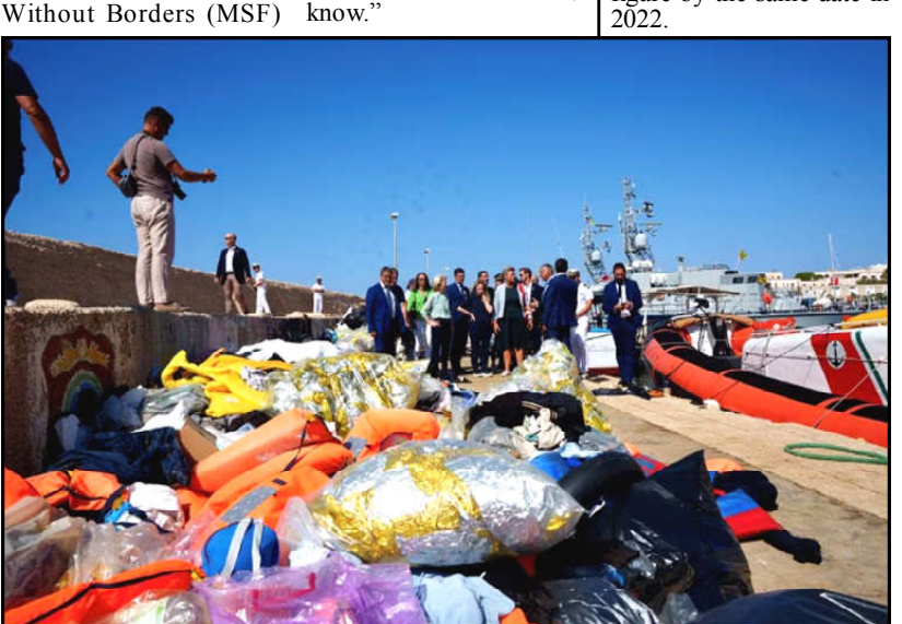
Italian Prime Minister Giorgia Meloni and European Commission President Ursula von der Leyen visit the port where migrants arrive, on the Sicilian island of Lampedusa, Italy.

Nearly 126,000 migrants have arrived in Italy this year, almost double the figure by the same date in