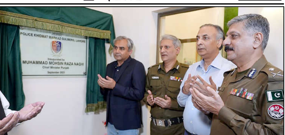
LAHORE: Caretaker Chief Minister Punjab Mohsin Naqvi offering Dua after inaugurating extension project of Police Helpline Centre at Liberty.