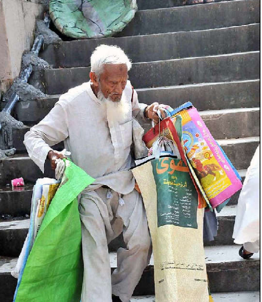
ISLAMABAD: Old man waiting for costumers while selling shopping bags at G-6 bazar in Federal Capital territory.

He said that all available resources will be utilized and other support to improve the quality of education in OPF schools. He said that measures would be taken to resolve all issues of educational institutions.