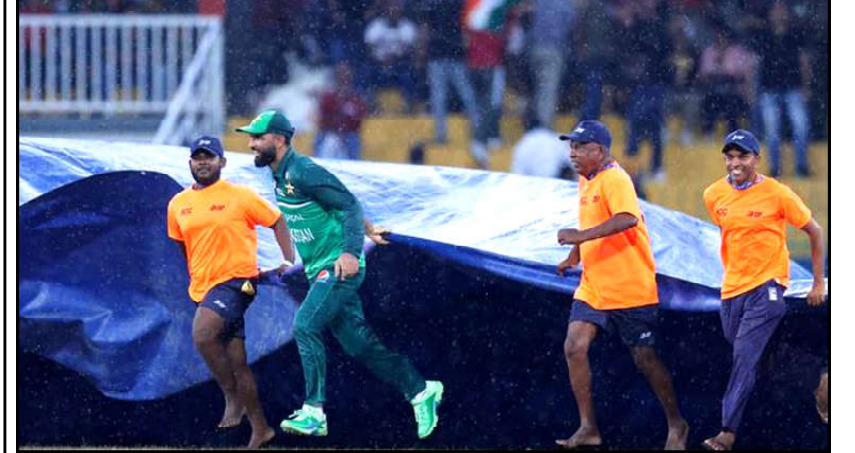
COLOMBO: Netizens took to social media to praise Pakistan's top order batsman Fakhar Zaman as he helped ground staff put on covers as the rain interrupted the Super 4 match between arch-rivals India and Pakistan being played in Colombo on Sunday.

The game interrupted in the 25th over due to a heavy downpour, saw the ground staff rush to put on the covers.