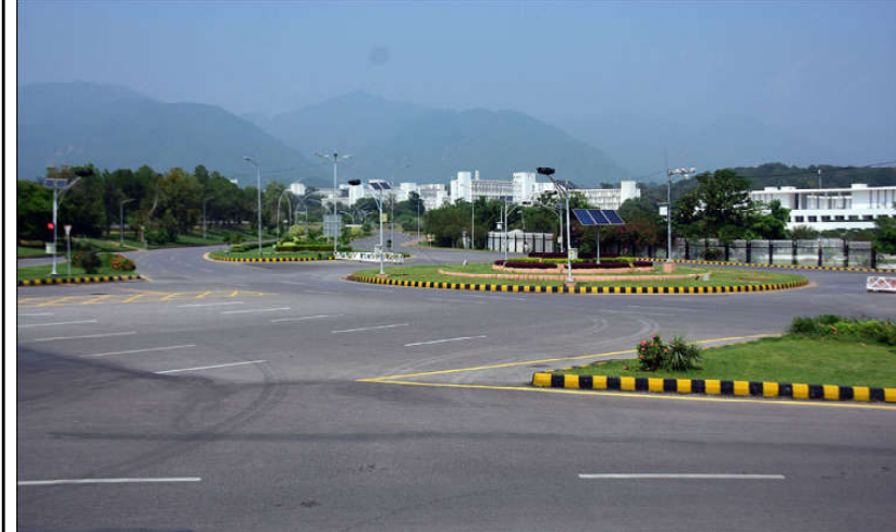
ISLAMABAD: A view of deserted Constitution Avenue in Federal Capital, due to Asia Cup 2023 super four one-day international (ODI) cricket match between India and Pakistan.

through their various platforms. She said the NCSW called upon the criminal justice system to end the prevailing culture of impunity regarding cases of gender-based violence. NCSW would take relevant measures including the establishment of inquiry committees, awareness-raising in their institutions, displaying the Code of Conduct and Anti-Harassment Act at Workplace on their website as well as at prominent spots on campuses.