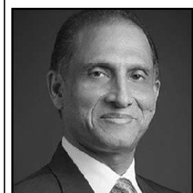
Aizaz Ahmad Chaudhry

Every Sept 6, Pakistan marks Defence Day to celebrate the determination of the nation and its armed forces to defend the country against India's aggression in 1965. The war lasted only 17 days, and peace was restored by the Tashkent Agreement of 1966. As happens in most wars, there were no real winners. India was unable to penetrate Pakistan's defences. Pakistan could not liberate Jammu and Kashmir illegally occupied by India.