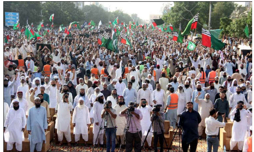
KARACHI: Members of Ahle Sunnat Wal Jamaat are holding Azmat-e-Sahaba and Ahlebait rally, at Shahrah-e-Quaideen in Karachi.

He also said that Quaid-e-Azam always followed principles of democracy and his struggle was constitutional. He stressed on the need to follow the principles of democracy and tolerance to transform Pakistan into a prosperous and welfare state.