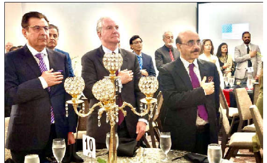
WASHINGTON: Ambassador Masood Khan and Senator Chris Van Hollen attending the Annual Meeting & Gala Dinner of the DMV chapter of APPNA as Chief Guests

Its establishment also involves CAS-affiliated institutes and other Chinese research institutions, as well as universities in Pakistan, such as the University of Peshawar. The center will carry out joint research in four areas: natural disaster and risk management; geological structures and tectonic activities; climate change and environmental effects; and resources.