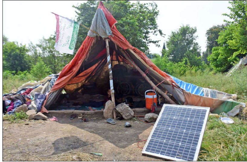
ISLAMABAD: A view of Afghan refugees installed solar panel system outside their tent house on a green belt outside Press Club in Federal Capital.