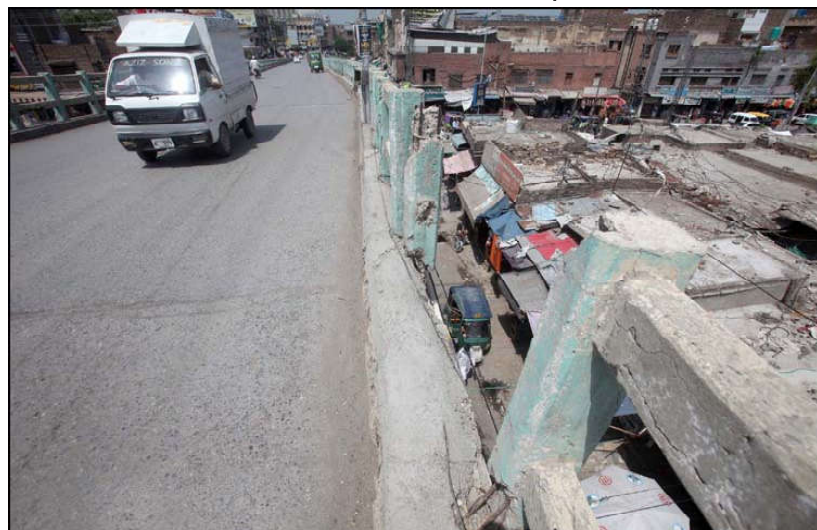
PESHAWAR: Safety wall of Faqirabad Bridge seen broken that may cause any accident and also inviting authorities to draw their attention towards issue, in Peshawar.