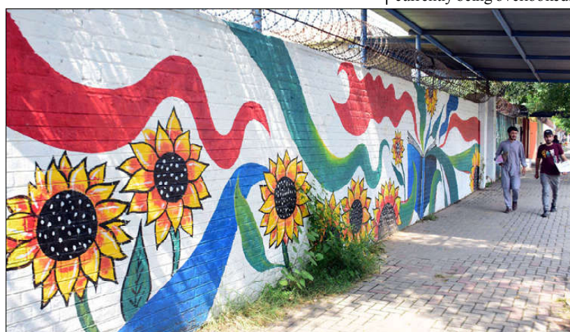
ISLAMABAD: People walk past in front of colorful painting wall of a school at sector F-6 in Federal Capital.