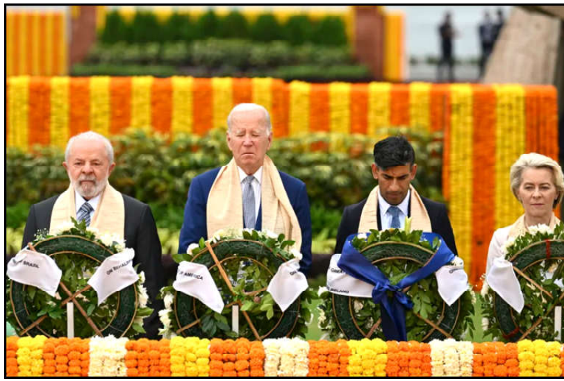
Brazil President Luiz Inacio Lula da Silva, U.S. President Joe Biden, UK Prime Minister Rishi Sunak and European Commission President Ursula von der Leyen pay their tributes at the Rajghat, a Mahatma Gandhi memorial, in New Delhi, India.

French President Emmanuel Macron said on Sunday that the G20, which was founded to solve international economic issues, was not necessarily the place to expect diplomatic progress on the war in Ukraine.