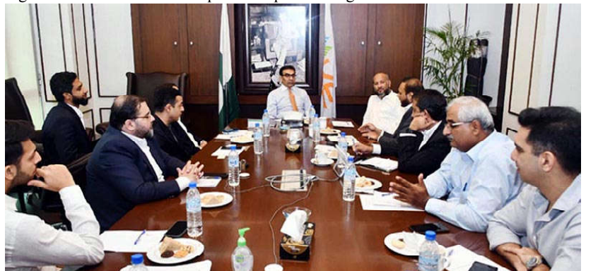
KARACHI: Caretaker Federal Minister for Energy Ali Muhammad Chairing a meeting with officers of K electric

According to the details, Pakistan and Saudi navies are continuing joint military exercises in the ongoing naval exercises called Al-Bahr 14 in the Persian Gulf of Al-Jubail region of Saudi Arabia.