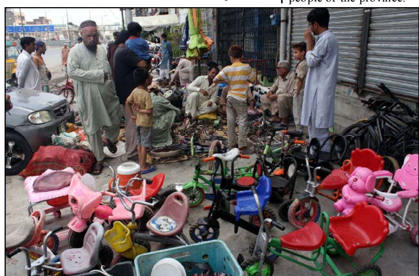
LAHORE: People purchase used items due to price hiking, at makeshift weekly market near Minar-e-Pakistan in Lahore.

LAHORE (INP): Punjab Excise and Taxation Department is all set to launch a mobile application for online registration of the motor vehicles to simplify the process which was considered to be cumbersome in the past. In a bid to provide convenience to the people, the Punjab Excise and Taxation Department is set to launch a mobile application, simplifying the process of vehicle registration. In a statement, DG Excise said that the new computerised application will be launched in a phased manner from tomorrow. "Now data of vehicle and its owner can be better protected", he noted. "An excise official will personally visit the owner for vehicle registration," he said.