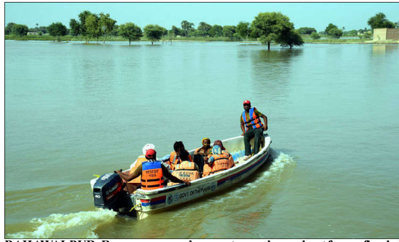
BAHAWALPUR: Rescue personnel evacuate people on a boat from a flooded Ahmedpur Sharqia area.

Mushaal said the notorious occupation authorities unleashed a reign of terror and used the rapes of women as the weapon of war, besides committing the worst war crimes.