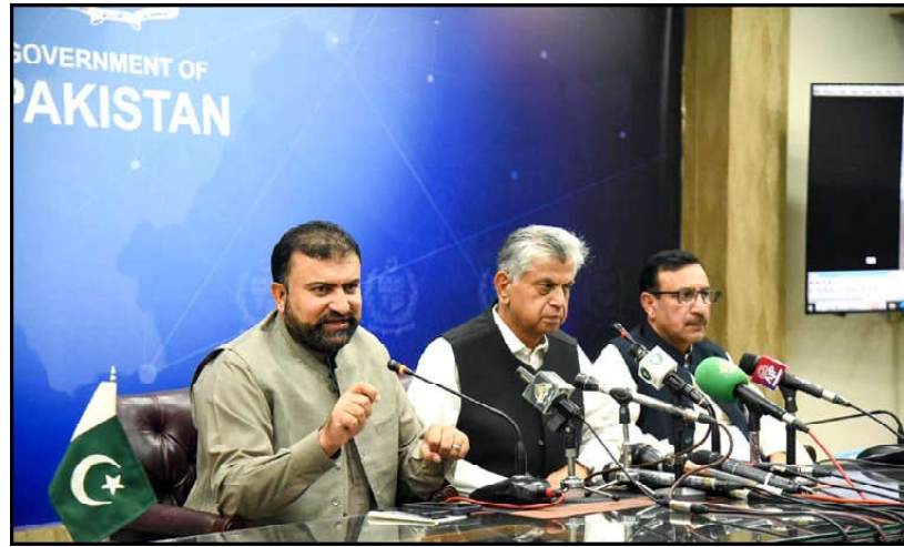
Caretaker Federal Minister for Interior Sarfraz Ahmed Bugti and Caretaker Federal Minister for Information and Broadcasting Murtaza Solangi addressing a press conference in Islamabad.

The injured were shifted to hospital where condition of some wounded people was stated to be critical.