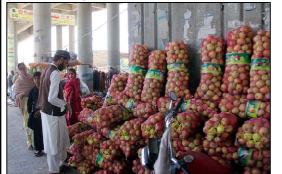
QUETTA: Vendor sells apples to earn his livelihood for support of his family, at a roadside located on Joint road in Quetta.