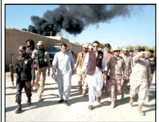
KILLAABDULLAH: Commissioner Quetta Division Muhammad Hanza Shafiqat inspecting ongoing operation for elimination of narcotics

"60 Afghan citizens have been arrested to stop drug cultivation. We want to make Balochistan an international investment hub. We are also addressing the complaints regarding the law and order."