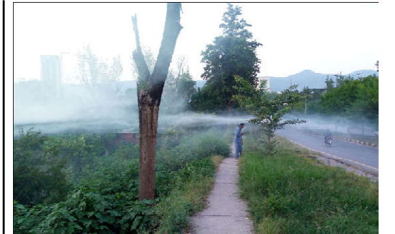
ISLAMABAD: A view of smoke rising in garbage dump alongside a road at sector G-7 is creating air pollution and harmful for the health of area residents showing negligence of concerned department in Federal Capital.

The meeting was a gateway to promote networking among funding agencies, researchers, policymakers and stakeholders besides being a platform for research innovation and necessary insights to steer the future of health research in Pakistan toward new horizons.