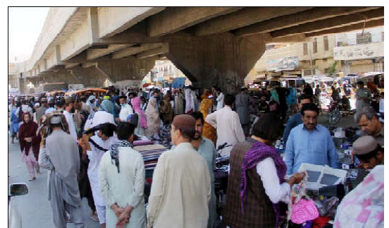
QUETTA: People purchase used goods due to price hiking, at makeshift weekly market located on Benazir Flyover road in Quetta.

He said, "It will undoubtedly contribute to the development of our respective healthcare systems."