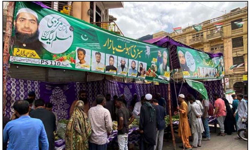
KARACHI: People are buying essential commodities at a Sahulat Bazar established by Pakistan Markazi Muslim League (PMML), in Karachi.

Meth seizures in and around Afghanistan jumped 12-fold in the five years through 2021. Between 2019 and 2022, nearby countries such as Iran and Pakistan also reported increased seizures. Countries as far away as France and Australia have reported seizing methamphetamine that likely originated in Afghanistan, it said. The UNODC said much of the meth from Afghanistan was made with pre-cursor ingredients such as those found in some cold and flu medication. Afghanistan is home to the ephedra plant, which can be used to make methamphetamine, but the UNODC said the quantities needed to produce the drug and the risk of unreliable crops meant that Afghanistan's production did not depend on the plant alone. "Common cold medications and industrial-grade chemicals are more efficient and cost effective for the manufacture of methamphetamine and thus pose a far bigger threat," the UNODC said.