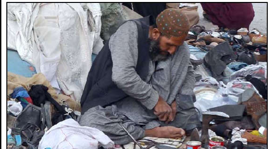
QUETTA: A cobbler repairing old shoes for selling purpose at Weekly Bazar at Joint Road.

NEW DELHI: It is vital to increase quota resources for the International Monetary Fund (IMF) before year-end, its chief, Kristalina Georgieva, said on Sunday, while urging members of the G20 bloc to deliver on a promise of $100 billion a year in climate funds. In a declaration at its summit in New Delhi this weekend, the grouping vowed to tackle debt vulnerabilities in low and middle-income countries "in an effective, comprehensive and systematic manner", but offered no fresh plan of action. "G20 members must lead by example in delivering on the promises of $100 billion per year for climate finance, supported by strengthening the multilateral development banks," Georgieva said in a statement at the end of the two-day summit. "Countries also need to mobilise domestic resources to finance and manage the green transition through tax reforms, effective and efficient public spending, strong fiscal institutions, and deep