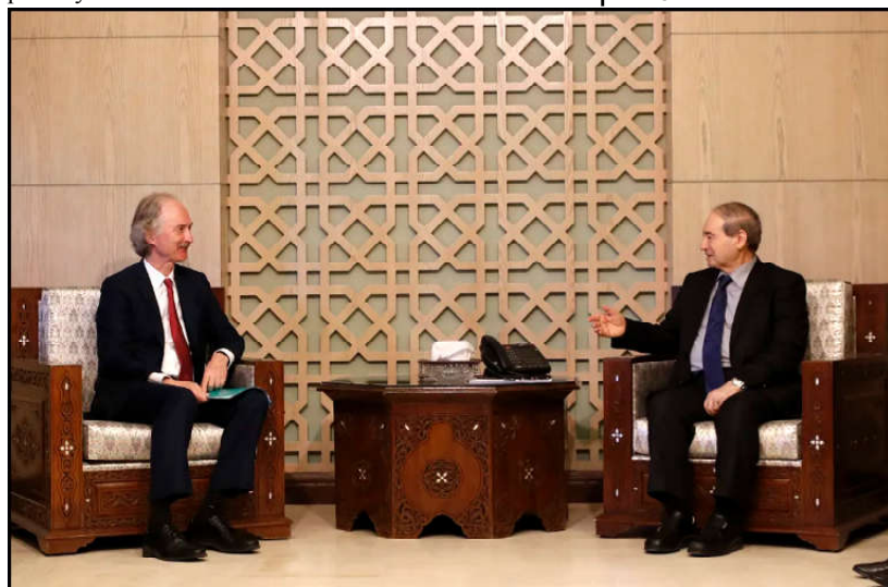
U.N. special envoy for Syria Geir Pedersen meets with Syrian Foreign Minister Faisal Mekdad, in Damascus, Syria.

With international donor support dwindling, U.N. agencies have been cutting programs due to budget cuts for years. The U.N. estimates that some 300,000 civilians died during the first decade of the uprising, while half of the pre-war population of 23 million were displaced. "The situation inside of Syria has become even worse than it was economically during the height of the conflict," U.N. special envoy for Syria, Geir Pedersen, told reporters in Damascus following a meeting with Syrian Foreign Minister Faisal Mekdad.