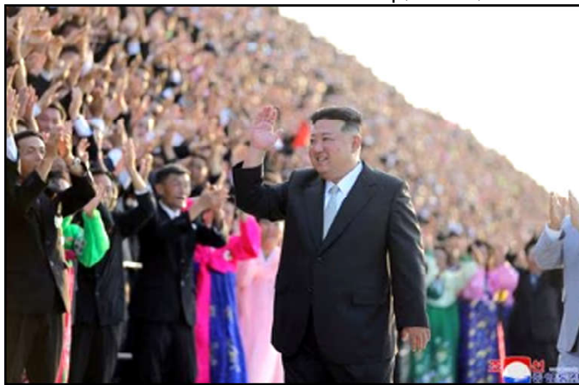
North Korean leader Kim Jong Un attends a celebration event marking the 75th anniversary of the founding of the country.

MOSCOW: Russian President Vladimir Putin on Sunday held a phone call with the interim leader of Mali, Assimi Goita, and discussed topics including anti-terrorism efforts and the crisis in Mali's neighbour Niger, the Kremlin said in a statement. According to the statement, the two leaders agreed that the crisis in Niger, where a July coup ousted President Mohamed Bazoum, could only be resolved by diplomatic means. West Africa's main regional bloc, The Economic Community of West African States (ECOWAS),