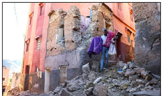
A man carries belongings out of his damaged house, in the aftermath of a deadly earthquake in Moulay Brahim, Morocco

It may be mentioned here that QESCO had launched massive campaign against the power theft in the province three days back.