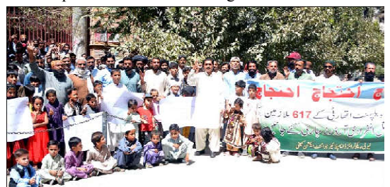
QUETTA: Activists of the newly regularized Joint Action Committee BDA hold a protest in favour of their demands along with their children in front of the Quetta Press Club.