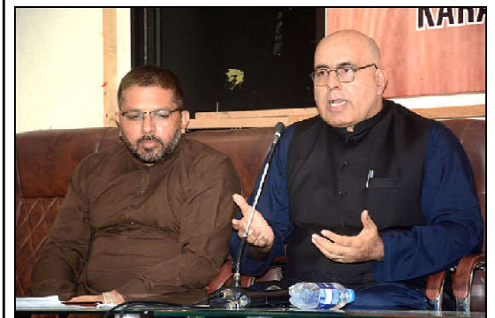
KARACHI: Caretaker Balochistan Minister for Information and Public Relations Jan Achakzai addresses a press conference at Press Club.

The government was planning for a visit of the Crown Prince of Saudi Arabia, adding the visit would be aimed at fully exploiting economic opportunities in the country.