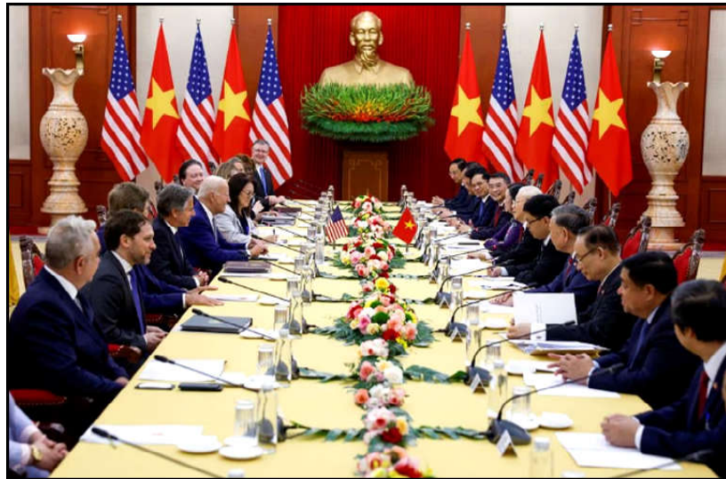
U.S. President Joe Biden attends a meeting with Vietnam's Communist Party General Secretary Nguyen Phu Trong, at the Communist Party of Vietnam Headquarters in Hanoi, Vietnam.

He stated: "We must remain committed to protecting Canadians from any and all forms of interference."