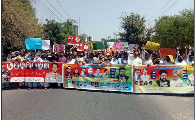
MULTAN: Members of Punjab Teachers Union are holding protest demonstration for acceptance of their demands, at Multan press club.