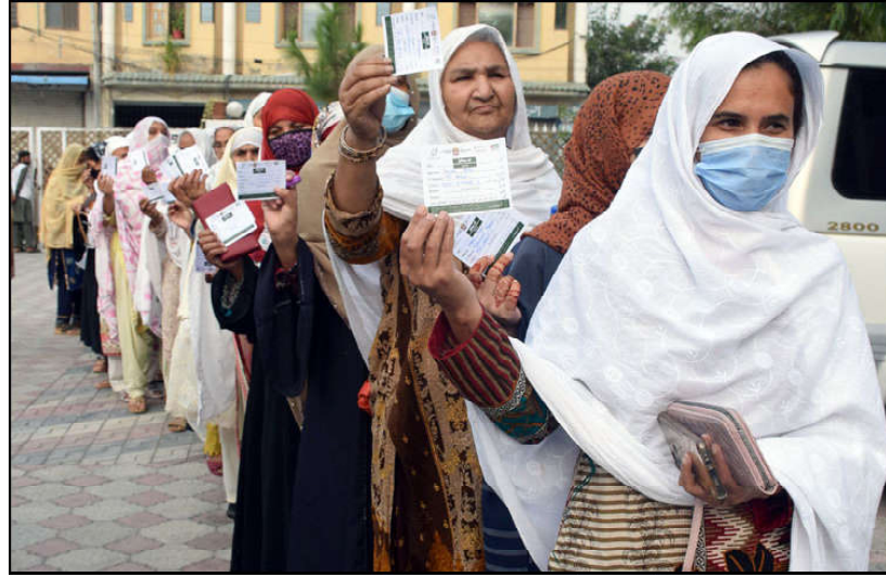
MUZAFFARABAD: Deserving women showing their Rashan cards as stands in a queue for collecting free food package distributing from Mohammed Bin Rashid Al-Maktoum Global Initiatives.

Government of Switzerland, in collaboration with the Higher Education Commission (HEC), has also announced an 'Excellence Scholarship Programme' for Pakistani students for the upcoming academic year 2024-25. The HEC sources further told APP that one-year post-masters research, three-year post-masters, PhD and one-year Post-Doctoral Programmes (PDP) have been announced for the aspiring candidates. The last date for submission of applications with the Swiss embassy is September 30. More details are available on the official website, the HEC local sources told APP. The main purpose of the Swiss Government Excellence Scholarships.