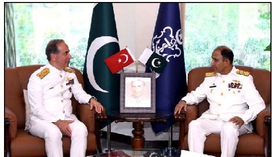
ISLAMABAD: Chief of the Naval Staff, Admiral Muhammad Amjad Khan Niazi exchanging views with Admiral Erucment Tatlioglu, Commander Turkish Naval Forces during meeting held at Naval Headquarters in Islamabad.

The information minister assured the people of Balochistan that the government will do everything in its power to control the menace of sugar smuggling and ensure that the price of sugar remains affordable.