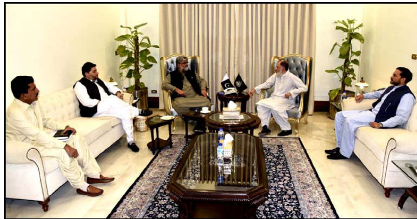
QUETTA: Caretaker Provincial Minister Prince Ali Ahmed Baloch meeting with Caretaker Chief Minister Balochistan Mir Ali Mardan Khan Domki

Referring to the moments of martyrdom of the valiant soldiers, the prime minister said "this is the moment that appears to be a death but actually it is the moment of meeting with the immortal".