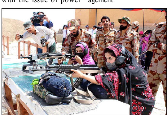
QUETTA: Teachers and Students of Govt Elementary College Jinnah Town Quetta experiencing gunshot at Shooting Range Quetta during their visit on the occasion of Defence Day.