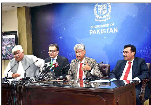
ISLAMABAD: Caretaker Federal Minister for Information and Broadcasting Murtaza Solangi and caretaker Federal Minister for Power Muhammad Ali addressing a press conference.

RAWALPINDI (INP): The Chairman Joint Chiefs of Staff Committee (CJCSC), Services Chiefs and Armed Forces of the country paid rich tribute to martyrs, their families and war veterans on the 58th Defence and Martyrs' Day of the Islamic Republic of Pakistan.