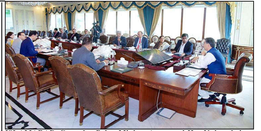
ISLAMABAD: Caretaker Prime Minister Anwaar-ul-Haq Kakar chairs a briefing by Ministry of Commerce and Ministry of Industries and Production.

the best opportunities for investors in Pakistan's key sectors of agriculture, livestock, IT, minerals and energy. Apart from this, efforts at the policy level through the SIFC Forum to improve the overall investment climate were also highlighted. The business community was taken into confidence and reassured of all support and facilitation to fulfill such efforts from private investors. The event concluded with an interactive session, which provided an opportunity for the business community to exchange ideas on investment.