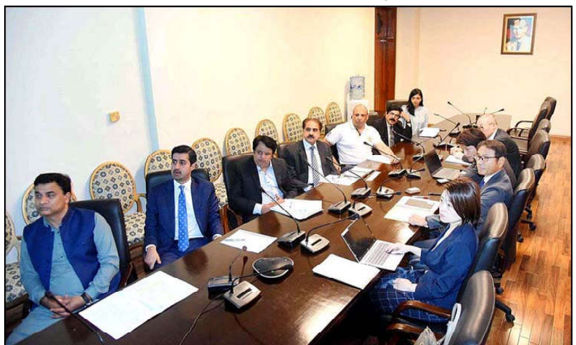
ISLAMABAD: The Special Investment Facilitation Council (SIFC) in a meeting with High-Level Japanese Delegation at PM Secretariat.