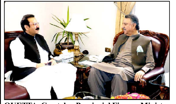
QUETTA: Caretaker Provincial Finance Minister Amjad Rasheed meeting with Governor Balochistan Malik Abdul Wali Khan Kakar

Interim Afghan Government was expected to fulfill its obligations and deny the use of Afghan soil by terrorists for perpetuating acts of terrorism against Pakistan, it added.