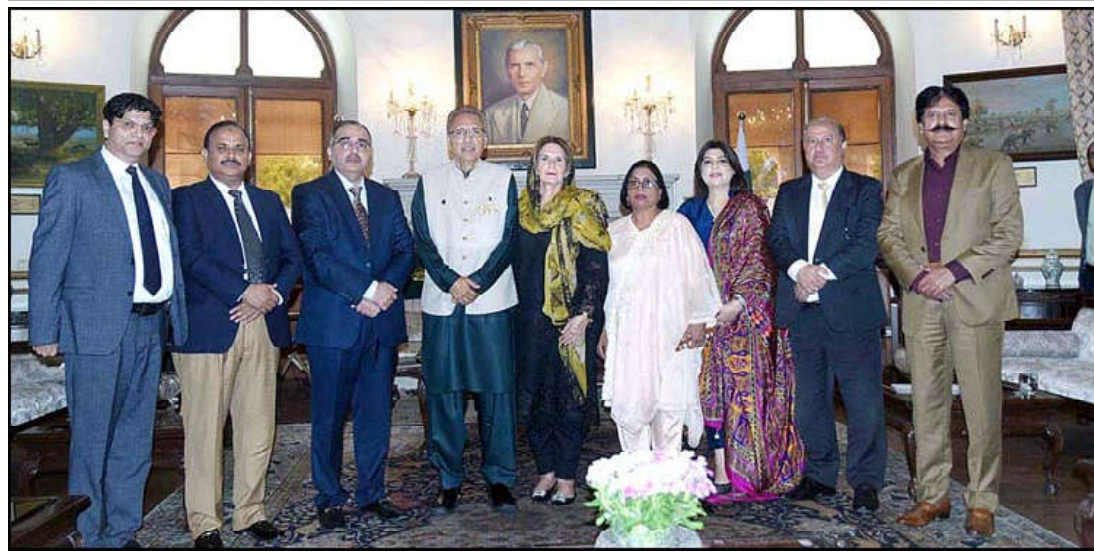
LAHORE: President Dr. Arif Alvi in a group photo with a delegation of Lahore Chamber of Commerce and Industry at Governor House.