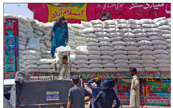
ISLAMABAD: Laborers are unloading the sugar sacks from truck at Fruit and Vegetables Market at Sector I-II as traders are expected to see a decrease in sugar prices after receiving such more trucks, to make their business profitable across country.

While in Lahore, Ambassador Blome and Consul General Hawkins also met with caretaker Punjab Chief Minister Mohsin Naqvi. The leaders discussed opportunities to expand U.S.-Pakistan economic ties, the importance of protecting the human rights and fundamental freedoms of religious minorities, and respect for democracy and rule of law. In his meetings with representatives of religious groups, the Ambassador and Consul General Hawkins reiterated U.S. condemnation of recent attacks on Christian churches and homes, emphasized U.S. commitment to protect and promote religious freedom, and underscored the importance of protecting and respecting human rights and fundamental freedoms for all.