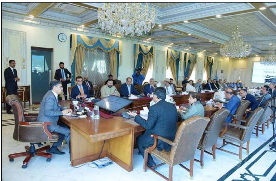
ISLAMABAD: Caretaker Prime Minister Anwaar-ul-Haq Kakar chaired a meeting regarding the Ministry of Commerce.

through global best practices necessary to attract, realize, and retain investments with an aim to eliminate unnecessary regulations, simplify and automate cumbersome procedures. The BOI representatives informed the meeting that the implementation of this law will have several benefits for the economy, including increased investment, job creation, and economic growth. It will also help improve our competitiveness in the global market and attract foreign investors who are looking for a stable and predictable regulatory environment.