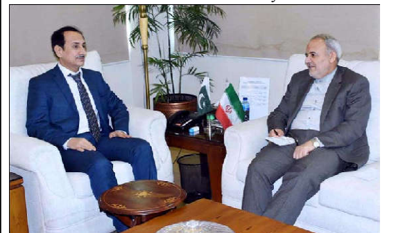
ISLAMABAD: Mr. Reza Amiri Moghaddam, Ambassador of Iran to Pakistan called on Caretaker Federal Minister for National Health Services Regulations and Coordination, Dr. Nadeem Jan at his office.

Iran's primary health care system is very strong. Pakistan will benefit from Iran's primary health system. We are very grateful for the donation of dialysis machines for the people of Pakistan by Iran.