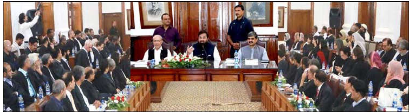
LAHORE: Chancellor/Punjab Governor, Muhammad Balighur Rehman presides over the 360 th meeting of Punjab University Senate in Old Campus.