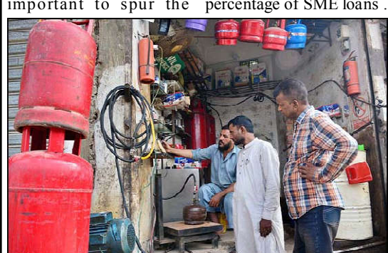
HYDERABAD: People filling their LPG gas cylinder from vendor at Bacha Khan chowk.