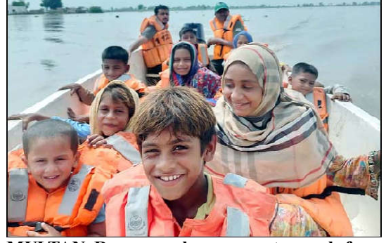
MULTAN: Rescue workers evacuate people from the villages as water from the Sutlej River continued to inundate settlements along its banks, near Multan.

The police had registered a case against PTI leaders and workers after attacking Shadman Police Station, under sections of Anti-Terrorism Act and Pakistan Penal Code.