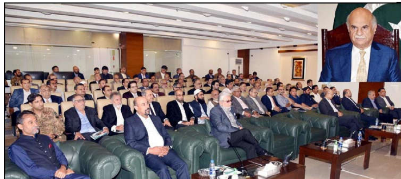
KARACHI: Interaction with Business Community by Special Investment Facilitation Council (SIFC).