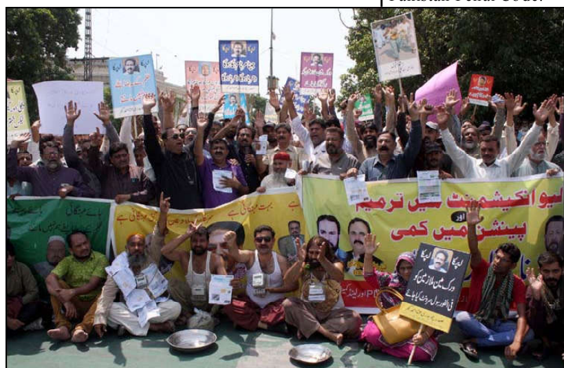
LAHORE: Members of All Pakistan Clerks Association (APCA) are holding protest demonstration against massive unemployment, increasing price of daily use products, inflation price hiking and the highly inflated electricity bills, at Lahore press club.