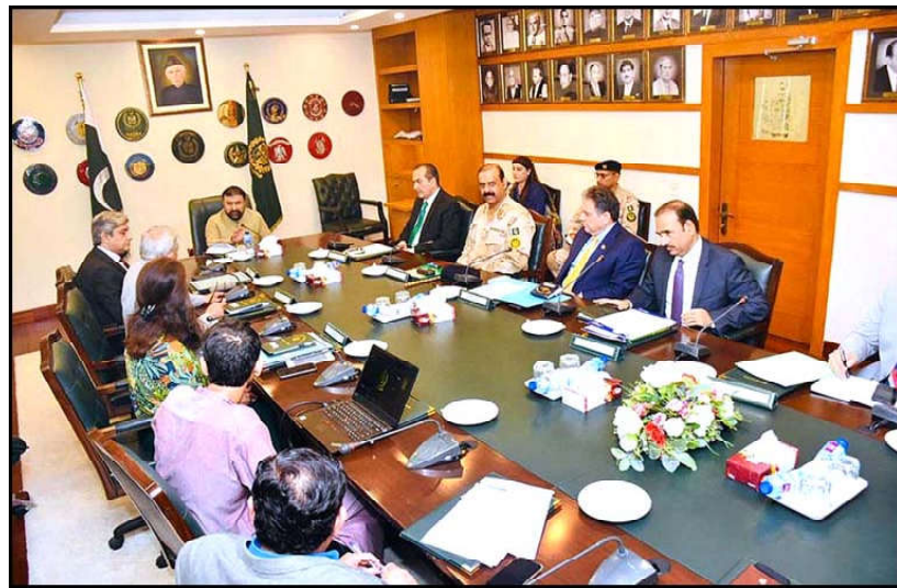
ISLAMABAD: Caretaker Federal Minister for Interior Sarfraz Ahmed Bugti chairing a review meeting.