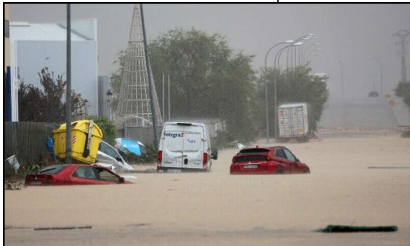
Cars are stranded on a flooded road, following heavy rain in Toledo, Spain.