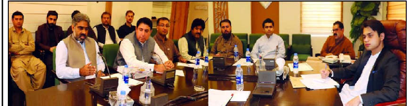
QUETTA: Caretaker Provincial Minister for Sports, Culture and Youth Affairs Nawabzada Mir Jamal Khan Raisani being briefed by Secretary Sports Ishaq Jamali regarding departmental affairs

The caretaker provincial minister said that the water pipeline affected by the flood should be replaced and repaired immediately.