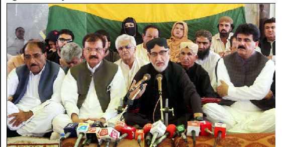
QUETTA: Balochistan National Party (BNP) Chairman, Sardar Akhtar Jan Mengal addressing to media persons during press conference.

He also expressed concern over that B-WASA is operating in a rented building despite it has commercial land. He directed the concerned to prepare an immediate nature plan for construction of a building on the commercial land so as to save millions of rupees on monthly basis.