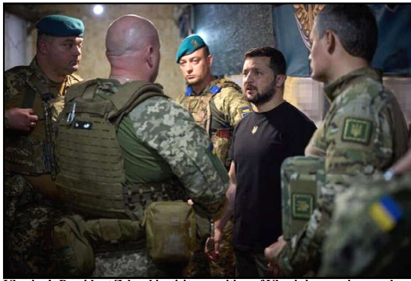
Ukraine's President Zelenskyy visits a position of Ukrainian service members at a frontline, amid Russia's attack on Ukraine, in Donetsk region, Ukraine.

They said the suspects will be held to facilitate their investigation.