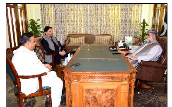
QUETTA: Senator Danesh Kumar meeting with Caretaker Chief Minister Balochistan Mir Ali Mardan Khan Domki