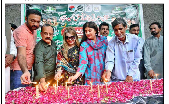
HYDERABAD: Members of Sohni Dharti Youth Council lit up the candles in memory of national heroes of 6th September in connection with Yum-E-Defa Pakistan outside press club.

The DIGP said Traffic Helpline 1915 was serving the citizens round the clock.