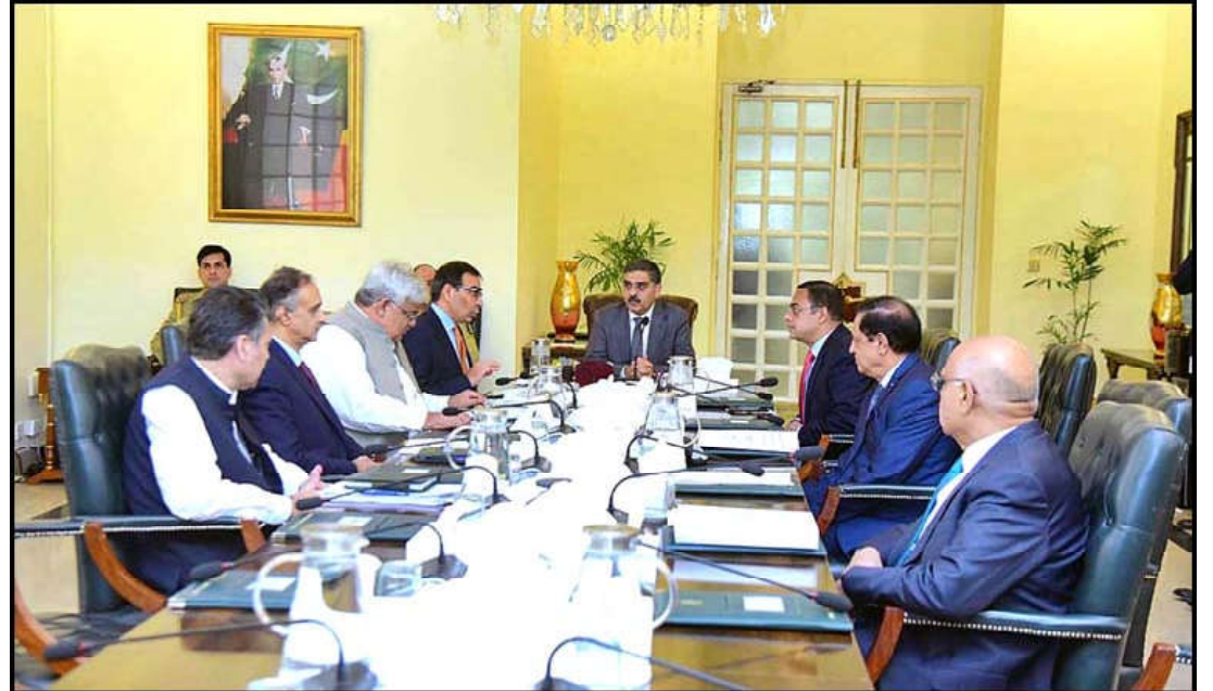
ISLAMABAD: Caretaker Prime Minister Anwaar-ul-Haq Kakar chairs a meeting on Petroleum.