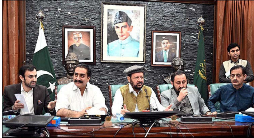
GILGIT: Chief Minister Gilgit-Baltistan Haji Gulbar Khan Addressing a press conference.

country have all the features, adding that investment and proper promotion can make Pakistan the centre of tourism. Punjab Governor emphasized that the expertise of ASEAN countries should be utilized for the development of Pakistan's tourism sector and with their support and guidance, better policies should be formulated to improve basic infrastructure and attract foreign tourists. He further said that new avenues of trade and economic cooperation can be explored within the ASEAN region. He said our presence here today reflects the importance we attach to fostering robust relationship and creating synergies that can pave the way for mutual growth and prosperity.