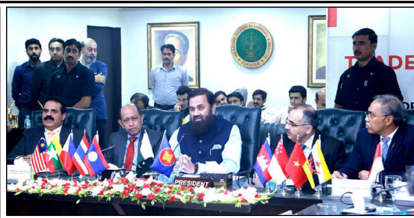
LAHORE: Governor Punjab Muhammad Balighur Rehman addressing the Trade and Tourism Conference on ASEAN at Lahore Chamber of Commerce and Industry.

The police officers said the Safe City cameras were providing full support in police operations and investigations. The plan is very important for guiding law-enforcement agencies. For that, the scope of the Safe Cities project would be extended to the whole of Punjab.