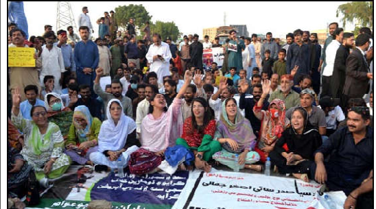
HYDERABAD: Civil society, different political and nationalist parties activists, advocates and people from different walks of life block bypass against kidnapping of Hindu businessmen and children in Kashmir.

The health minister emphasised the need for quality of medicines as per international standards in order to increase exports.