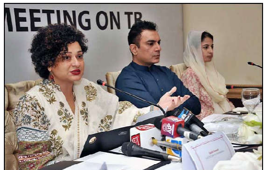
ISLAMABAD: End TB Celebrity Ambassador Sania Saeed and Sarmad Khoosat addressing a press conference about Mobilizing Leadership for the UN High Level Meeting on TB.