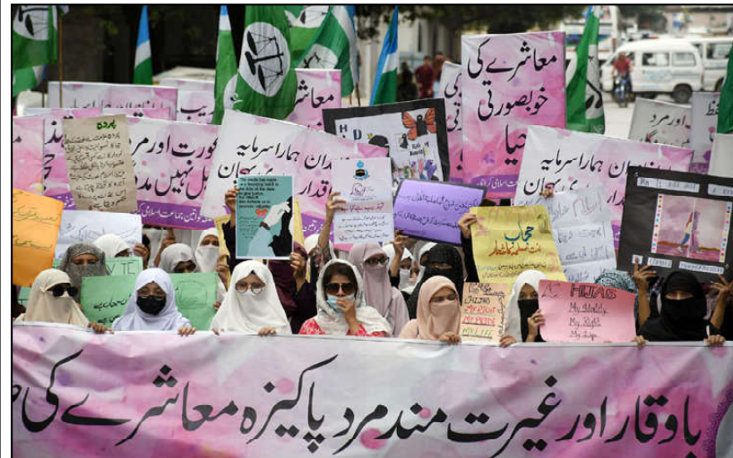
KARACHI: Women supporters of Jamaat-e-Islami participate in a rally to mark International Hijab Day in Provincial Capital.

FAISALABAD (APP): The Punjab Food Authority (PFA) seized a heavy quantity of 'Gutka' (betel quid) and imposed fine on shopkeepers over violation of the laws. A PFA spokesman said here on Monday that a team conducted checking of a grocery store and cold drinks corner near Novelty Bridge Dijkot Road and found 1,100 packets of prohibited 'Gutka' (Rattan and One2One). Both shopkeepers had stored the prohibited item at secret places of their shops. The PFA team imposed fine on the shopkeepers and warned that they would be sent behind bars.