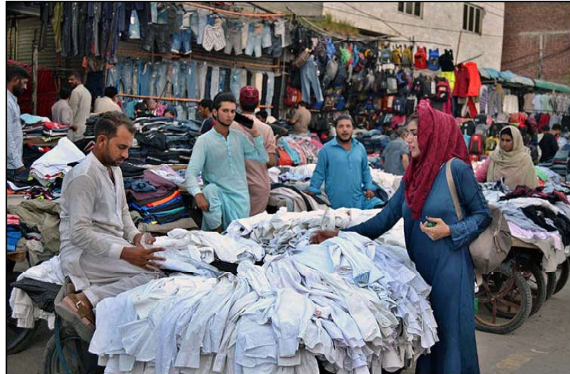
LAHORE: Woman selecting and purchasing old clothes at Landa Bazaar.

In order to reduce the budget deficit, action is taken against taxpayers instead of tax evaders.