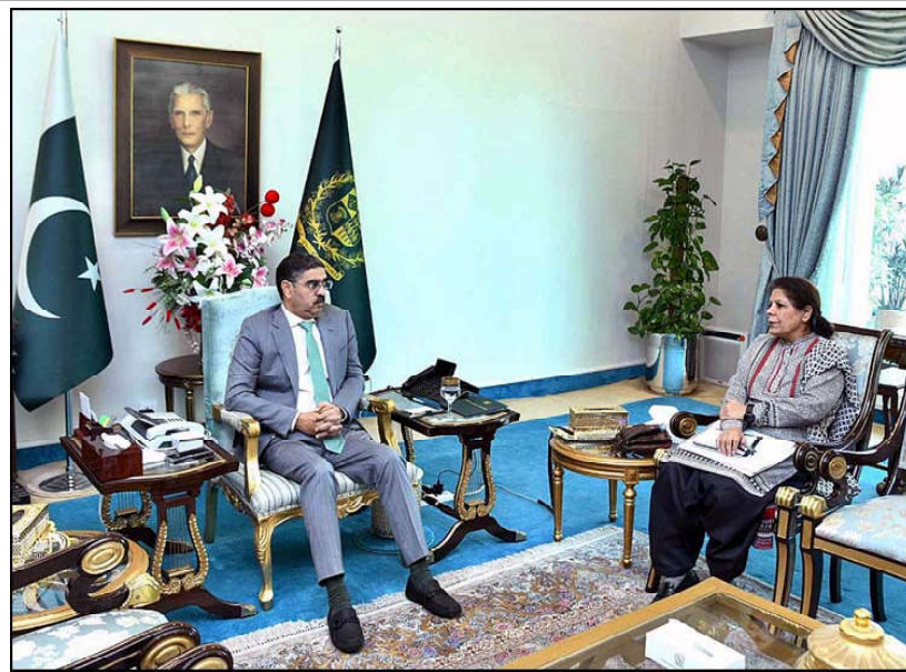
ISLAMABAD: Caretaker Minister for Finance Dr. Shamshad Akhtar called on caretaker Prime Minister Anwaar-ul-Haq Kakar.

The price of the Euro decreased by Rs1.48 to close at Rs330.04 against the last day's closing of Rs 331.52, according to the State Bank of Pakistan (SBP).