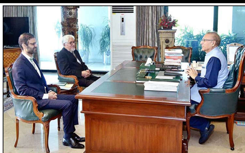
ISLAMABAD: Caretaker Federal Minister for Law and Justice, Ahmed Irfan Aslam called on President Dr. Arif Alvi at Aiwan-e-Sadr.

Expressing deep grief and sorrow over the death of the former judge, they said Pakistan has lost an expert jurist, thinker and patriot.