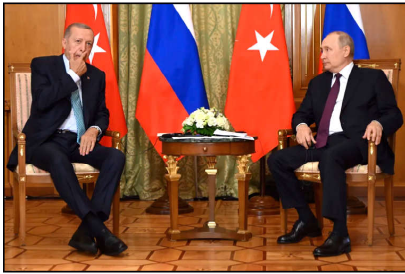
Russian President Vladimir Putin speaks to Turkish President Recep Tayyip Erdogan during their meeting at Russia's Black Sea resort of Sochi, Russia.

that aimed to avoid a food crisis in parts of Africa, the Middle East and Asia. The U.S. has also criticized Putin for leaving the deal. Secretary of State Anthony Blinken challenged countries at a UN Security Council meeting to tell Russia to stop using the Black Sea and Ukraine's grain as "blackmail," and to halt treating those who are hungry and vulnerable as leverage in its "unconscionable war." The meeting comes as Ukraine has launched a counteroffensive against Moscow's invasion. Ukraine President Volodymyr Zelensky announced Sunday that he would be replacing Defense Minister Oleksii Reznikov, saying the position requires "new approaches."