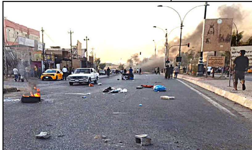
Protesters block a road following protests in the multi-ethnic Iraqi city of Kirkuk.