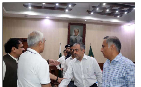
KARACHI: Caretaker Federal Minister for Communications, Railways and Maritime Affairs Shahid Ashraf Tarar visiting DS office in Karachi.

In addition to this, he noted the emergence of whitefly hotspots, mullay bugs, and pink bollworm, all of which require effective management strategies. To address these challenges, a technical session was convened to formulate recommendations for pest control and balanced nutrition. The recommendations include a focus on efficient water usage.