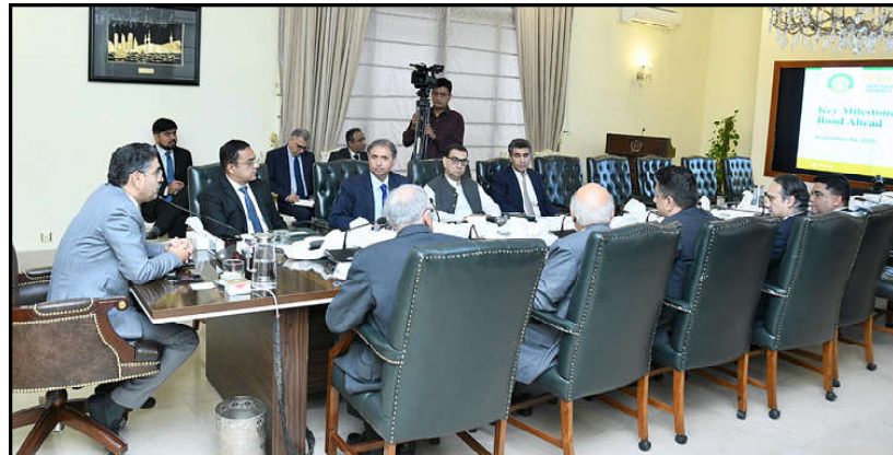
ISLAMABAD: Caretaker Prime Minister Anwaar-ul-Haq Kakar chairs a meeting on Public Private Partnership Authority.

"Not a single renewable energy project from Balochistan has been included in the latest edition of IGCEP. This means that no renewable energy project will be installed in Balochistan in the next ten years unless the makers of IGCEP change their policy focus and prioritize renewable energy over other sources of energy," he said.