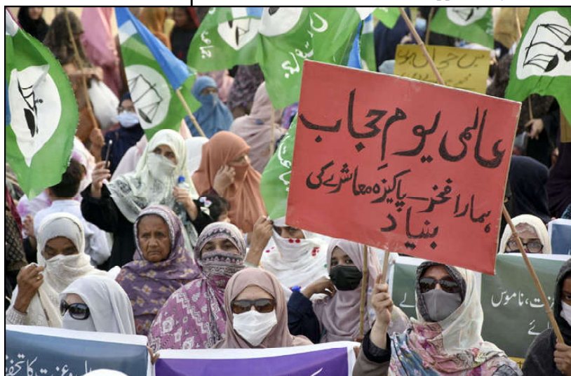
ISLAMABAD: Women activists from Jamaat-e-Islami take part in a pro-hijab rally on the eve of "International Hijab Day" outside National Press Club in Federal Capital.

They said Kashmiri leaders have been illegally arrested and imprisoned for demanding their rights and urged the international community to take notice of the plight of Kashmiri leaders and help in their immediate release. The Hurriyat leaders said the Indian troops have been committing atrocities on the innocent people in occupied Jammu and Kashmir for the past seven decades. It should be raised in the Security Council and the human tragedy happening in occupied Jammu and Kashmir should be stopped, they added.