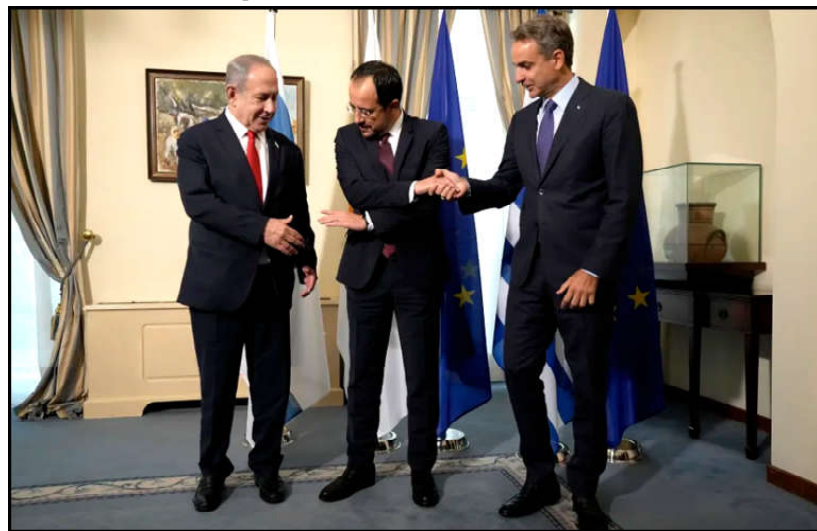
Cypriot President Nikos Christodoulides, center, Greek Prime Minister Kyriakos Mitsotakis, right, and Israeli Prime Minister Benjamin Netanyahu join hands, after their meeting at the presidential palace, in Nicosia, Cyprus.

Mitsotakis said Greece could act as a proving ground for Israeli AI technology in early detection of wildfires. "We are already talking to Israel about AI-based solutions that will offer us early detection capabilities," said Mitsotakis. Netanyahu said the three leaders discussed "going well beyond" dispatching firefighting aircraft and crews by deploying AI systems for early detection.