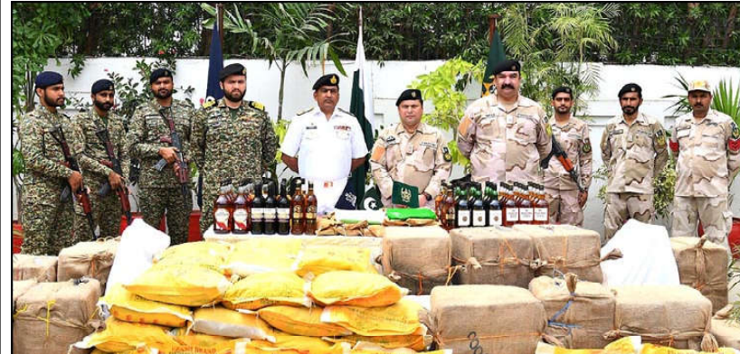
KARACHI: Pakistan Navy officials handing over the sized Narcotics to ANF officials.

Last month, Pakistan International Airlines (PIA) had passed an initial audit by the European Union Aviation Safety Agency (EASA), bringing the national flag carrier one step closer to resuming flights to the UK. The UK's Civil Aviation Authority (CAA).