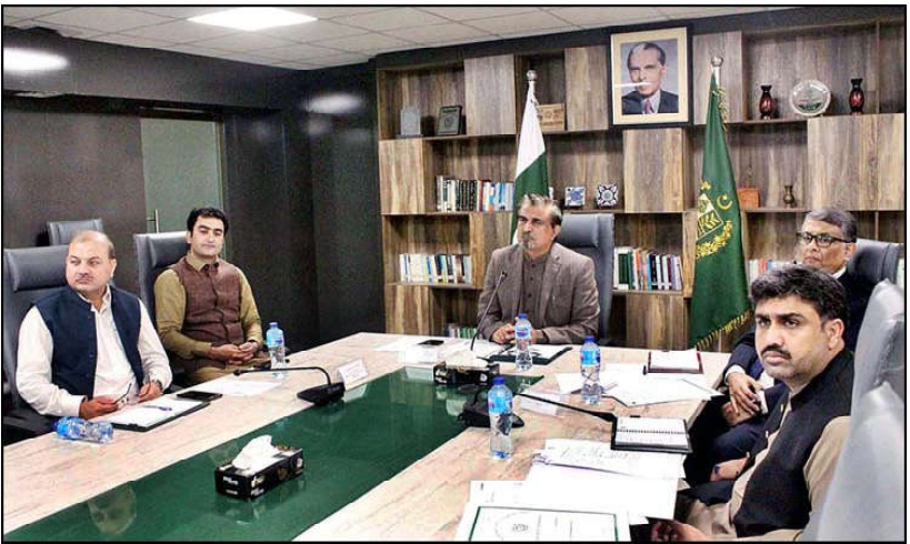
ISLAMABAD: Caretaker Federal Minister Jamal Shah chairing 59th meeting of Governing Body of Iqbal Academy Pakistan at National Heritage and Culture Division.

On the occasion, health official briefed the meeting that around 272 dengue cases had been reported in the district so far out of which 232 discharged after treatment while 40 confirmed patients were under treatment in public hospitals. He informed that indoor and outdoor surveillance was being carried out regularly while during indoor surveillance, the anti-dengue teams had checked around 4.6 million houses.