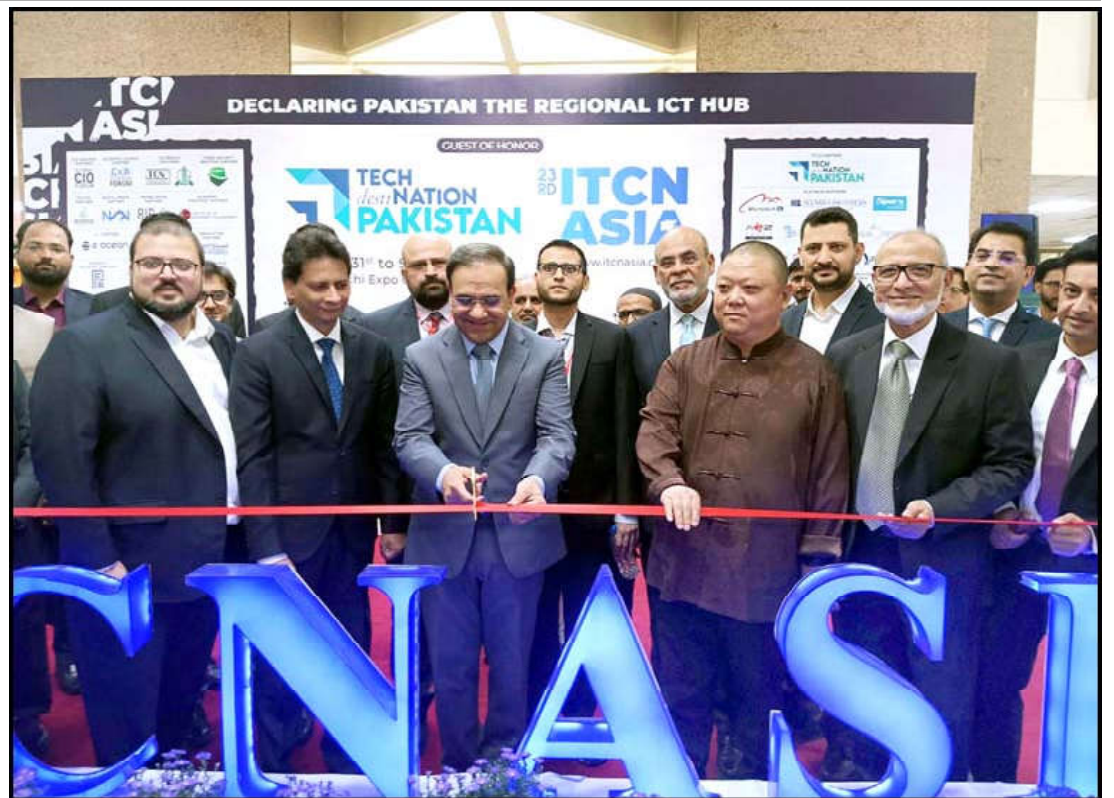
KARACHI: Caretaker Federal Minister for IT and Telecommunication Dr Umar Saif along with others cutting ribbon at the opening of "ITCN Asia 2023", International IT & Telecom Show at Expo Centre.

Dr Umar Saif said a special financing facility should be proposed for mobile phone manufacturers to enhance the production of mobile phone handsets with enhanced qualities.