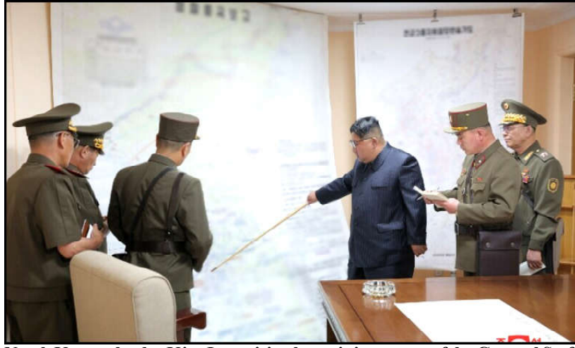
North Korean leader Kim Jong visits the training center of the General Staff Department of the Korean People's Army (KPA) in an undisclosed location in North Korea in this picture released by North Korea's Korean Central News Agency (KCNA).

quires the supply of weapons to the self-governing democracy for its defense. Successive US administrations have done so through sales rather than direct aid to Taiwan, with formal statements speaking in the tone of business transactions with the island's de-facto embassy in Washington. The State Department insisted that the first-ever aid under the programme did not imply any recognition of the sovereignty of Taiwan. "Consistent with the Taiwan Relations Act and our longstanding One China policy, which has not changed, the United States makes available to Taiwan defense articles and services necessary to enable it to maintain a sufficient self-defense capability," a State Department spokesperson said. "The United States has