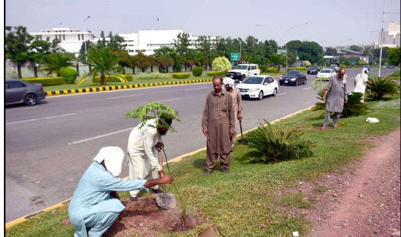
ISLAMABAD: Workers of Capital Development Authority are planting plant sapling on green belt along the Constitution Avenue in Federal Capital.

Furthermore, he said a number of interventions were being implemented to incentivize farmers for transition to climate-smart water and land management practices. "We are implementing a long-term agriculture growth strategy with a focus on productivity improvement, climate resilience, and physical expansion," he added. The minister emphasized investing in state-of-the-art early warning systems, gathering and utilizing data-driven insights to analyze climate patterns and potential disasters. He asked for strengthening disaster risk governance by establishing clear policies, institutional frameworks, and coordination mechanisms.