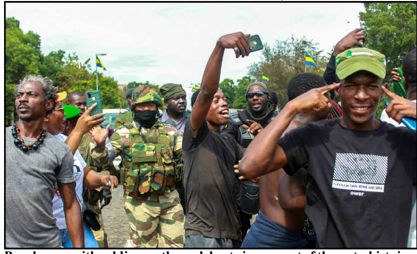
People pose with soldiers as they celebrate in support of the putschists in a street of Libreville, Gabon.

Monitoring Desk COPENHAGEN: Norway announced Thursday that it will close its embassy in Mali, saying the withdrawal of a U.N. peacekeeping force from the West African nation "will have consequences for the security of Norwegian and other diplomatic missions and international organizations." In June, Mali Foreign Minister Abdoulaye Diop demanded that U.N. peacekeepers who have been grappling with an Islamic insurgency.