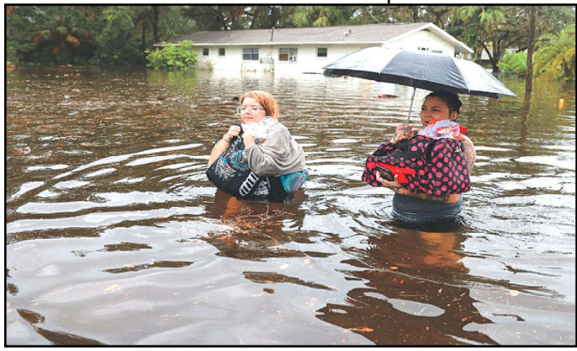
A girl and her mother waded through floodwaters after evacuating their home in Tarpon Springs, Florida, when Hurricane Idalia made landfall.

Monitoring Desk NEW DELHI: Chinese President Xi Jinping is likely to skip a summit of G20 leaders in India next week, sources familiar with the matter in India and China told Reuters. Two Indian officials, one diplomat based in China and one official working for the government of another G20 country said Premier Li Qiang is expected to represent Beijing at the Sept. 9-10 meeting in New Delhi. Spokespersons for the Indian and Chinese foreign ministries did not respond to requests for comment. Li is also likely to attend a summit of East and Southeast Asian leaders in Jakarta, Indonesia on Sept 5-7.