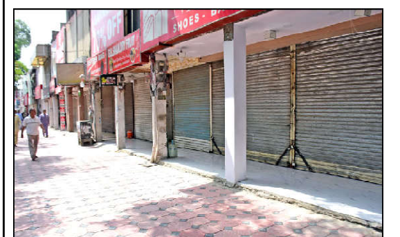
ISLAMABAD: A view of the closed shops at Aabpara Market during the protest by the Traders Action Committee of Aabpara Market against the unjust hike of the electricity and unbearable inflation.