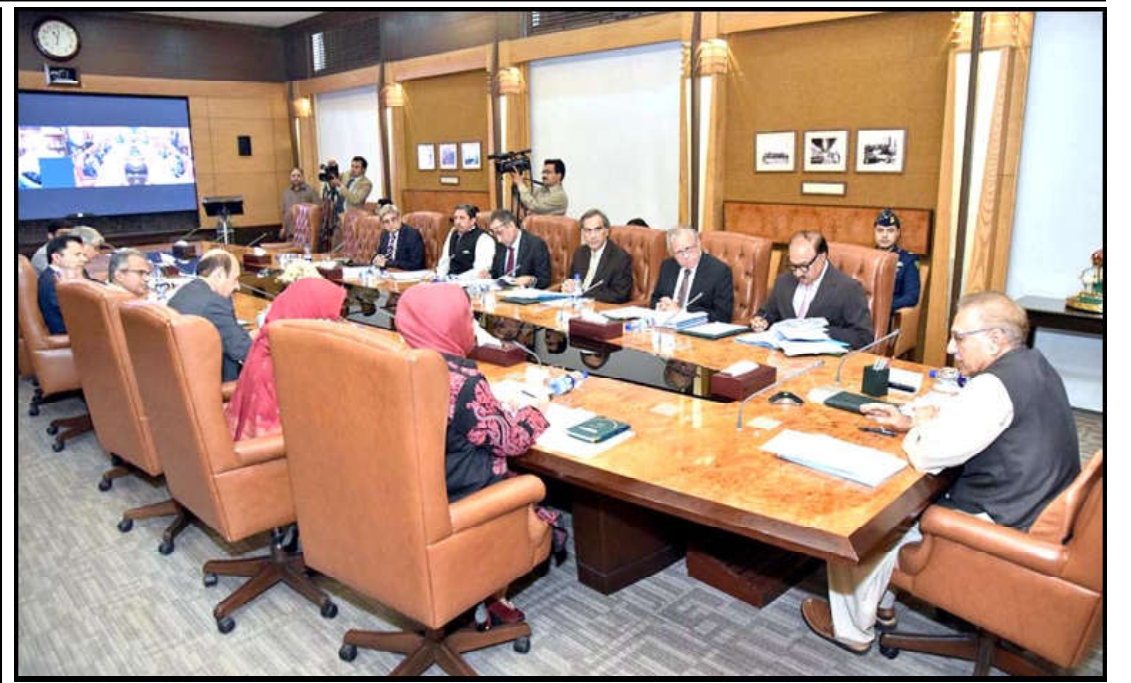
ISLAMABAD: President Dr Arif Alvi chairing the 23rd meeting of the Board of Governors of the National School of Public Policy, at Aiwan-e-Sadr.