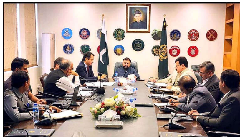
ISLAMABAD: Caretaker Federal Minister for Interior, Sarfraz Ahmad Bugti chairing meeting regarding anti smuggling measures.

Under the given situation, the Balochistan government urged all the stakeholders to give priority to welfare and safety of the affected persons instead of taking political advantage of the issue.