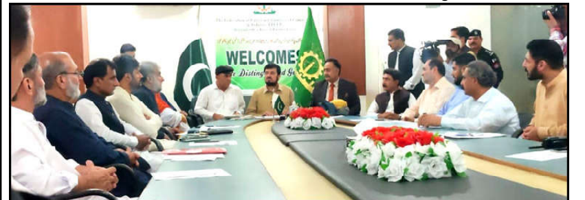
PESHAWAR: Governor Khyber Pakhtoonkhwa Haji Ghulam Ali addressing during his visit to FPCCI Regional Office.

The Ambassador also praised the Minister's efforts to enhance the country's trade prospects. The meeting also saw the Minister welcoming Ambassador Nawaf of Commerce, where a souvenir was presented as a gesture of goodwill.