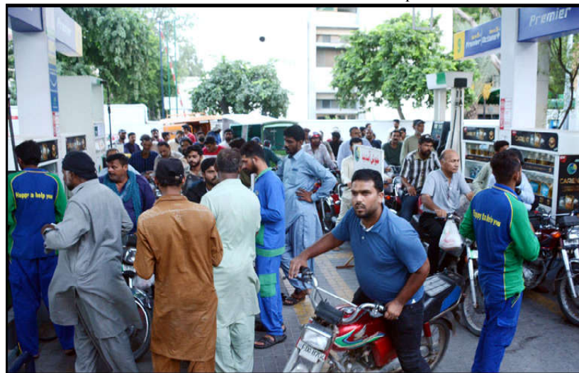
FAISALABAD: A view of the hustle of bikers at fuel station after the news of the price hike of petroleum products in City.