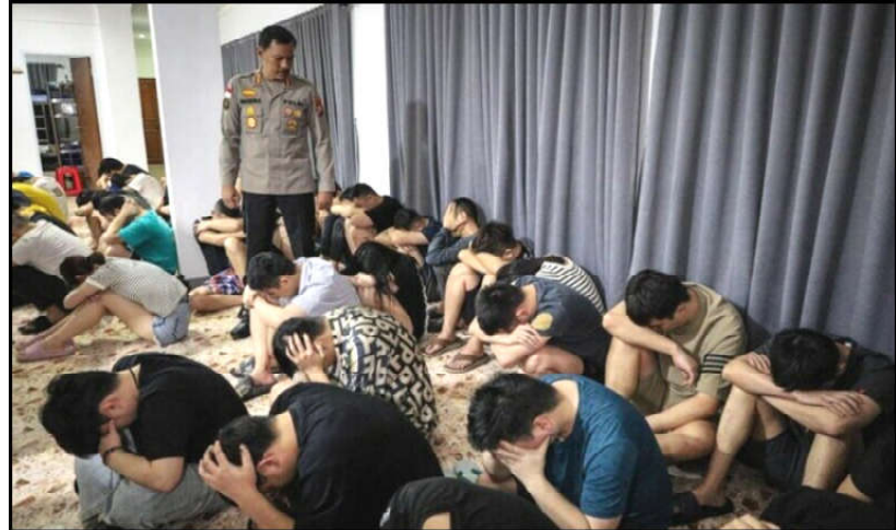
Group of Chinese nationals arrested on suspicion of running an online love scam syndicate that ensnared hundreds of victims in China, in Indonesia's Riau Islands province.

Monitoring Desk UNITED NATIONS: The United Nations Security Council voted on Thursday to extend a long-running peacekeeping mission in Lebanon for another year after a compromise was reached between France and the United States on language about the freedom of movement of U.N. troops. The U.N. Interim Force in Lebanon (UNIFIL) - established in 1978 - patrols Lebanon's southern border with Israel. The mandate for the operation is renewed annually, and its current authorization was due to expire on Thursday. The French-drafted text was adopted with 13 votes in favor and abstentions by Russia and China. A planned Wednesday vote was delayed as France, the United States and the United Arab Emirates argued over language on U.N. freedom of movement. France kept language in the resolution that spells out that peacekeepers should coordinate with the Lebanese government. But in a compromise with the U.S. and the UAE, France added back in text from last year's council resolution - which it had deleted - that demands all parties allow "announced and unannounced patrols" by U.N. troops. "The ability of the UNIFIL mission to carry out their responsibilities, independent of any restrictions, is essential," U.S. Ambassador to the United Nations, Linda Thomas-Greenfield, told the council. "And we've had longstanding concerns regarding the actions by some actors to obstruct the mission's freedom of movement," she said.