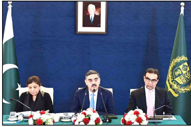
ISLAMABAD: Caretaker Prime Minister Anwaar-ul-Haq Kakar talking to Anchors and Journalists in a meeting at the Prime Minister's House.