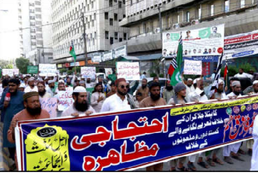
KARACHI: Members of Ahle-Sunnat Wal Jamaat are protest demonstration for acceptance of their demands, at Karachi press club.

KARACHI (INP): Karachi remains among the most polluted cities in the world on the Air Quality Index (AQI) on Thursday. Karachi was measured to have 175 reading of particulate matter on the air quality index. The weather in the city will remain hot and dry and the maximum temperature will be bracketed between 34 to 37 degree Celsius. It is to be mentioned here that AQI as high as 151-200 is considered unhealthy, while an AQI reading between 201 to 300 is more harmful and AQI rate over 300 mark is extremely hazardous. According to experts, the air becomes heavier in the winter as compared to summer, causing poisonous particles in the atmosphere to move downwards.