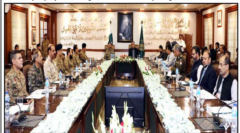
LAHORE: Chief of Army Staff General Syed Asim Munir attending Punjab Apex Committee. Caretaker Chief Minister Mohsin Raza Naqvi is also present.

He said the psyche of India was changing as it had been influenced by the extremist Hindutva ideology which aimed to marginalize minorities, particularly the Muslims. He mentioned that Pakistan was committed to safeguarding the rights of its minorities, and took prompt action if any injustice was done to them. The president highlighted that India was trying