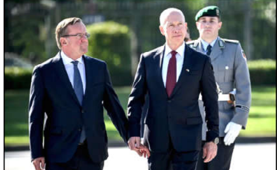
German Federal Minister of Defense Boris Pistorius receives his Israeli counterpart Yoav Gallant with military honors in Berlin, Germany.

accident, 138 sustained minor injuries and a further 24 were still in hospital in a more serious condition, the health ministry said. Videos circulating on social media showed a column of flames and smoke rising into the night sky. The blast blew out the windows of several houses in the surrounding area and damaged their interiors. Explosions continued to ring out in the hours after the blaze broke out as emergency crews tackled the fire and ambulance staff worked to evacuate those injured, an AFP journalist at the scene witnessed.