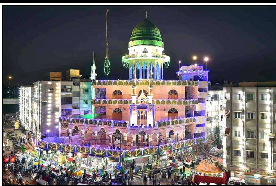
KARACHI: An illuminated view of Kanzul Eman Masjid decorated with colorful lights in connection with Eid Milad-un-Nabi (PBUH) celebrations.

the rights given to the non-muslims and the agreements with the followers of other religions should be kept in mind by all Pakistanis. Meanwhile Caretaker Prime Minister Anwaar-ul-Haq Kakar urged the nation to obey the Holy Prophet (PBUH)'s teachings of brotherhood and compassion besides following his message of unity to become an example of tolerance and coexistence. The prime minister, in his message to the nation on Eid Milad-un-Nabi (PBUH) 1445 Hijri, extended his greetings to the whole of the Pakistani nation as well as the Muslim world.