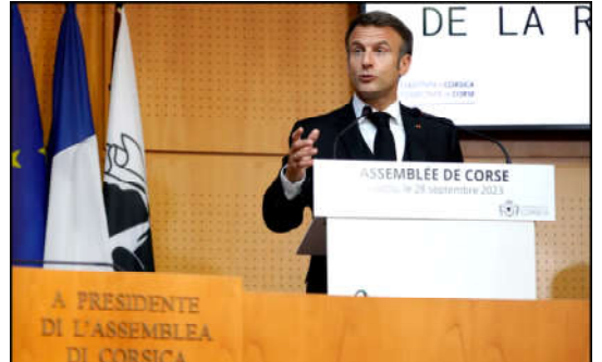
French President Emmanuel Macron addresses the Corsican Assembly in Ajaccio, as part of a three days visit in the southern French island of Corsica.

buildings overnight, when no one is inside. Macron didn't go into great detail about what powers might be transferred from Paris to a more autonomous Corsica. He said that he favors changing the French Constitution to recognize "the specificities" of Corsica's island community. A constitutional change would require French parliamentary approval. "This is how we will turn a page that was marked by somber hours and be able to open another."