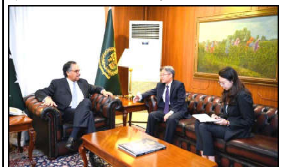
ISLAMABAD: Newly-appointed Chinese Ambassador Jiang Zaidong meeting with Caretaker Foreign Minister Jalil Abbas Jilani.

He said that the district officers of the Solid Waste Management Board should conduct a self-inspection of all the places in their territorial limits and wherever there is a lack of sanitation, it should be improved immediately. He said that the accumulation of waste at garbage collection points also causes health and sanitation problems in the surrounding area.