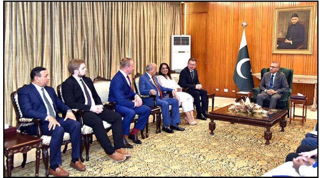
ISLAMABAD: President Dr. Arif Alvi in a meeting with a delegation of the members of the British Parliament and the representatives of the Pakistani and Kashmiri diaspora in the UK, at Aiwan-e-Sadr.

Isa has remarked why are so afraid of speaking the truth. Write it the order for review petition has come from where. Saying this is not correct, new government or old government. Government remains party is what. Court's time was wasted. The country was kept worried. Now you all are saying the petitions have to be withdrawn. We were sitting perhaps we have committed some mistake in the decision.