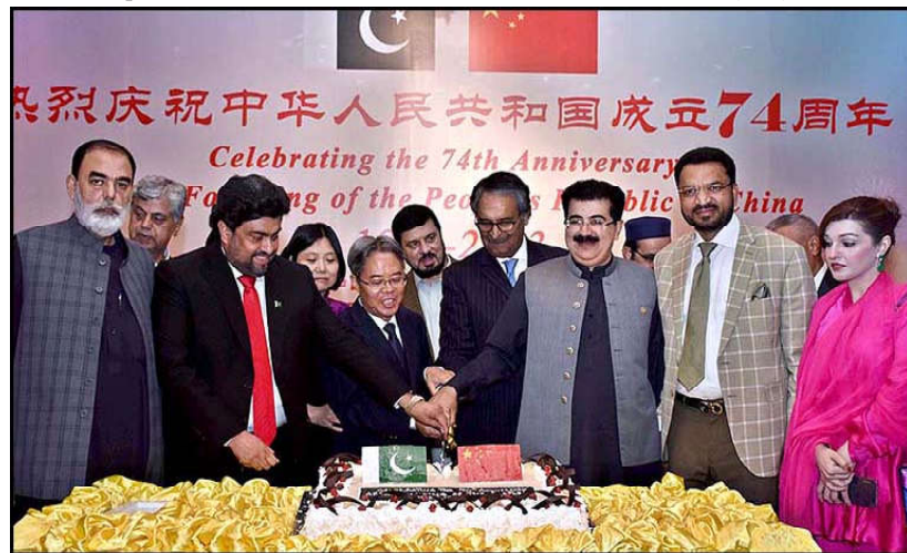
ISLAMABAD: Chairman Senate Sadiq Sanjrani and Ambassador of the People's Republic of China Jiang Zaidong are cutting cake along with other officials on the occasion of the 74th Anniversary of the Founding of the People's Republic of China.