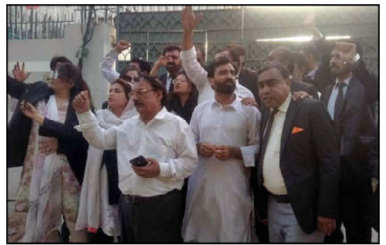
KARACHI: Members of Insaf Lawyers Forum are holding protest demonstration against high handedness of police department, held at Insaf House in Karachi.