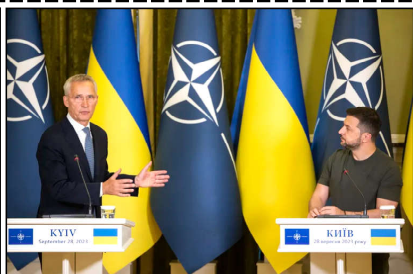
NATO Secretary General Jens Stoltenberg and Ukrainian President Volodymyr Zelenskyy attend their press conference in Kyiv, Ukraine.

Stoltenberg said that NATO has contracts for 2.4 billion euros ($2.5 billion) in ammunition for Ukraine, including 155 mm Howitzer shells, anti-tank guided missiles and tank ammunition. "The stronger Ukraine becomes, the closer we become to ending Russia's aggression," Stoltenberg said. "Russia could lay down arms and end its war today. Ukraine doesn't have that option. Ukraine's surrender would not mean peace. It would mean brutal Russian occupation. Peace at any price would be no peace at all."