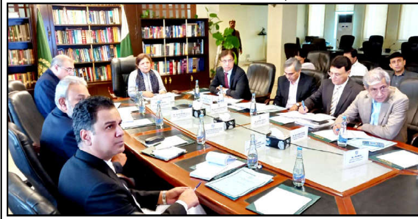
The Federal Minister of Finance, Revenue and Economic Affairs Division Dr. Shamsad Akhtar held a meeting with the Provincial Finance Minister at the Finance Division.

MADINAH MUNAWWARAH (APP): Caretaker Prime Minister Anwar-ul-Haq Kakar arrived here on Wednesday on his private visit to Saudi Arabia. Upon arrival, he was warmly received by Governor Madinah Faisal Bin Salman along with other senior officials of the Pakistani Embassy and Jeddah Consulate General at the Madinah Airport. The prime minister will leave for Makkah Mukarna today to perform Umrah.