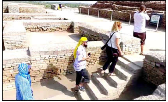
MOHENJO DARO: A delegation of Czech Republic tourists are visiting and expressed keen interest in the historical ruins of the World Heritage Monuments of Mohenjo Daro.

"The proposal remains on the table," Ambassador Akram said, adding that Pakistan's security policy continues to be defined by restraint and responsibility and avoidance of a mutually debilitating arms race in the region.