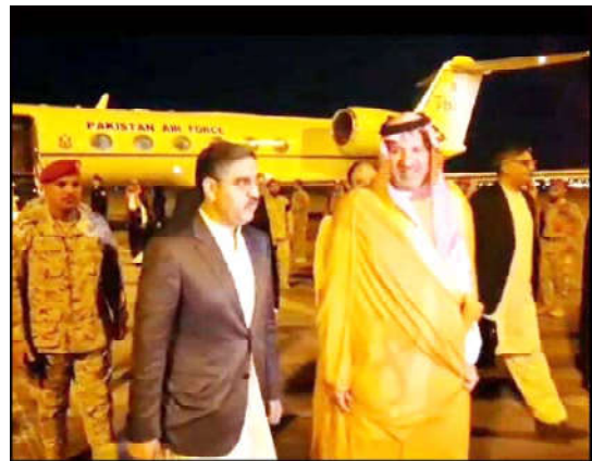
PM Kakar arrives in Madinah Munawwarah

The voter quota for the Punjab Assembly will be 429,929, 428,431 for the Sindh Assembly, 355,270 for the KP Assembly and 292,047 for the Balochistan Assembly.