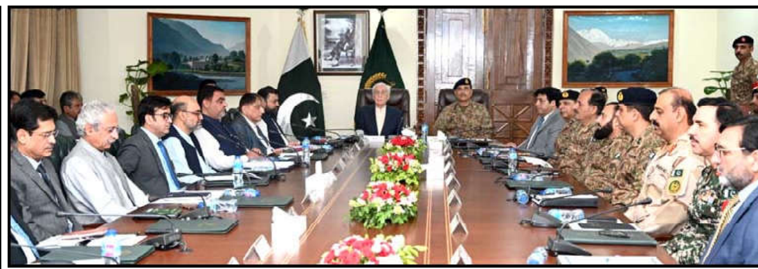
PESHAWAR: Army Chief General Syed Asim Munir presiding over meeting of Provincial Apex Committee.

The rescue personnel shifted the bodies and injured people to the hospital as soon as the incident was reported, said the law enforcement agency, adding that an investigation into the matter has been started.