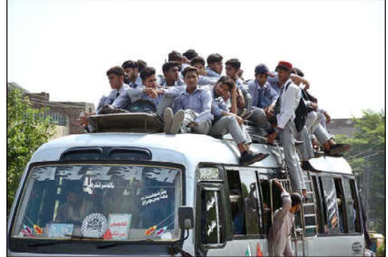
FAISALABAD: Students are engaging in risky behavior by traveling on the rooftop of a passenger bus at Millat Road, which may cause any mishap and needs the attention of concerned authorities.

The caretaker chief minister added that the natural beauty and cultural heritage of the province need to be effectively utilized for tourism. He said that Pakistan and especially Khyber Pakhtunkhwa, has immense opportunities for tourism.