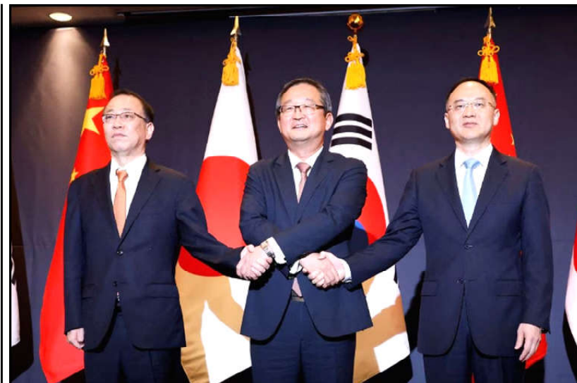
South Korea's deputy foreign minister for political affairs, Chung Byung-won, Japan's Senior Deputy Minister for Foreign Affairs, Funakoshi Takehiro, and China's Assistant Foreign Minister, Nong Rong, pose for photographs during their meeting in Seoul, South Korea.

With tensions over Taiwan, the South China Sea, and over U.S. export controls that target the Chinese military and advanced tech sector, Xi's rule has been marked by a focus on national security risks within the party, government, and large industries.