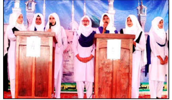
LARKANA: Girl students of Government Begum Nusrat Bhutto Girls Degree College Larkana are reciting Naat during Mehfil e Eid-e-Milad-un-Nabi (PBUH) in connection of 12th Rabi-ul-Awwal Eid Milad-un-Nabi, the birthday anniversary celebration of Holy Prophet Muhammad (PBUH) coming ahead, held at school premises in Larkana.

Replying a question, he said Indian government had proven themselves unwilling to protect minority religious communities and other vulnerable groups from frequent attack, adding, the Narendra Modi regime was promoting the Hindutva ideology to harassed Muslims and other minorities.