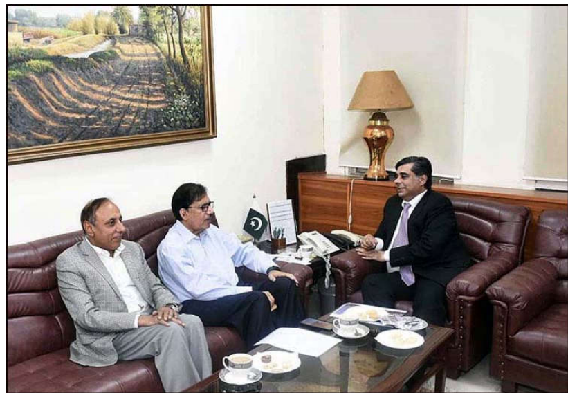
ISLAMABAD: CEO National Steel along with delegation from the steel industry called on Federal Minister for Commerce, Industries, Production, Dr. Gohar Ejaz at the Commerce Ministry.