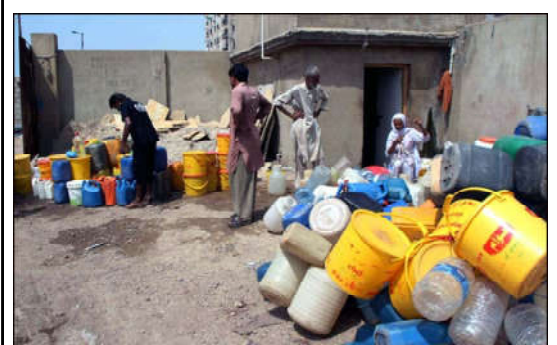
KARACHI: People are filling their water cans from public tap as they facing shortage of drinking water in their area, at Lyari area in Karachi.

Their performance not only rekindled the faith of those in attendance but also received wholehearted applause from the captivated audience.