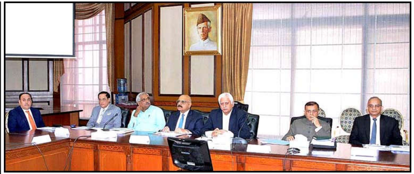
ISLAMABAD: 2nd Session of 5th Executive Committee Meeting of SIFC.