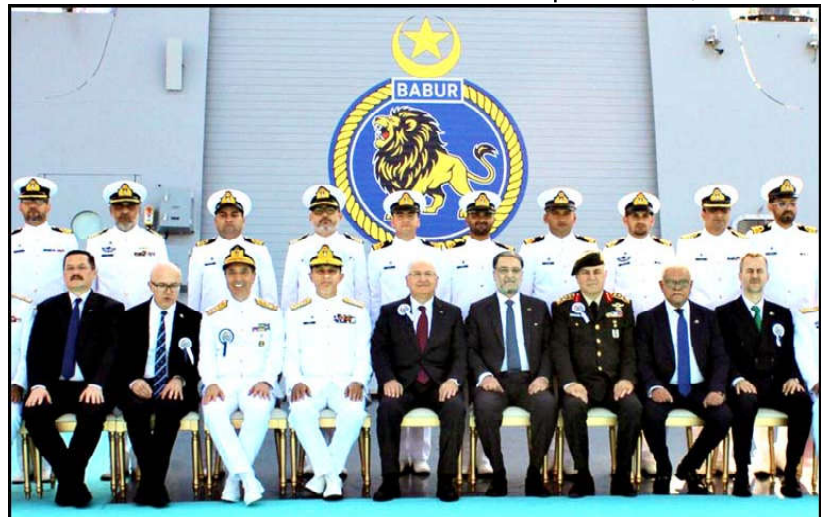
Minister of National Defence Turkiye, Defence Minister of Pakistan Lt. Gen Amjad Khan Niazi in a group photo along with commissioning crew onboard newly commissioned PNS BABUR

ISLAMABAD (INP): Pakistan's decision to recognise Israel will be determined by its national interests and those of Palestinians, according to Caretaker Foreign Minister Jalil Abbas Jilani, who also said he didn't meet his Israeli counterpart on the sidelines of UN General Assembly session in New York. Jilani was responding to claims by the Israeli Foreign Minister that 6 or 7 Muslim countries would make peace with the Jewish State if Saudi Arabia-Israel deal goes through. Foreign Minister Eli Cohen told Israel's KAN News on Friday that up to seven more Muslim countries could make peace with Israel if the Jewish State signs a peace agreement with Saudi Arabia. Speaking to the outlet immediately following Prime Minister Benjamin Netanyahu's speech at the United Nations General Assembly.