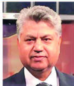
Murtaza Solangi Caretaker Minister of Information & Broadcasting

I deeply appreciate the remarkable initiative of the All Pakistan Newspaper Society to celebrate 25 September as the National Newspaper Readership Day.