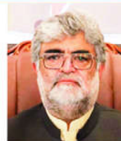
Mir Ali Mardan Khan Domki Caretaker Chief Minister Balochistan

I appreciate the initiative of the APNS, and I am confident that celebrating this day would encourage more and more people to opt for reading and have a shared understanding of issues of national importance.