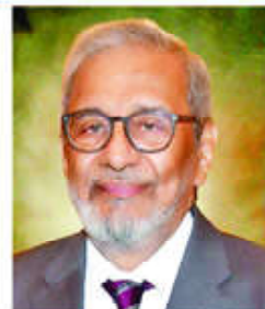
Justice (Retd.) Maqbool Baqar Caretaker Chief Minister Sindh

Newspapers are the most authentic source of accurate information, therefore newspapers were, are and will remain an important part of every society. The importance of newspapers for raising public awareness is unquestionable. Newspapers have played an unforgettable role in every society for the promotion of free democratic values. In Pakistan movement, newspapers played an important role in raising awareness of the importance of a separate homeland among the people. In developed societies, newspapers are still being printed and sold with full gusto. The habit of newspaper reading, has diminished in the digital age, but it cannot be eradicated by any means. Newspapers provide easy and affordable access to accurate and authentic information. Despite electronic and digital media, newspapers are still a great source of information for readers. By studying newspapers one gets awareness of various economic and social issues. The reader's access to the language and vocabulary is also widened by reading newspapers.