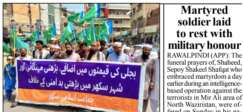
SUKKUR: Activists of Jamaat-e-Islami (JI) are holding protest demonstration against massive unemployment, increasing price of daily use products, inflation price hiking and the highly inflated electricity bills, at Ghanta Ghar Chowk in Sukkur.