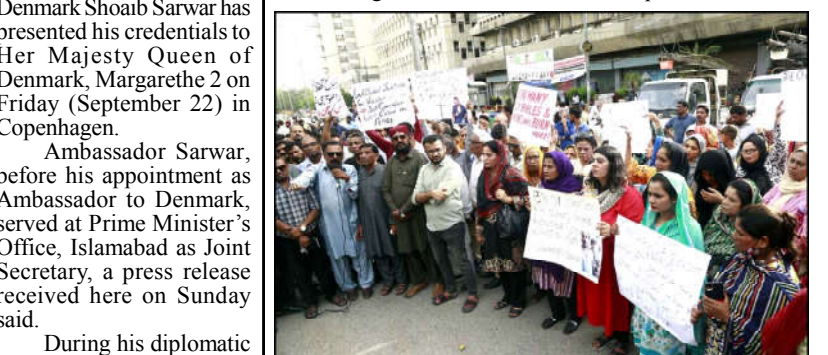
KARACHI: Members of Christian Community are holding protest demonstration for acceptance of their demands, at Karachi press club.