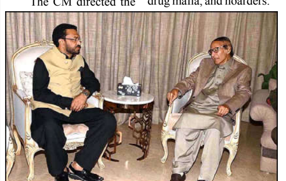
LAHORE: Mr. Khalil George, Federal Minister for Human Rights meets with Ch Shujaat Hussain at his residence in Gulberg.