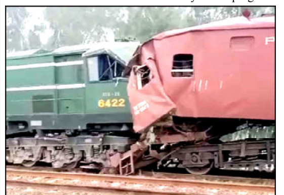
SHEIKHPURA: A view collision between Mianwali Express with goods train near Killa Sattar Shah railway station.