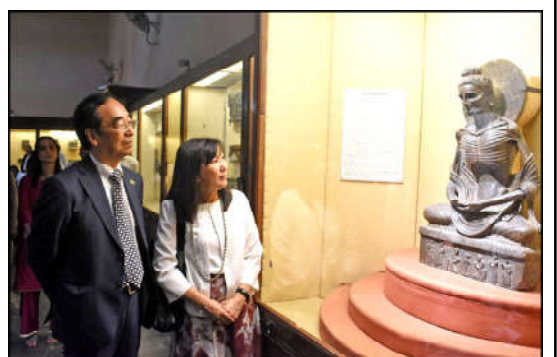
LAHORE: Ambassador of Japan to Pakistan Mitsuhiro Wada take keen interest in a sculpture during visiting at Lahore Museum, in Provincial Capital.

ISLAMABAD (Online): Pakistan continues to be one of the largest refugee hosting countries in the world due to which the number of Afghan nationals living in the country has reached 3.7 million. For more than 40 years, numerous illegal Afghan citizens have been trafficked in Pakistan. According to the data of the United Nations High Commissioner for Refugees up to June 2023, the total number of Afghan citizens living in Pakistan is 3.7 lakh, of which only 1.3 lakh 30 thousand are registered while 7 lakh 75 thousand are living without registration. Similarly, 68.8 percent of Afghans live in urban or semi-urban areas of Pakistan, while 31.2 percent live in 54 different areas. According to statistics up to June 2023, the total number of illegal Afghan citizens living in Pakistan is 4229,749, of which 71,358 (52.6 percent) are from Khyber Pakhtunkhwa, 3,21,677 (24.1 percent) from Balochistan, 1,91,53 (14.3 percent) in Punjab.