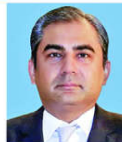
Mohsin Naqvi Caretaker Chief Minister of Punjab

On behalf of the Ministry of Information & Broadcasting, I appreciate the efforts of the APNS for observing the National Newspaper Readership Day in acquainting the nation with the significance of newspaper reading. There is no gaining saying that the newspapers are a source of reliable and authentic information in an era of massive proliferation of fake news and it is encouraging to see that the newspapers have upheld their authenticity, credibility, and reliability, despite the advent of digital media. Moreover, the newspapers also helped in effectively putting Pakistan's stance across the globe. Lastly, I reiterate the Government's resolve to promote freedom of expression and urge the print media fraternity to join hands with the Government to develop an educated and enlightened nation.