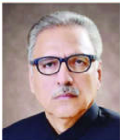
Dr. Arif Alvi President Islamic Republic of Pakistan

I extend my sincere congratulations to all newspaper readers and the All-Pakistan Newspapers Society (APNS) on the occasion of National Newspaper Readership Day. Reading newspapers has a greater educative value as they provide us knowledge and information about the social, economic, and political issues as well as sports, culture and entertainment. They educate the readers about the developments taking place in the national and international arena and broaden the mental horizon of the readers. Besides, newspapers play important role in shaping public opinion and influencing and guiding the decision-makers by providing their input and insight.