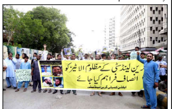
KARACHI: Members of Action Committee Land City are holding protest demonstration for acceptance of their demands, at Karachi press club.

NEW YORK (Online): With Pakistan's Independence Day around the corner, a road in New York City's Queens borough has been named after Allama Muhammad Iqbal, the country's national poet who visualized and then worked for a separate homeland for Muslims of the sub-continent. 'Allama Iqbal Avenue' was inaugurated at a well-attended ceremony in Richmond Hill section of Queens, amid loud slogans of 'Pakistan Zinda Bad' by people waving the national flag. The event marked the culmination of intensive lobbying efforts over a long period by the Pakistani-American community members, with the leading role played by the American-Pakistani Advocacy Group (APAG), a not-for-profit organization. Pakistan's Ambassa- dor to United States Masood Khan congratulated President American Pakistani Advocacy Group Ali Rashid for his leadership in having the avenue co-named as 'Allama Iqbal Avenue' in New York. He also paid tribute to Ali Rashid for his resolute efforts to build better relations between Pakistan and the United States and creating greater awareness about the history and culture of Pakistan in the United States. Speaking on the occasion, Speaker of the New York City Council Adrienne Adams said as we approach Pakistan Independence Day, he is honored to celebrate the co-naming of 109th Street and 101st Avenue as 'Allama Iqbal Avenue'. He said Allama Iqbal's work and vision led to the creation of Pakistan as an independent country.