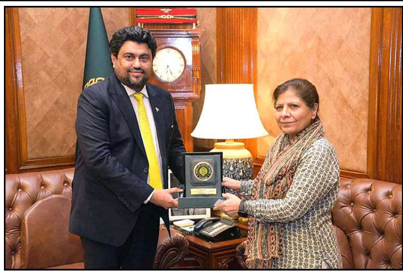
KARACHI: Sindh Governor Kamran Khan Tessori presenting the shield to the caretaker Federal Minister for Finance and Economic Affairs Shamshad Akhtar at the Governor House.