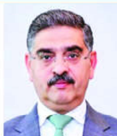
Anwaar-ul-Haq Kakar Caretaker Prime Minister

I extend my heartfelt congratulations to the All-Pakistan Newspapers Society (APNS) for their commitment to celebrating National Newspaper Readership Day. I am confident that this initiative will significantly contribute to nurturing the habit of reading among our people, empowering them with the knowledge and insight to make informed decisions for a better future.