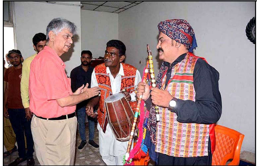
KARACHI: Caretaker Minister for Information and Broadcasting Murtaza Solangi talks to a folk artist after a ceremony held in his honor at Radio Pakistan Broadcasting House.