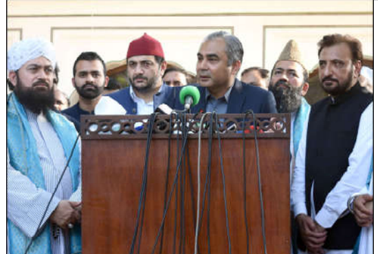
LAHORE: Governor Punjab Syed Mohsin Raza Naqvi talking with media persons at Sufi Saint Hazrat Mian Mir Shrine, during annual URS Sufi Saint Hazrat Mian Mir, in Provincial Capital.

However, people are still not returning to the markets." Earlier, the caretaker CM attended a ceremony held to mark the beginning of the 400 th Urs celebrations of the saint Hazrat Mian Mir, and laid a wreath at the shrine. He also laid a foundation stone for a 'langar khana' (free kitchen) to be established with the cooperation of the Medina Foundation.