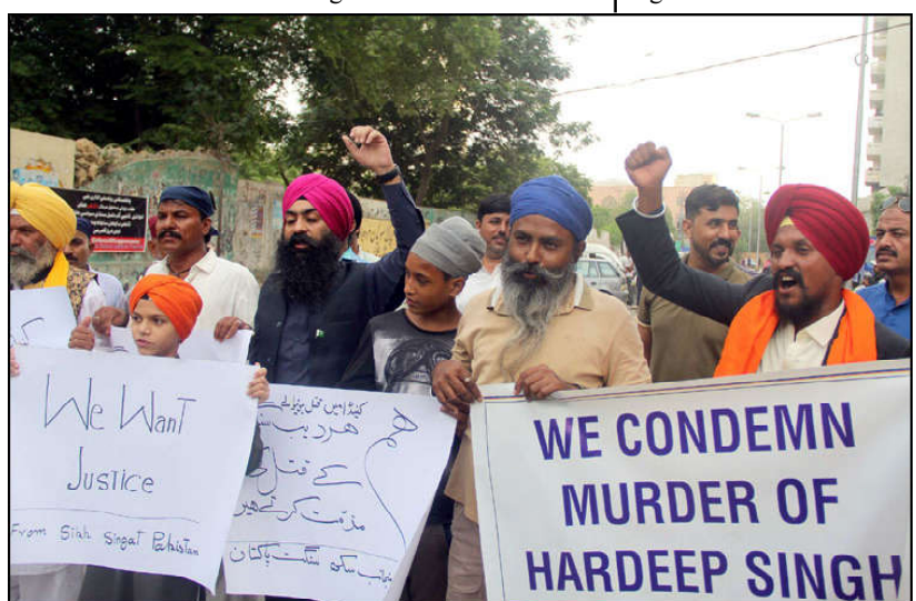
KARACHI: Members of Pakistan's Sikh community shout slogans during a protest outside press club, in Provincial Capital, to condemn the killing of a Sikh separatist Hardeep Singh Nijjar in Canada.

NEW YORK (INP): Pakistan and Gulf Cooperation Council have agreed to forge a comprehensive partnership with renewed focus on promotion of bilateral trade and business relations. The understanding was reached during a meeting between Caretaker Foreign Minister Jalil Abbas Jilani and the GCC Secretary-General Jaseem Mohamed Albudaiwi on the sidelines of 78 th session of the UN General Assembly in New York. The Foreign Minister expressed satisfaction on the progress made in the negotiations on Pakistan-GCC Free Trade Agreement and reiterated the need for its early conclusion. The Secretary General agreed to cooperate closely to conclude Pakistan-GCC Free Trade Agreement at the earliest. The Foreign Minister highlighted that Pakistan desires to strengthen institutional linkages with GCC and its member states, in line with the Joint Action Plan for Strategic Dialogue between the two sides. He underscored that Pakistan would be ready to host a GCC Foreign Ministers' Conference in Islamabad as proposed during the 1 st meeting of the Political Dialogue held in March this year. During the meeting, the regional and global issues of mutual interest also came under discussion. The Foreign Minister briefed the Secretary General on situation in Indian Illegally Occupied Jammu and Kashmir (IIOJK) and atrocities committed by Indian forces against innocent civilians.