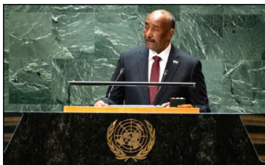
Abdel-Fattah Al-Burhan Abdelrahman Al-Burhan, President of the Transitional Sovereign Council of Sudan, addresses the 78th session of the United Nations General Assembly.

Monitoring Desk UNITED NATIONS: Iranian President Ebrahim Raisi has accused regional rival Saudi Arabia of betraying the Palestinians by seeking to normalise relations with Israel. "We believe that a relationship between regional countries and the Zionist regime would be a stab in the back of the Palestinian people and of the resistance of the Palestinians," he said. "The initiation of a relationship between the Zionist regime and any country in the region, if it is with the aim to bring security for the Zionist regime, will certainly not do so," Raisi told a news conference on Wednesday as he attended the UN General Assembly. Saudi Arabia and Israel have bonded in part over shared hostility to Iran's clerical state, although Riyadh has moved to ease tensions with Tehran through talks brokered by China. US President Joe Biden is hoping to transform the Middle East — and score an election-year diplomatic victory — by securing recognition of the Jewish state by Saudi Arabia. On Wednesday, Biden met Israeli Prime Minister Benjamin Netanyahu in New York on the sidelines of the UN General Assembly.