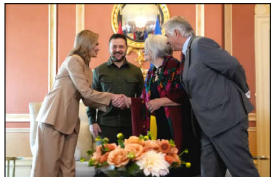
Ukrainian President Volodymyr Zelenskyy and his wife Olena Zelenska, left, meet with Governor General Mary Simon and her husband Whit Fraser in Ottawa.

Monitoring Desk SEOUL: North Korean leader Kim Jong Un ordered unspecified steps to further develop relations with Russia after his recent visit to the country as his foreign rivals warn that any cooperation on military weapons would be dangerous and bring consequences. Experts speculated North Korea and Russia likely discussed banned arms transfer deals and other cooperation measures during Kim's six-day trip last week. They say the two countries are serious about sharply boosting their ties while they are engaged in separate confrontations with the West. During a Politburo meeting on Wednesday, Kim arranged for work to be done on further developing bilateral ties at "a new high level at the practical stage" to consolidate "the success" of his Russia trip, the official Korean Central News Agency said Friday. Kim underscored the need to expand bilateral cooperation in every field, making a substantial contribution to the promotion of the well-being of the people of the two countries, KCNA said.