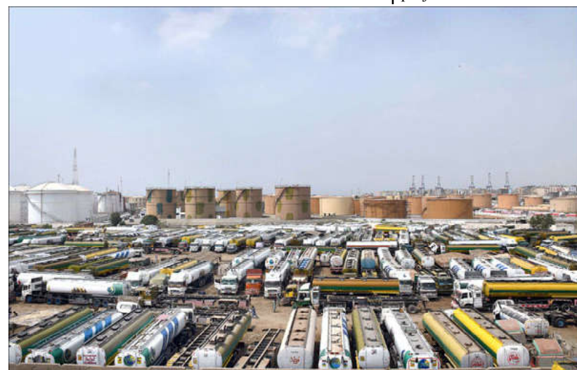
KARACHI: A large number of the Oil Tankers are parked at Shireen Jinnah Colony after the Call of Strike by Oil Tankers Association, till to acceptance of their demands.

GENEVA: Ukraine is filing a complaint at the World Trade Organization against Hungary, Poland and Slovakia after they banned grain and other food products coming from the war-torn country, Ukrainian Prime Minister Denys Shmyhal said Tuesday. It lays bare a widening rift with the three members of the European Union, which has been a pivotal backer of Kyiv as it works to fight off Russia's invasion. In a break with the wider EU, Poland, Hungary and Slovakia have announced bans on grain and other food from Ukraine, a major agricultural supplier to parts of the world where people are going hungry. The 27-nation bloc last week lifted restrictions on Ukraine's exports to five member states, also including Romania and Bulgaria. Farmers in eastern Europe have rallied against the imports from Ukraine, saying grain has gotten stuck inside their borders and driven down prices for local growers.