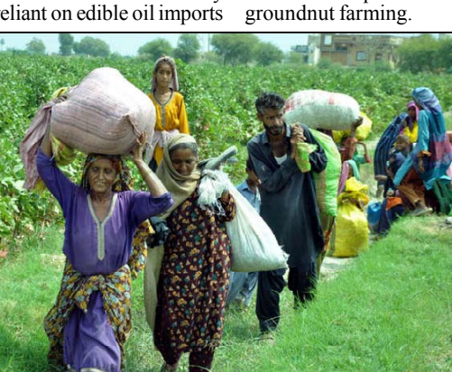
HYDERABAD: Women farmers are carrying cotton bags on their head moving towards their destination after farming, at Hatri Bypass in Hyderabad.

Speaking from a lush groundnut field sprawling over 25 acres in Chak No. 379/WB Duniyapur, Ateeq highlighted a path to economic prosperity that could help save an astounding Rs 350 billion annually incurred upon the import of edible oil. Traditionally, Pakistan has been heavily reliant on edible oil imports to meet its demand. However, Saqib pointed out an alternative solution that could not only make Pakistan self-sufficient but also reduce its dependence on costly imports. He emphasized the crucial role played by high-quality groundnut seeds in boosting production. During the visit, progressive farmer Asif Awan provided a comprehensive overview of various groundnut varieties. With optimism, Awan projected a remarkable production yield of 30 maunds per acre, a testament to the tremendous potential of groundnut farming.