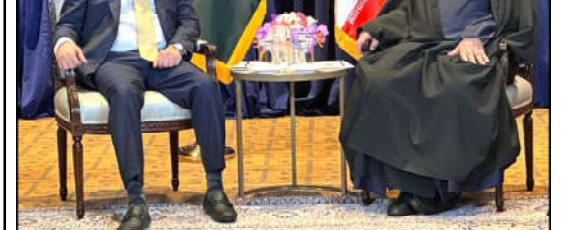
NEW YORK: Caretaker Prime Minister Anwaar-Haq Kakar in a meeting with the President of Iran Ebrahim Raisi.

"Scientific evidence clearly indicates that climate action should be effective and robust which is known as transparency in the jargon of climate science. In Paris Agreement, Enhanced Transparency Framework was conceived to clearly monitor GHG emissions and measures taken to cope with it and resources deployed for climate action," he added.