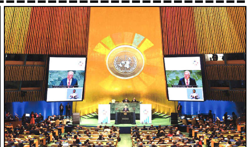
United Nations Secretary General Antonio Guterres delivers a statement during the opening of the Sustainable Development Goals Summit at UN headquarters in New York City.

Monitoring Desk UNITED NATIONS: The high-level debate of the 78th UN General Assembly begins in New York on Tuesday, with the schedule of speakers indicating that caretaker Prime Minister Anwarul Haq Kakar, who arrived here in New York on Monday, will deliver his speech on Friday. Coinciding with the start of the UNGA, the annual UN's Climate Action Summit will set the stage for countries to reverse backsliding on Paris climate agreement goals and to encourage governments to adopt serious new actions to combat climate change. According to the schedule for UNGA, the "General Debate" (as it is formally known) will kick off today (Tuesday) with an address from UN Secretary-General Antonio Guterres, followed by the address by UNGA President Dennis Francis, a diplomat from Trinidad and Tobago, who will preside from the General Assembly dais for the entire week. As per longstanding tradition, Brazil will deliver the first address from a na-