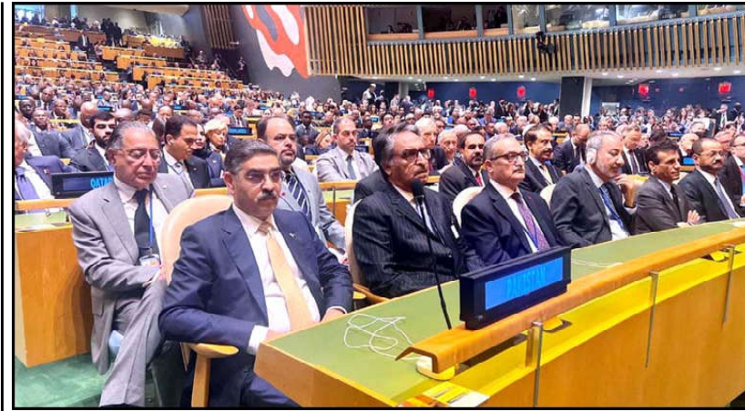
NEW YORK: Caretaker Prime Minister Anwaar-ul-Haq Kakar is attending the opening session of the General Debate of 78th UNGA session at the UN headquarters.

COAS remarked that "Junior Leaders are the backbone of Pakistan Army and are key to success in Conventional and Unconventional Warfare." On arrival at JLA and Brotha, COAS was received by Inspector General Training & Evaluation. Online adds: Opening Ceremony of Multi-National Special Forces Exercise "Eternal Brotherhood-II" was held at Barotha. Special Forces contingents from Pakistan, Kazakhstan, Qatar, Turkiye and Uzbekistan are participating in two weeks long exercise.