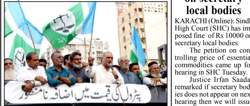
KARACHI: Leaders and supporters of Jamat-e-Islami (JI) are holding protest demonstration against massive unemployment, increasing price of daily use products, inflation price hiking and the highly inflated electricity bills, held at Shahrah-e-Faisal road in Karachi.