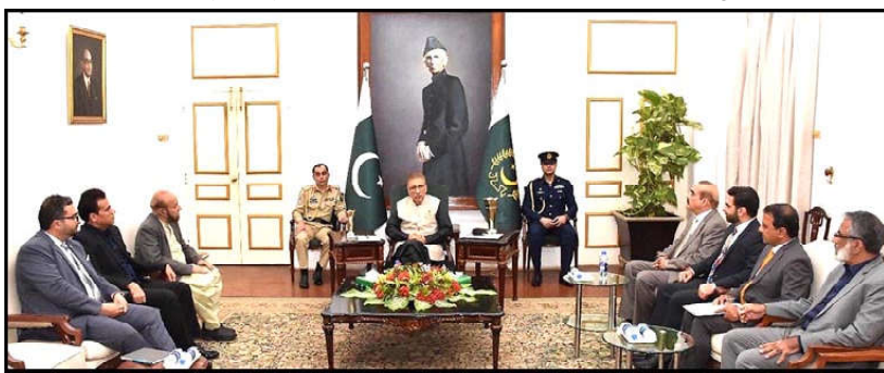
KARACHI: President Dr Arif Alvi in a meeting with delegation of KCCI at Governor House.

It was the responsibility of the state to protect the fundamental rights of every prisoner.