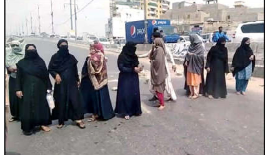
KARACHI: Residents of Mahmoudabad block road as they are holding protest demonstration against prolong electricity and sui-gas load shedding in their area, held at Baloch Colony road in Karachi.