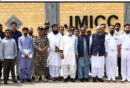
KARACHI: Group photo of Director JMICC with maritime stakeholders during brief at Joint Maritime Information Coordination Centre (JMICC).