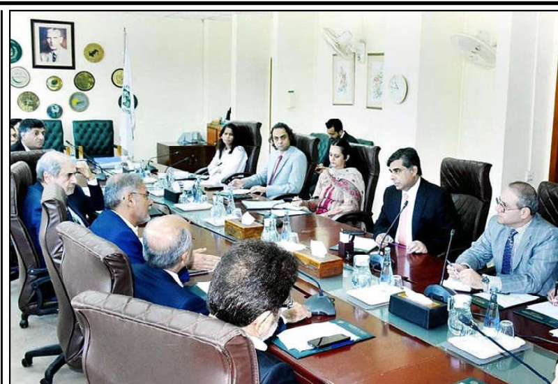
ISLAMABAD: Federal Minister for Commerce, Industries & Production, Dr. Gohar Ejaz chairing a meeting with representatives from the Pakistan Business Council (PBC) at the Ministry of Commerce.

Their remarks shed light on the impressive progress Malaysia achieved over the years, emphasizing the importance of strengthening economic and diplomatic ties between the two nations. Both leaders highlighted their shared commitment and cooperation on international issues.