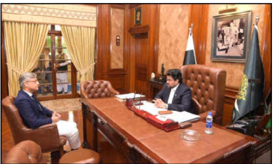
KARACHI: Caretaker Provincial Minister for Law Umar Somro meeting with Governor Sindh Kamran Khan Tessori.

A woman met him in the pharmacy and told him she was making trips to the hospital for insulin, but it was unavailable.