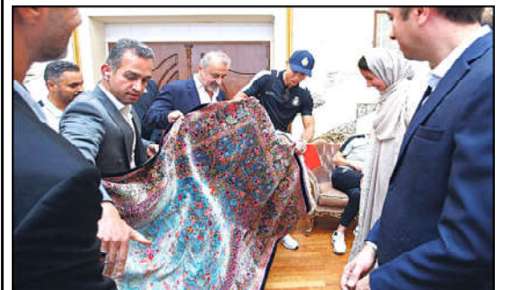
Saudi football club Al Nassr's Portuguese forward Cristiano Ronaldo (centre) being presented with a Persian rug as a gift upon arrival at Imam Khomeini International Airport, a day before a match against Iran's Persepolis club.

Monitoring Desk TAIPEI: Taiwan's defence ministry urged China on Monday to stop "destructive, unilateral action" after reporting a sharp rise in Chinese military activities near the island. The ministry said that since Sunday it had spotted 103 Chinese military aircraft over the sea, a number it called a "recent high". Its map of Chinese activities over the past 24 hours showed fighter jets crossing the median line of the strait which serves as an unofficial barrier between the two sides.