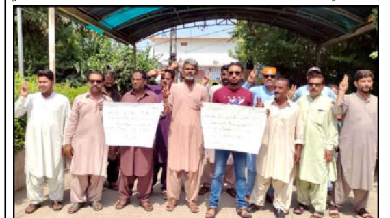
LARKANA: Employees of Shaheed Mohtarma Benazir Bhutto Medical University are holding protest demonstration for acceptance of their demands, at Larkana press club.