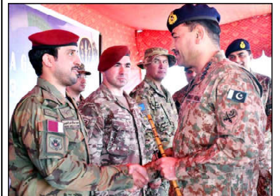
ATTOCK: Chief of Army Staff (COAS), General Syed Asim Munir interacts with participants during Opening Ceremony of Multi-National Special Forces Exercise "Eternal Brotherhood-II" at Barotha Garrison in Attock.

Noting that President Raisi's policy of 'Neighborhood First' was fully aligned with Pakistan's vision for regional development and connectivity, he emphasized the importance for both countries to leverage their unique geographical location to promote shared objectives of regional peace and prosperity, through greater trade and enhanced regional connectivity. Pakistan-Iran relations are characterized by regular high-level exchanges, commonality of views on important regional and global issues and strengthened cooperation in all areas of mutual interest.