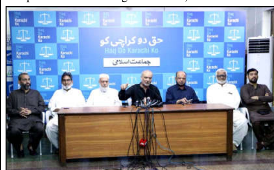
KARACHI: Jamat-e-Islami (JI) Karachi Chief, Hafiz Naeem-ur-Rehman addresses to media persons during press conference held at Idara-e-Noor-ul-Haq in Karachi.

ISLAMABAD (APP): Chairman Pakistan Peoples Party (PPP) Bilawal Bhutto Zardari has paid glowing tribute to Shaheed Mir Murtaza Bhutto on his 69 th birth anniversary. According to the press release issued by Media Cell Bilawal House on Sunday, he said in his message on the birth anniversary of Shaheed Mir Murtaza Bhutto, that Mir was a brave and bold personality. He said that the unique style of affable and mingling with people was the hallmark of Shaheed Mir Murtaza Bhutto, which Pakistanis continue to remember even today.