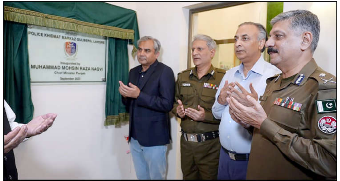
LAHORE: Caretaker Chief Minister Punjab Mohsin Naqvi offering Dua after inaugurating extension project of Police Helpline Centre at Liberty.