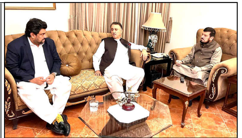
ISLAMABAD: Balochistan Governor Malik Abdul Wali Kakar and Sindh Governor Kamran Tessori participating in the dinner hosted by Khyber Pakhtunkhwa Governor Haji Ghulam Ali.

Islamabad. Barrister Sultan said that the violation of human rights by around one million Indian forces' personnel is on the rise in occupied Jammu and Kashmir. He maintained that the international community should play its role to stop the ongoing Indian state terrorism in the occupied territory. The AJK President said that Kashmiri immigrants living abroad should be the voice of oppressed Kashmiris and expose the Indian atrocities in the occupied territory.