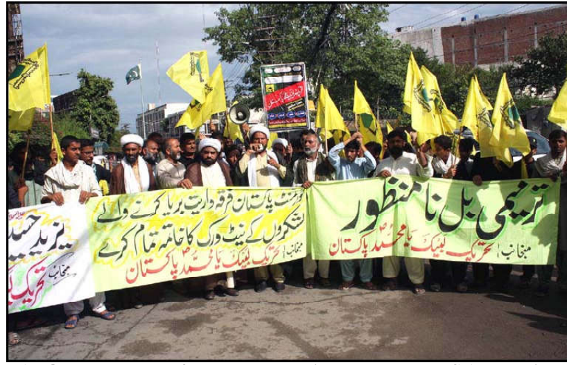
LAHORE: Members of Tehreek e Labbaik Ya Muhammad S.A.W Pakistan are holding protest demonstration against the Criminal Laws (Amendment) Bill 2023, held at Lahore press club.