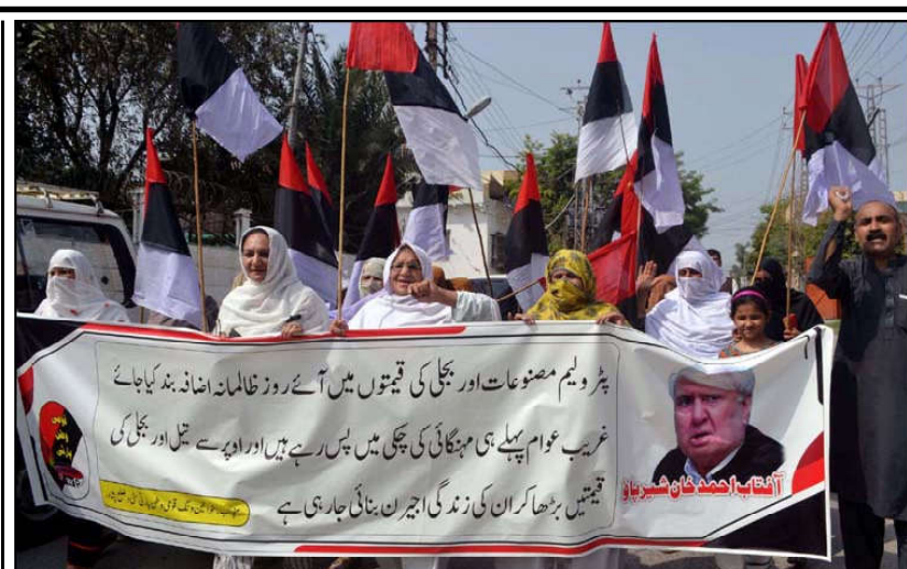
PESHAWAR: Members of Qaumi Watan Party (QWP Women Wing) are holding protest demonstration against massive unemployment, increasing price of daily use products, inflation price hiking and the highly inflated electricity bills, held at Peshawar press club

tenders upon their satisfactory report. According to a statement issued here on Sunday, he expressed these views while answering the questions of the business community during his visit to the Secretariat of the Hyderabad Chamber of Small Traders and Small Industries (HCSTSI). He said that the SITE was established in 1950 on 1264 acres with 497 industries where thousands of people were employed. He said that last week he visited SITE Hyderabad along with MD Site and met industrialists and investors and heard their problems, and during that visit, he personally witnessed the deteriorating situation of SITE Hyderabad. The SITE industrialists and investors stated the problems like