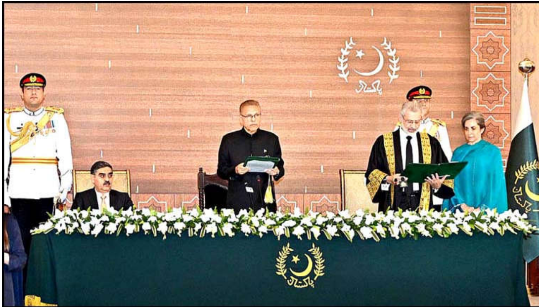
ISLAMABAD: President Dr. Arif Alvi administering the oath of office to Justice Qazi Faez Isa as Chief Justice of Pakistan, at Aiwan-e-Sadr.

Ph: 0300-3898091 Vol: 05. No. 262 Rabi-ul-Awwal 01, 1445 AH Monday September 18, 2023 Pages 04 Price Rs. 12.00