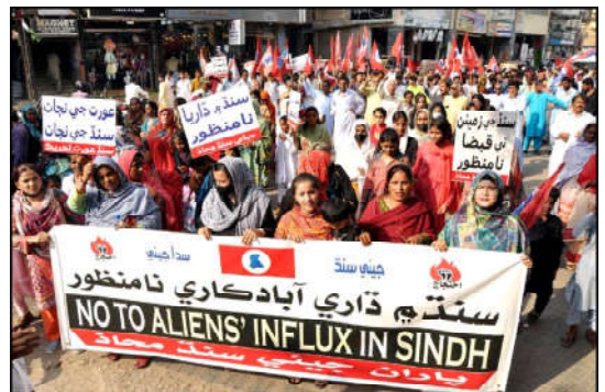
HYDERABAD: Members of Jeay Sindh Mahaz are holding protest demonstration for demanding expelling Afghan refugees from province, held in Hyderabad.