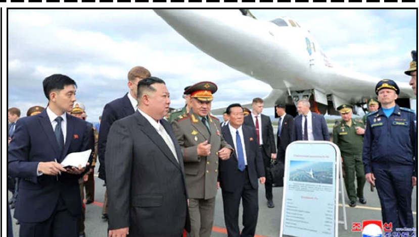
North Korea's leader Kim Jong Un walking with Russia's Defence Minister Sergei Shoigu as they look at aircraft during a visit to Knevichi airfield near Vladivostok, Primorsky region.

the Artyom-Primorsky-1 station. Kim bid adieu to a Russian delegation led by Natural Resources Minister Alexander Kozlov and waved from his train as it embarked on a journey covering approximately 250 kilometres towards the border. Both Russia and North Korea, historically aligned, are grappling with comprehensive global sanctions - Russia for its involvement in the Ukraine conflict and North Korea for its nuclear tests. Kim's visit, his maiden official foreign trip since the advent of the pandemic.