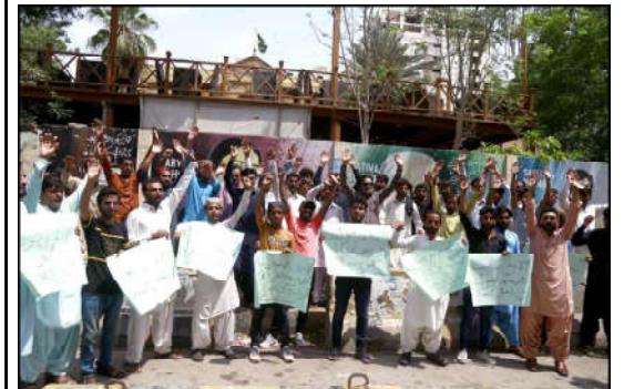
KARACHI: Members of Lund Welfare Association are holding protest demonstration for acceptance of their demands, held at Karachi press club.