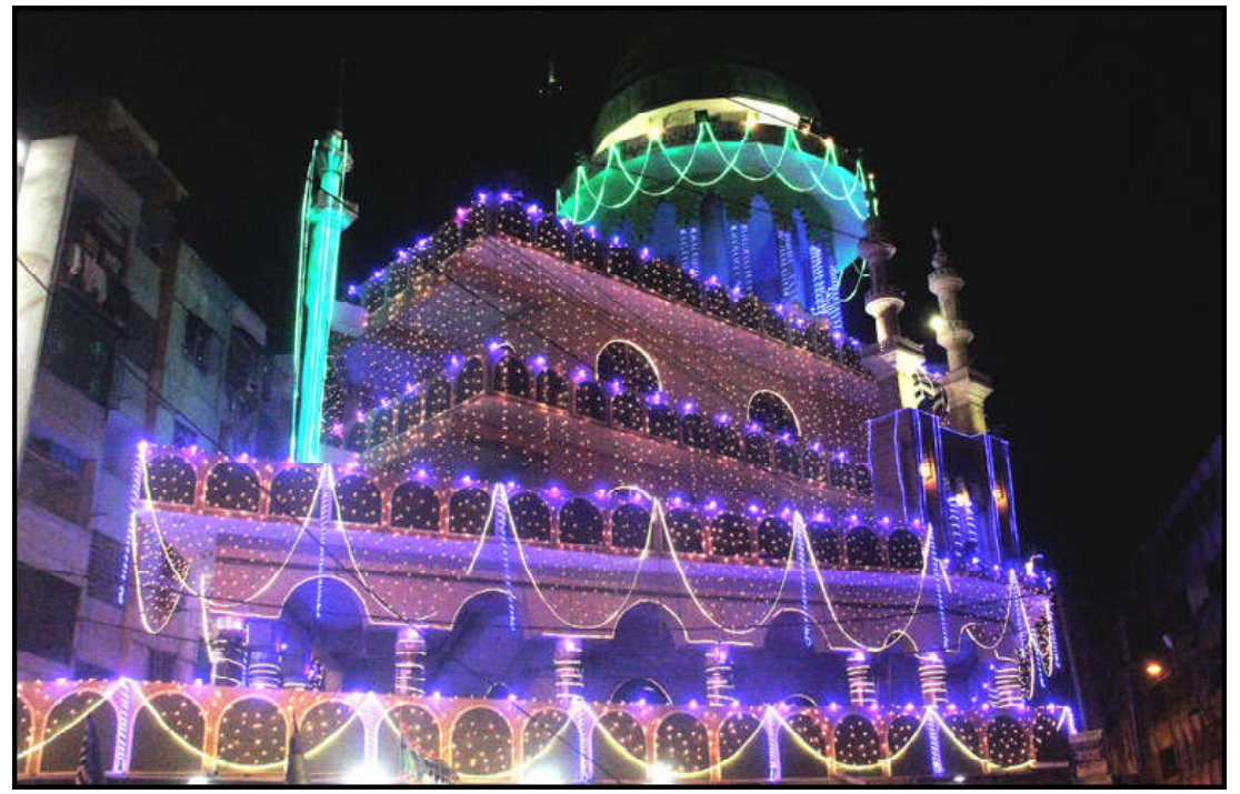
KARACHI: An illuminated view of Kanzul Eman Masjid decorated with colourful lights in connection with Eid-e-Milad-un-Nabi (PBUH) at Guru Mandir area as the nation starts preparation to celebrate in befitting manners.

also elaborate on the significant measures taken by his caretaker administration to consolidate the country's economic recovery and efforts to mobilize domestic and external investment. In addition, the prime minister will hold bilateral meetings with counterparts from various countries as well as with the heads of international organizations, philanthropic organizations and corporate leaders. He also has a number of media engagements. US President Joe Biden, as leader of the host country, will be the second speaker on Tuesday, the opening day of the annual gathering of world leaders who take the pulse of the planet and tackle global challenge. The list of speakers indicates the presence of 145 Heads of State and Government, 6 Vice Presidents, 4 Deputy Prime Ministers and 38 Ministers or Chiefs of Delegations—a total of 196. This year's theme is "restoring trust and reigniting global solidarity", but the credibility of the UN is currently being undermined by geopolitical conflicts, divisions and paralysis at the Security Council, as economic, humanitarian and climate-related crises continue.