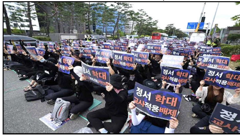
Thousands of South Korean teachers rallying for new laws to protect them from abusive parents.

"Our teams have been working from the outset to provide the necessary support. My sympathy and prayers go out to their families and friends." The Manaus Aerotaxi airline issued a statement confirming that there had been an accident and that it was investigating but offering no details about deaths or injuries. "We count on respect for the privacy of those involved at this difficult time and will be available to provide all necessary information and updates as the investigation progresses," the statement said.