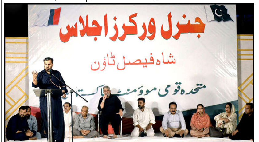
KARACHI: Senior Deputy Convener MQM-P Syed Mustafa Kamal addressing the general workers convention.

LAHORE (INP): Pakistan Tehreek-e-Insaf (PTI) President Pervaiz Elahi was re-arrested in a terrorism case shortly after the Lahore court discharged him in Master Plan case. Elahi was presented before the duty judicial magistrate today a day after he was detained by the ACE. Sources said that Elahi will be moved to Adiala jail from Lahore in the evening. On Saturday, the Anti-Corruption Establishment (ACE) Punjab took Pervaiz Elahi into custody a day after ATC had granted him bail in the Federal Judicial Complex (FJC) attack case. The former Punjab chief minister was re-arrested by ACE team soon after his release from Adiala jail.