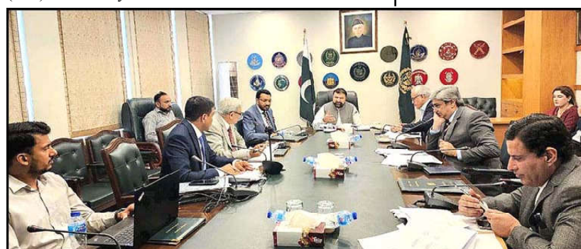
ISLAMABAD: Caretaker Federal Minister for Interior Sarfaraz Ahmad Bugti and Federal Minister for Communication and Railways Shahid Ashraf Tarar during a Meeting of the Cabinet Sub-Committee on ECL.

also decided the expected candidates". Mr Siddiqui asserted that the MQM-P will not leave any of the "better candidates" in frustration. On the other side, Pakistan Peoples Party (PPP) senior leader Faisal Karim Kundi had reiterated the demand for holding the elections within 90 days. Expressing his thoughts, Mr Kundi said, "The elections should be held on time. The PPP is ready for the polls. The PPP will win the next elections with the majority of the votes". Mr Kundi expressed his thoughts in line with the return of Pakistan Muslim League-Nawaz (PML-N) supreme Nawaz Sharif to the country.