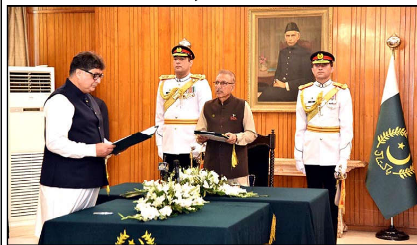
ISLAMABAD: President Dr. Arif Alvi administering the oath of office to Mr. Fawad Hasan Fawad as Caretaker Federal Minister, at Aiwan-e-Sadr.