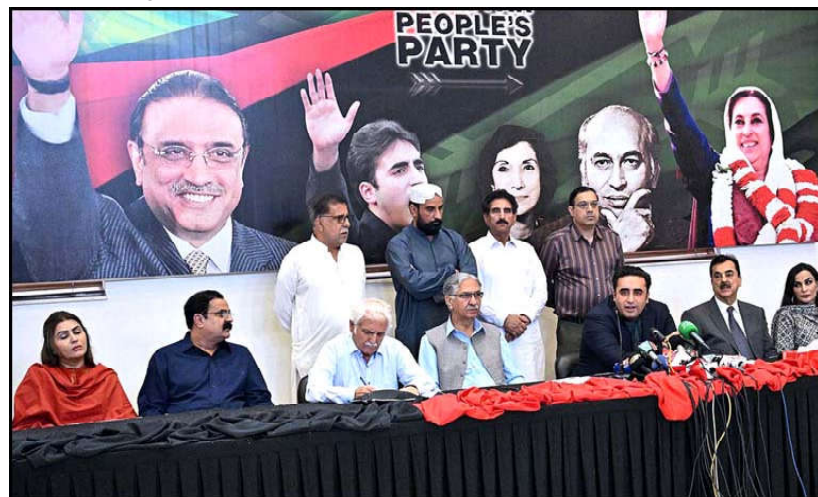
LAHORE: PPP Chairman Bilawal Bhutto Zardari talking to media persons after Central Executive Committee meeting.

Speaking to the media after the meeting, Bilawal said the announcement of an election date and schedule was the only way to dispel the "confusion and atmosphere of instability and insecurity" prevalent in the country.