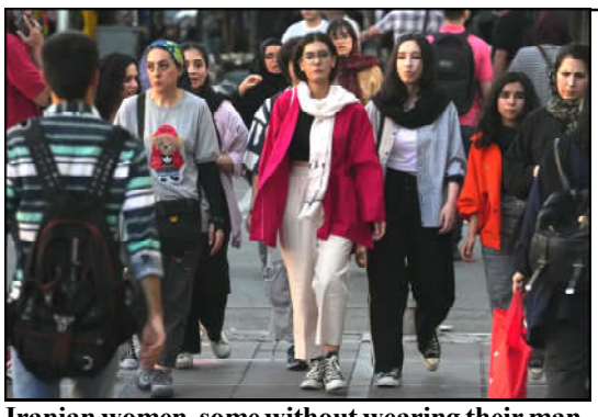
Iranian women, some without wearing their mandatory Islamic headscarves, walk in downtown Tehran, Iran.

Romania also struck a deal with Norway in November to buy 32 used F-16s, which would allow Romania to expand its fledgling F-16 fleet and retire the last of its outdated Soviet-era MiG-21 fighters. At first, this training center will focus on teaching Romanian pilots to fly F-16s, Sanchez said. But over time, Lockheed hopes more nations could start sending their pilots there — including Ukraine. "The European Flight Training Center may be a good option for countries like Ukraine, or others who may need that support as they build out their air force needs."