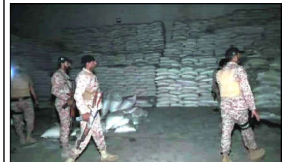
KARACHI: Sindh Rangers officials recovered huge quantity of sugar during operation at illegal godown located on Baldia Town in Karachi