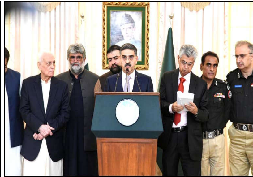
ISLAMABAD: Caretaker Prime Minister Anwarul Haq Kakar addressing a Press conference after a meeting. Caretaker Chief Minister Balochistan Mir Ali Mardan Khan Domki is also present

Almost 1800 references, investigations, inquiries and complaints have been reopened in the light of this decision.