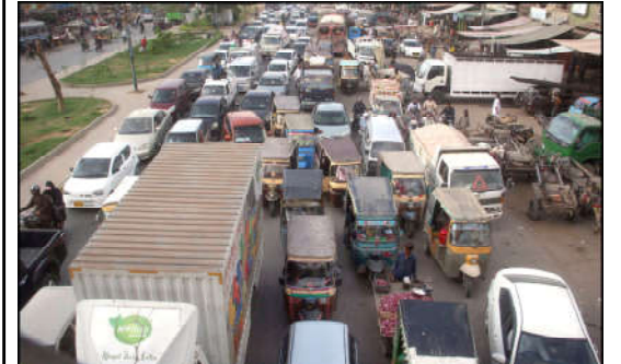
KARACHI: A view of the massive traffic jam due to the protest of people in the favor of their demands at Liaqatabad area in Provincial Capital.