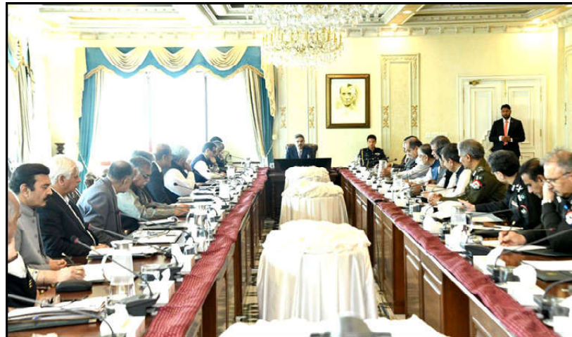
ISLAMABAD: Caretaker Prime Minister Anwaar-ul-Haq Kakar chairs a meeting on measures against electricity theft and hoarding, in Federal Capital.

confronted by people in his area. Speaking on the occasion, the Governor assured cooperation to the delegation and said that he is not oblivious to the problems of people living in KP and steps have been taken to resolve them. He also urged the masses to collectively work for the development of their area and said that available resources would be utilized to address the problems of Upper Dir. He stressed avoiding negative thinking and changing of mindset to counter the narrative being propagated by certain elements against the country.