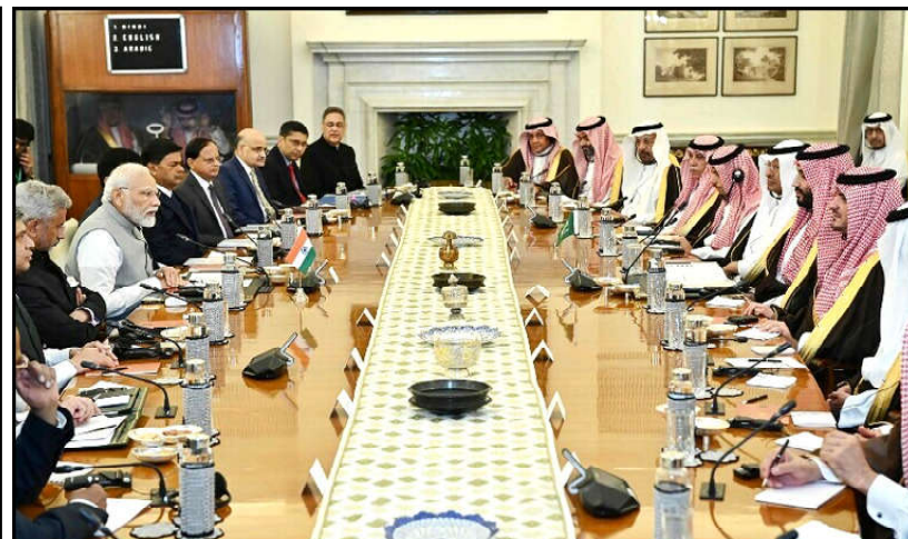
India's Prime Minister Narendra Modi and his Saudi Arabian counterpart Crown Prince Mohammed bin Salman attending their delegation level talks at Hyderabad House in New Delhi, India.

possibility of trading in local currencies and expediting the negotiations for a free trade agreement between India and the Gulf Cooperation Council of which Saudi Arabia is a member. Ausaf Sayeed, a secretary in the Indian foreign ministry, said the two countries signed eight agreements, including a pact to upgrade their hydrocarbon energy partnership to a comprehensive energy partnership for renewable, petroleum and strategic reserves. They also agreed to create a joint task force for $100 billion in Saudi investment, half of which is earmarked for a delayed refinery project along India's western coast, Sayeed said.