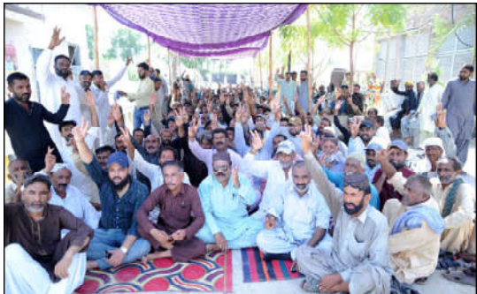
HYDERABAD: Leaders and workers of HDA Labor Union (CBA) hold a sit in protest after suspend water supply from the filter plants at Jamshoro road filter plant against non-payment of their salaries and pensions as water supply is suspended in Qasimabad and Latifabad area of the City.

irregularities in different universities, and inquiries conducted on the complaints filed by the students and general public. During the meeting, they also discussed matters relating to surplus staff and less number of students in the universities. Speaking on the occasion, Governor Khyber Pakhtunkhwa said that offices are sacred trust of the county and nation, saying performing duties with honesty should be the mission of all of us. He said that the prevailing financial problems of the universities are a matter of concern and that the situation of the public universities is hurting him.