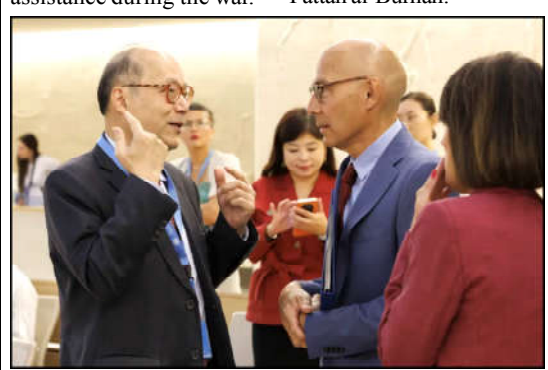
U.N. High Commissioner for Human Rights Volker Turk (Turk) listens to Chen Xu, Ambassador of the Permanent Representative Mission of China to the UN in Geneva, prior to the 54th session of the Human Rights Council, at the European headquarters of the United Nations in Geneva, Switzerland.

Monitoring Desk WAD MADANI: Air strikes killed at least 46 people and injured dozens at a Khartoum market, local activists said, one of the deadliest single attacks in Sudan's nearly five months of war. The bombing in the south of Sudan's capital came about a week after another air strike, also in southern Khartoum, killed 20 civilians on Sept 2, according to activists. The number of victims in Sunday's "Qouro market massacre" had risen to 46 by evening, said the local resistance committee, one of many groups that used to organise pro-democracy protests and now provide assistance during the war. In his statement, the committee revised an earlier toll of 30 killed. It added there were "dozens wounded" and said casualties continued to pour into the nearby Bashair hospital. "At about 7:15am (0515 GMT), military aircraft bombed the Qouro market area," the committee said. The hospital had issued an "urgent appeal" for all medical professionals in the area to come and help treat the "increasing number of injured people arriving". A conservative estimate from the Armed Conflict Location & Event Data Project says nearly 7,500 people have been killed in the war that began on April 15 between army chief Abdel Fattah al-Burhan.