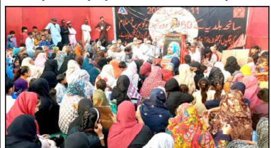
KARACHI: A large number of workers, heirs of the martyrs, political and social workers and civil society activists gather during condolence ceremony in connection of the 11th anniversary of Baldia factory fire tragedy arranged by National Trade Union Federation (NTUF) held in Karachi.

including the revival of tourism and mineral exploration in NMDs, which are vital for sustainable peace and growth in the area. The meeting also reviewed the mechanisms of border management including measures to curtail and curb the smuggling of goods and put forward a comprehensive approach to address the issues. Participants underscored the importance of the capacity building of KP Police including Counter Terrorism Department (CTD) and expressed satisfaction on the recent achievements of police in thwarting terrorist attacks across the province.