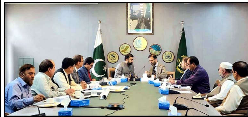
ISLAMABAD: Caretaker Federal Minister for Interior, Sarfraz Ahmad Bugti and Caretaker Federal Minister for Water Resources, Ahmad Irfan Aslam chairing a meeting regarding the restoration of Kachi Canal, in Islamabad.

The caretaker CM said that our sugar industry has expanded substantially over the years with 33 sugar mills in the province. During the 2022-23 season, sugarcane was grown in a crop area of about 290,000 hectares, Justice Baqar said and added that a total of 16.8 million metric tons of sugarcane was crushed and about 1.75 million metric tons of sugar was produced.