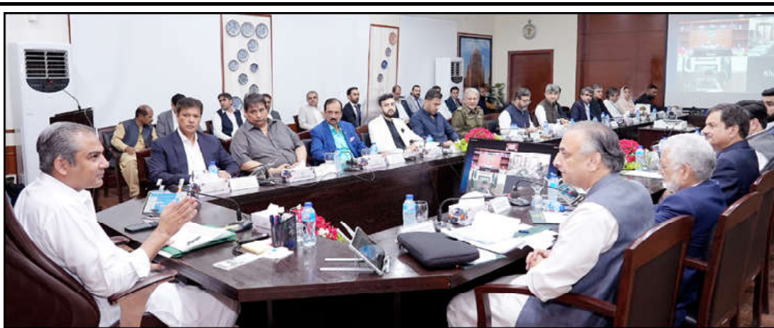
MULTAN: Caretaker Chief Minister Punjab Mohsin Naqvi presides over the 25th session of Punjab cabinet South Punjab Secretariat Multan.

project of people welfare. He said the newly inducted engineers would be provided the necessary training to make their work praiseworthy. Talking to newly inducted SDOs at a five-day training workshop at the Pakistan Academy for Rural Development (PARA), he said the engineers who have been imparted training should work as the servants of the people.