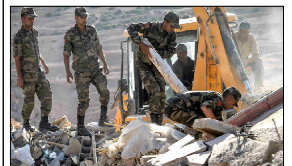
Moroccan Royal Armed Forces search through the rubble of houses after an earthquake in the mountain village of Tafeghaghte, southwest of the city of Marrakesh.

Furthermore, Bugti mentioned ongoing efforts to address illegal immigration, with plans to repatriate illegal immigrants in the near future.