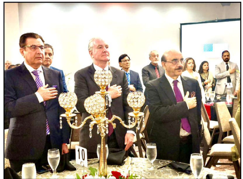
WASHINGTON: Ambassador Masood Khan & Senator Chris Van Hollen attending the Annual Meeting & Gala Dinner of the DMV chapter of APPNA as Chief Guests.

He said the dangerous way in which India has started the massacre of the people of occupied Jammu and Kashmir and the minorities living in India can prove to be very dangerous not only for this region but also for the whole world. He will continue to fight the cause of Kashmiris until the entire Jammu and Kashmir becomes fully independent and joins Pakistan.