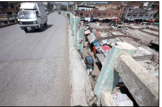
PESHAWAR: Safety wall of Faqirabad Bridge seen broken that may cause any accident and also inviting authorities to draw their attention towards issue, in Peshawar.