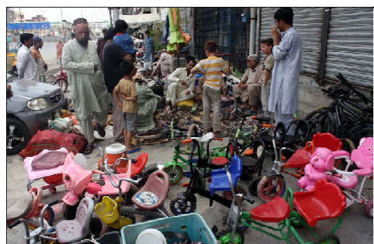
LAHORE: People purchase used items due to price hiking, at makeshift weekly market near Minar-e-Pakistan in Lahore.

During his visit to the Mughalpura Workshop in Lahore, Minister Afridi received a detailed briefing on its functioning and performance. He also sought recommendations or a business model to increase revenue from the workshop's output. The Chairman of Railways, CEO Railways, IGP Railway Police, and principal officers were present during this important review.