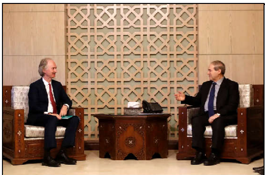
U.N. special envoy for Syria Geir Pedersen meets with Syrian Foreign Minister Faisal Mekdad, in Damascus, Syria.

Germany and Britain have also praised the resolution, but Ukraine said "it was nothing to be proud of".