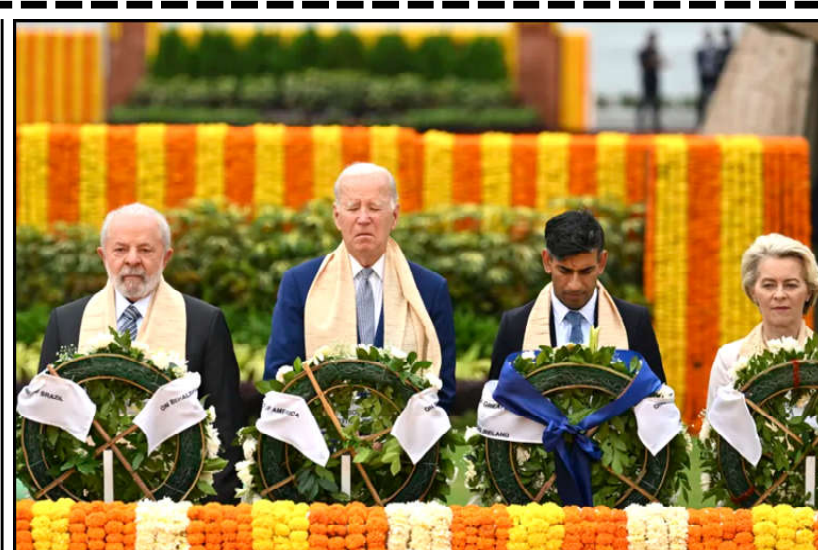
Brazil President Luiz Inacio Lula da Silva, U.S. President Joe Biden, UK Prime Minister Rishi Sunak and European Commission President Ursula von der Leyen pay their tributes at the Rajghat, a Mahatma Gandhi memorial, in New Delhi, India.

THE HAGUE: Climate change activists blocked a major motorway in The Hague on Saturday in a protest against Dutch fossil fuel subsidies, the latest high-profile action by the Extinction Rebellion group that attracted several thousand demonstrators. Police deployed water cannon against some of the activists, who have threatened a permanent blockade of the motorway, vowing to "stay or come back every day" until fossil fuel subsidies are dropped.