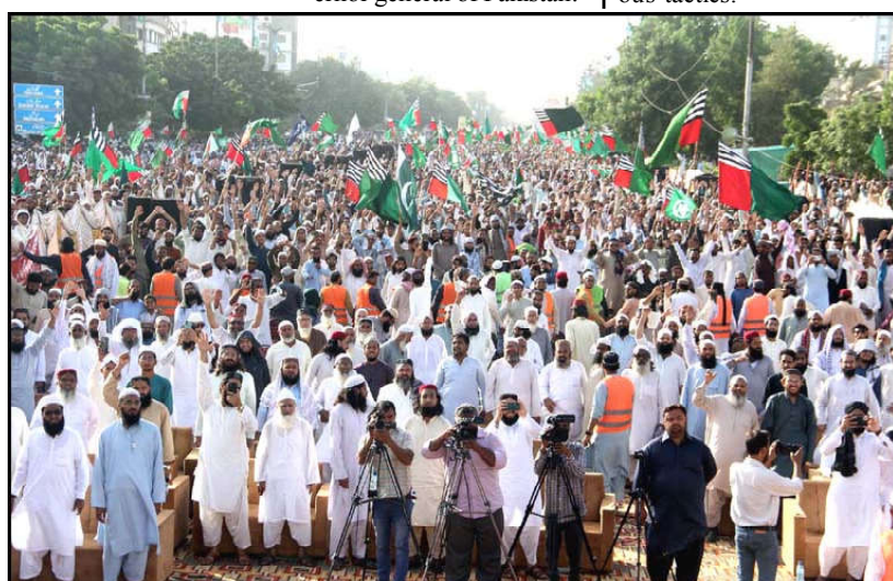
KARACHI: Members of Ahle Sunnat Wal Jamaat are holding Azmat-e-Sahaba and Ahlebait rally, at Shahrah-e-Quaideen in Karachi.

Muhammad Ali Jinnah became the first governor general of Pakistan.