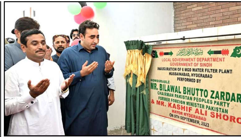
HYDERABAD: Peoples Party (PPP) Chairman, Bilawal Bhutto Zardari along with Kashif Ali Shoro, Mayor Hyderabad offering Dua after unveiling the plaque during the inauguration ceremony of 6 MGD Water Filter Plant, at Hussainabad in Hyderabad.

The SAPM on HR and Women Empowerment said that the people of Kashmir had been facing these inhuman treatments for over seven decades due to their struggle for the right to self-determination.