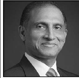
Aizaz Ahmad Chaudhry

Every Sept 6, Pakistan marks Defence Day to celebrate the determination of the nation and its armed forces to defend the country against India's aggression in 1965. The war lasted only 17 days, and peace was restored by the Tashkent Agreement of 1966. As happens in most wars, there were no real winners. India was unable to penetrate Pakistan's defences. Pakistan could not liberate Jammu and Kashmir illegally occupied by India.