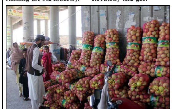
QUETTA: Vendor sells apples to earn his livelihood for support of his family, at a roadside located on Joint road in Quetta.

The federal government departments would be allowed to set up their desks at one window on matters relating to electricity and gas.