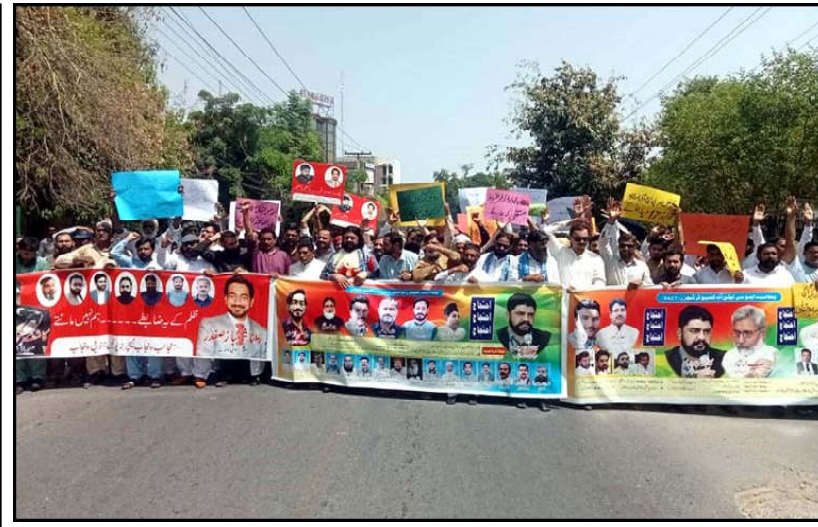
MULTAN: Members of Punjab Teachers Union are holding protest demonstration for acceptance of their demands, at Multan press club.

Pakistan have fielded an unchanged playing XI for this high-voltage clash.