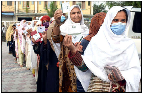
MUZAFFARABAD: Deserving women showing their Roshan cards as stands in a queue for collecting free food package distributing from Mohammed Bin Rashid Al-Maktoum Global Initiatives.

He said on directives of the Federal Minister for Energy, the IESCO launched crackdown against electricity thieves and their facilitators in the all circles including Islamabad-Rawalpindi-Attock-Jhelum and Chakwal circles.