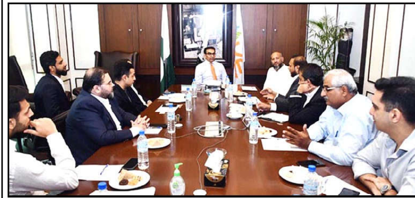
KARACHI: Caretaker Federal Minister for Energy Ali Muhammad Chairing a meeting with officers of K electric.

Tehreek-e-Insaf said that first Aun Abbas Bhatti, then Sadaqat Abbasi and now Usman Dar were kidnapped, this new strategy to crush the party and this will also fail like the previous tactics.