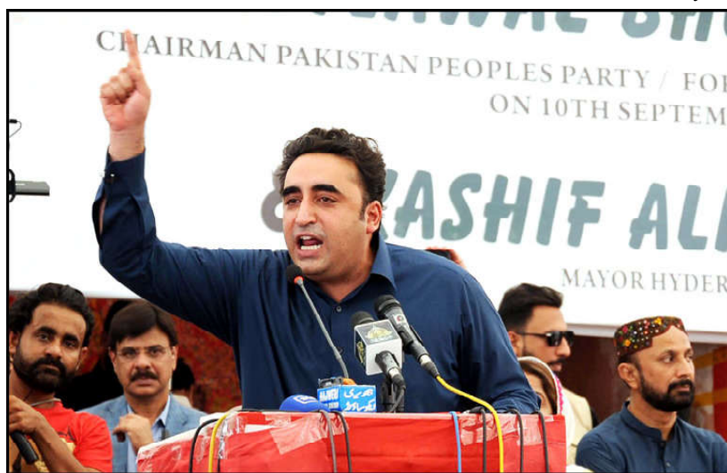
HYDERABAD: Chairman Pakistan Peoples Party addressing the inauguration ceremony of 10 MGD Water Filter Plant Hussainabad.

However, PPP Co-Chairperson and Bilawal's father, Asif Ali Zardari, said in a statement yesterday that "completing the delimitation exercise was necessary before holding polls". But, when Bilawal was queried on the statement that seemed a deviation from the PPP's stance, he stated his preference to stick by decisions made by the party leadership, i.e. elections within 90 days, instead of his father's stance, saying he was only "bound to follow his father in family matters".