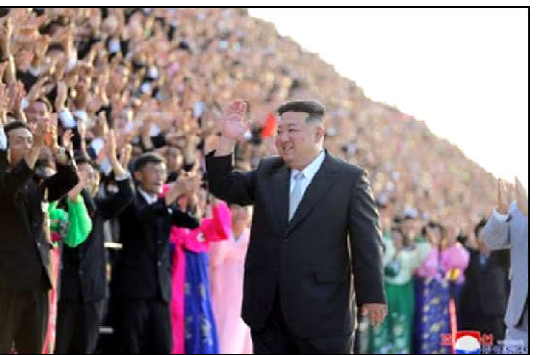
North Korean leader Kim Jong Un attends a celebration event marking the 75th anniversary of the founding of the country.

The Turkish president also held talks with Japanese Prime Minister Fumio Kishida at the sidelines of the G20 summit regarding efforts to revive the deal, two sources with knowledge of the matter said, without giving further details.