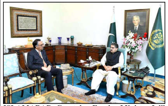
ISLAMABAD: Caretaker Foreign Minister Jalil Abbas Jilani called on caretaker Prime Minister Anwaar-ul-Haq Kakar.

The recently established Special Investment Facilitation Council (SIFC) is a good initiative. This initiative will promote investment in the country.