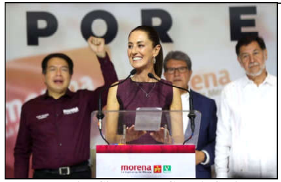
Former Mexico City Mayor Claudia Sheinbaum smiles after the announcement of the results of an internal national polling which declared Sheinbaum as the presidential candidate, in Mexico City, Mexico.

huge mistake. The idea that they would be supplying ammunition to that end, is — would be a huge mistake. I also believe very strongly that for both Russia and North Korea, this will further isolate them," Harris said. U.S. officials have warned in recent days that arms negotiations between Russia and North Korea are actively advancing, while a report said North Korea's Kim Jong Un plans to travel to Russia this month to meet President Vladimir Putin and discuss supplying Moscow with weapons for its war effort.