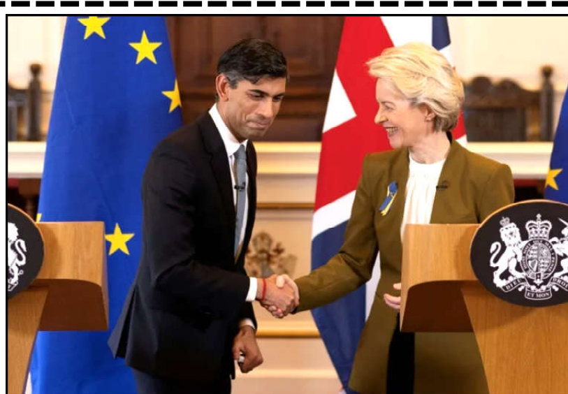
London and the EU agreed the UK can rejoin the EU's Horizon science programme.

anything Russian simply ignores this reality," said Zelensky. "Heinous evil. Brazen wickedness. Utter inhumanity." He later accused Russia of deliberately targeting civilians and said there were no military units "anywhere near" the scene. The attack came as US Secretary of State Antony Blinken visited Ukraine, with Washington set to unveil more than $1 billion in fresh aid to battle Russia. During a meeting with Foreign Minister Dmytro Kuleba, Blinken reiterated Washington's support for Kyiv in its fight to liberate territory in the south and east.