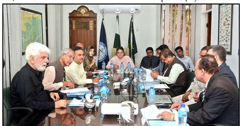
KARACHI: Chairperson Senate Standing Committee on Maritime Affairs Senator Rubina Khalid chairing a meeting to review performance of Korangi Fisheries Harbour Authority (KoFHA).

The chairperson and committee members expressing dissatisfaction with the performance of the authority noted that KoFHA had failed to exert its authority with regard to controlling unlicensed fishing activities in its jurisdiction.