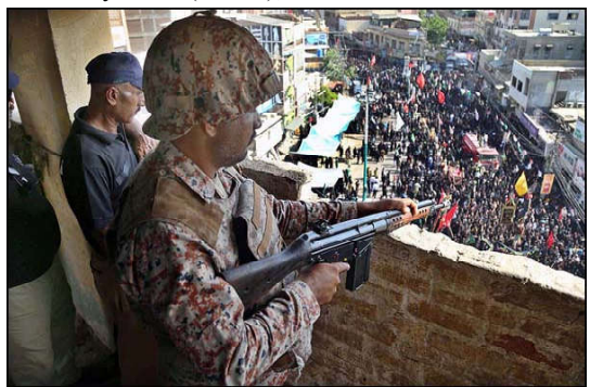
HYDERABAD: Security high alert on the top of building at Koh-e-Noor Chowk during Chehlam of Hazrat Imam Hussain (RA) the grandson of the Holy Prophet Mohammad (PBUH), martyred along with his family members and companions at Karbala.

secretaries of industries, energy department, Additional IG Special Branch attended the meeting while all divisional commissioners, RPOs and heads of Power Distribution Companies participated through video link. The meeting decided to take stern action against those government employees and officers patronizing electricity theft and to improve the prosecution procedure after registration of FIR against power thieves.