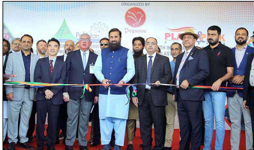
LAHORE: Governor Punjab, Muhammad Balighur Rehman cutting ribbon to inaugurate the 18th IFTECH and Plastic & Pack exhibitions at Expo Centre.

the country's economy. He said that such event also play an important role in promoting the latest technologies by bringing together diversified exhibitors from all over the world and provide a forum to exchange ideas and cost-effective solutions. He said he was happy to see that more than 200 plastic and packaging industry stalls had been set up at the three-day international exhibition and companies from more than 20 countries including Canada, Belgium, Russia, Denmark, France, Germany, America, United Arab Emirates were participating in the event.