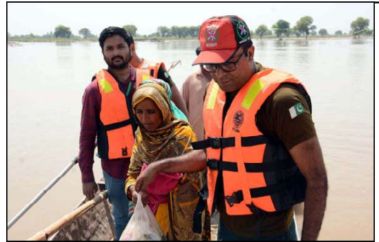
MULTAN: Rescue workers evacuate people from the villages as water from the Sutlej River continued to inundate settlements along its banks, near Multan on Thursday.

"Hence, we all from, parents to teachers, are duty-bound to play a proactive role for rooting out the evil in an effective way," she stressed. Addressing a seminar on 'Sexual Harassment Act 2010' at the University of Agriculture Faisalabad (UAF), she said sexual harassment was common phenomena, but unfortunately, it was not discussed in our society. "Although the