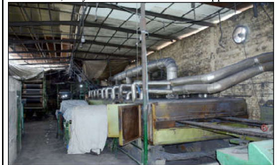
FAISALABAD: A view of the un functional factory along the Maqbool road as due to the unstable economic and political situation, a lot of such factories shut their production across the country.

One of the key highlights of the meeting was the exploration of potential opportunities for boosting trade in various sectors, including Textile, value added Food products, Fresh Mangoes and Dates, Soybean and