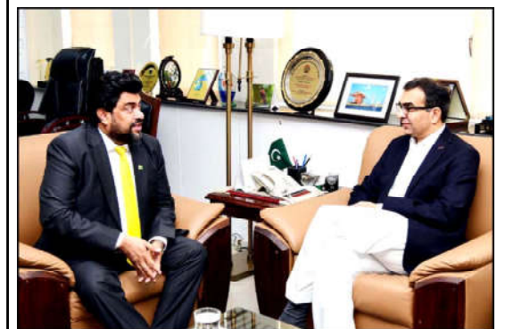
ISLAMABAD: Caretaker Federal Minister for Power and Petroleum, Muhammad Ali exchanging views with Kamran Tessori, Governor Sindh during meeting held in Islamabad.