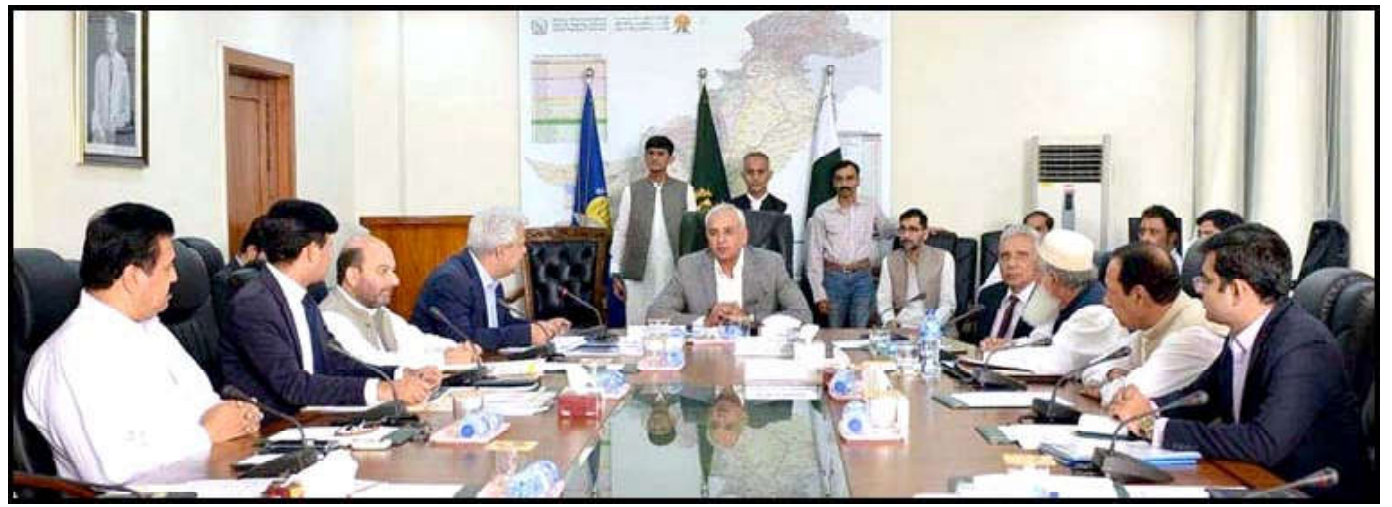
ISLAMABAD: Federal Minister for Communications & Railways Mr. Shahid Ashraf Tarar presiding over meeting of National Highway Council - Supreme body of National Highway Authority. ISLAMABAD: Federal Minister for Communications & Railways Mr. Shahid Ashraf Tarar presiding over meeting of National Highway Council - Supreme body of National Highway Authority.

ISLAMABAD (APP): Caretaker Federal Minister for Information and Broadcasting Murtaza Solangi said on Thursday that notification regarding the ban on Rs 5,000 currency notes was fake. In a post on X, formerly Twitter, the minister said that the government would take strict action against those spreading such fake notifications.