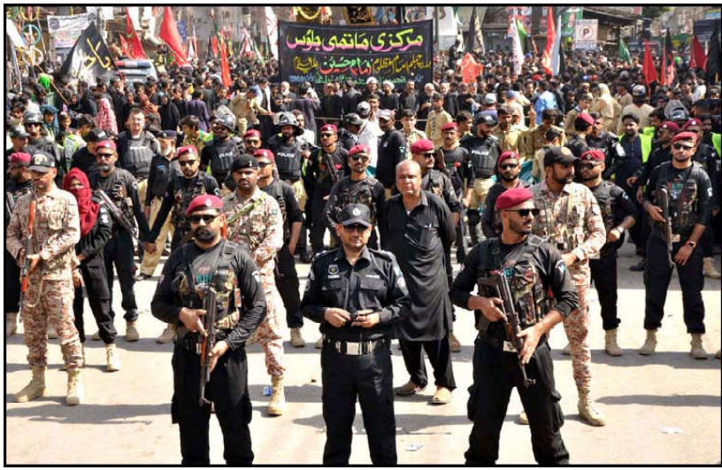
HYDERABAD: Security officials stand high alert on route to avoid any untoward incident as security has been tightened during Shiite mourning processions in connection of 40th day Chehlum-e-Hazrat Imam Hussain (R.A), grandson of Prophet Mohammad (PBUH), in Hyderabad.