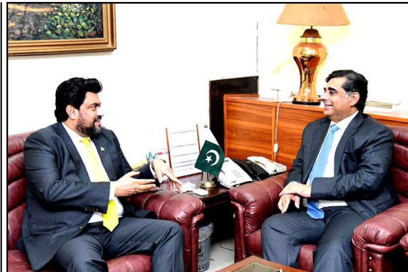
ISLAMABAD: Caretaker Federal Minister for Commerce, Industries and Production, Dr. Gohar Ejaz exchanging views with Kamran Tessori, Governor Sindh during meeting held in Islamabad.

He directed the authorities concerned to submit a report on expansion of FBR's Point of Sales system besides improving the performance of commercial attaches in Pakistan's diplomatic missions.