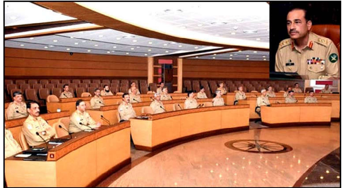
RAWALPINDI: Chief of the Army Staff General Asim Munir presiding over 259th Corps Commanders' Conference.

Commemoration of Defence and Martyrs Day on 6 September across the country by all segments of the society was appreciated for which the Armed Forces of Pakistan remain ever thankful to our proud nation.