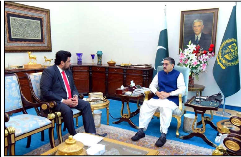
ISLAMABAD: Caretaker Prime Minister, Anwaar-ul-Haq Kakar exchanging views with Kamran Tessori, Governor Sindh during meeting held in Islamabad.

through the introduction of new technology, and would also attract investment. Regarding the sugar price hike, Kakar said the government had asked the provinces to activate the price control committees and that the hoarders would be cracked down. The prime minister said through the legislation, the previous government had empowered the caretaker setup which necessitated them to act differently from the normal caretaker setup. The prime minister told the interviewer that the Special Investment Facilitation Council had been formed as a forum to address the concerns impeding the investment projects. He said Saudi Arabia, UAE, Qatar and Bahrain had sent proposals and due diligence was being done which would follow the signing of formal agreements by November or December.