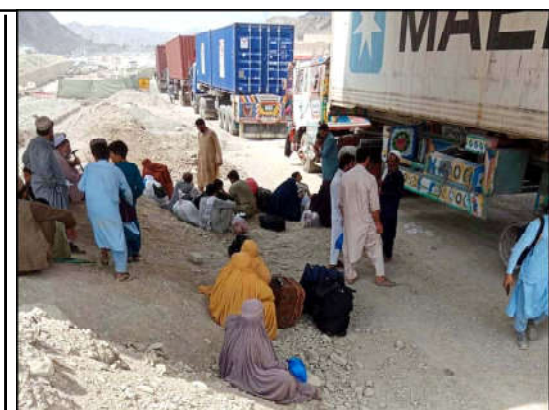
LANDIKOTAL: People are facing inconvenience after Turkham border closed due to an exchange of gunfire between Afghan and Pakistani forces, in Turkham Border.