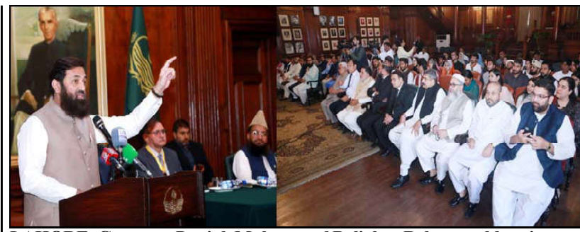
LAHORE: Governor Punjab Muhammad Balighur Rehman addressing ceremony organized in connection with Pakistan Defence Day at Governor House

of our nation and army was great, he added. Governor Punjab said that on September 6, 1965, valiant armed forces and nation foiled the nefarious designs of the army. He said we should renew the pledge on this historic day to remain united and defend the motherland against all odds. Punjab Governor Muhammad Balighur Rehman said that all nations in the world respect and honour their martyrs, adding that some red lines are not allowed to be crossed all over the world. However, it is a national tragedy that some people instilled so much hatred in the youth by hate speeches that they desecrated the memorials of