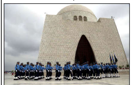
KARACHI: Pakistan Air Force cadets performing march past during change of guards ceremony to pay homage to the Ghazis and Shuhada of 06 September 1965 Indo-Pak War on the occasion of Defence Day of Pakistan, at Mausoleum of Quaid-e-Azam Muhammad Ali Jinnah in Karachi.