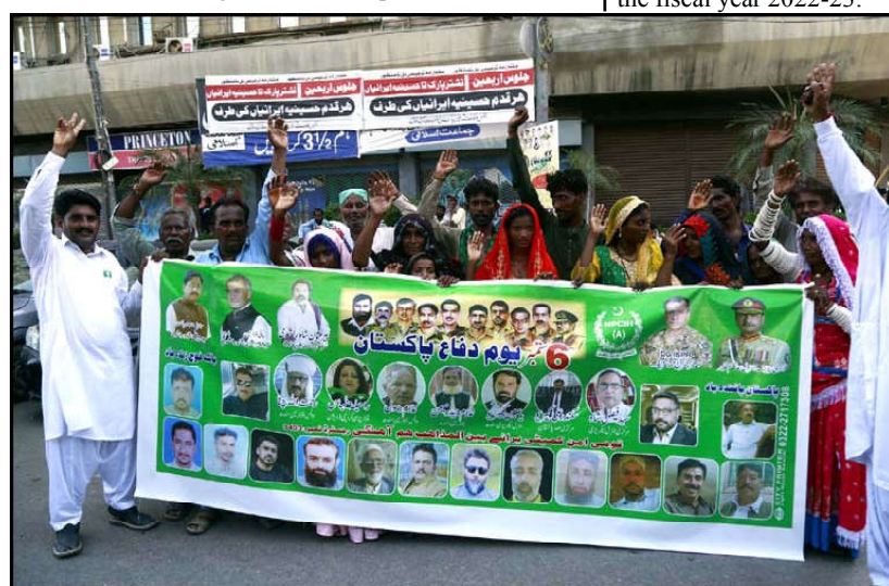
KARACHI: Members of National Peace Committee for Interfaith Harmony are holding celebration demonstration to pay homage to the Ghazis and Shuhada of 06 September 1965 Indo-Pak War on the occasion of Defence Day of Pakistan, at Karachi press club.

val Staff in his office, where professional matters of mutual interests, regional maritime security environment and bilateral naval collaboration were discussed. Various avenues of cooperation including training, exchange of visits and conduct of bilateral naval exercises between the two Navies were also focused. Admiral Amjad Niazi highlighted Pakistan Navy's initiatives to ensure maritime security and peace in the region through Regional Maritime Security Patrols. The visiting Admiral acknowledged Pakistan Navy's efforts and commitments in support of collaborative maritime security in the region.