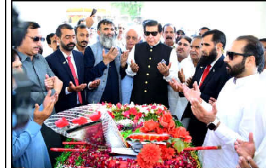
GUJAN KHAN: National Assembly Speaker, Raja Pervez Ashraf offering Fatеха at the grave of Sawar Muhammad Hussain Shaheed Nishan-e-Haider on the occasion of Defence Day of Pakistan, in Mandara.

KARACHI (APP): The Sindh Counter Terrorism Department (CTD) on Wednesday detained four suspects in an information based phase-wise search operation. According to spokesman for CTD Sindh, the CTD along with the concerned police station conducted a search operation in Malir area during which 93 suspected persons were checked and their data was verified through Talash App. Four of the suspects were handed over to Malir City police station for further verifications. The operation was conducted under the supervision of experienced and expert officers of CTD. The phase-wise search operations were initiated on September 1st, in sensitive areas of the megalopolis to nab the suspects involved in terrorism.