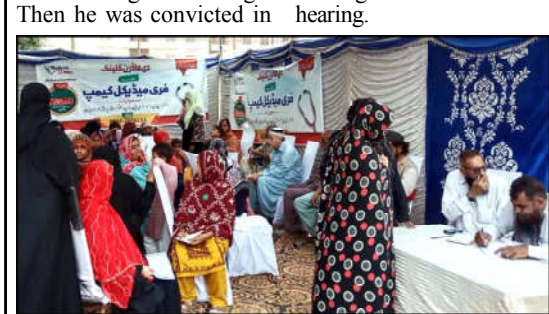
KARACHI: Patients are being examine by doctors during the free medical camp organized by Pakistan Markazi Muslim League, at Surjani Town in Karachi.