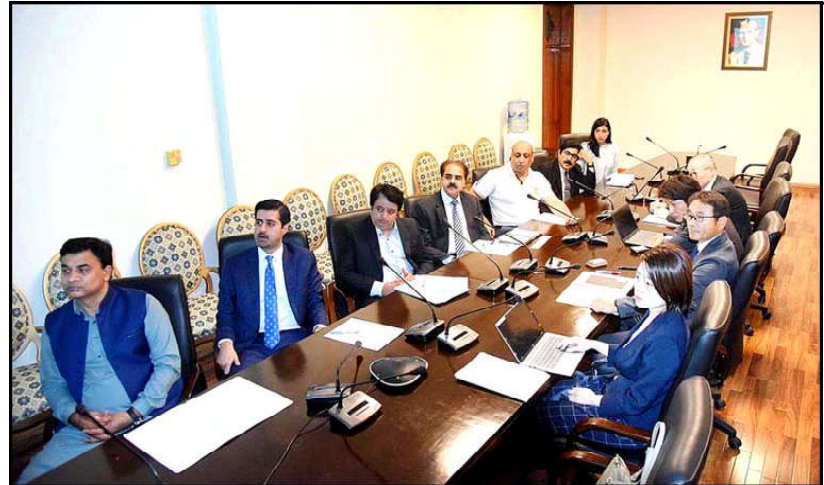
ISLAMABAD: The Special Investment Facilitation Council (SIFC) in a meeting with High-Level Japanese Delegation at PM Secretariat.