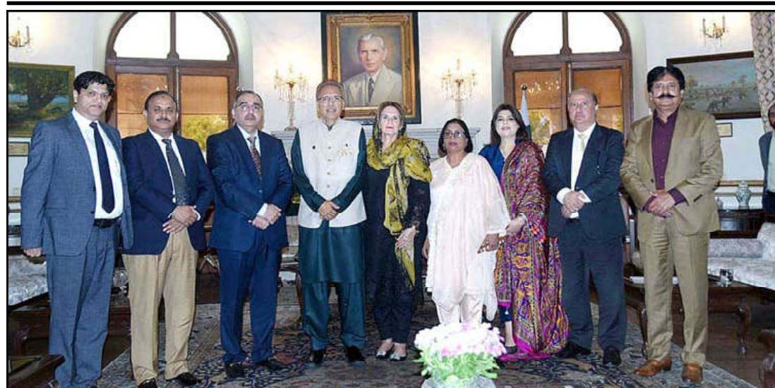
LAHORE: President Dr. Arif Alvi in a group photo with a delegation of Lahore Chamber of Commerce and Industry at Governor House.