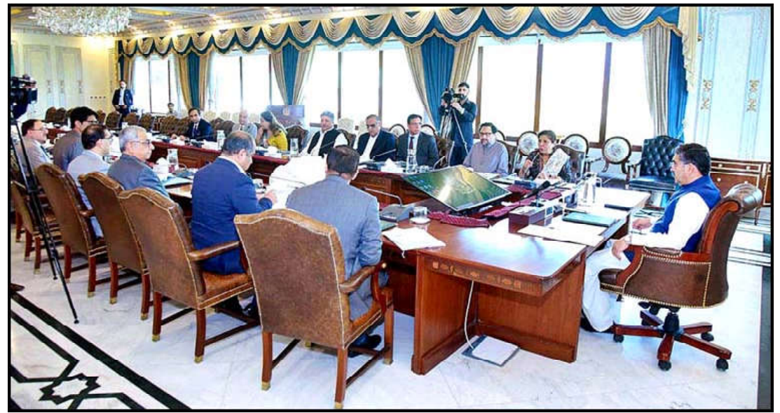
ISLAMABAD: Caretaker Prime Minister Anwaar-ul-Haq Kakar chairs a meeting on Federal Board of Revenue and Privatisation.

other departments. The FBR was also striving to achieve the target of including another one million taxpayers in the tax net as 182,000 new taxpayers had already been added this year. The prime minister was told that the scope of Point of Sales system was being expanded to more cities and retailers. The efforts are being made to add another 20,000 new retailers in the PoS this year, besides formulating a strategy on Transit Trade Management System.