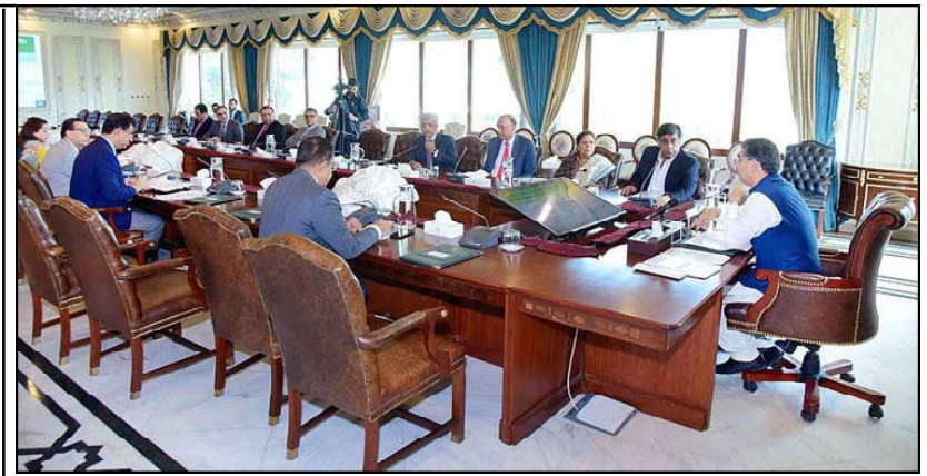
ISLAMABAD: Caretaker Prime Minister Anwaar-ul-Haq Kakar chairs a briefing by Ministry of Commerce and Ministry of Industries and Production.

By contrast, he continued, Pakistan imports 20,000 tons of potato seeds every year and most of the potato seeds in Pakistan highly depend on imports and the initial cost of potato production.