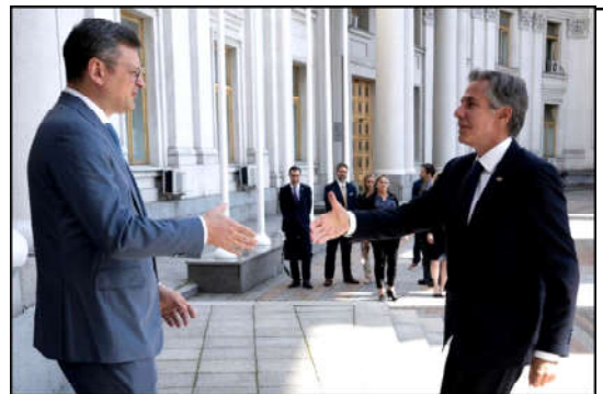
Ukraine's Foreign Minister Dmytro Kuleba greets US Secretary of State Antony Blinken before a meeting at the Ministry of Foreign Affairs in Kyiv, Ukraine.

Monitoring Desk SEOUL: South Korean President Yoon Suk Yeol said on Wednesday any attempt to cooperate with North Korea on military affairs in a way that damages international peace must immediately halt. Yoon made the comment at a summit meeting with Southeast Asia's ASEAN bloc countries in Jakarta, Indonesia, his office said. The office did not elaborate but his comment comes amid reports that arms negotiations between North Korea and Russia are actively advancing and that the North's leader, Kim Jong Un, plans to visit Russia soon to meet President Vladimir Putin. "Attempt at military cooperation with North Korea that harms international peace must immediately halt," Yoon's office