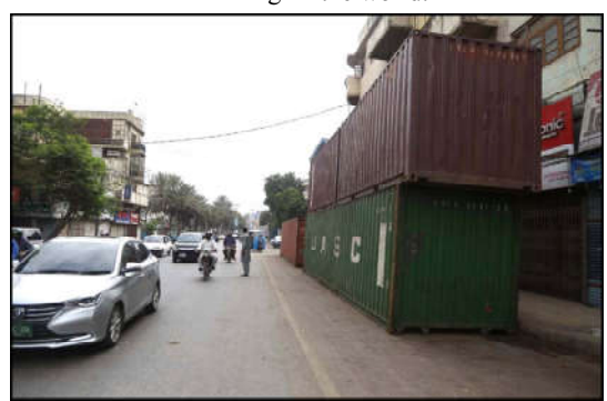
KARACHI: Containers has been placed at Saddar area to blocked the roads in connection of the Shiite religious mourning processions in memories of Chehlum-e-Hazrat Imam Hussain (RA), grandson of Prophet Mohammad (PBUH), in Karachi