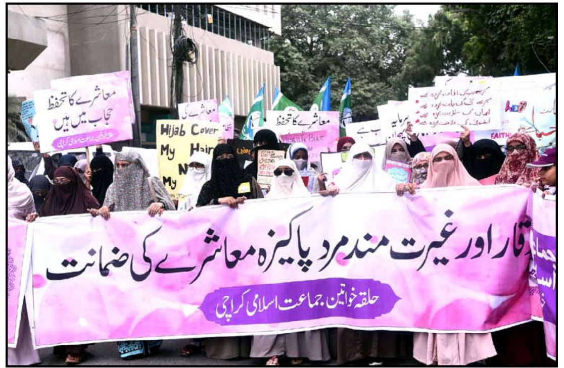
KARACHI: Activists of Jamaat-e-Islami (JI) Women Wing are holding rally on the eve of International Hijab Day, at Karachi press club.