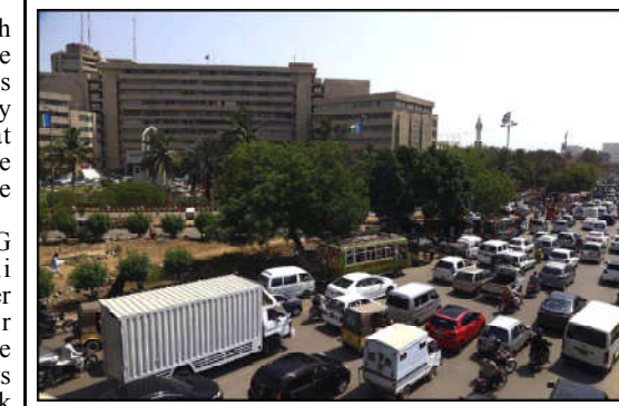
KARACHI: Commuters are facing inconvenience during traffic jam due to construction works of new development projects, as slow pace of construction work is creating problems for residents and they demand to concerned department to complete work as soon as possible, located on University road in Karachi.

PESHAWAR (APP): Caretaker Chief Minister Khyber Pakhtunkhwa, Muhammad Azam Khan, held a meeting on Monday with the newly appointed US Consul General, Shante Moore, in Peshawar. During the meeting, they discussed mutual interests and matters related to cooperation and collaboration between the provincial government and United States' development agencies in various sectors. Muhammad Azam Khan stated that the KP provincial government viewed cooperation with the US government and agencies in different