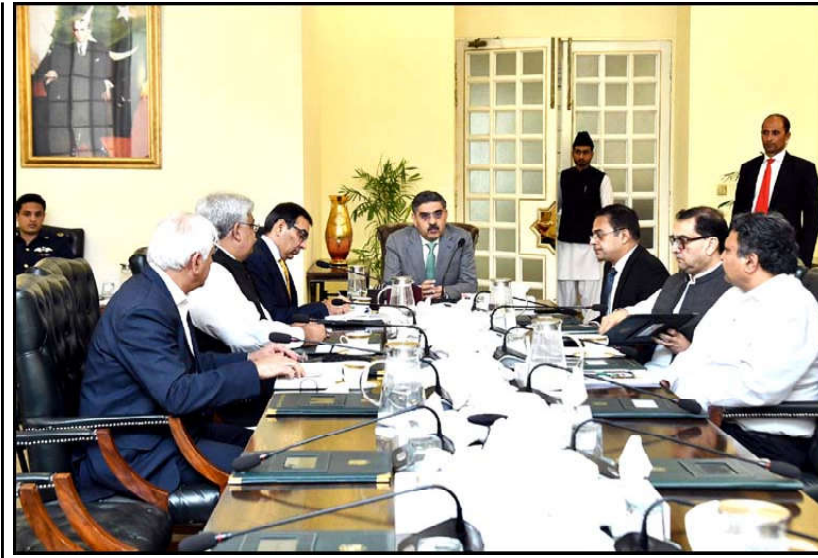
ISLAMABAD: Caretaker Prime Minister, Anwaar-ul-Haq Kakar chairs a meeting regarding power sector in Islamabad

However, he said in certain instances, political behaviour turned into vandalism and the country's law was already in vogue to deal with such conduct.