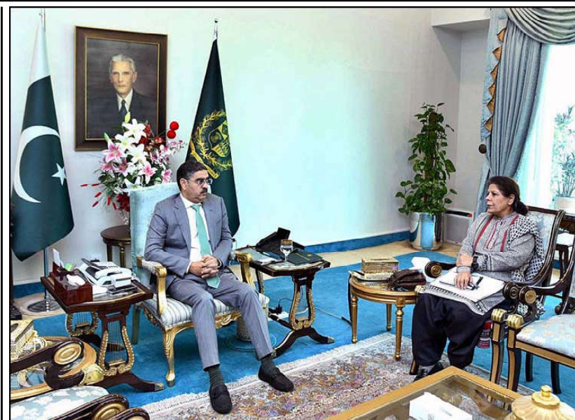
ISLAMABAD: Caretaker Minister for Finance Dr. Shamsad Akhtar called on caretaker Prime Minister Anwaar-ul-Haq Kakar.

Food Security Commissioner informed that local carry-forward stocks of wheat in the country were recorded at 1.570 million metric tons, which further strengthened the local reserves of grains, adding under import of 2022, the government had also imported about 375,589 metric tons of wheat.