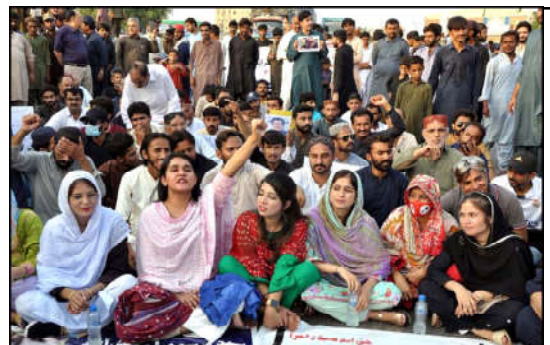
HYDERABAD: Members of Sindh Sabha are blocked road as they are holding protest demonstration for demanding the release of Hindu people kidnapped in Kashmir by dacoits, at Bypass road in Hyderabad.

completion of both projects within the specified time frame. This project would permanently resolve traffic issues at entry and exit points of the provincial metropolis, he noted. Commissioner/ DG LDA Mohammad Ali Randhawa, chief engineer LDA and contractor briefed that work on the Shahdara flyovers projects continues round the clock to achieve timely completion, which will significantly improve daily traffic flow for 300,000 vehicles.