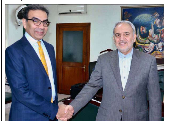
ISLAMABAD: Ambassador of the Islamic Republic of Iran to Pakistan H.E. Dr. Reza Amiri Moghaddam called on Caretaker Federal Minister for Power and Petroleum Muhammad Ali.

The committee showed its satisfaction regarding the ongoing outreach strategy of the SIFC and directed to further build on it by engaging business community and missions abroad.