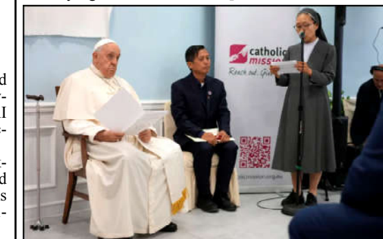
Pope Francis attends a meeting with charity workers and the inauguration of the House of Mercy in Ulaanbaatar.

The Sudanese Armed Forces control the skies and have carried out regular air strikes while RSF fighters dominate the streets of the capital.