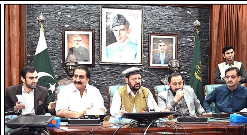
GILGIT: Chief Minister Gilgit-Baltistan Haji Gulbar Khan Addressing a press conference.

in the promotion of trade and tourism relations between Pakistan and ASEAN countries. He said that Pakistan has vast business opportunities for ASEAN countries in various sectors including tourism, agriculture, and export of halal products. He said that Pakistan has a unique position in the world in terms of its natural scenery, cultural heritage, and hospitality. He said that the landscapes of our country have all the features, adding that investment and proper promotion can make Pakistan the centre of tourism.