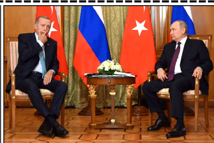
Russian President Vladimir Putin speaks to Turkish President Recep Tayyip Erdogan during their meeting at Russia's Black Sea resort of Sochi, Russia.

The meeting comes as Ukraine has launched a counteroffensive against Moscow's invasion. Ukraine President Volodymyr Zelenskyy announced Sunday that he would be replacing Defense Minister Oleksii Reznik, saying the position requires "new approaches."