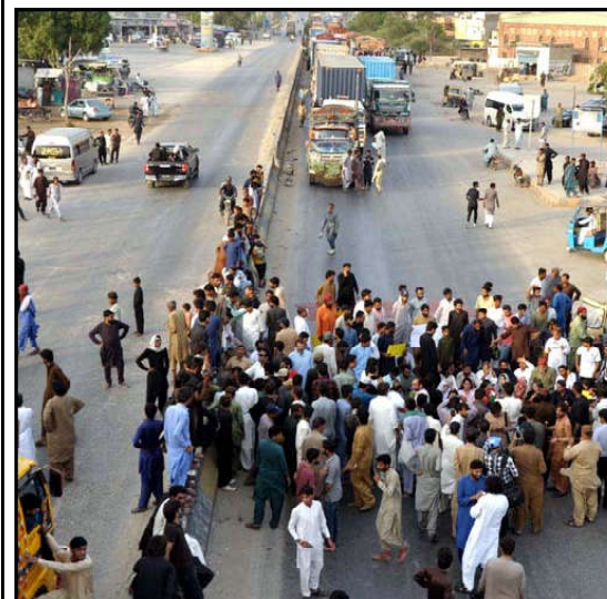
HYDERABAD: Members of Sindh Sabha are blocked road as they are holding protest demonstration for demanding the release of Hindu people kidnapped in Kashmir by dacoits, at Bypass road in Hyderabad.