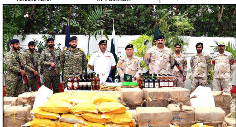
KARACHI: Pakistan Navy officials handing over the seized Narcotics to ANF officials, in Karachi.

KARACHI (INP): Sugar price on Monday hiked up to an all-time high in Karachi to Rs195 per kg as weekly inflation continues to accelerate. According to details, the sweetener is being sold between Rs185 to Rs195 in Karachi's retail market, while the rate in the wholesale market has decreased to Rs178 per kg from Rs180. Despite the decrease in the wholesale market price of sugar, the retailers are selling the same at their desired rate.