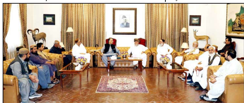
QUETTA: A delegation of Police Plaza Traders led by Haji Malook Agha meeting with Balochistan Governor Malik Abdul Wali Khan Kakar.

ISLAMABAD (APP): The per tola price of 24 karat gold decreased by Rs.700 on Monday and was sold at Rs. 239,100 as compared to its sale at Rs. 239,800 the previous day. The price of 10 grams of 24 karat gold also decreased by Rs.600 to Rs.204,990 from Rs.205,590 whereas the rate of 10 gram 22 karat went down to Rs. 187,907 from Rs.188,457, the All Sindh Sarafa Jewellers Association reported.