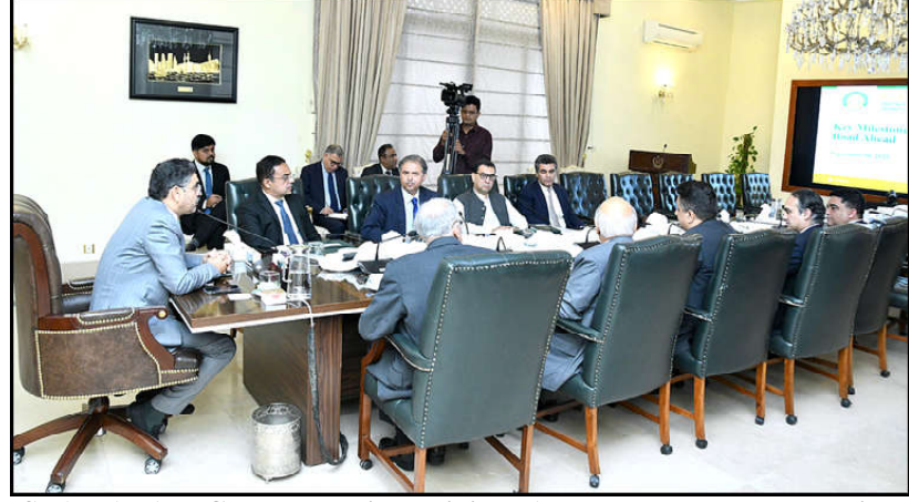
ISLAMABAD: Caretaker Prime Minister Anwaar-ul-Haq Kakar chairs a meeting on Public Private Partnership Authority.