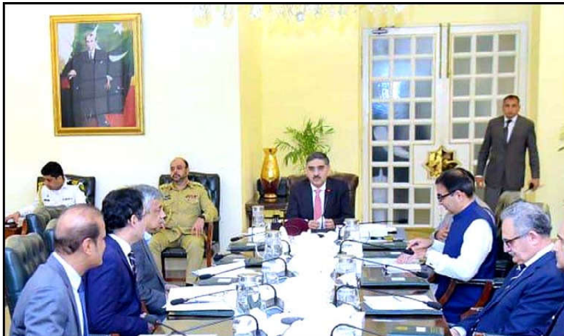
ISLAMABAD: Caretaker Prime Minister Anwaar-ul-Haq Kakar chairs a meeting regarding smuggling control at border areas.

"Sacrifices rendered by the Pakistan Army, para-military forces, Police, Levies, and people of Pakistan in the war against terrorism will be remembered forever," he maintained. The interior minister said, "The government envisages Balochistan as the future of Pakistan and a peaceful Balochistan is a beacon of hope for strong Pakistan as this vast province was bestowed with precious natural resources and could attain the status of the jugular vein in the economy of the country."