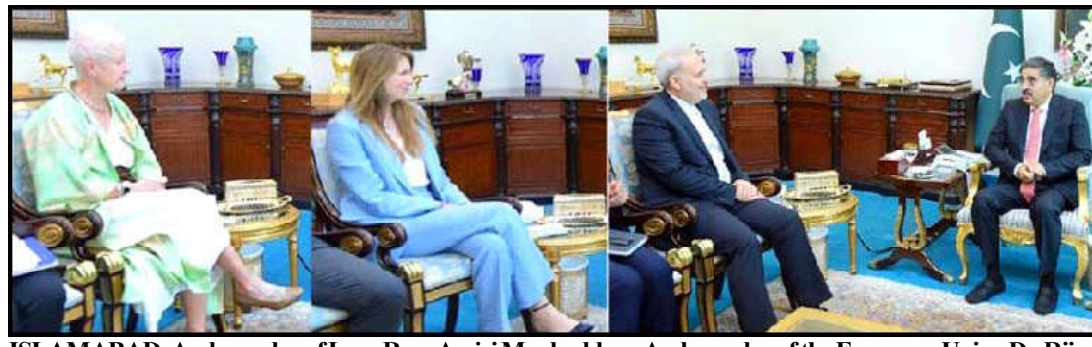
ISLAMABAD: Ambassador of Iran, Reza Amiri Moghaddam, Ambassador of the European Union Dr. Riina Kionka and British High Commissioner Jane Marriott separately meeting with caretaker Prime Minister Anwaar-ul-Haq Kakar.

Earlier in the meeting, the committee discussed at length the details of achievement of each awardee of National Awards 2023 as per their citation. Joint Secretary Awards Cabinet Division, informed the committee that the awards are being distributed in different fields such as Act of Bravery.