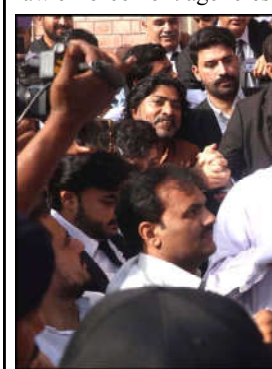
LAHORE: Former Chief Minister Punjab and Tehreek-e-Insaf (PTI) President, Chaudhary Pervaiz Elahi leaving after court case hearing, at High Court in Lahore.

He said every citizen had freedom of speech and a right to criticize that could not be taken away, but at the same time "we also have the right to present the facts without any fear".