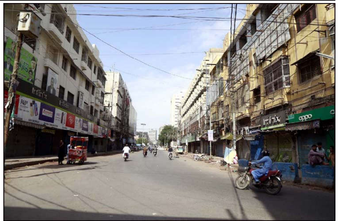
KARACHI: View of business activities seen closed while market gives desert look during the shutter down strike called by trader community against inflation price hiking and the highly inflated electricity bills, at Saddar area in Karachi.

Speaking on the occasion, Director PAJCCI, Zia-ul-Haq Sarhadi highly hailed the crossing of first-ever China cargo for Afghanistan via the Khunjerab border and termed it a good omen for enhancing trade in the region. This development, Zia added, would not only increase the volume of trade at the regional level but would also create a large number of livelihood opportunities for people associated with customs clearance, goods transportation, fuel business, daily wagers, etc.