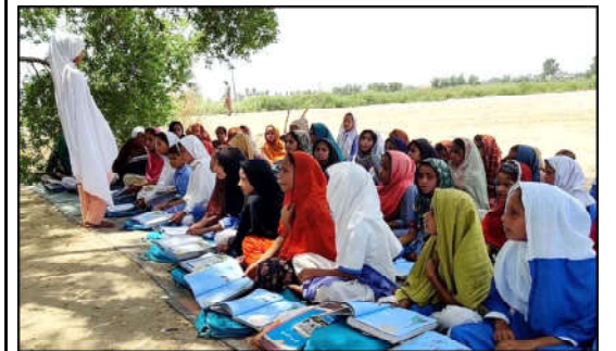
RATODERO: Students of Government Boys Primary School are studying under open sky, as the only one classroom built for 200 more students, which is in the worst condition in the school, they are demanding to build more classrooms in the school, they also demanded basic facilities including furniture, fans, electricity, and cold water, at Pir Bahar Shah village in Ratodero.

revealed. The pre-medical fee has been increased from Rs. 45000 to Rs. 49465 on open merit in Islamia College. Pre-medical fee has been increased by Rs. 13000 on self-finance, the fee has been increased from Rs. 98000 to Rs. 1,11,000. After the increase of Rs. 5000 in pre-engineering, the fee has become Rs. 47,000, the increase of Rs. 5000 per semester in the 4-year BS program also, says the document available to this agency. The fee for MPhil has been increased by Rs. 5,000 and the fee for Ph.D. has been increased by Rs. 7,000 per semester.