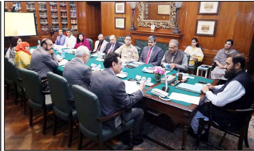
LAHORE: Chancellor/Governor Punjab; Muhammad Balighur Rehman chaired a meeting regarding Consortium on Drugs and Narcotics here at Governor House.

He said that the Vice Chancellors should take measures to provide a safe, healthy and conducive academic environment to the students, teachers and other employees of the University. Governor Punjab directed that vice chancellors should ensure the establishment of anti-drug and tobacco committee under Drug and Narcotics Consortium in universities. The Punjab Governor said that the university security staff should maintain close liaison with the law enforcement agencies to prevent the supply of drugs in the universities.