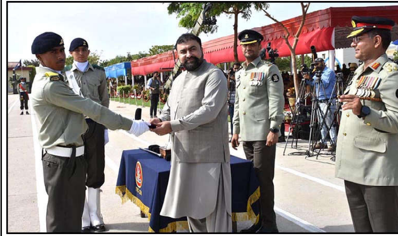
KARACHI: Caretaker Federal Minister for Interior Sarfraz Ahmed Bugti distributing awards during the passing out ceremony of Basic Recruit Course of Pakistan Coast Guard.

They expressed satisfaction at the convergence of views on all major regional and global issues.