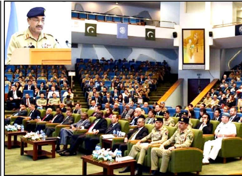
Chief of the Army Staff, General Asim Munir addressing participant of a meeting held to review the preparations regarding the ministerial meeting of the United Nations peacekeeping mission.

He paid tributes to the brave men and women who sacrificed their lives in the noble cause of peacekeeping, including 171 Pakistanis.