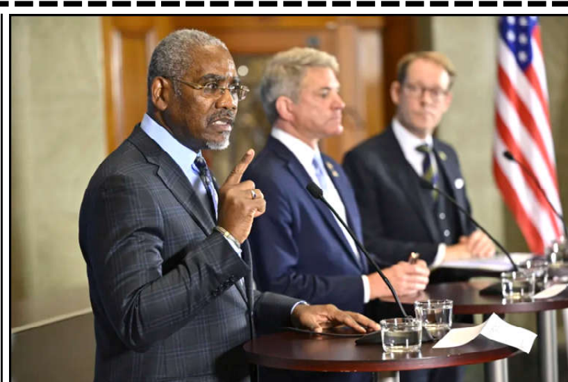
Foreign Minister Tobias Billström, background, listens during a press briefing together with US congressmen Michael McCaul, centre and Gregory Meeks, in Stockholm.

China rejects Western trade and financial sanctions on Russia because they weren't authorized by the United Nations Security Council, where Beijing and Moscow have veto power. However, China has appeared to avoid directly defying those sanctions. McCaul, who was part of a U.S. congressional delegation visiting Sweden and met with Foreign Minister Tobias Billström, said he expects the Nordic country to join NATO by October. Long-neutral Sweden applied for NATO membership together with neighboring Finland in 2022. New entries must be approved by all existing members, and as NATO leaders met for a summit in Vilnius, Lithuania, Sweden was missing the green light from two: Turkey and Hungary. Finland, which shares a 1,340-kilometer (832-mile) border with Russia—more than doubling the length of NATO's border with Russia—became the 31st member of the world's biggest military alliance in April.