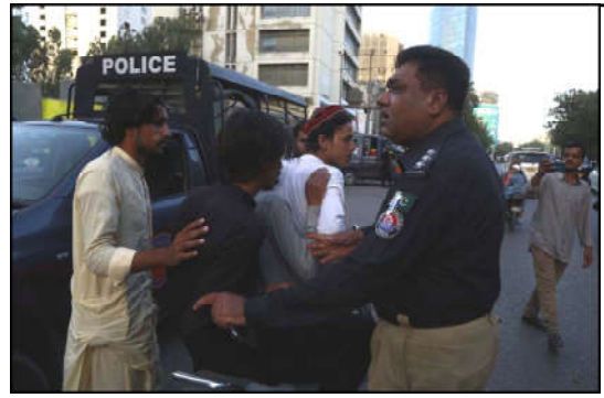
KARACHI: Police officials are arresting the activists of Pashtun Tahafuz Movement (PTM) from redzone area, who were gathered to attend the protest against the arrest of their leaders in Islamabad, in Karachi.

deficit, Haji Ghulam Ali said. "We all have to jointly play a role to get the universities out of these difficulties and move towards improvement and most of the responsibility falls on the vice chancellors and management of the university to minimize the costs and increase the resources," he added. Find alternative ways to create links with industries and commercialize research so that universities can stand on their own feet, the Governor said, while addressing a meeting held regarding financial resources of universities, research commercialization and bringing universities out of financial deficit.