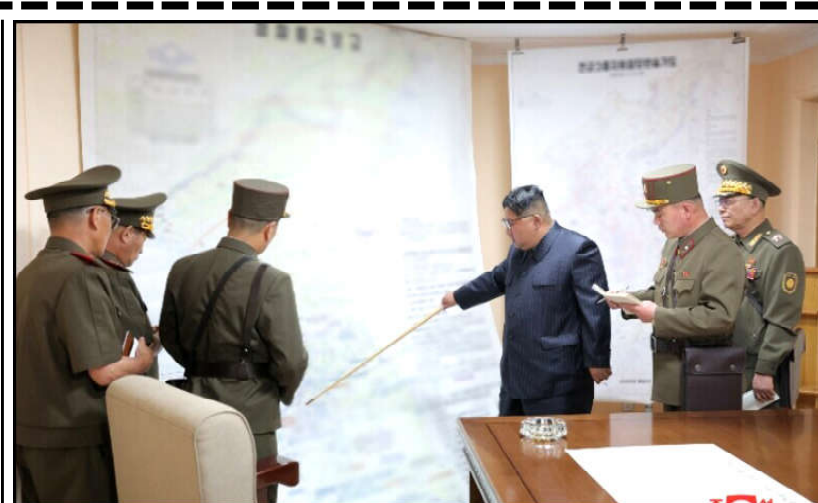
North Korean leader Kim Jong visits the training center of the General Staff Department of the Korean People's Army (KPA) in an undisclosed location in North Korea in this picture released by North Korea's Korean Central News Agency (KCNA).

The State Department did not formally announce the aid or give details, but a person familiar with the notice said the assistance would involve support to improve awareness at sea.