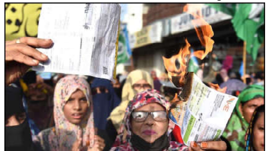
KARACHI: Activates of Jamaat e Islami Women wing hold protest against over electricity bill charges.

The minister said extraordinary security measures were being ensured on the occasion of Chehlum of Hazrat Imam Hussain (A.S). The security at the main processions and Majalis venues will be made foolproof and coordinated in consultation with the organisers.