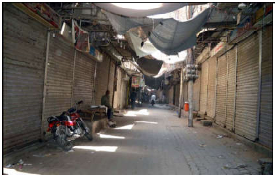
MULTAN: View of business activities seen closed while market gives desert look during the shutdown strike called by trader community against inflation price hiking and the highly inflated electricity bills, in Multan.