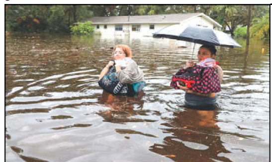
A girl and her mother wade through floodwaters after evacuating their home in Tarpon Springs, Florida, when Hurricane Idalia made landfall.

Three other trackers contacted by Reuters had similar estimates. The United States is in talks with Iran over a potential agreement in which five U.S. citizens would be released by Iran and $6 billion in Iranian funds in South Korea would be unfrozen. White House National Security Adviser Jake Sullivan has declined to offer a timeline on a deal.