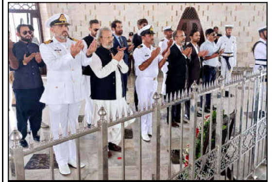
KARACHI: Caretaker Federal Minister for Education and Professional Training, Madad Ali Sindhi offering Dua after laying floral wreath during visit of Mazar-e-Quaid.