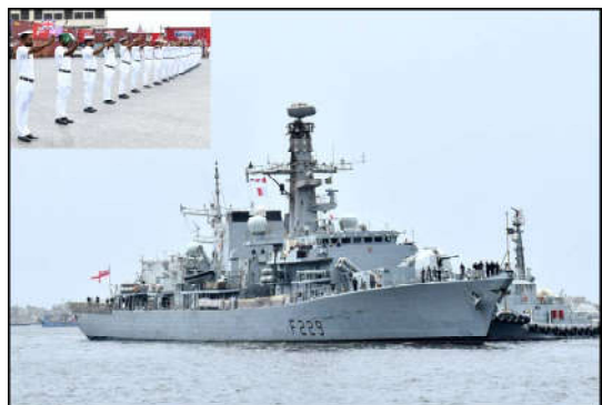
UK Ship HMS LANCASTER arrives at Karachi port.