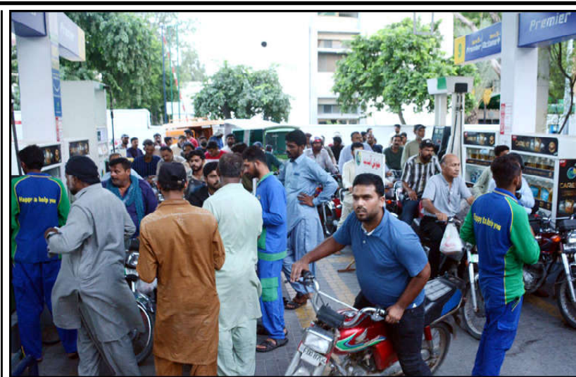
FAISALABAD: A view of the hustle of bikers at fuel station after the news of the price hike of petroleum products in City.

The price of gold in the international market, however, increased by $7 to $1,945 from $1,938, the Association reported.