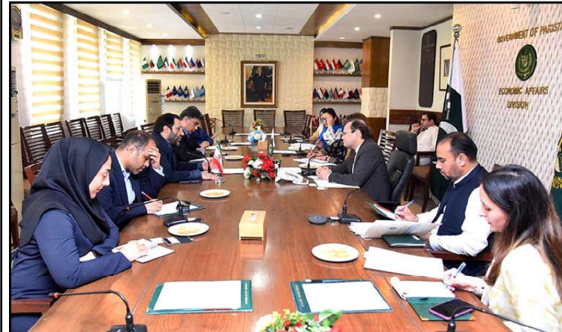
ISLAMABAD: Iranian Deputy Minister for Economics and Finance calls on the Acting Secretary Ministry of Economic Affairs.

He said cross-border smuggling of basic items of necessity will not be tolerated, adding that action may be initiated against those involved in illegal smuggling and their facilitators.