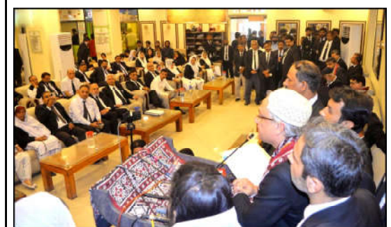
HYDERABAD: Sindh Law Minister Umer Soomro addressing to the members of Hyderabad District Bar.

All the issues including quality of education and shortage of resources were discussed in detail in the meeting and a series of engagements would continue he would also pay visits to the universities to review the situation and find solutions, the minister added.