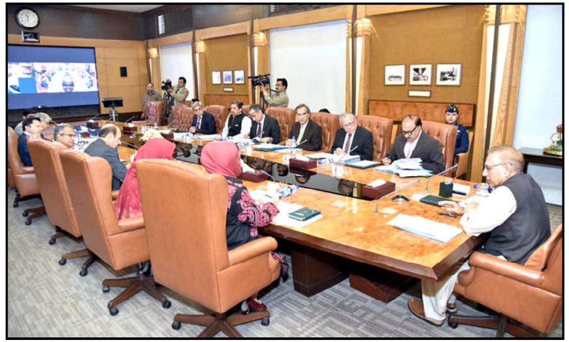
ISLAMABAD: President Dr Arif Alvi chairing the 23rd meeting of the Board of Governors of the National School of Public Policy, at Aiwan-e-Sadr.

In conclusion, they also condemned the Jaranwala tragedy in its all forms and manifestations and urged the government to bring the culprits to justice without any delay.