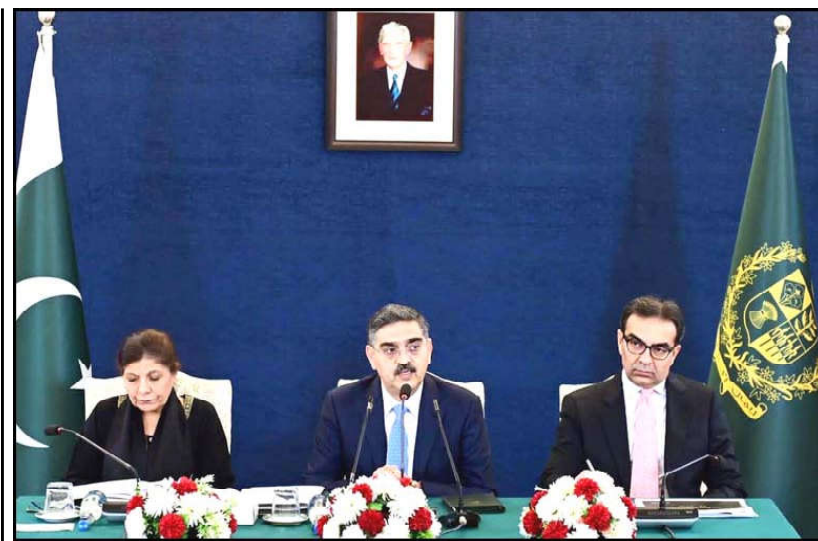
ISLAMABAD: Caretaker Prime Minister Anwaar-ul-Haq Kakar talking to Anchors and Journalists in a meeting at the Prime Minister's House.

He made it clear that the government would fulfill its agreements with the international financial institutions.