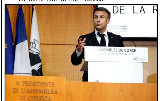
French President Emmanuel Macron addresses the Corsican Assembly in Ajaccio, as part of a three days visit in the southern French island of Corsica.

Explosions continued to ring out in the hours after the blaze broke out as emergency crews tackled the fire and ambulance staff worked to evacuate those injured, an AFP journalist at the scene witnessed.