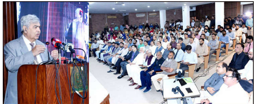
Caretaker Minister for National Food Security and Research Dr. Kausar Abdullah Malik is addressing a workshop on Climate-Resilient High Yielding and Quality Rice Development at National Agriculture Research Centre (NARC), Islamabad.

Similarly, fiscal performance remains satisfactory at the start of FY2024. It is expected that the economic revival plan and prudent actions - policies including SIFC and IT policy - will attract new investments to create a multiplier effect in the economy for higher and inclusive economic growth in FY2024 and further in the medium term.