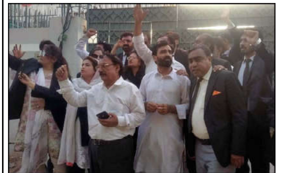
KARACHI: Members of Insaf Lawyers Forum are holding protest demonstration against high handedness of police department, held at Insaf House in Karachi.