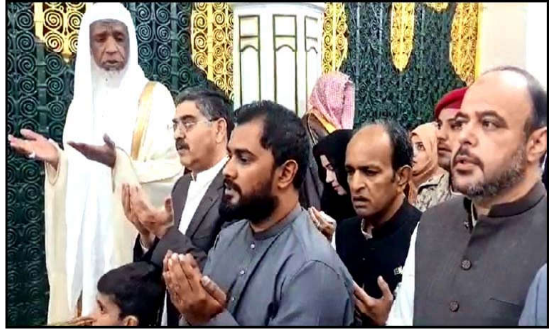
MADINAH MUNAWRAH: Caretaker Prime Minister Anwaar-ul-Haq Kakar visited Masjid-e-Nabvi (the Prophet's Mosque) in Madinah and paid his respects at Roza-e-Rasool (SAWW).

mentation report from federal government on decision in Tehreek Labaik Pakistan (TLP) 2017 Dharma case while hearing review petition against the decision Thursday. The court while adjourning the hearing of case till November 01 sought written replies from the lawyers of the respondents till October 27. The court remarked all respondents were not present today. Another chance is given to respondents in connection with attendance.