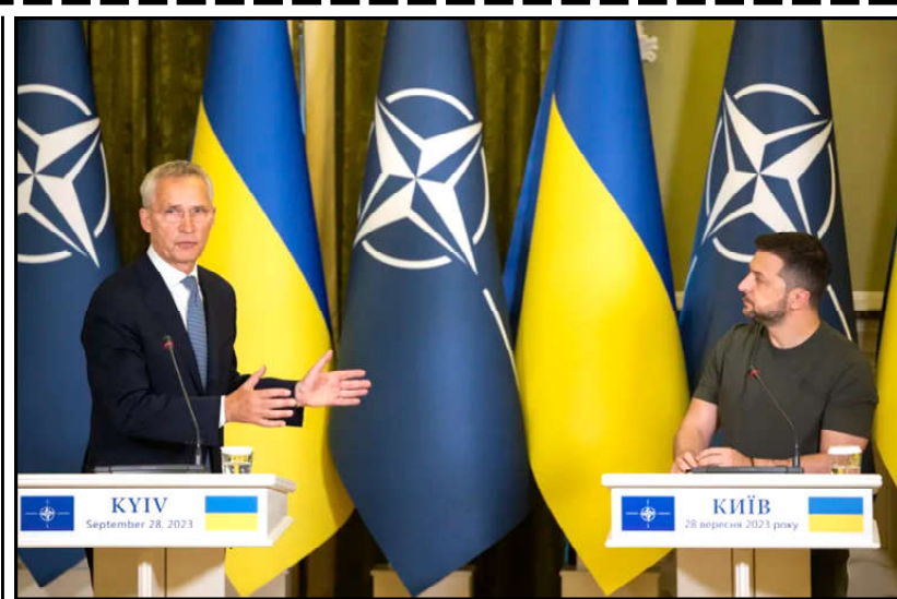
NATO Secretary General Jens Stoltenberg and Ukrainian President Volodymyr Zelensky attend their press conference in Kyiv, Ukraine.

"I call on the government of Israel to cease all settlement activity and dismantle outposts immediately, in line with its obligations under international law," he added.