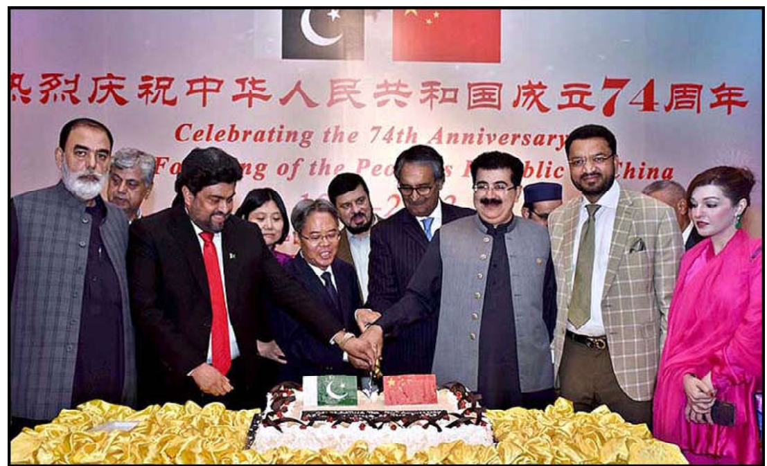
ISLAMABAD: Chairman Senate Sadiq Sanjrani and Ambassador of the People's Republic of China Jiang Zaidong are cutting cake along with other officials on the occasion of the 74th Anniversary of the Founding of the People's Republic of China.

The prime minister, in his message to the nation on Eid Milad-un-Nabi (PBUH) 1445 Hijri, extended his greetings to the whole of the Pakistani nation as well as the Muslim world.