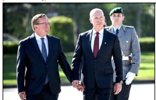
German Federal Minister of Defense Boris Pistorius receives his Israeli counterpart Yoav Gallant with military honors in Berlin, Germany.

Ukraine doesn't have that option. Ukraine's surrender would not mean peace. It would mean brutal Russian occupation. Peace at any price would be no peace at all."