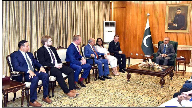
ISLAMABAD: President Dr. Arif Alvi in a meeting with a delegation of the members of the British Parliament and the representatives of the Pakistani and Kashmiri diaspora in the UK, at Aiwan-e-Sadr.