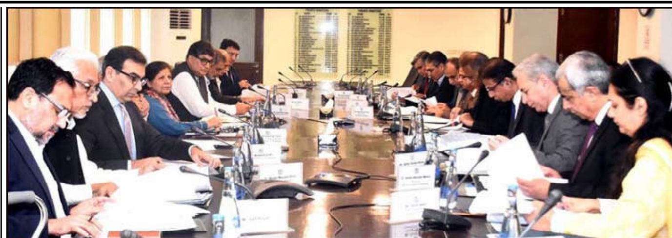
ISLAMABAD: Caretaker Federal Minister for Finance, Revenue and Economic Affairs, Dr. Shamshad Akhtar chaired the Cabinet Committee on State-owned Enterprises (CCSOE) held at Finance Division in Islamabad.