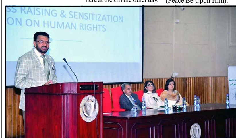
ISLAMABAD: Caretaker Federal Minister for Human Rights Khalil George speaking at "Awareness Raising & Sensitization Session on Human Rights" in National College of Arts.