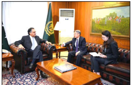
ISLAMABAD: Newly-appointed Chinese Ambassador Jiang Zaidong meeting with Caretaker Foreign Minister Ja'il Abbas Jilani.

Buildings, streets, roads, mosques and houses are being decorated with colourful lights in connection with the auspicious occasion.