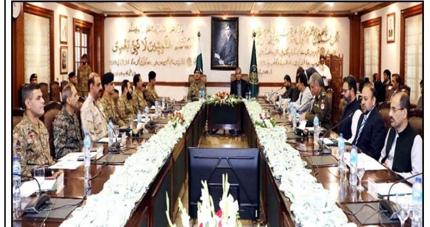
LAHORE: Chief of Army Staff General Syed Asim Munir attending Punjab Apex Committee. Caretaker Chief Minister Mohsin Raza Naqvi is also present.

UK Shadow Minister Andrew Gwynne expressed grave concern over the human rights violations and denial of rights to the people of IIOJK. The torture and brutalities being committed by India are unacceptable, he added.