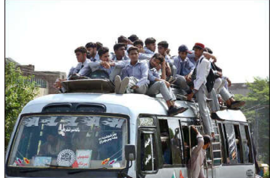
FAISALABAD: Students are engaging in risky behavior by traveling on the rooftop of a passenger bus at Millat Road, which may cause any mishap and needs the attention of concerned authorities.

The caretaker chief minister added that the natural beauty and cultural heritage of the province need to be effectively utilized for tourism. He said that Pakistan and especially Khyber Pakhtunkhwa, has immense opportunities for tourism.