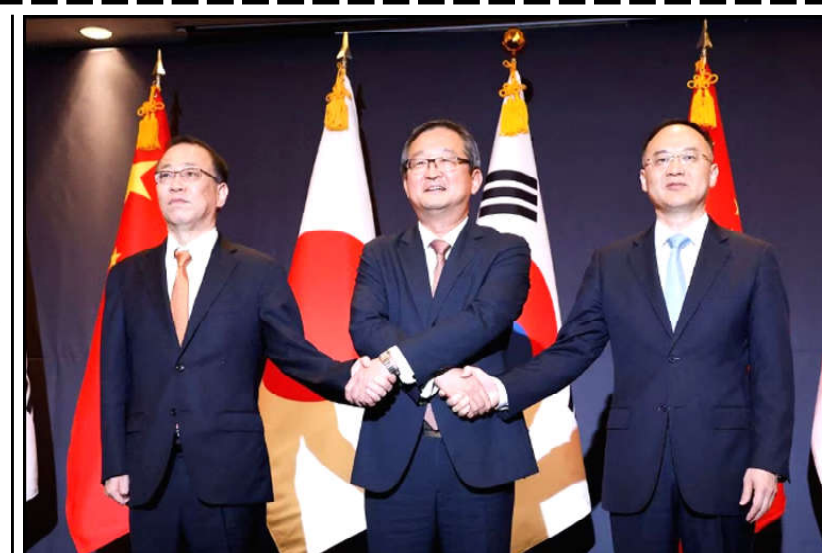
South Korea's deputy foreign minister for political affairs, Chung Byung-won, Japan's Senior Deputy Minister for Foreign Affairs, Funakoshi Takehiro, and China's Assistant Foreign Minister, Nong Rong, pose for photographs during their meeting in Seoul, South Korea.

More are likely to follow after separatist troops agreed to lay down arms and Azerbaijan lifted a 10-month blockade of the road linking the territory to Armenia.