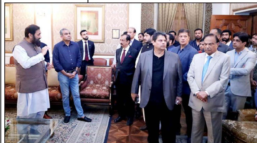
LAHORE: Governor Punjab Muhammad Balighur Rehman inaugurated a guided tour on the occasion of World Tourism Day at Governor House Lahore. Caretaker Chief Minister Punjab Mohsin Naqvi and members of the Caretaker Cabinet are also present on this occasion.

"We saw the fire pulsating, coming out of the hall. Those who managed got out and those who didn't got stuck. Even those who made their way out were broken," said Imad Yohana, a 34-year-old who escaped the inferno.