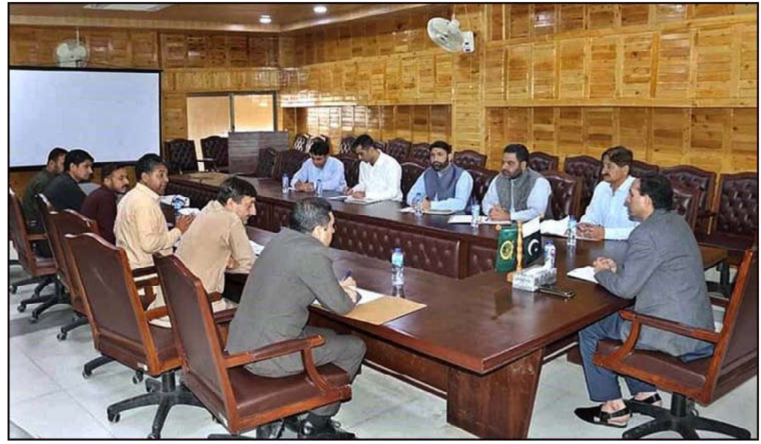
GILGIT: Speaker Gilgit-Baltistan Assembly Nazir Ahmad Advocate chairing a meeting regarding NATCO issues at Assembly Secretariat.

Promptly addressing the issue, Chief Minister Mohsin Naqvi immediately summoned the Secretary Schools Education and EDO Schools. On the instructions of Chief Minister, Provincial Minister School Education Mansoor Qadir also reached the school. Chief Minister also ordered to buy new computers and increase the number of lights and fans in the classrooms. He further emphasized the need for a fresh coat of paint and the assurance of basic amenities in the classrooms. The Chief Minister paid visits to the principal's office and the staff room.