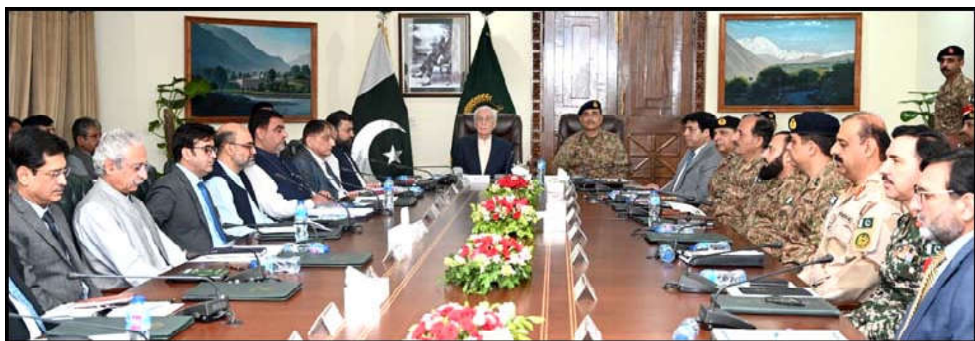
PESHAWAR: Army Chief General Syed Asim Munir attending meeting of Provincial Apex Committee.

Vol. XIII No. 279 Reg. mails-B / ID-445 Thursday September 28, 2023, Rabi-ul-Awwal 11, 1445 A.H. Ph: 2158688, 2158997 Pages 4: Rs. 12