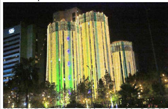
ISLAMABAD: An eye catching view of the OGDCL Tower illuminated with colorful decoration lights for the celebrations for Eid-e-Milad an-Nabi with great Zeal in Federal Capital.