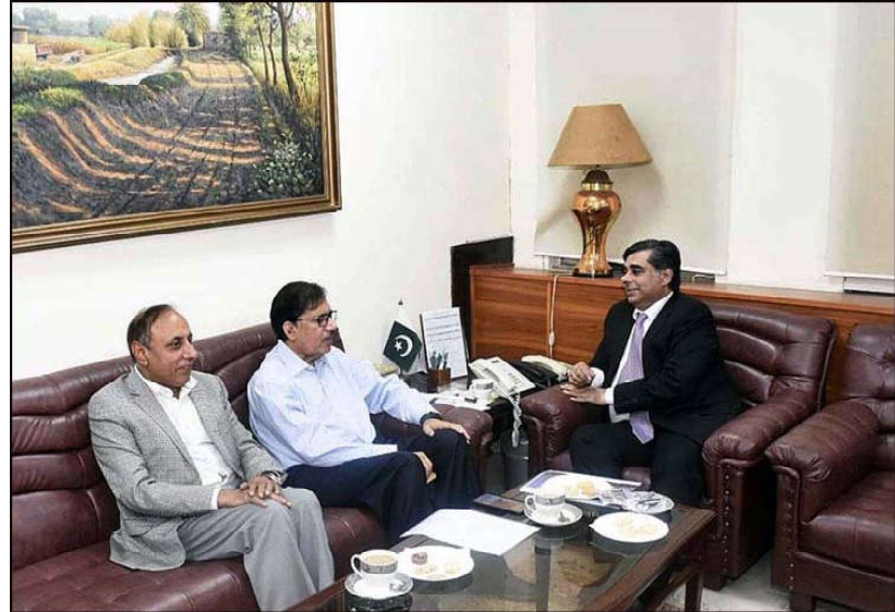
ISLAMABAD: CEO National Steel along with delegation from the steel industry called on Federal Minister for Commerce, Industries, Production, Dr. Gohar Ejaz at the Commerce Ministry.