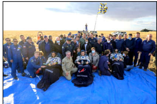
International Space Station (ISS) crew members, Roscosmos cosmonauts Sergey Prokopyev, Dmitry Petelin and NASA astronaut Frank Rubio, rest in chairs after landing in the Soyuz MS-23 space capsule in a remote area near Zhezkazgan, Kazakhstan.