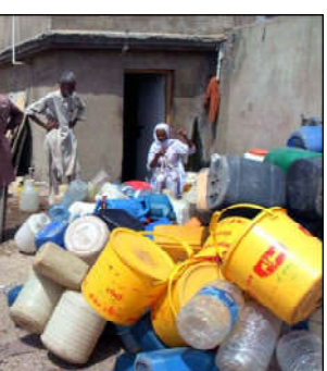
KARACHI: People are filling their water cans from public tap as they facing shortage of drinking water in their area, at Lyari area in Karachi.