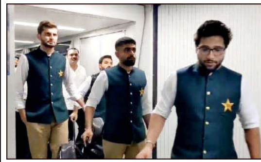
HYDERABAD: Pakistan cricket team landed in India's Hyderabad to participate in the ICC World Cup 2023

The World Cup is scheduled to take place from Oct 5 to Nov 19 in India. Pakistan's opening match in the tournament is set for Oct 6 against the Netherlands in Hyderabad, while the highly anticipated match against arch-rivals India will take place in Ahmedabad on Oct 14.