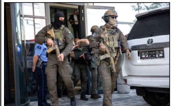
Kosovo police members of Special Intervention Unit escort one of the arrested Serb gunmen out of the court after the Kosovo shootout in capital Pristina.

not the only, headwind is Russia's war of aggression against Ukraine, and how China positions itself on this issue," he said. Dombrovskis spoke before high-level economic and trade talks with Chinese Vice Premier He Lifeng. EU leaders have expressed concern about the bloc's growing trade deficit with China, which reached 396 billion euros last year. European Commission President Ursula von der Leyen recently announced an investigation into Chinese subsidies to electric vehicle makers, saying a flood of cheaper Chinese cars is distorting the European market.