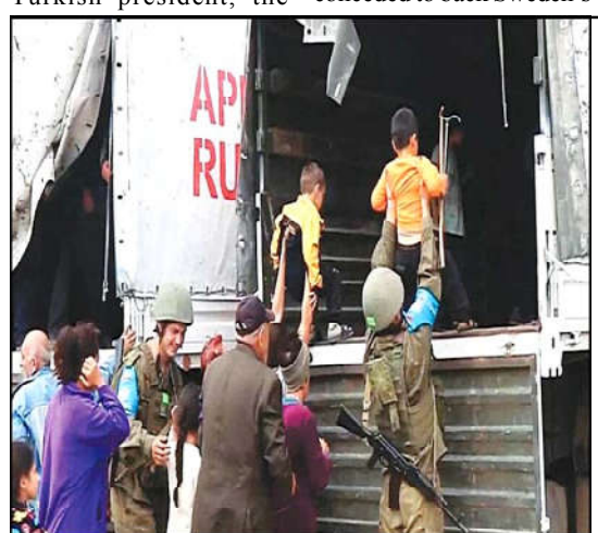
KHANKENDI: In this videograb released by the Russian Defence Ministry, Russian peacekeepers help evacuate refugees from this town, also called Stepanakert.