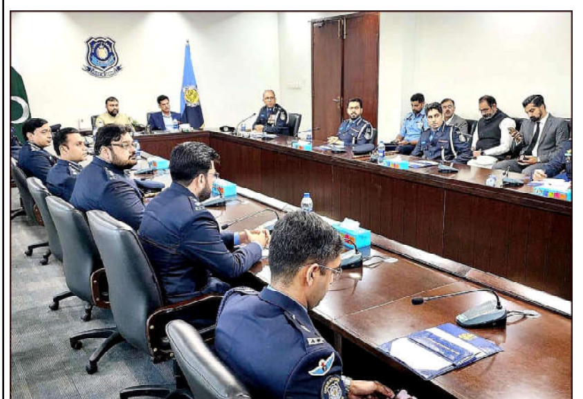
ISLAMABAD: Caretaker Federal Minister for Interior Sarfraz Ahmed Bugti chairing briefing at CPO Office