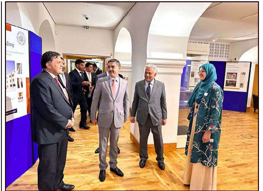
Caretaker Prime Minister Anwaar-ul-Haq Kakar visits the Oxford Centre for Islamic Studies

Kakar said the International Monetary Fund (IMF) deal was an opportunity for the country to focus on how the economic behaviour was influencing the life of the common man in Pakistan.