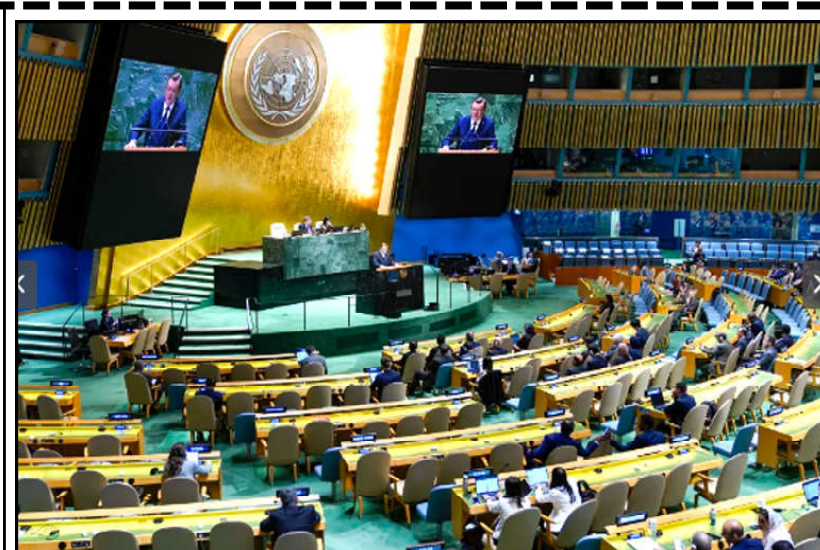
Belarus Foreign Minister Sergei Aleinik addresses the 78th session of the United Nations General Assembly.

bid and forward it to the Turkish parliament on July 10 after meeting NATO Secretary General Jens Stoltenberg and Swedish Prime Minister Ulf Kristersson. A day after the announcement, the Biden administration said that it would move forward with the sale of F-16s to Turkey. Ankara requested to buy $20 billion of F-16 aircraft and nearly 80 modernization kits for its existing warplanes from the U.S. in October 2021. Since then, neither the ratification of Sweden's NATO bid nor the sale of the jets have been finalized.