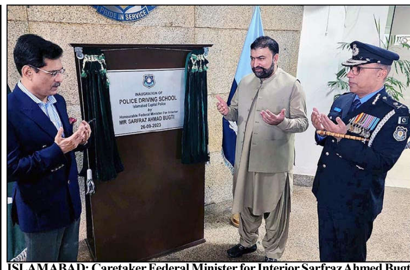
ISLAMABAD: Caretaker Federal Minister for Interior Sarfraz Ahmed Bugti inaugurating the First Police Driving School for Women.