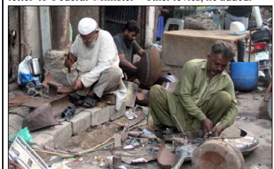
KARACHI: An iron smiths are busy in their work at shop in Eid Gah area in Provincial Capital.

Moreover, a massive volume of smuggled Plastics from neighbouring countries and misdeclaration in terms of value and quantity have caused losses of Rs10 to 12 billion in just three months on account of Customs Duty, Sales Tax, WHT and other levies, he added.