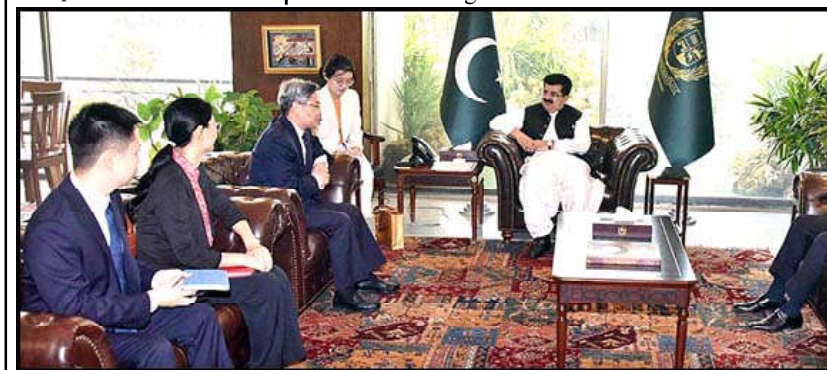
ISLAMABAD: Chinese Ambassador to Pakistan, Jiang Zaidong calling on Chairman Senate of Pakistan Muhammad Sadiq Sanjrani at the Parliament House.

much as you have political stature. here did Nawaz Sharif go from airport? It is neither your problem nor your decision. Use your force and preparation to give security and peace to people."