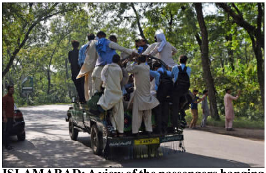
ISLAMABAD: A view of the passengers hanging and stand on the sides of the pickup vehicle without any safety at the mountaineer area of the Margala Hills, which may cause any incident any time, needs the attention of concern authority.

The DG highlighted ongoing operations against encroachers in G-14/1 and informed about the initiation of tendering processes, paving the way for imminent development work. Additionally, 2000 plots have already been handed over.