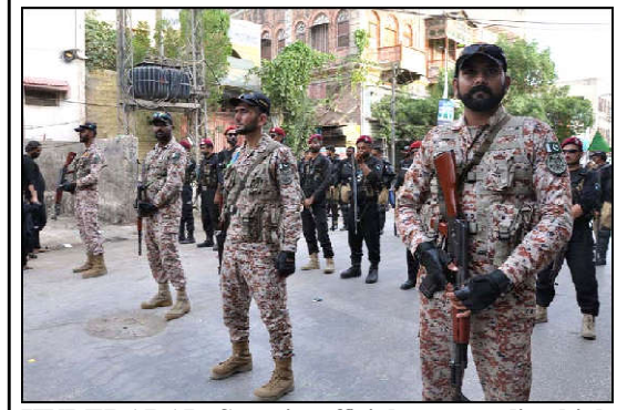
HYDERABAD: Security officials are standing high alert to avoid untoward incident during the Shiite procession of Chup-Iazia on the occasion of 8th Rabi-ul-Awwal every year to commemorate the death of Hazrat Imam Hasan al-Askari (R.A), in Hyderabad.

LAHORE (INP): The Drug Regulatory Authority of Pakistan (DRAP) on Monday launched a crackdown against medicine distributors amid the rising cases of vision loss due to the use of substandard injections in Punjab, says in media reports. Initially, it was reported that the eyesight of over 400 diabetes patients was affected in Punjab after which the provincial caretaker government imposed a two-week ban on Avastin's sales.