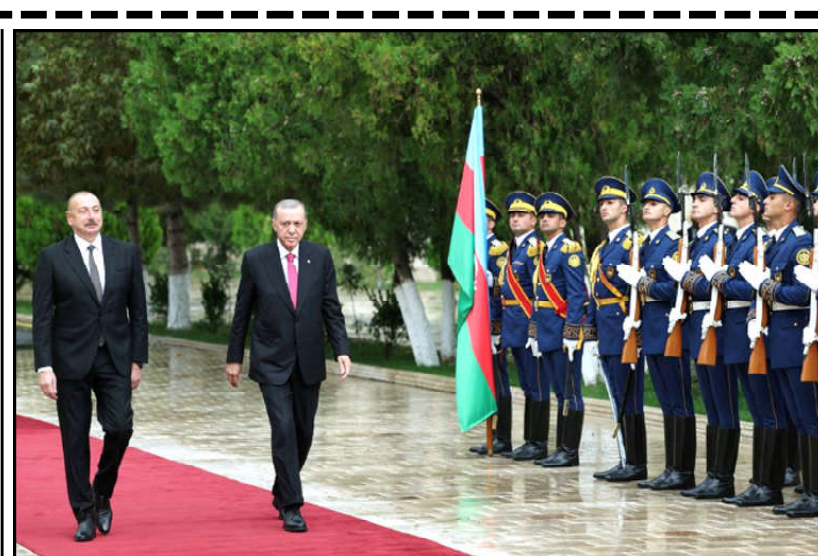
Turkish President Tayyip Erdogan and Azerbaijani President Ilham Aliyev attend a welcoming ceremony in Nakhchivan, Azerbaijan.

said should have been territory belonging to the Azerbaijani Soviet republic as land belonging to the Armenian Soviet republic. "The land link between the main part of Azerbaijan and Nakhchivan (the exclave) was thus cut off," complained Aliyev. An influential telegram channel linked to Karabakh Armenians called "Republic of Artsakh" said Aliyev's words looked ominous. "The new target of Azerbaijan and Turkey is Syunik (a province in southern Armenia through which such a corridor would pass). They are already openly declaring it. Active preparations for war are underway," it said.