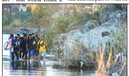
Migrants walk along razor wire looking for a place to cross the Rio Grande river, near the US-Mexico border.

Monitoring Desk MITROVICA: Gunmen in armoured vehicles stormed a village in an ethnic Serbian-majority region of Kosovo on Sunday, battling police and barricading themselves in a monastery in a resurgence of violence in the restive north. Kosovo police said one officer and three of about 30 attackers died in shootouts around the village of Banjska. Monks and pilgrims were locked in the Serbian Orthodox monastery's temple as the siege raged for hours. Ethnic Albanians form the vast majority of the 1.8 million population of Kosovo, a former province of Serbia. But some 50,000 Serbs form the majority in the north, where clashes in May injured dozens of protesters and Nato alliance peacekeepers. The Serbs have never accepted Kosovo's 2008 declaration of independence and still see Belgrade as their capital more than two decades after a Kosovo Albanian guerrilla uprising against repressive Serbian rule. It was unclear who was behind Sunday's violence, but Kosovo's Prime Minister Albin Kurti and Interior Minister Xhelal Sveclla blamed "Serbia-sponsored criminals".