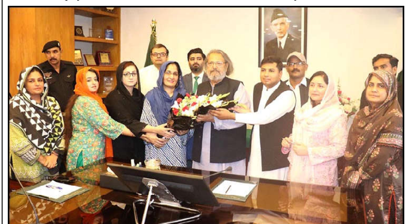
ISLAMABAD: A delegation of daily wagers met the Caretaker Federal Minister for the Ministry of Education and Professional Training Madad Ali Sindi and thank to him for resolving all of their issue.

This means that overseas Pakistanis can access a wide range of services at the support desks, from all levels of government. This significant move is expected to increase the trust that Overseas Pakistanis have in the government, adding said it will also help to make it easier for Overseas Pakistanis living to access government services with ease. The support desks are located in ICT's Offices at G-11/4 and CDA's building at G-7/2 Islamabad, which will be open to all Overseas Pakistanis, regardless of where they live in the world.