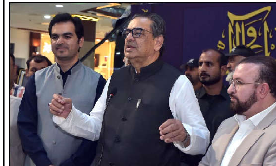
ISLAMABAD: Caretaker Federal Minister for Interfaith Affairs Aneeq Ahmed addressing during the exhibition of calligraphy artworks in Centaurus Mall.

Alameen Authority here. During the visit, he also met the authority's Chairman Khurshid Ahmad Nadeem. Madad Ali Sindhi said the authority's mandate was critical for nation building. The minister said that the Pakistani nation was facing challenges that could only be addressed by the authority.