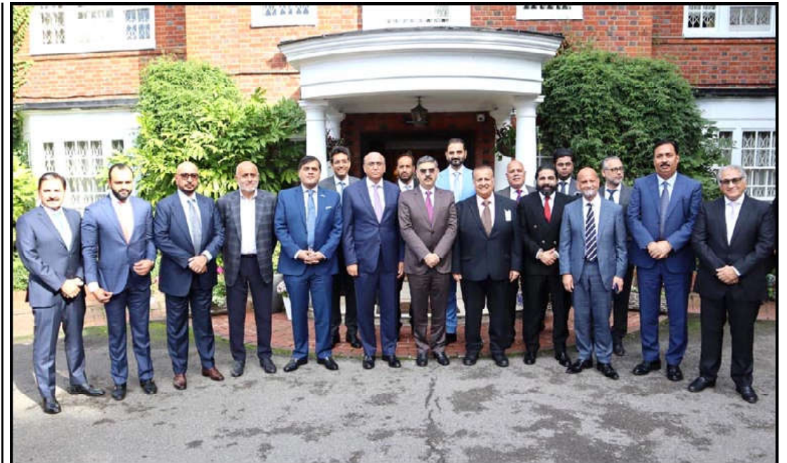
LONDON: A delegation of prominent British Pakistani businessmen call on the Caretaker Prime Minister Anwaar-ul-Haq Kakar.

who is dealing with governance has to rely on it to meet the challenges. Talking about terrorist attacks and relations with Afghanistan, the Prime Minister said we have been facing such attacks almost for fifteen years and we are trying to counter it by kinetic and non-kinetic measures and we have been successful to manage that to a certain level. He said we are dealing with different layers of authorities in Afghanistan and some are spoiling the peace. He said some banned organizations like TTP have training camps in Afghanistan, which is a point of concern for us.