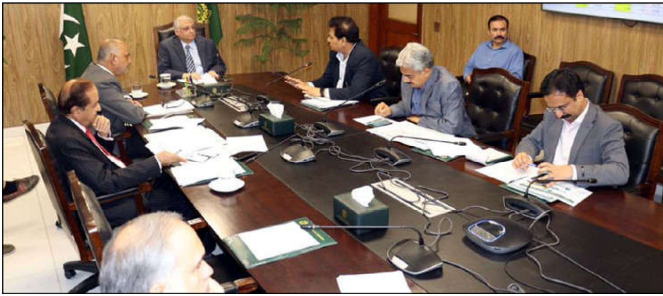
ISLAMABAD: The Caretaker Minister for Planning Development and Special Initiatives Muhammad Sami Saeed chairing a meeting of National Price Monitoring Committee to review the prices of essential commodities