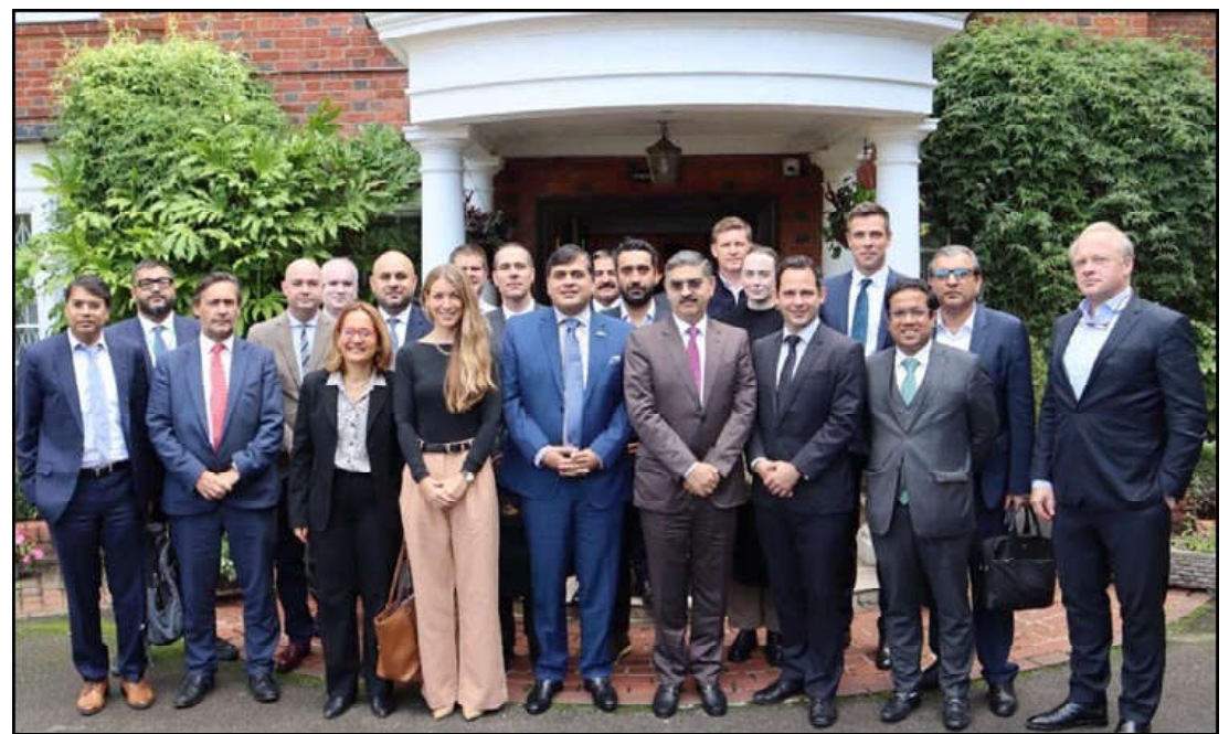
LONDON: Senior leaders of London's capital and financial market cell on the Caretaker Prime Minister Anwaar-ul-Haq Kakar.

improvements such as reduced inflation with expected sustained decline, and upcoming growth in agriculture and industry. He mentioned improved trade after removal of restrictions on imports and fiscal measures for monetary support and medium-term inflation targets. The prime minister highlighted Pakistan's pro-investment efforts, introducing the Special Investment Facilitation Council (SIFC). This initiative, led by the prime minister himself.