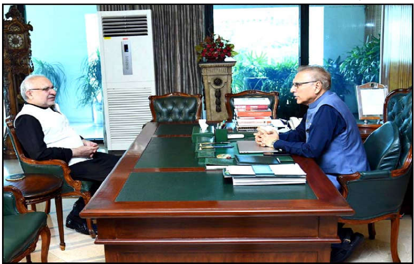
ISLAMABAD: President, Dr. Arif Alvi exchanging views with Muhammad Ali Durrani, Former Senator and Federal Minister during meeting held at Aiwan-e-Sadr in Islamabad.