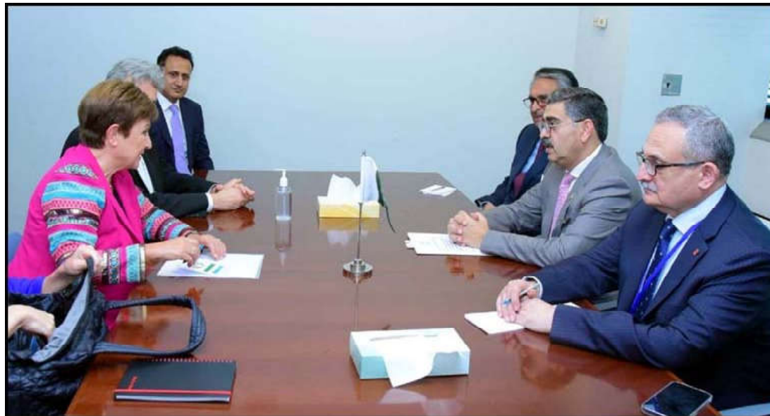
NEW YORK: Caretaker Prime Minister, Anwaar-ul-Haq Kakar in a meeting with Kristalina Georgieva, Managing Director of International Monetary Fund (IMF) on the sidelines of the 78th session of the United Nations General Assembly (UNGA), in New York.

cut-off date suggested by President Arif Alvi by more than two months. In a statement, the election commission said that it reviewed work on delimiting constituencies and decided that the initial list for the delimitation of constituencies would be published on September 27. After hearing objections and suggestions regarding the exercise, the final list would be issued on November 30, the commission said. It said that polls would be held in the last week of January following the completion of a 54-day election campaign programme. The announcement comes a day after the ECP said it had scheduled a meeting with political parties next month to discuss the code of conduct for general elections. According to the ECP, a draft code of conduct has been shared with political parties to get their feedback before finalising the rules of the game.