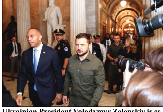
Ukrainian President Volodymyr Zelenskyy is escorted by Minority Leader of the U.S. House of Representatives Hakeem Jeffries as he arrives to meet privately with House Speaker Kevin McCarthy (R-CA) and other congressional leaders on a visit to the U.S. Capitol in Washington.