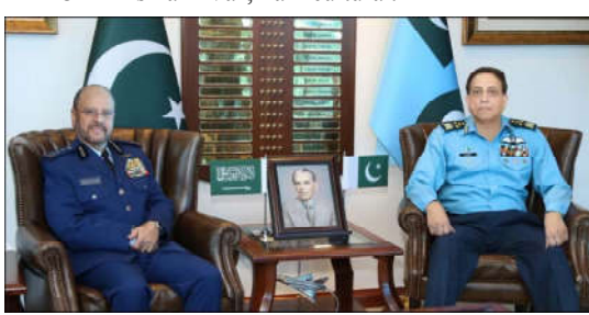
ISLAMABAD: Chief of General Staff Saudi Armed Forces, General Fayyadh bin Hamed Al-Ruwaili meeting with Chief of the Air Staff, Air Chief Marshal Zaeher Ahmed Baber Sidhu at Air Headquarters.

ISLAMABAD (APP): smartly turned-out contingent of Pakistan Air Force presented General Fayyadh bin Hamed Al-Ruwaili on Thursday called on Chief of the Air Staff, Air Chief Marshal Zaeher Ahmed Baber Sidhu here at Air Headquarters. Leading a high level delegation, the Saudi Chief of General Staff expressed his admiration for the exceptional progress made by the Pakistan Air Force (PAF), particularly in the area of indigenization and lauded the professionalism of PAF personnel during the meeting whereas the delegation also underscored discussion on several key areas of mutual interest, defence co-operation and geo-strategic situation, a PAF news release said. On his arrival, a