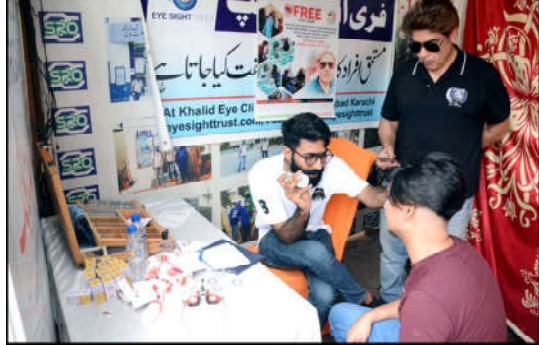
KARACHI: Patients are sitting after operation during the three-day free eye medical camp organized by Pakistan Insaan Dost Party, at Saddar Regal Chowk in Karachi.