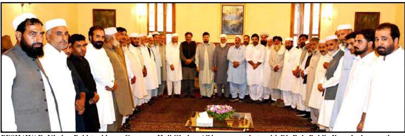
PESHAWAR: Khyber Pakhtunkhwa Governor Haji Ghulam Ali in a group photo with Dir Bala Public Jirga during meeting at Governor House.

this incident had exposed India's darker side, as well as the malicious intentions of the Modi government. Mushaal claimed that the Indian government was not only supporting terrorists but also promoting terrorism to suppress the movements for Khalistan and Kashmir freedom. She emphasised that Kashmiris had been struggling for their right to self-determination for the past 75 years, while India continued to use force to deny them their fundamental and constitutional rights. She expressed regret over the silence of the world's human rights advocates on the pressing issue, describing it as deeply unfortunate.