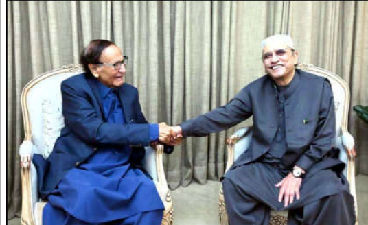
LAHORE: Peoples Party (PPP) President, Asif Ali Zardari exchanging views with Chaudhary Shujaat Hussain, Chief of Muslim League (PML-Q) during meeting held in Lahore.

ISLAMABAD (APP): Pakistan and China have reiterated their strong resolve to further enhance the existing excellent cooperation between the two countries. This was expressed in a bilateral meeting between caretaker interior minister Sarfraz Ahmed Bugti and his Chinese counterpart Wang Xiao Hong, Member of the Secretariat of CPC Central Committee, State Councilor and Minister for Public Security in Lianyungang City on the occasion of Global Public Security Cooperation Forum 2023 here Thursday. Federal Interior Minister, while responding to welcome remarks by the host minister, thanked the Chinese government for their warm welcome and hospitality to Pakistan's delegation. Bugti further said that China was a time tested and all weather strategic friend and expressed profound appreciation on behalf of the government and people of Pakistan for the unwavering and unconditional support of the government and the people of China for Pakistan during all challenges. Sarfraz Bugti briefed the host minister about various steps undertaken by Pakistan to ensure the fool-proof security of Chinese in Pakistan who are working on various projects for a better future of people of Pakistan. The Chinese Minister appreciated the strong resolve of the government of Pakistan and various measures taken by it to counter the threat of terrorism, drugs, and risks to the security of Chinese nationals and installations.