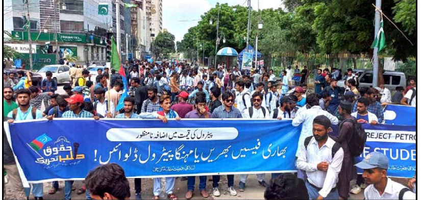
KARACHI: Members of Islami Jamiat Tulba are holding protest demonstration against massive unemployment, increasing price of daily use and petroleum products, inflation price hiking and the highly inflated electricity bills, held at Shaheen Complex in Karachi.