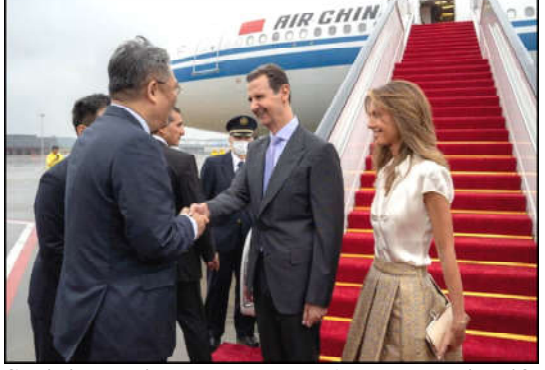
Syria's President Bashar al-Assad and his wife Asma are welcomed upon their arrival at Hangzhou airport.

Monitoring Desk NEW YORK: Canadian Prime Minister Justin Trudeau on Thursday called on India to cooperate with an investigation into the murder of a Sikh separatist leader in British Columbia and said Canada would not release its evidence. Trudeau said on Monday that Ottawa had credible allegations linking Indian government agents to the murder of Hardeep Singh Nijjar in June, prompting an angry reaction from New Delhi. Nijjar, 45, was a Canadian citizen. "We're not looking to provoke or cause problems. But we are unequivocal around the importance of the rule of law and unequivocal about the importance of protecting Canadians," Trudeau told a news conference in New York on the sidelines of the United Nations General Assembly. "That's why we call upon the government of India to work with us to establish processes to discover and to uncover the truth of the matter." Trudeau sidestepped several questions about when Canada might release the evidence it had, saying merely that the decision to share the allegations had not been made lightly.