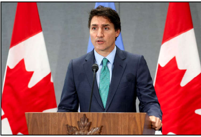
Canadian Prime Minister Justin Trudeau holds a press conference on the sidelines of the UNGA in New York, U.S.

U.N.'s most powerful body. Kim met with Russian President Vladimir Putin in Russia's far east. The two said they may cooperate on defense issues but gave no specifics, which left South Korea and its allies — including the United States — uneasy. "It is paradoxical that a permanent member of the U.N. Security Council, entrusted as the ultimate guardian of world peace, would wage war by invading another sovereign nation and receive arms and ammunition from a regime that blatantly violates Security Council resolutions," Yoon told fellow leaders on the second day of the U.N. General Assembly's annual gathering of leaders. He had been expected to raise the issue. Yoon said that if North Korea "acquires the information and technology necessary" to enhance its weapons of mass destruction in exchange for giving conventional weapons to Russia, that would also be unacceptable to the South. "Such a deal between Russia and the DPRK will be a direct provocation threatening the peace and security of not only Ukraine but also the Republic of Korea."