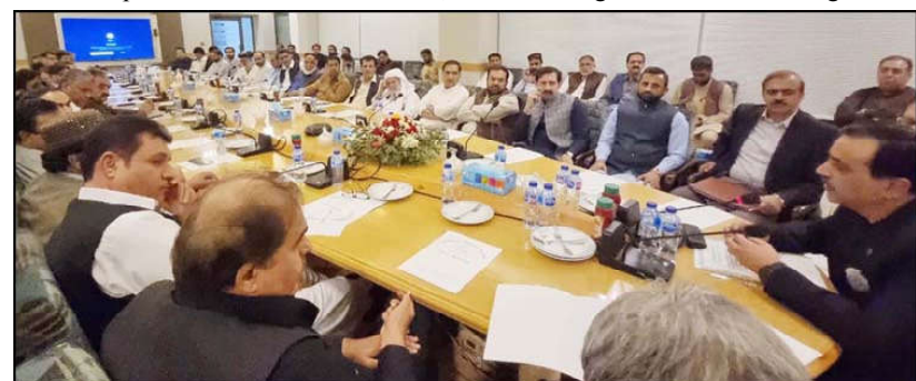
QUETTA: Brigadier Azhar Munir of DHA Quetta addressing during his visit to Quetta Chamber of Commerce and Industry.

The OGRA remains unwavering in efforts to ensure safety, compliance and fairness for all stakeholders and the nation. He urged the public and media to seek accurate information and refrain from spreading harmful misinformation that could damage the reputation of an institution dedicated to safeguarding Pakistan's energy consumers and promoting a responsible oil and gas sector.