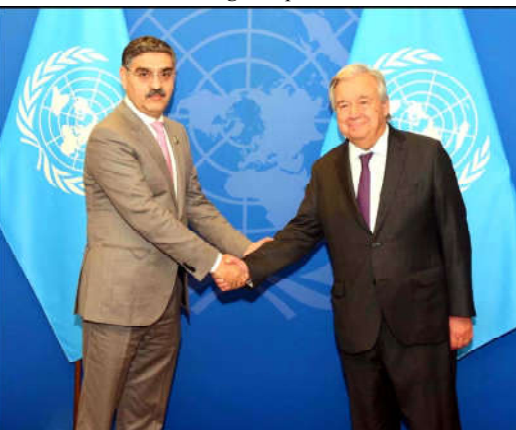
NEW YORK: Caretaker Prime Minister, Anwaar-ul-Haq Kakar meets with Antonio Guterres, Secretary General United Nations on the sidelines of the 78th session of the United Nations General Assembly (UNGA), in New York.

ISLAMABAD (APP): President Dr Arif Alvi has strongly condemned the involvement of India in the murder of Canadian Sikh leader Hardeep Singh Nijjar and urged the world to take serious note of the state-sponsored killing on the Canadian soil. The President in a statement said that it had been the policy of India to persecute and eliminate the leadership of minority groups in India and outside world. He said the brutal murder of the Sikh leader exposed the real face of India that has been intolerant towards the minority groups. The President said that India had unleashed a reign of terror against the Muslims in Indian illegally occupied Jammu and Kashmir (IIOJK) and other minority communities for decades. He regretted that the silence and the inaction of the world over the atrocities being committed by India in the IIOJK and the persecution of minorities and demoralization of their places of worship emboldened India to carry out such operations on foreign soil. The President said it is an open secret that India is the major source of trouble and de-stabilization in the region using the soil of neighboring countries against Pakistan, false flag operations.