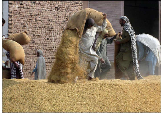
FAISALABAD: Workers spreading the rice crop for drying at a rice warehouse.

Encouragingly, asset quality indicators improved: net non-performing loans (NPLs) to loans ratio lowered to 0.45 percent at end June-23 (0.68 percent in Jun-22) as banks set aside higher amount of provisioning from steady earnings.