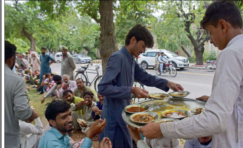
ISLAMABAD: Volunteers are distributing foods among the deserving people at Sector F-7 in Federal Capital.