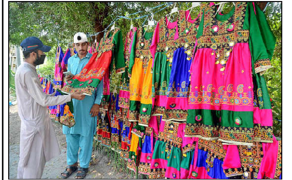
MULTAN: Roadside vendor displaying colorful fancy dresses to attract customers.

The main commodities of exports during August 2023 were Knitwear (Rs. 117,892 million), readymade garments (Rs. 83,447 million), bedwear (Rs. 74,081 million), cotton cloth (Rs. 47,002 million), cotton yarn (Rs.30,793 million), towels (Rs.25,567 million).