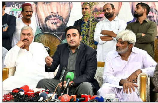
OKARA: Chairman Peoples Party Pakistan Bilawal Bhutto Zardari talking to media persons after visiting the party workers house in City.

OKARA (INP): PPP Chairman Bilawal Bhutto Zardari on Monday said the PPP would deliberate on forming political alliances once the election date is announced. With elections potentially just a few months away, Bilawal has been engaging in public gatherings and organising party meetings as part of the party's electoral preparations of late. Responding to a question while addressing a press conference in Okara, Bilawal said: "Ask me what alliance I'm going for or not [with any other party] when the election schedule is announced." The PPP chairman reiterated his request to the ECP to announce the date for the upcoming polls and their schedule. He added that such a move would address any concern of the PPP or any other party. Bilawal also talked about the party's recent request to co-chairperson Asif Ali Zardari to raise their complaints regarding an "uneven playing field" with all quarters concerned, and requested him to pull through with the responsibility he was given. "Otherwise, I request Zardari sahib to not tie my hands," he added.