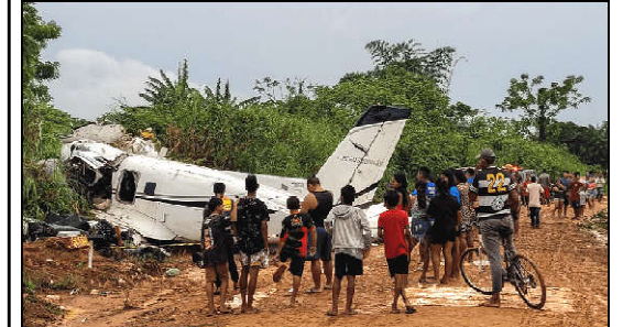
People stand looking at the site where an Embraer EMB-110 aircraft of the Manaus Aerotaxi airline crashed, causing the deaths of 14 people during the plane's landing the previous day at Barcelos airport, about 400 km from Manaus, Amazonas state, Brazil.

Monitoring Desk BRUSSELS: Poland, Slovakia and Hungary announced their own restrictions on Ukrainian grain imports after the European Commission decided not to extend its ban on imports into Ukraine's five EU neighbours. Ukraine was one of the world's top grain exporters before Russia's 2022 invasion reduced its ability to ship agricultural produce to global markets. Ukrainian farmers have relied on grain exports through neighbouring countries since the conflict began as it has been unable to use the favoured routes through Black Sea ports. Ukraine says it will sue Poland, Hungary and Slovakia over food import bans Monitoring Desk KYIV: Ukraine plans to sue Poland, Hungary and Slovakia in the World Trade Organization over bans on Ukrainian agricultural products, Ukrainian officials said on Monday. The appeal could be sent "in the near future", a senior official said and followed a decision by the three countries bordering Ukraine to ban imports of the country's key export commodities. Politico had earlier on Monday quoted Ukrainian Trade Representative Taras Kachka as saying in an interview that Kyiv planned to sue the three countries.