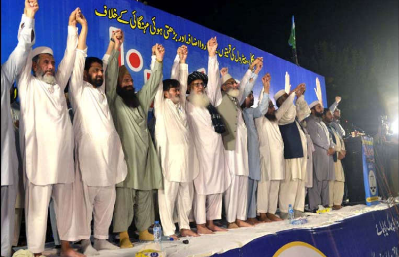
PESHAWAR: Jamat-e-Islami (JI) Chief, Siraj-ul-Haq along with other leaders joint hand with other leaders to express their solidarity during protest demonstration against massive unemployment, increasing price of daily use products, inflation price hiking and the highly inflated electricity bills, held near Governor House building in Peshawar.

PESHAWAR (INP): Jamaat-e-Islami (JI) on Monday staged a sit-in outside the Khyber-Pakhtunkhwa Governor House in Peshawar against the increase in electricity and petroleum prices, as well as rising inflation. The JI workers have also placed containers near a museum located near the Governor House for the party's three-day sit-in. JI's Amir, Sirajul Haq, has also arrived in Peshawar for the sit-in. "Our protest movement is peaceful and not aimed at causing chaos; in-