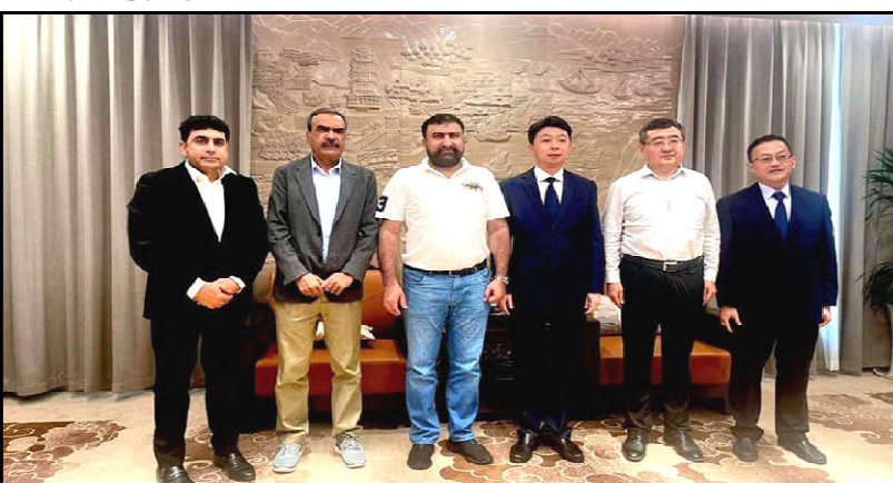
Federal Minister for Interior Sarfaraz Bugti received by Mayor Lianyungang on his arrival to attend 2023 Conference of Global Public Security Cooperation Forum.