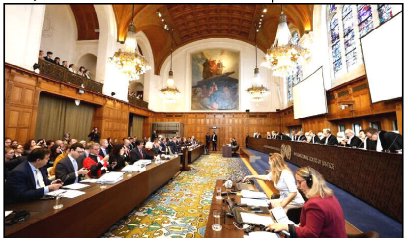
Members of the World Court listen as Russia begins presenting its objections against the jurisdiction of the World Court in a genocide case brought by Ukraine which claims Moscow falsely applied genocide law to justify its February 24, 2022 invasion, in The Hague, Netherlands.