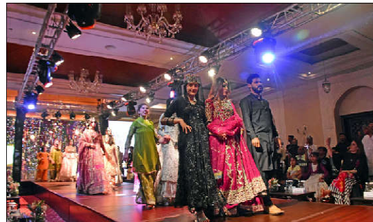
ISLAMABAD: Models are walking on ramp along with Blind and handicapped artists of special Education School during Fashion Show, "Beyond Labels" with the slogan of "Runway for All" at local hotel in Federal Capital.