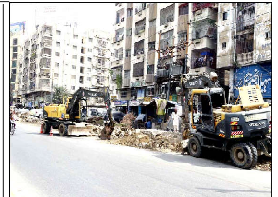
KARACHI: Construction works of new development projects for extending road is underway under the supervision of local government department, as slow pace of construction work is creating problems for commuters due to traffic jam and they demand to concerned department to complete work as soon as possible, located on Shahrah-e-Faisal road in Karachi.