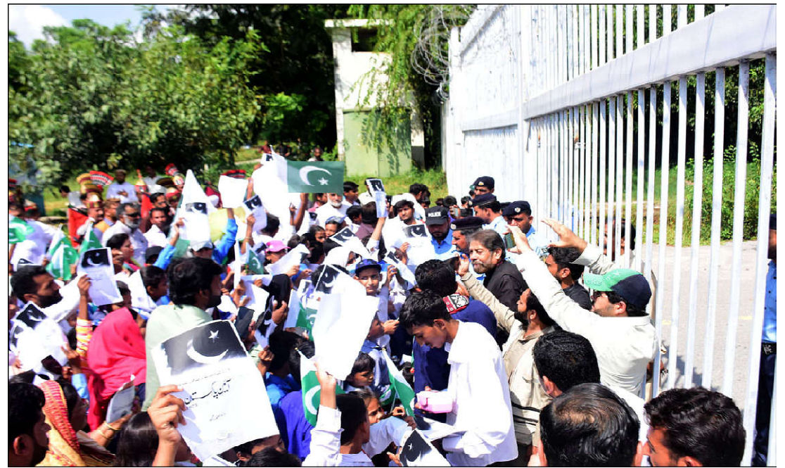
ISLAMABAD: Students of Christen Community hold national flags in their hands during a rally stands in front of closed gate at Agha Khan road, for attending in oath taking ceremony of new chief justice of Pakistan (CJP), in Federal Capital.