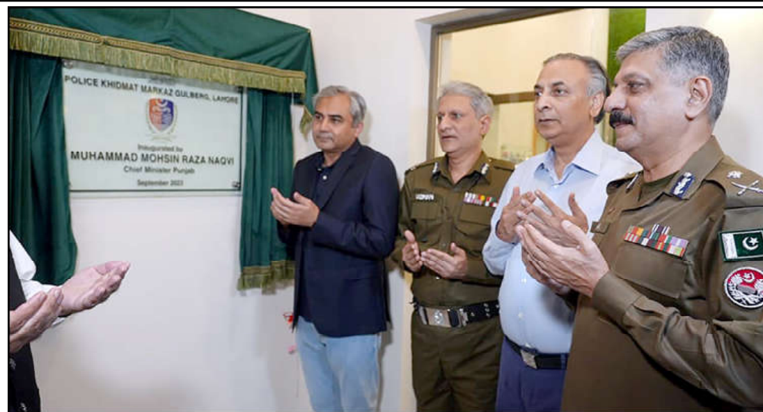
LAHORE: Caretaker Chief Minister Punjab Mohsin Naqvi offering Dua after inaugurating extension project of Police Helpline Centre at Liberty.