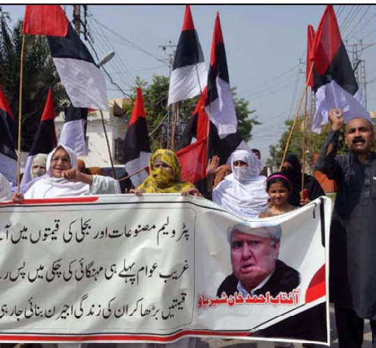
PESHAWAR: Members of Quami Watan Party (QWP Women Wing) are holding protest demonstration against massive unemployment, increasing price of daily use products, inflation price hiking and the highly inflated electricity bills, held at Peshawar press club