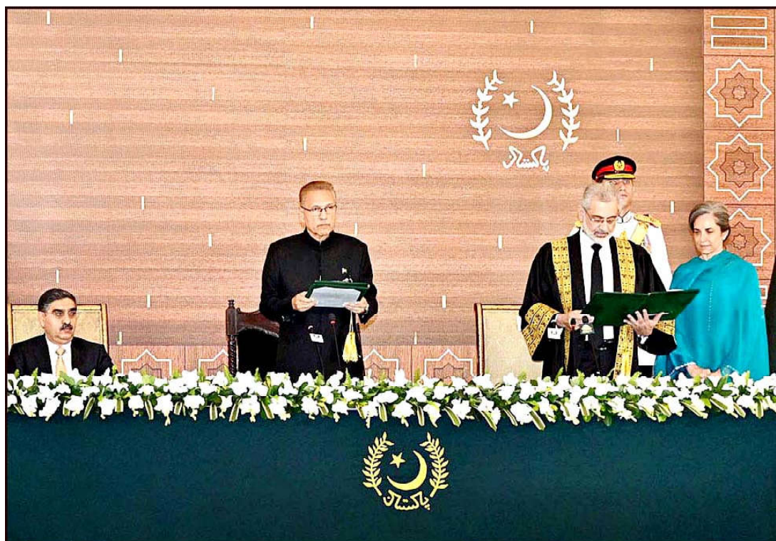
ISLAMABAD: President Dr. Arif Alvi administering the oath of office to Justice Qazi Faez Isa as Chief Justice of Pakistan, at Aiwan-e-Sadr.

ISLAMABAD (INP): Chief Justice of Pakistan Qazi Faez Isa on Sunday constituted full court headed by him for hearing the Supreme Court (Practice and Procedure) Act 2023 on Monday (tomorrow). An eight-judge larger bench of the apex court headed by the former CJP Umar Ata Bandial, had suspended the enforcement of the Supreme Court (Practice & Procedure) Act, 2023 on April 13. Justice Qazi Faez Isa who sworn in as the 29th chief justice of Pakistan today, has constituted bench for the Supreme Court (Practice and Procedure) Act hearing. The Supreme Court (Practice and Procedure) Act 2023 — a bill that required the formation of benches on constitutional matters of public importance by a committee of three senior judges will be heard by a supreme court bench on Monday (tomorrow).