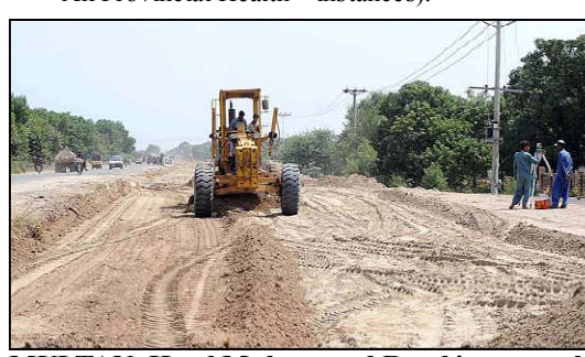
MULTAN: Head Muhammad Road is currently undergoing expansion to ensure smoother traffic flow. This vital route connects several cities in South Punjab, Balochistan, and Khyber Pakhtunkhwa (KPK).