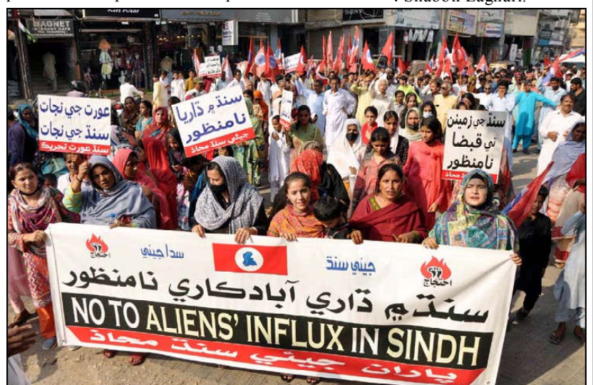
HYDERABAD: Members of Jeay Sindh Mahaz are holding protest demonstration for demanding expelling Afghan refugees from province, held in Hyderabad.