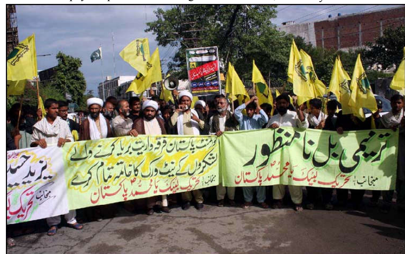
LAHORE: Members of Tehreek e Labbaik Ya Muhammad S.A.W Pakistan are holding protest demonstration against the Criminal Laws (Amendment) Bill 2023, held at Lahore press club.

to enhance bilateral relations and cooperation between their provinces. The meeting highlighted discussions on promoting economic activities, creating business opportunities, and strengthening trade ties to boost national economic stability. Additionally, they delved into the administrative and financial challenges faced by universities in providing quality higher education. The ceremony not only celebrated the cultural diversity and unity of Pakistan but also underlined the importance of collaboration and dialogue between provinces to address common challenges and foster development across the country.