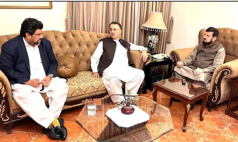
ISLAMABAD: Balochistan Governor Malik Abdul Wali Kakar and Sindh Governor Kamran Tessori participating in the dinner hosted by Khyber Pakhtunkhwa Governor Haji Ghulam Ali.

landscape. Caretaker Foreign Minister Jalil Abbas Jilani during this diplomatic mission, further reinforcing Pakistan's commitment to global cooperation and multilateralism. Sources privy to the matter said that on the sidelines of the UNGA session, Prime Minister Kakar is likely to engage in crucial meetings with the heads of state from several important nations, including China, the United Kingdom, and Saudi Arabia.