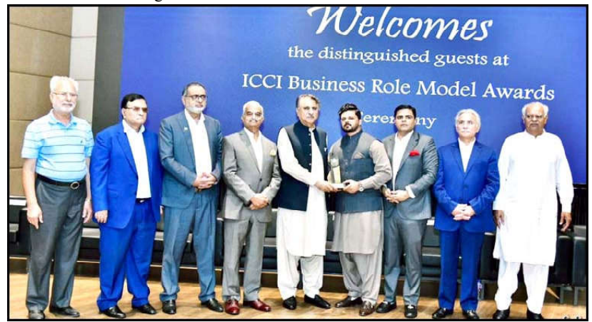
ISLAMABAD: Balochistan Governor Malik Abdul Wali Khan Kakar distributing awards under organized by Islamabad Chamber of Commerce and Industry.