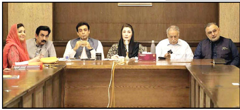
LAHORE: PML-N Senior Vice President and Chief Organizer Maryam Nawaz presides over the party meeting at Model Town. Former chief Minister Punjab Hamza Shahbaz is also present.