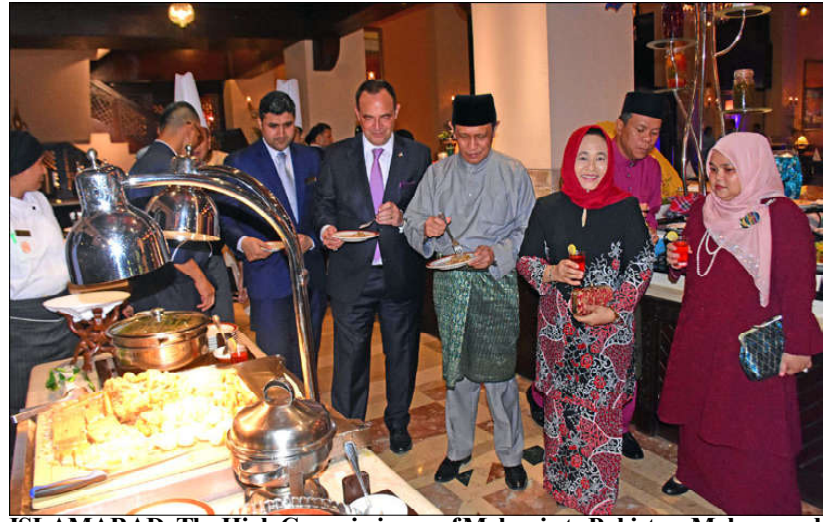
ISLAMABAD: The High Commissioner of Malaysia to Pakistan, Mohammad Azhar Mazlan enjoying the Malaysian foods along with others during Malaysian Food Festival entitled "Flavors of Malaysia" at local hotel.

The rapid acquisition and operationalisation of these advanced aircraft showcases PAF's dedication to maintaining a cutting-edge force, capable of meeting evolving challenges and defending Pakistan's airspace with utmost proficiency. As the Sino-Pak Joint Annual Air Exercise Shaheen-X is in full swing in the Jiuquan and Yinchuan cities of Northwest China, the exceptional event highlights the dedication and capabilities of the Pakistan Air Force, demonstrating its commitment to fostering mutual learning and collaboration with allied countries.