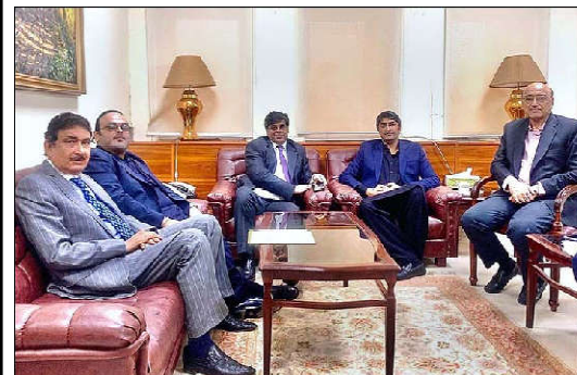
ISLAMABAD: A delegation of prominent businessmen from Lahore and Karachi met with the Caretaker Federal Minister for Commerce, Dr. Gohar Ijaz.

ISLAMABAD (INP): Caretaker Interior Minister, Senator Sarfaraz Bugti, called on Chairman Senate, Muhammad Sadiq Sanjrani, at the Parliament House and discussed with him the prevailing law and order situation in the country. During the meeting, Senator Bugti assured Chairman Senate that the caretaker government was committed to maintain peace and stability in the country. He emphasized that no one would be allowed to disturb the peace and security of the country under his watch. Senator Sarfaraz Bugti, emphasized the need for collaboration and unity among all stakeholders to address the pressing challenges Pakistan faces. Chairman Senate Muhammad Sadiq Sanjrani acknowledged the importance of a collective effort in ensuring a stable and prosperous Pakistan. Speaking on the occasion, Chairman Senate Muhammad Sadiq Sanjrani acknowledged the vital role of intra-institutional cooperation among government bodies and security agencies to effectively address Pakistan's challenges. He stressed that collaboration, information sharing, and coordination among institutions are paramount in maintaining national stability and ensuring the safety and security of citizens. Furthermore, the leaders discussed steps taken to restore peace and promote development in the region of Gilgit Baltistan. Senator Bugti shared insights into the ongoing initiatives aimed at enhancing security and improving the socio-economic conditions in the area.