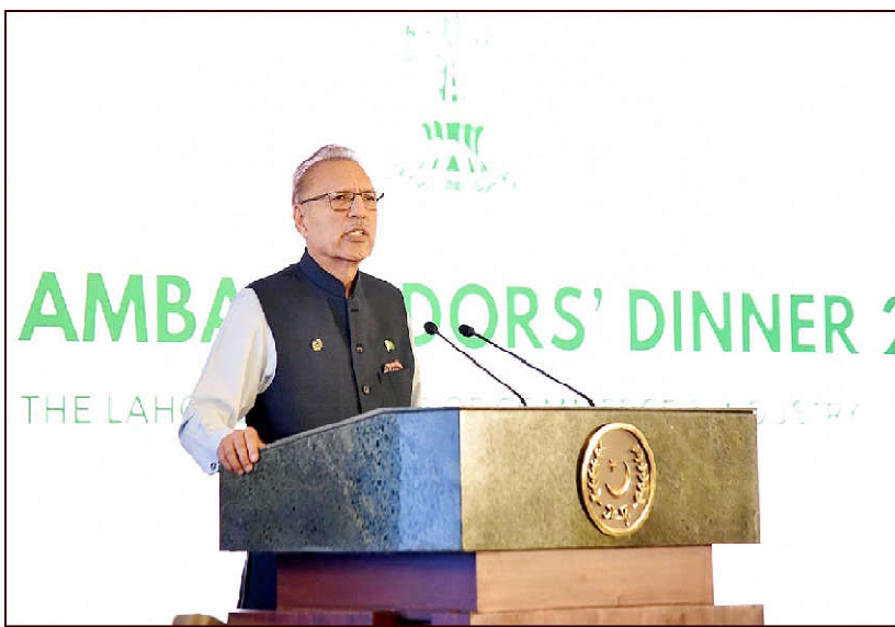
ISLAMABAD: President Dr. Arif Alvi addressing the Annual Ambassadors' Dinner, organized by the Lahore Chamber of Commerce & Industry, at Aivan-e-Sadr.