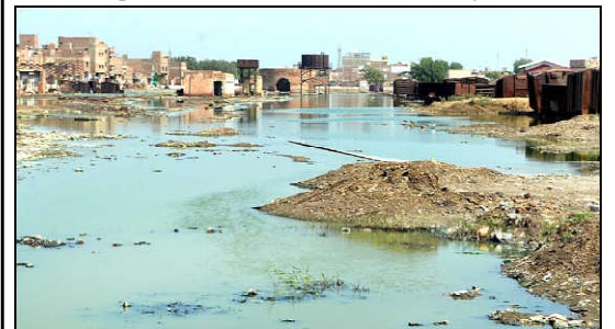
HYDERABAD: A view of sewerage water accumulated on the road outside railway workshop.