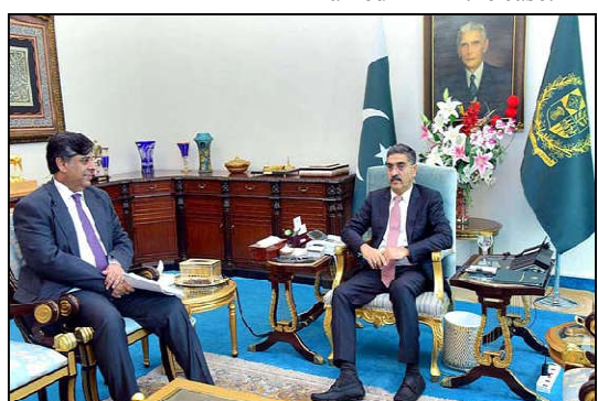
ISLAMABAD: Caretaker Minister for Commerce, Gohar Ijaz calls on Caretaker Prime Minister Anwaar-ul-Haq Kakar.