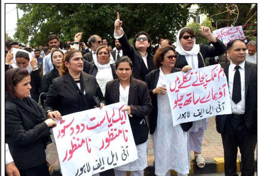
LAHORE: Members of Insaf Lawyer Forum (ILF) are holding protest rally for demanding General Elections after the dissolution of the National Assembly, outside Punjab Assembly in Lahore.

The Governor Sindh said that UNICEF cooperation in the fields of health and education is commendable and steps are being taken with the help of UNICEF to provide better facilities to children.