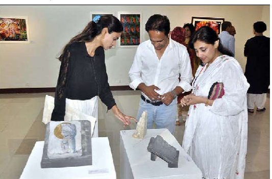
ISLAMABAD: Visitors keenly viewing stuff during the inaugurating ceremony of the Two Person Exhibition titled "HAQ" organized by PNCA & Nomad Gallery at PNCA.

This notice was issued because Khosa had defended, pleaded for, and represented the leader of another political party in cases without obtaining prior approval from the party's leadership. The decision to issue the show cause notice received the endorsement of the party's leadership. Notably, the individual Khosa was defending had already been convicted in a case under the Official Secrets Act. During a speech delivered at a lawyers' function, Mr. Khosa also criticized the state's policy regarding classified information. Khosa has been granted a seven-day period to respond to the show cause notice, wherein he must provide a satisfactory explanation for his actions.