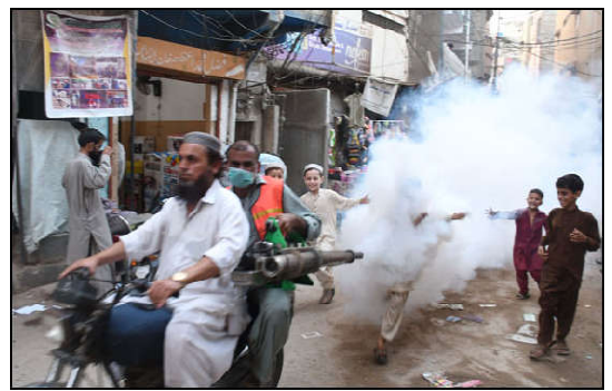
KARACHI: Workers of KMC are spraying Anti Dengue spray in the streets of Sultanabad area to decrease the rising ratio of Dengue patients in Provincial Capital.