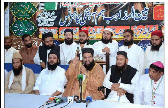
FAISALABAD: Chairman Pakistan Ulama Council & President International Faith Harmony Council Hafiz Tahir Mahmood Ashrafi is addressing to the "Interfaith Harmony Conference" at Razaabad.

The ceremony was also attended by minority community leaders, religious figures, deputy commissioner, District Khateeb and pastors of all the churches of Hazara.