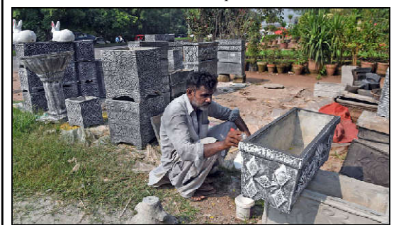
ISLAMABAD: A worker is busy in painting the cemented flower pot at Nursery along the Park road in Federal Capital.