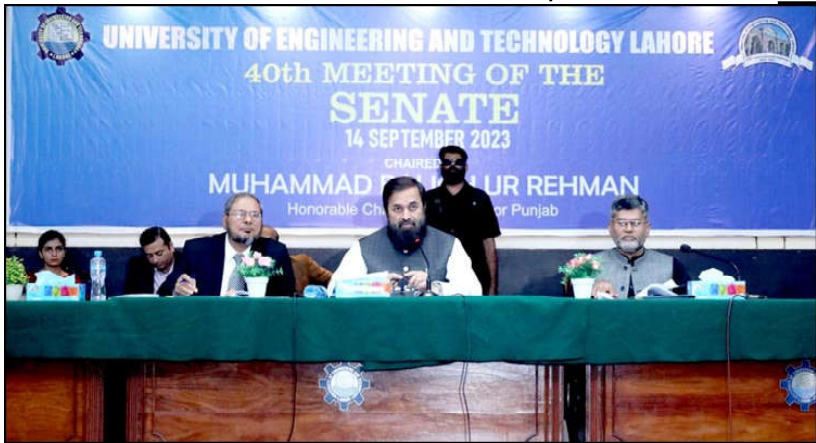
LAHORE: Punjab Governor Muhammad Balighur Rehman chaired 40th meeting of the Senate of the University of Engineering and Technology Lahore.