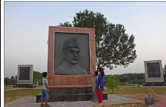
ISLAMABAD: A view of the large size portrait of World acclaimed medical researcher, scholar and philanthropist of Pakistan Hakim Muhammad Saeed at Fatima Jinnah Park in Federal Capital.

ISLAMABAD (APP): Capital Development Authority (CDA), in collaboration with the local administration, sealed numerous under construction buildings along the Expressway on Thursday due to violations of building regulations. During an operation along the Expressway, it was discovered that five buildings were under construction without the approval of the CDA. As a result, these structures have been sealed, and notices have been issued to their owners. Furthermore, notices have been sent to 13 building owners in F-17.