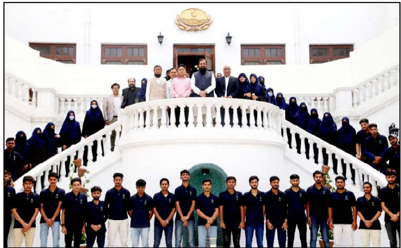
LAHORE: Governor Punjab Muhammad Balighur Rehman in a group photo with IT trainers under the aegis of Akhuwat Foundation at Governor House.

He said that these courses will provide entrepreneurship opportunities to the youth, adding that they can earn a handsome amount of money by working on line. Governor Punjab further said that former Prime Minister, Muhammad Shehbaz Sharif distributed laptops among students on merit in 2013, so that our youth can progress in the field of information technology and compete with the world.