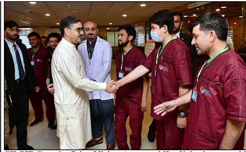
GILGIT: Caretaker Prime Minister Anwaar-ul-Haq Kakar interacts with the doctors and para-medical staff of Cardiac Hospital.

He said that only one percent was being spent on research work which was very low compared to international standards. The Governor said that in last four to five months, eight public sector universities in KP were functioning without a vice chancellor while VCs of additional seven universities are going to retire shortly. He said that the former PTI government has done great injustice with the universities after passing an act that complicated the appointment of vice chancellors and KP's domiciled human resource for induction in public sector universities.