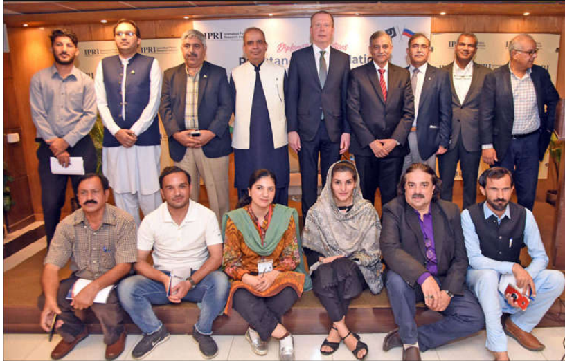
ISLAMABAD: Russian Ambassador to Pakistan Danila Ganich posing for a group photo with the participants after conference entitled "Pakistan-Russia Relations, and Way Ahead" at Islamabad Policy Research Institute in Federal Capital.

Chief of the Naval Staff Admiral Muhammad Amjad Khan Niazi was the chief guest at the ceremony, a Pakistan Navy news release said. Speaking on the occasion, the Naval Chief highlighted the importance of maritime security under the prevailing conventional and non-conventional maritime