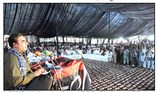
MULTAN: Peoples Party (PPP) Chairman, Bilawal Bhutto Zardari addresses during public gathering meeting held at Muzaffargarh area in Multan.