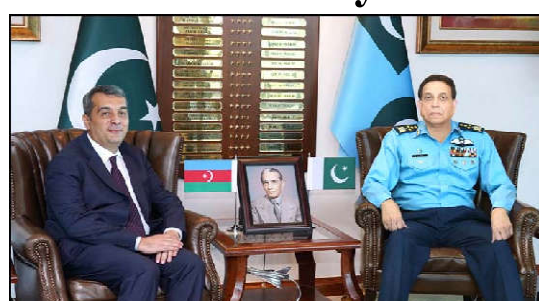
ISLAMABAD (APP): Air Chief Marshal Zaheer Ahmed Baber Sidhu has reaffirmed his steadfast determination to further enhance the existing inter-military cooperation with Azerbaijan particularly in the fields of training and defence aviation.