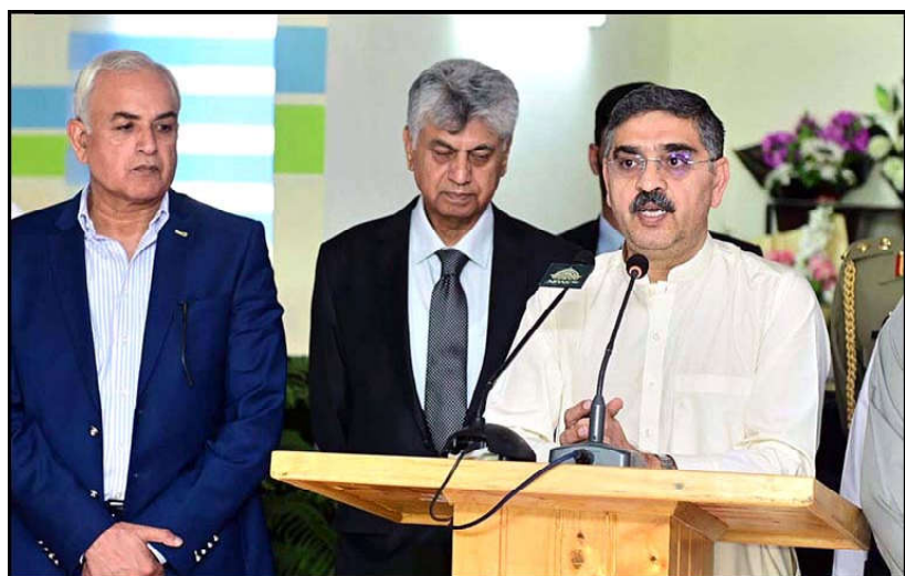
GILGIT: Caretaker Prime Minister Anwaar-ul-Haq Kakar talks to the media after the inauguration of Cardiac Hospital.