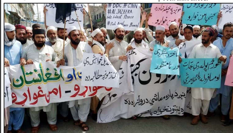
LANDIKOTAL: Customs clearing agents, leaders, political leaders, businesspersons and people are holding protest demonstration against the closure of Pak-Afghan border, held at Khyber Bazar in Landikotal.