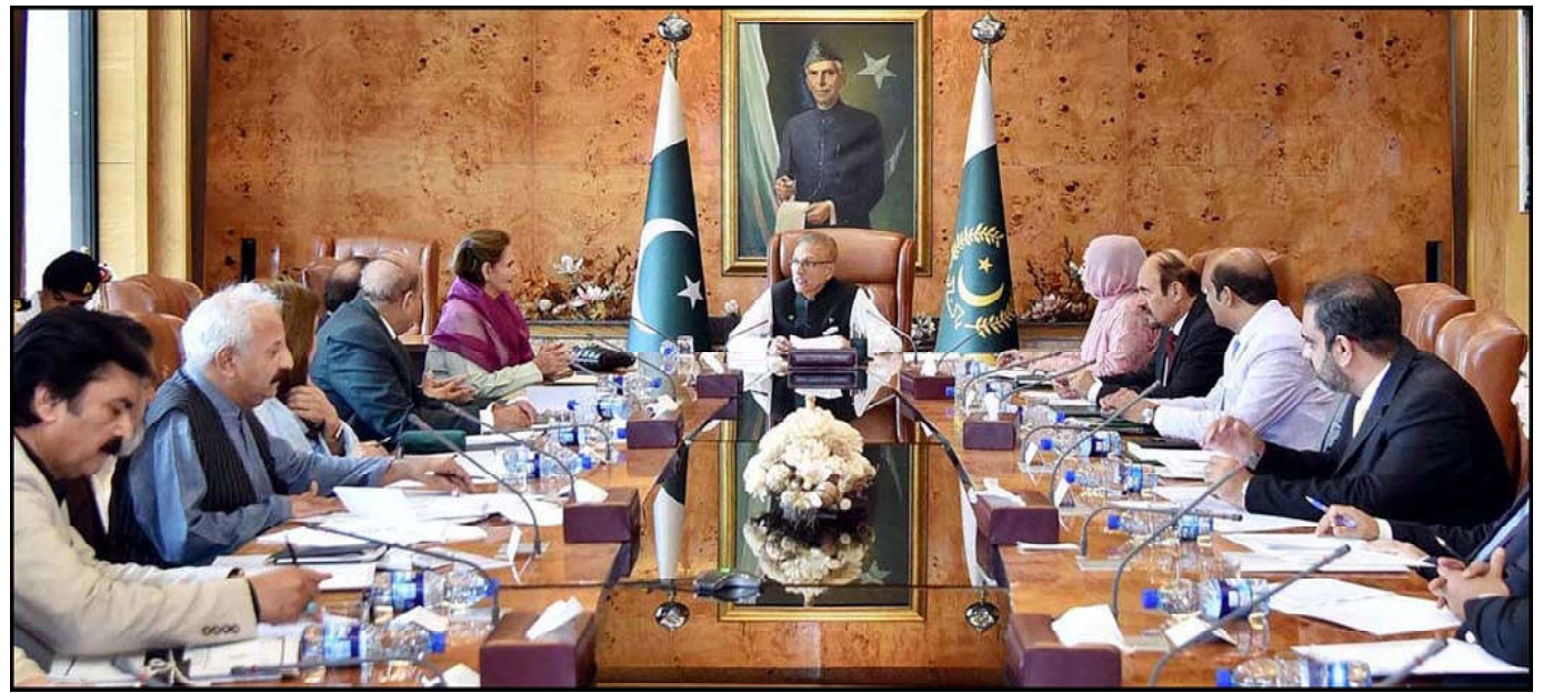
ISLAMABAD: President Dr. Arif Alvi chairing a meeting on the framework for the classification of disabilities, at Aiwan-e-Sadr.

ability employment quota. It was informed that the ministry was actively pursuing with the government organizations to implement job quota for persons with disabilities in letter and spirit. The ministry highlighted that 98 differently-abled persons (DAPs) had been provided jobs by the government organizations since March 2023. The ministry further informed that a master list of potential employers was being prepared to seek their support in providing jobs to PWDs.