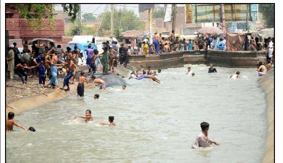
PESHAWAR: Youngsters' enjoying bathing on Kohat Road.

He underscored the significance of legal aid in international and domestic legal frameworks where it is acknowledged as a fundamental human right and a guarantee of a fair trial, equality before the law, protection against discrimination, and access to effective remedies. The Inaugural Session was attended by the faculty members and directors of the Academy. The two-day training program aims to provide participants with an orientation of District Legal Empowerment Committees (DLECs).