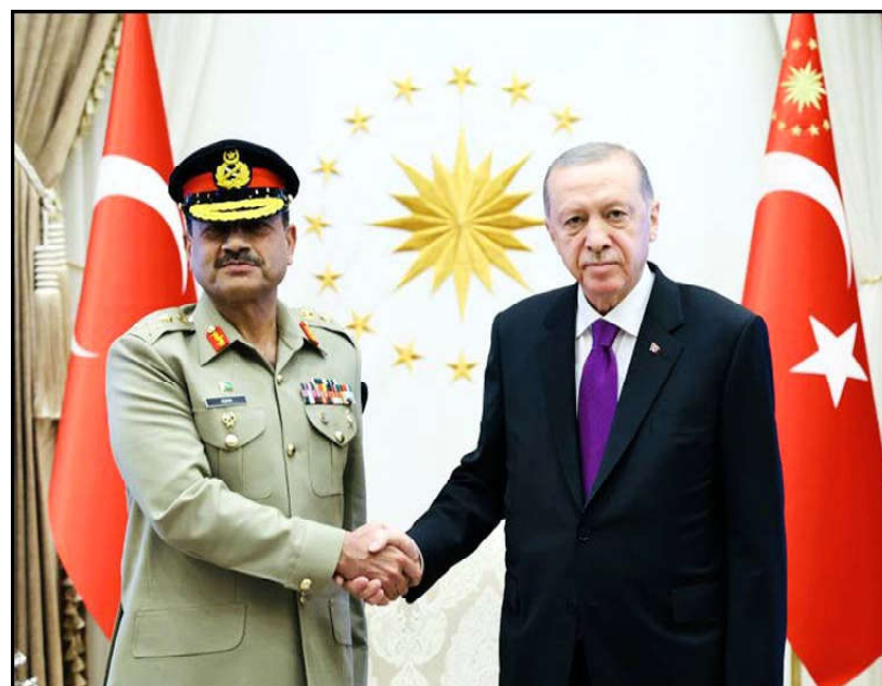
Chief of Army Staff (COAS) General Syed Asim Munir meeting with Turkish President Recep Tayyip Erdogan during his official visit to brotherly country

"THEREFORE, taking into account all the above, the Election Commission of Pakistan in consultation with Provincial Governments and political parties under the relevant provisions of the Constitution and in view that some of these matters are already subjudice, may seek guidance from the Superior Judiciary for announcement of a single date for general election to the National and Provincial Assemblies," he writes.