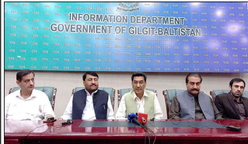
GILGIT: Provincial Ministers Gilgit-Baltistan addressing a press conference regarding the Prime Minister visits to GB at CM Secretariat.

The police took both bodies into custody and shifted them to mortuary for postmortem while further investigation was under progress, he added.