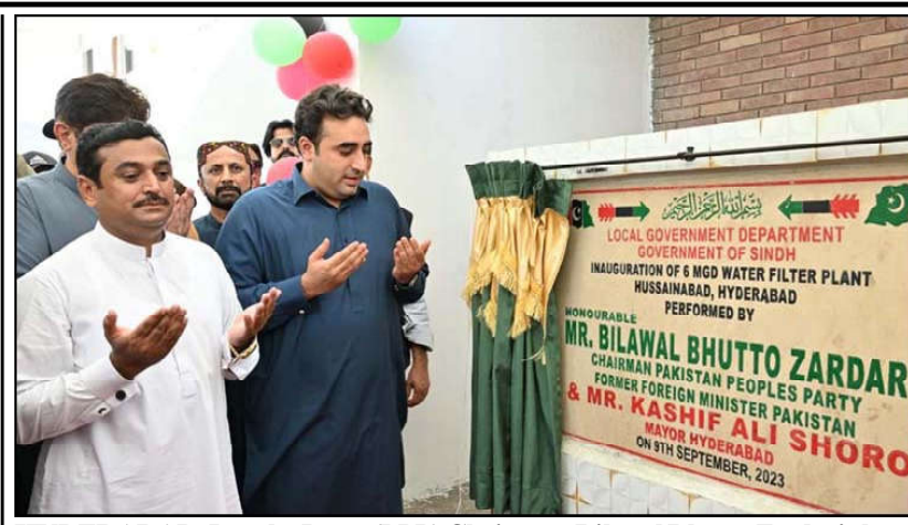
HYDERABAD: Peoples Party (PPP) Chairman, Bilawal Bhutto Zardari along with Kashif Ali Shoro, Mayor Hyderabad offering Dua after unveiling the plaque during the inauguration ceremony of 6 MGD Water Filter Plant, at Hussainabad in Hyderabad.