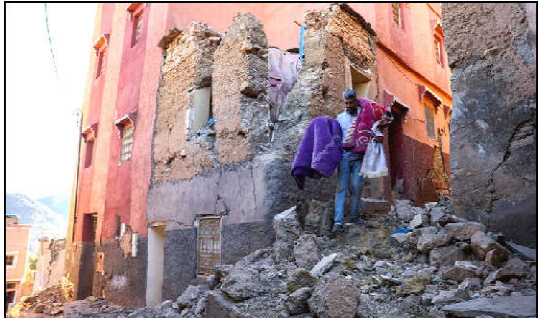
A man carries belongings out of his damaged house, in the aftermath of a deadly earthquake in Moulay Brahim, Morocco

ISLAMABAD (APP): Prime Minister Anwaar-ul-Haq Kakar Sunday said a task force headed by the finance minister would determine the sizes of federal and provincial governments, look at options to better manage pension funds, besides making efforts to rationalize public expenditure and increase revenue. In an interview with a private television, he said, "We are convinced that there is a need to rationalise expenditure and increase the revenue of the government to create a viable state and lessen existential threats due to economic vulnerability." He said the Special Investment Facilitation Council (SIFC) was attempting to help achieve appropriate governance and address the reasons for ill governance in the past. The civil institutions were lax in their working in the past but now the army leadership with its organizational strength had increased the level of confidence of civil service which had renewed energy to implement policies and achieve goals, he added. The prime minister said the government was optimistic about investment from Saudi Arabia in the backdrop of talks between Crown Prince of Saudi Arabia Mohammed Bin Salman and Pakistan's chief of army staff. The government was planning for a visit of the Crown Prince of Saudi Arabia, adding the visit would be aimed at fully exploiting economic opportunities in the country.