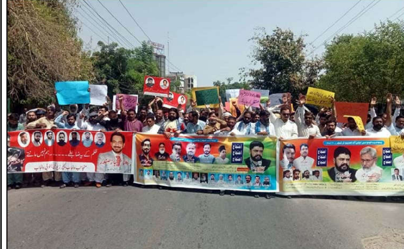
MULTAN: Members of Punjab Teachers Union are holding protest demonstration for acceptance of their demands, at Multan press club.

RAWALPINDI (APP): Anti-Narcotics Force (ANF) while conducting five operations across the country managed to recover 10 kg drugs and arrested two accused including a woman. According to an ANF Headquarters spokesman, 60 grams of weed was recovered from two parcels confiscated from a courier office in Rawalpindi. Both the parcels were booked from the UK for Azad Kashmir. In another operation, Ice drug was recovered from a parcel booked for Australia at a courier office in Gulberg, Lahore. 1550 grams of Ice drug was concealed in sheets, bags and other items. A woman resident of Lahore and a Nigerian national who booked the parcel were arrested. In the fourth operation, 1 kg hashish was recovered from a parcel booked for Karachi at Lahore Airport. In the fifth operation, 8320 grams of hashish concealed for smuggling were recovered from Zakhra Khel area of Khyber. Separate cases under the Anti-Narcotics Act were registered against the accused while further investigations are under process.