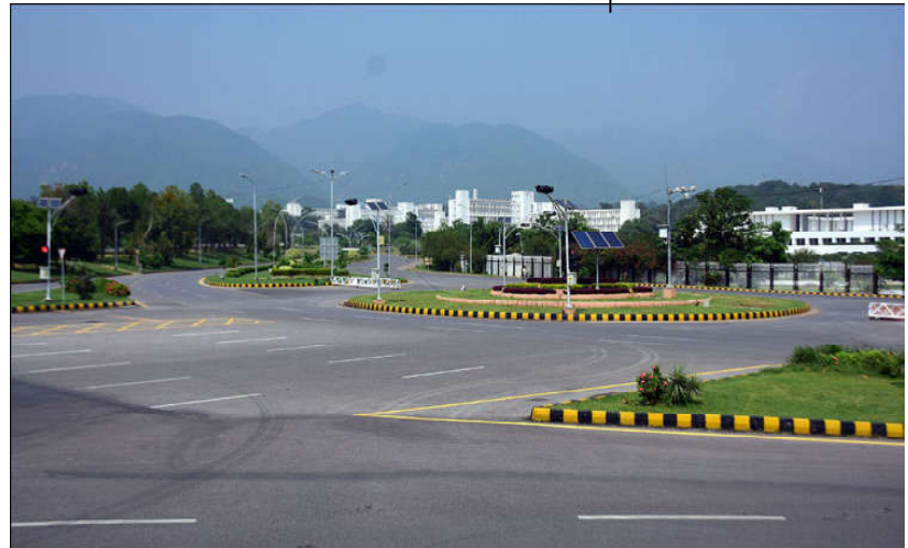
ISLAMABAD: A view of deserted Constitution Avenue in Federal Capital, due to Asia Cup 2023 super four one-day international (ODI) cricket match between India and Pakistan.

The center will carry out joint research in four areas: natural disaster and risk management; geological structures and tectonic activities; climate change and environmental effects; and resources, environment, and green development.