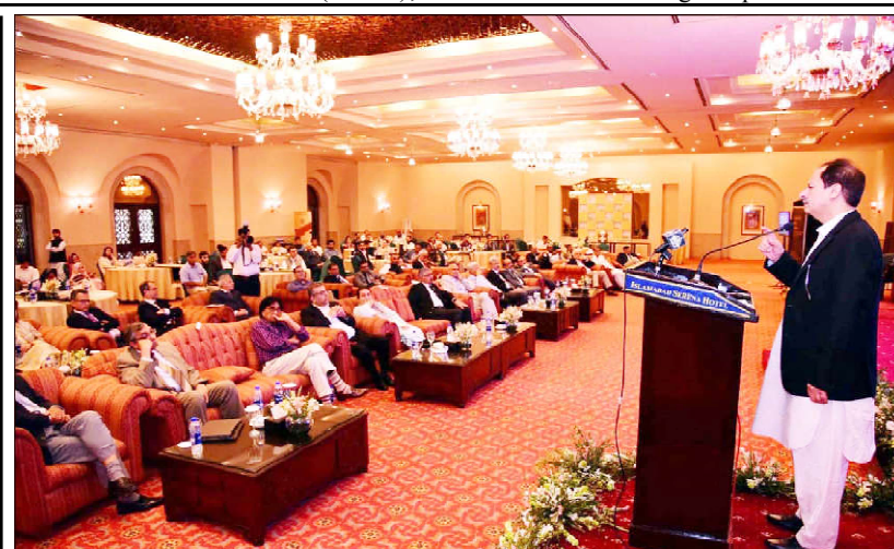
ISLAMABAD: Caretaker Federal Health Minister, Dr. Nadeem Jan addresses during the National Health Research Conference.