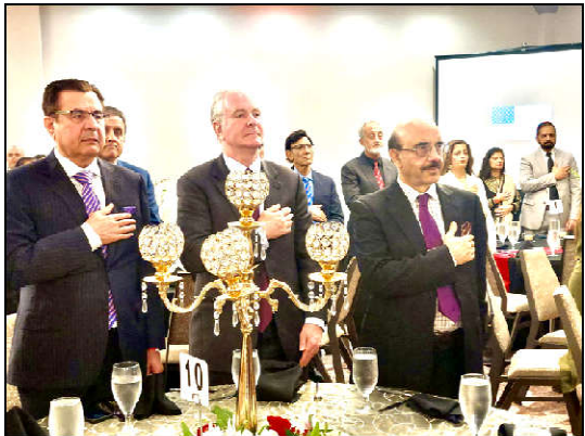
The US was instrumental in getting the IMF to come forward with emergency economic relief in the case of Pakistan.

WASHINGTON (Online): Democratic Party Senator Chris Van Halen said that the Biden administration is not interfering in Pakistani politics.