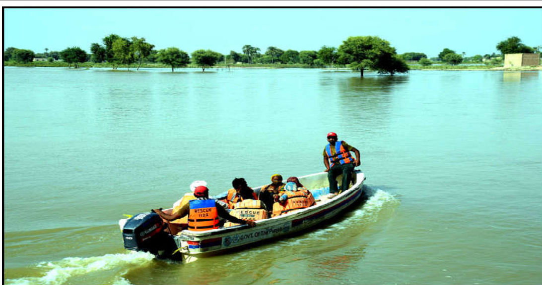
BAHAWALPUR: Rescue personnel evacuate people on a boat from a flooded Ahmedpur Sharqia area.

ism and the world powers were well-aware of the fact that the occupied valley was turned into a largest open prisoner and torture cell.