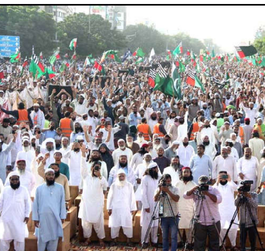
KARACHI: Members of Ahle Sunnat Wal Jamaat are holding Azmat-e-Sahaba and Ahlebait rally, at Shahrah-e-Quaideen in Karachi.