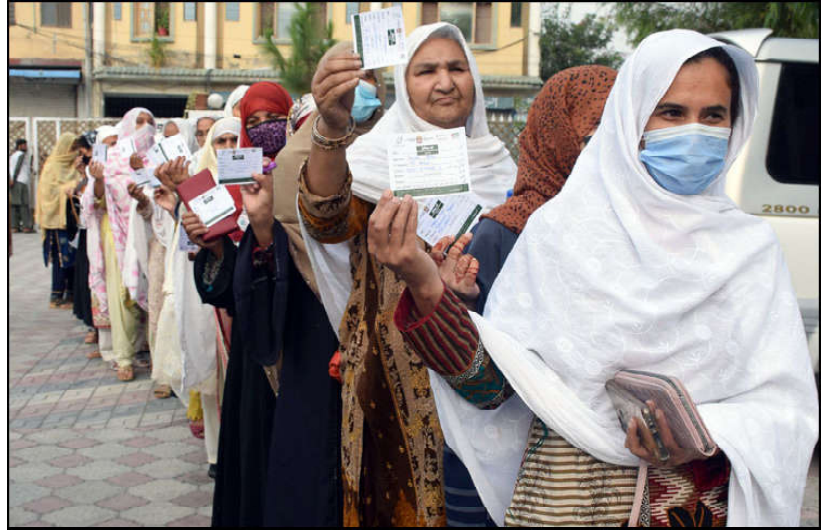
MUZAFFARABAD: Deserving women showing their Rashan cards as stands in a queue for collecting free food package distributing from Mohammed Bin Rashid Al-Maktoum Global Initiatives.