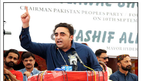
HYDERABAD: Chairman Pakistan Peoples Party Bilawal Bhutto addressing the inauguration ceremony of 10 MGD Water Filter Plant Hussainabad.

ISLAMABAD (APP): Caretaker Interior Minister Sarfraz Ahmed Bugti said on Sunday that the government has adopted zero tolerance policy to curb smuggling of US dollars, sugar, fertiliser and petroleum products. "The federal government has started action by registering cases against the elements involved in illegal activities," said Bugti while addressing a press conference here. The interior minister said law will take its course if anyone found guilty in crimes like, Hundi, Hawala, Smuggling of sugar, wheat, fertilizers and other illegal activities. It is prime responsibility of the people to keep a vigilant eye in their surroundings, said Bugti urging the masses to report such activities for timely action.