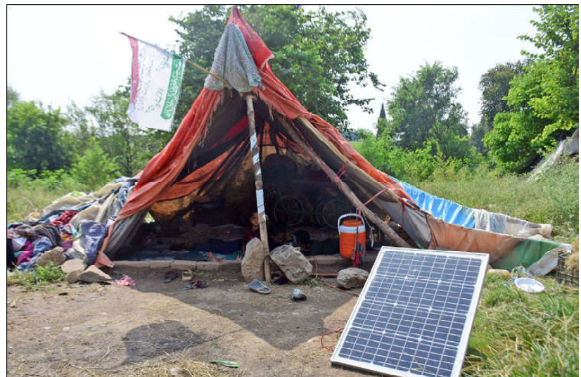
ISLAMABAD: A view of Afghan refugees installed solar panel system outside their tent house on a green belt outside Press Club in Federal Capital.