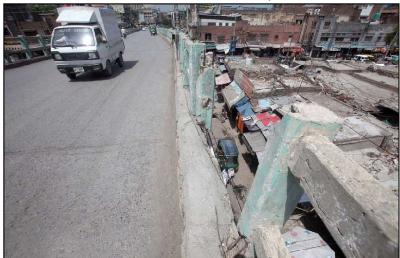
PESHAWAR: Safety wall of Faqirabad Bridge seen broken that may cause any accident and also inviting authorities to draw their attention towards issue, in Peshawar.