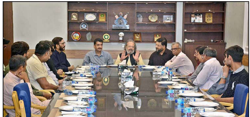
KARACHI: September 03 - Caretaker Federal Minister for Education and Professional Training Madad Ali Sindhvi during a meeting with the Senior Journalists at Karachi Press Club (KPC).

model graveyard comprising 127 kanals of land had been built at the Sundar Road Raiwind. A four wall, funeral place ablation place along with an ambulance had been provided in the model graveyard. A capacity of more than 12 thousand graves had been kept in the model graveyard. The burial fee in the model graveyards had been reduced from rupees 10 thousand to rupees 3500. It was informed during the briefing that a