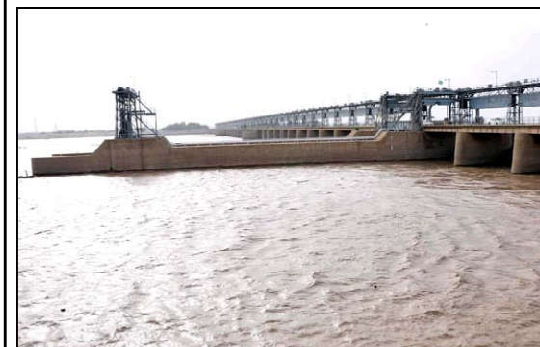
HYDERABAD: Water level increases while high grade flood water reaches into River Indus.