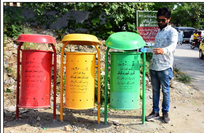
ISLAMABAD: A man is throwing plastic empty water bottle in dustbin, As Capital Development Authority (CDA) installed new dustbin alongside a road at Sector G-7 in Federal Capital.

ISLAMABAD (INP): The illegally detained Chairman of All Parties Hurriyat Conference, Masarrat Aalam Butt Sunday appealed to the world human rights organizations to raise their voice against the Indian atrocities in Indian illegally occupied Jammu and Kashmir (IIOJK). The world's criminal silence has emboldened India to continue its repression in IIOJK, he said in a message from New Delhi's Tihar Jail, Kashmir Media Service reported. Masarrat Aalam said the Narendra Modi-led Indian government is using its military might to suppress the Kashmiris' struggle for right to self-determination but will never succeed in its nefarious designs. He pointed out that India has waged a war on the unarmed people of occupied Jammu and Kashmir and the Indian atrocities witnessed an upsurge after 5 August 2019. The APHC Chairman said the Kashmiris have been facing the Indian brutalities for the last seventy-six years just for demanding their right to self-determination adding he said the Indian repression cannot force the Kashmiri people to give up their just demand.