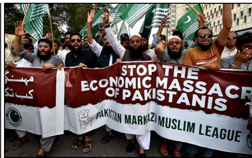
KARACHI: Activists of Pakistan Central Muslim League hold a protest in favor of their demands outside press club, in Provincial Capital.

The COAS General Asim Munir responded positively, assuring that money exchanges would be brought under the purview of taxation, fostering transparency in dollar exchange and interbank rates.