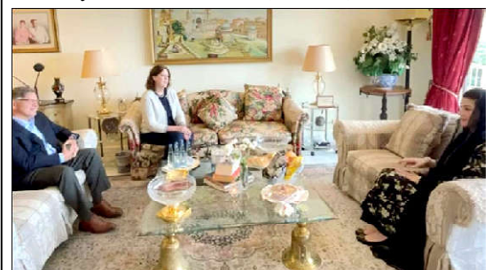
LAHORE: US Ambassador to Pakistan Donald Bloom meeting with Pakistan Muslim League Chief Organizer and vice president Maryam Nawaz Sharif.

The electricity bill of those using 300 units per month will increase from 6,000 to 8,000.