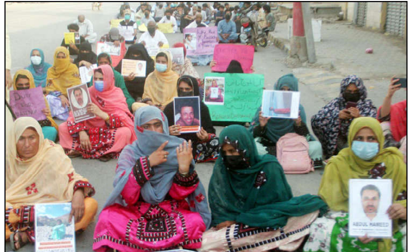
KARACHI: Relatives of Missing persons hold a protest in favor of their demands outside Sindh Assembly, in Provincial Capital.

MULTAN (APP): A police constable embraced martyrdom during an exchange of fire with criminals on the premises of Makhdoom Rasheed police station, here Sunday. According to a police spokesman, taking action on the directives of the court.