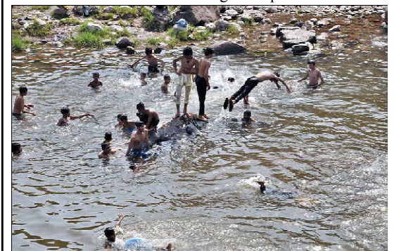
ISLAMABAD: Youngsters jumping and bathing in water channel of Rawal Dam to get some relief from hot weather in the Federal Capital.