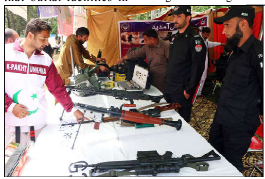
ABBOTTABAD: A man checking weapons on a police stall, during exhibition in the city.

LAHORE (APP): Punjab Caretaker Minister for Information and Culture Amir Mir has taken decisive action against proliferation of obscene dances in Gujranwala and Faisalabad and orders have been issued to remove directors of the arts council in these cities over their failure to curb performance of indecent performances in local theaters. Furthermore, theaters in Faisalabad and Gujranwala that were showcasing such lewd performances have been promptly shuttered. Amir Mir emphasised that the two arts council directors were protecting individuals perpetuating obscenity under the guise of art. After dismissal of officers, new officers have been appointed.