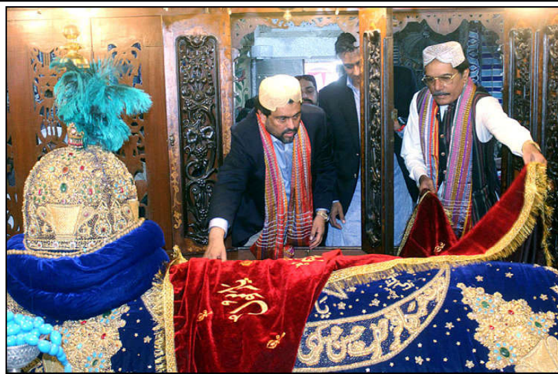
BHITSHAH: Sindh Governor Kamran Tessori laying wreath on the grave of Hazrat Shah Abdul Latif Bhitai on the occasion of 280th urs celebrations.

He said that various problems related to the economy, particularly the energy crisis facing Sindh were discussed in the meeting. Tessori said that such a crisis could not be resolved by a single political party but could be tackled collectively. Governor further said that Sindh was badly affected in last year's flood catastrophe and people of Sindh were still facing its aftermath. He urged all political parties to shun their differences to resolve the problems of the masses and for this purpose he could also consult with political leaders including Muhammad Nawaz Sharif.