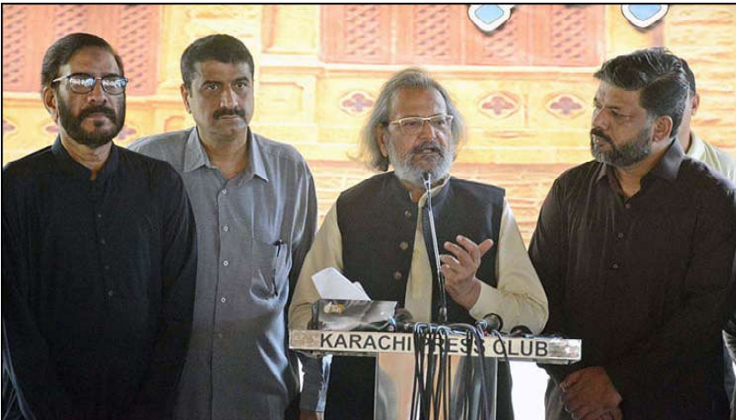
KARACHI: Caretaker Federal Minister for Education and Professional Training Madad Ali Sindhi talking to media persons at Karachi Press Club.

Through the Pak-US Green Alliance, we are making strategic investments in the energy, water and agriculture sectors, which will strengthen climate resilience, bring innovation in the energy sector and promote inclusive economic growth, she added.