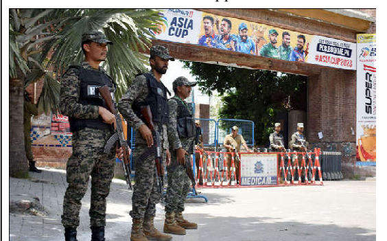
LAHORE: Rangers and police personnel stands alert outside Gaddafi Stadium during the Asia Cup 2023 one-day international (ODI) cricket match between Bangladesh and Afghanistan at the Gaddafi Stadium, in Provincial Capital.

In addition, this funding will support humanitarian partners to provide nutritious food to mothers and their children, help families rebuild local infrastructure to protect them from future disasters, and increase protection services to prevent gender-based violence and support survivors.