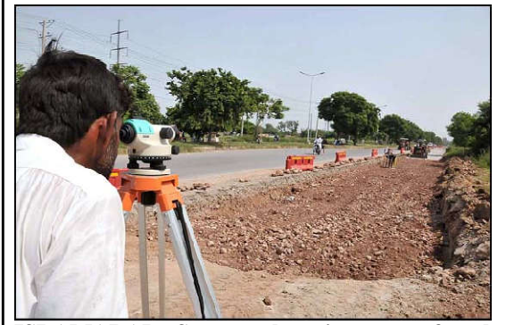
ISLAMABAD: Surveyor busy in survey of road during expansion work of Club Road in the Federal Capital.