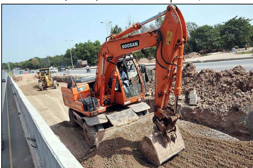
ISLAMABAD: Heavy machinery being used for expansion work of Club Road during development work in Federal Capital.

ISLAMABAD (INP): The Higher Education Commission (HEC) has announced a scholarship program for outstanding students of Gilgit-Baltistan who wish to pursue undergraduate studies at top Pakistani universities or institutions. According to HEC, the scholarships are being offered for the academic year 2023-24 in all areas of study or disciplines. The HEC set criteria for scholarship is to be a domiciled in Gilgit-Baltistan, have a Higher Secondary School Certificate (HSSC) or equivalent, be 22 years old or younger as of the closing date for applications and not be currently enrolled in any other scholarship program. The scholarship covers tuition fees, hostel fees, and other charges up to Rs. 240,000 per year. It also includes a stipend of Rs. 15,000 per month and books and traveling allowances of Rs. 30,000 per annum. Candidates will be shortlisted based on their scores in an aptitude test to be conducted by the Education Testing Council (ETC), HEC. They must also secure at least 50% marks in their academic credentials. Students who are already enrolled in a BS program at a public sector university or institution prior to the advertisement or announcement of the scholarship may also apply. The award of the scholarship is purely merit-based and is not based on gender, caste, race, or religion. The application can be submitted online through the HEC website: http://reportal.hec.gov.pk . The last date for submission of applications is September 30, 2023.