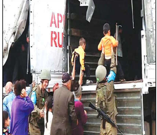
KHANKENDI: In this videograb released by the Russian Defence Ministry, Russian peacekeepers help evacuate refugees from this town, also called Stepanakert.

bid and forward it to the Turkish parliament on July 10 after meeting NATO Secretary General Jens Stoltenberg and Swedish Prime Minister Ulf Kristersson. A day after the announcement, the Biden administration said that it would move forward with the sale of F-16s to Turkey. Ankara requested to buy $20 billion of F-16 aircraft and nearly 80 modernization kits for its existing warplanes from the U.S. in October 2021. Since then, neither the ratification of Sweden's NATO bid nor the sale of the jets have been finalized.