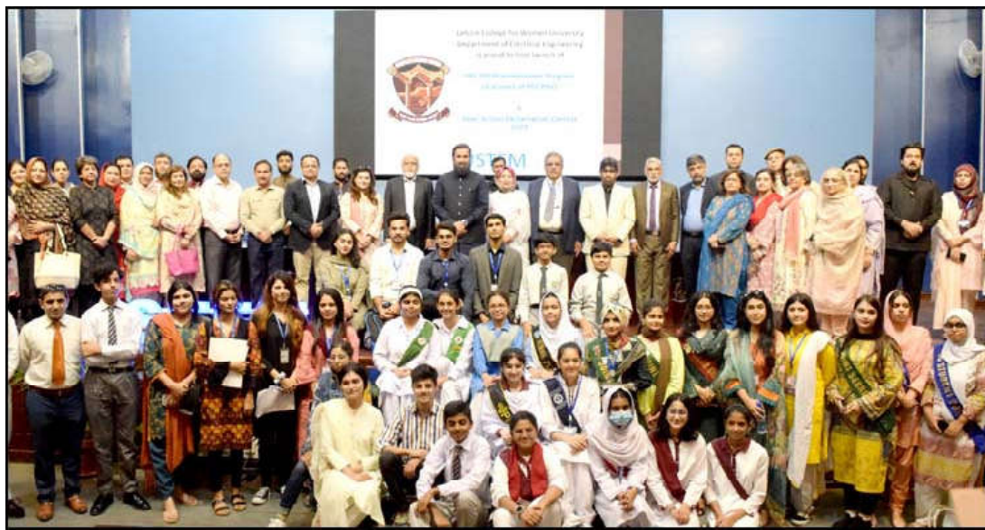
LAHORE: Governor Punjab Muhammad Balighur Rehman in a group photo with Vice Chancellor and others during a ceremony of Stem Ambassador Program at Lahore College for Women University.

the STEM initiative of PEC, he said that arranging activities in various educational institutions for the promotion of scientific studies among the youth under STEM is commendable. He said that this program will help universities and schools to work together and impart science education to the children. It will definitely help in increasing the trend of STEM education, he added.