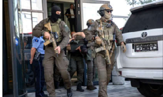
Kosovo police members of Special Intervention Unit escort one of the arrested Serb gunman out of the court after the Kosovo shootout in capital Pristina.

not the only, headwind is Russia's war of aggression against Ukraine, and how China positions itself on this issue," he said. Dombrovskis spoke before high-level economic and trade talks with Chinese Vice Premier He Lifeng. EU leaders have expressed concern about the bloc's growing trade deficit with China, which reached 396 billion euros last year. European Commission President Ursula von der Leyen recently announced an investigation into Chinese subsidies to electric vehicle makers, saying a flood of cheaper Chinese cars is distorting the European market.