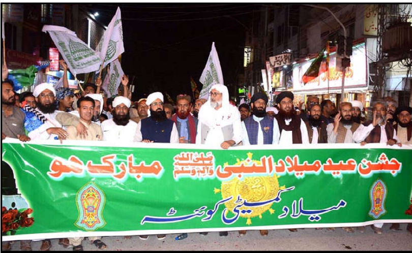
QUETTA: Members of Milad Committee hold rally in confection with 12 Rabi Ul'Awal.