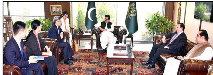
ISLAMABAD: Chinese Ambassador to Pakistan, Jiang Zaidong calling on Chairman Senate of Pakistan Muhammad Sadiq Sanjrani at the Parliament House.

While extending his congratulations to Ambassador Jiang Zeidang on his new role, Chairman Senate Muhammad Sadiq Sanjrani expressed optimism that the ambassador's substantial skills would contribute to stabilizing and fortifying the Pakistan-China relationship.