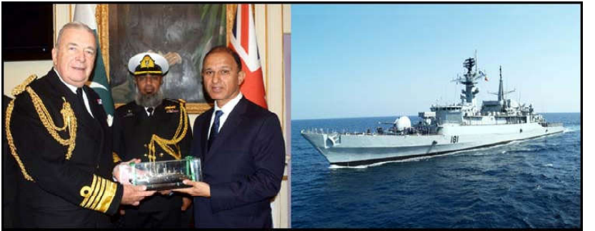
Chief of the Naval Staff Admiral Muhammad Amjad Khan Niazi presenting souvenir to Former First Sea Lord Admiral Alan West of Royal Navy during transfer agreement signing ceremony of Ex Pakistan Navy Ship TARIQ to UK.