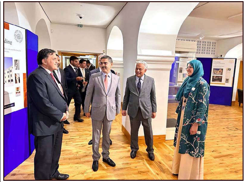
Caretaker Prime Minister Anwaar-ul-Haq Kakar visits the Oxford Centre for Islamic Studies

Kakar said the International Monetary Fund (IMF) deal was an opportunity for the country to focus on how the economic behaviour was influencing the life of the common man in Pakistan.