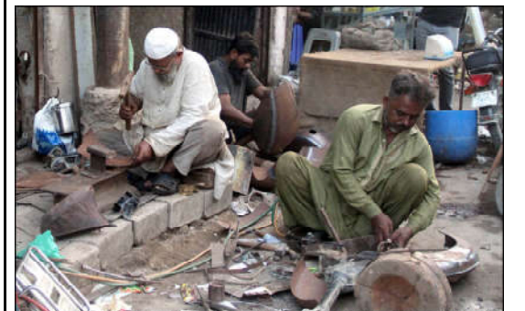
KARACHI: An iron smiths are busy in their work at shop in Eid Gah area in Provincial Capital.

Moreover, a massive volume of smuggled Plastics from neighbouring countries and misdeclaration in terms of value and quantity have caused losses of Rs10 to 12 billion in just three months on account of Customs Duty, Sales Tax, WHT and other levies, he added.