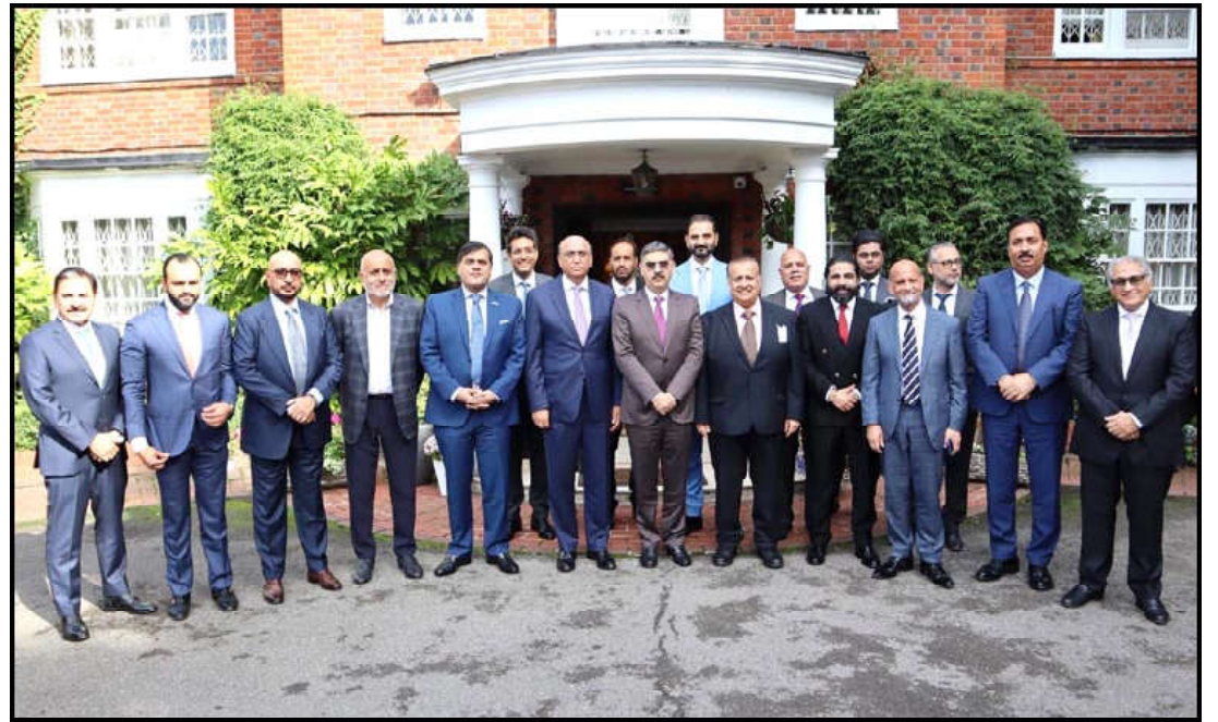
LONDON: A delegation of prominent British Pakistani businessmen call on the Caretaker Prime Minister Anwaar-ul-Haq Kakar.

for approval after being vetted from the concerned forums. Addressing the cabinet meeting, the caretaker Chief Minister mentioned that certain important decisions were made about the pending matters of different departments as well as those related to the public interests and administrative affairs. He pledged that whatever time we have would be utilized for the public welfare. e said that the basic objective behind approval of the important decisions is a step forward towards good governance in the province.