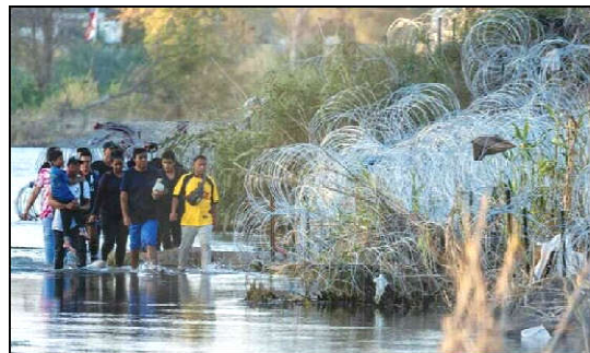
Migrants walk along razor wire looking for a place to cross the Rio Grande river, near the US-Mexico border.

Dombrovskis spoke before high-level economic and trade talks with Chinese Vice Premier He Lifeng. EU leaders have expressed concern about the bloc's growing trade deficit with China, which reached 396 billion euros last year. European Commission President Ursula von der Leyen recently announced an investigation into Chinese subsidies to electric vehicle makers, saying a flood of cheaper Chinese cars is distorting the European market.