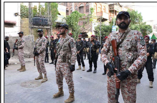
HYDERABAD: Security officials are standing high alert to avoid untoward incident during the Shiite procession of Chup-Lazia on the occasion of 8th Rabi-ul-Awwal every year to commemorate the death of Hazrat Imam Hasan al-Askari (R.A), in Hyderabad.

LAHORE (INP): The Drug Regulatory Authority of Pakistan (DRAP) on Monday launched a crackdown against medicine distributors amid the rising cases of vision loss due to the use of substandard injections in Punjab, says in media reports. Initially, it was reported that the eyesight of over 400 diabetes patients was affected in Punjab after which the provincial caretaker government imposed a two-week ban on Avastin's sales.