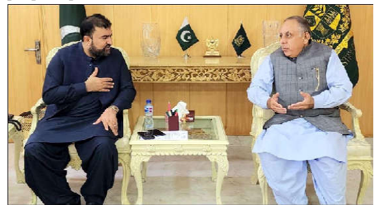
Caretaker Federal Minister for Interior Sarfraz Ahmed Bugti in a meeting with Former Federal Minister Mir Changaiz Khan Jamali in Islamabad.

supply chain in the country, encompassing organic cotton to apparel production. They also hoped for improved Pakistan-UK air connectivity to facilitate increased imports from Pakistan. Prime Minister Kakar conveyed Pakistan's commitment to facilitating investment and offered support in establishing manufacturing facilities within the country, particularly within Special Economic Zones (SEZs). The meeting marked a significant step towards enhancing economic cooperation and trade between Pakistan and the firm. Boohoo Group is a prominent British online fashion retailer with annual sales exceeding one billion pounds, with a wide range of popular brands.