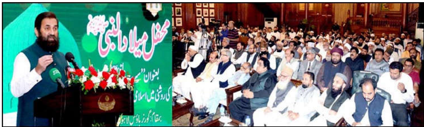
LAHORE: Punjab Governor Muhammad Baligh-ur-Rehman addressing the ceremony on the eve of Mehfil-e-Milad-un-Nabi (SAWW) at Governor House.

conventional roads, these innovative constructions are not susceptible to rain-induced damage. Moreover, the financial outlay for constructing a plastic road has been significantly reduced, with this project amounting to Rs 2 crore as opposed to the standard Rs 6 crore for a regular road. A crucial environmental benefit is that the plastic used in these roads is sourced from recycled materials, effectively repurposing plastic waste that would otherwise contribute to environmental pollution. This eco-friendly approach to road construction not only minimizes costs but also serves as a sustainable solution.