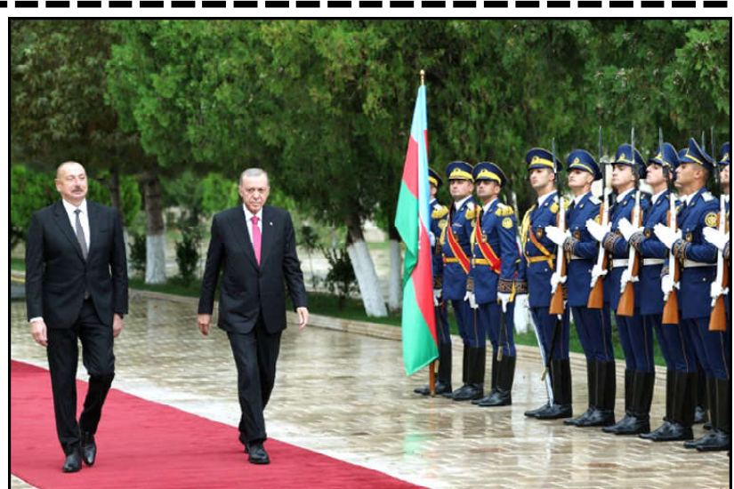
Turkish President Tayyip Erdogan and Azerbaijani President Ilham Aliyev attend a welcoming ceremony in Nakhchivan, Azerbaijan.

"The new target of Azerbaijan and Turkey is Syunik (a province in southern Armenia through which such a corridor would pass). They are already openly declaring it. Active preparations for war are underway," it said.