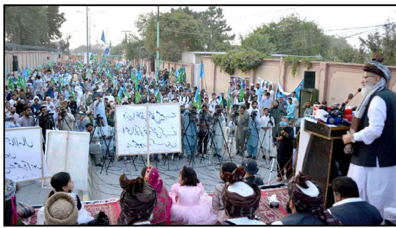
QUETTA: Ameer Jamaat-e-Islami Sirajul Haq addressing a protest gathering against the hike electricity and petrol prices in front of Governor House

The Chief Secretary inspected the projects including Sabzal road, Sariab road, Eastern and Western bypass, Haza Ranji bus terminal and water treatment plant.