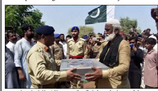
terrorists in Mir Ali area of North Waziristan, were offered on Sunday in his native village Kabirwala of

Khanewal district. The martyr was buried with full military honours, an Inter Services Public Relations (ISPR) news release said. Military and civil of-