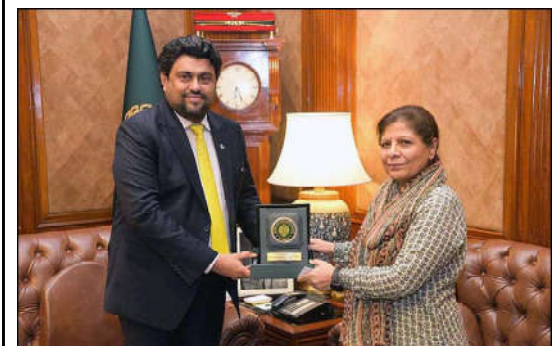
KARACHI: Sindh Governor Kamran Khan Tessori presenting the shield to the caretaker Federal Minister for Finance and Economic Affairs Shamshad Akhtar at the Governor House.

Ministry of National Defence of Turkiye, ASFAT and Pakistan Navy for the synergized efforts to make the project a success and congratulated all teams on the successful commissioning of 1st MILGEM Ship. He added that the relationship between Pakistan and Turkiye is unique because of deep rooted historical ties between the two brotherly countries, hence cooperation shall continue in future as well. Speaking on the occasion, Chief of the Naval Staff Admiral Muhammad Amjad Khan Niazi underlined that PN MILGEM Ships fitted with state-of-the-art.