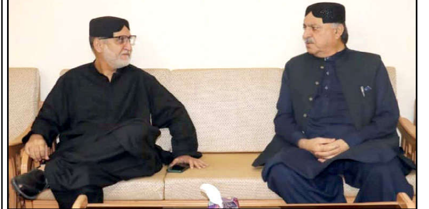
WADH: Governor Balochistan Malik Abdul Wali Khan Kakar meeting with President Balochistan National Party Sardar Akhtar Jan Mengal at his residence

Earlier, in an interview to American TVCNN, Anwar-ul-Haq Kakar said that the elections are sure to be held on time and those who influence the election will be dealt with according to the law.