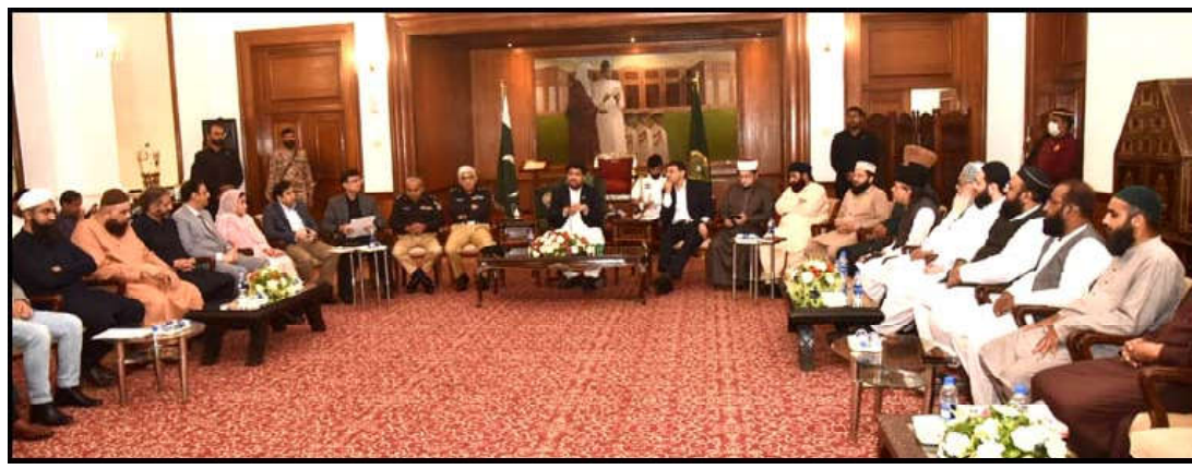
KARACHI: Governor Sindh Kamran Khan Tessori presiding over a meeting of Ulema at Governor House.

He said that the party had also expressed its willingness about the election to be held in 60 days and while respecting the wishes and consultation of the coalition parties, we agreed to hold the election within 90 days.