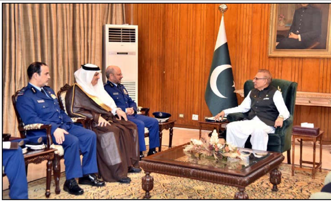
ISLAMABAD: Chief of General Staff of the Saudi armed forces, General Fayyadh bin Hamed Al-Ruwaili along with members of his delegation meeting with President Dr. Arif Alvi at Aiwane-Sadr.

eration (OIC) in highlighting the plight of the Muslims in Palestine, Kashmir and Afghanistan. He asked General Fayyadh bin Hamed to convey his warm regards to Crown Prince Mohammed bin Salman. General Fayyadh bin Hamed Al-Ruwaili said that Pakistan and Saudi Arabia enjoyed close ties in various fields since the beginning and called for further improvement in their bilateral ties. He said the Kingdom's vision 2030 would bring prosperity to the neighbouring countries and to the Islamic world. Saudi Ambassador to Pakistan Nawaf Bin Saeed Al-Malki attended the meeting.