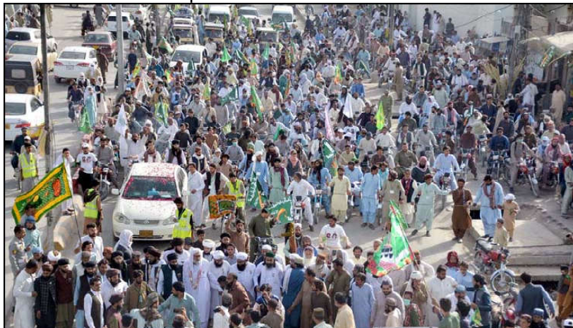
QUETTA: A view of rally in connection with Eid Milad un Nabi (SAWW).