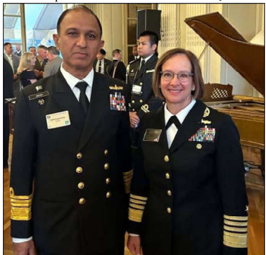
ISLAMABAD: Chief of the Naval Staff, Admiral Muhammad Amjad Khan Niazi along with Admiral Lisa M. Franchetti, US Chief of Naval Operation during the 25th International Seapower Symposium held in USA.