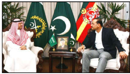
RAWALPINDI: Chief of General Staff of Armed Forces of Saudi Arabia, General Fayyadh Bin Hamed Al Ruwaili, meeting with Chief of Army Staff General Syed Asim Munir

tion with the country's partners. The second phase of the China-Pakistan Economic Corridor (CPEC), he said, had been initiated covering railway, infrastructure and manufacturing projects.