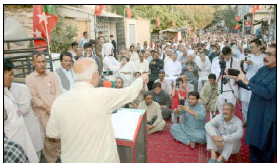
QUETTA: Chief of National Party Dr. Abdul Malik Baloch addressing a protest against inflation and increase in electricity and gas prices.