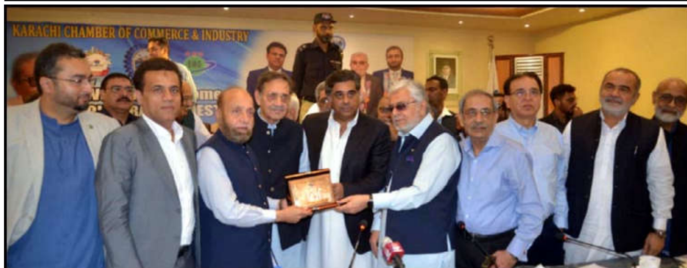
KARACHI: Caretaker Federal Minister for Commerce Industries & Production Dr. Gohar Ejaz is being presented with memento during his visit to Karachi Chamber of Commerce & Industries KCCI.