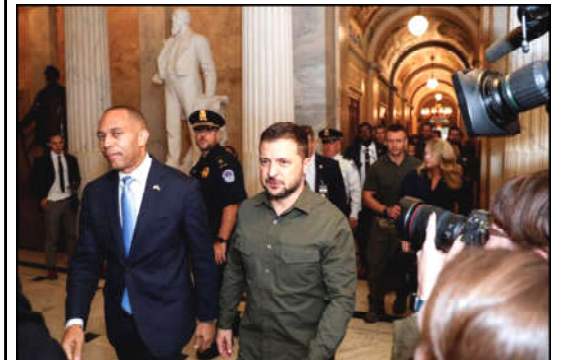
Ukrainian President Volodymyr Zelenskyy is escorted by Minority Leader of the U.S. House of Representatives Hakeem Jeffries as he arrives to meet privately with House Speaker Kevin McCarthy (R-CA) and other congressional leaders on a visit to the U.S. Capitol in Washington.

But we are unequivocal around the importance of the rule of law and unequivocal about the importance of protecting Canadians," Trudeau told a news conference in New York on the sidelines of the United Nations General Assembly. "That's why we call upon the government of India to work with us to establish processes to discover and to uncover the truth of the matter." Trudeau sidestepped several questions about when Canada might release the evidence it had, saying merely that the decision to share the allegations had not been made lightly.