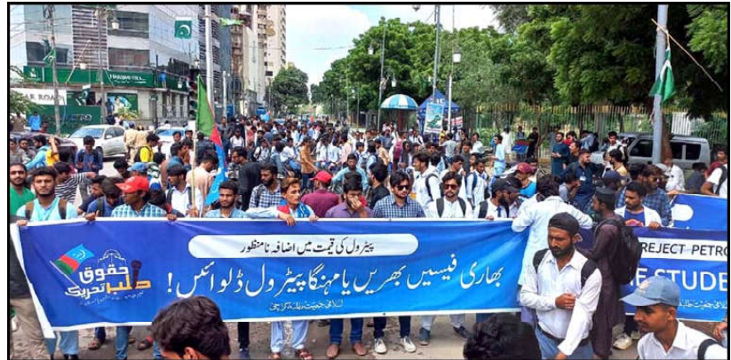
KARACHI: Members of Islami Jamiat Tulba are holding protest demonstration against massive unemployment, increasing price of daily use and petroleum products, inflation price hiking and the highly inflated electricity bills, held at Shaheen Complex in Karachi.

PINDI BHATTIAN (INP): Two passengers were killed while seven others wounded after a pick up they were travelling in turned side down on Motorway 2 near Pindi Bhattian on Thursday, rescuers and police said. The ill-fated vehicle was heading to Sargodha from Lahore at the time of the incident.