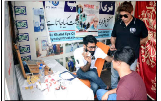
KARACHI: Patients are sitting after operation during the three-day free eye medical camp organized by Pakistan Insaan Dost Party, at Saddar Regal Chowk in Karachi.