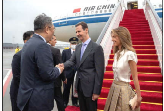
Syria's President Bashar al-Assad and his wife Asma are welcomed upon their arrival at Hangzhou airport.

of the world's worst humanitarian crises. As the Houthis left, the top diplomats of the United States, Saudi Arabia and the United Arab Emirates — a key coalition member, and influential in Yemen's government-held south — met on the sidelines of the UN General Assembly in New York. US Secretary of State Antony Blinken, in his meeting with Saudi Foreign Minister Prince Faisal bin Farhan and the UAE's Sheikh Abdullah bin Zayed, welcomed the Riyadh talks "aimed at achieving a roadmap to end the conflict."