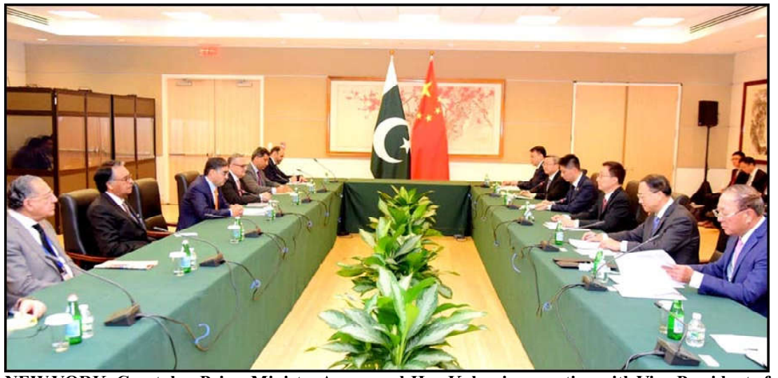
NEW YORK: Caretaker Prime Minister Anwaar-ul-Haq Kakar in a meeting with Vice-President of China Han Zheng at the sidelines of UNGA Summit in New York

The two leaders also expressed satisfaction at the celebratory events held in both countries to mark the 10th anniversary of CPEC.