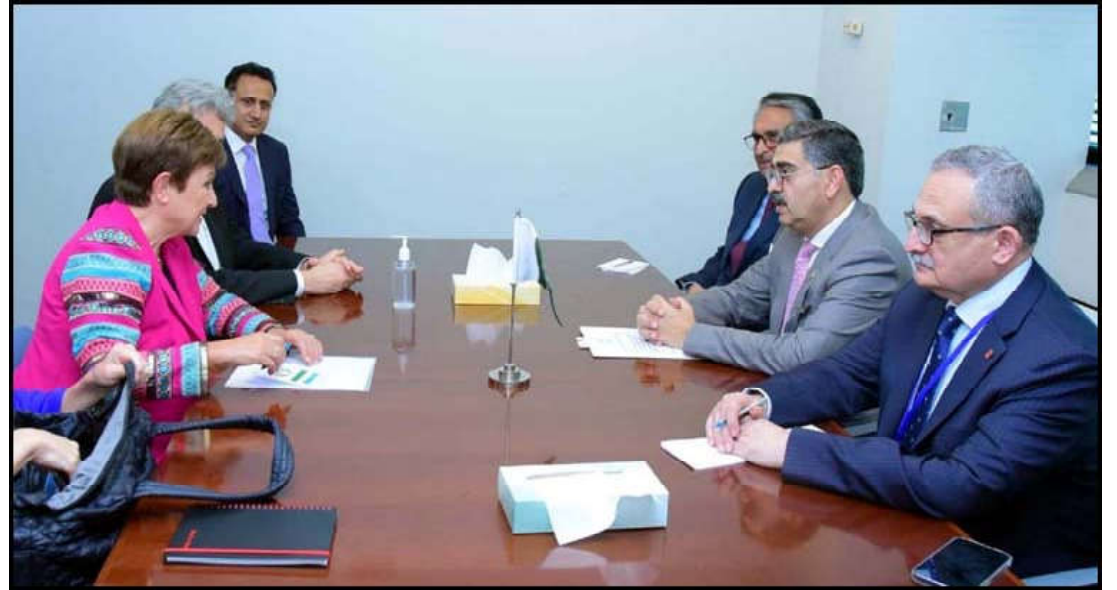
NEW YORK: Caretaker Prime Minister, Anwaar-ul-Haq Kakar in a meeting with Kristalina Georgieva, Managing Director of International Monetary Fund (IMF) on the sidelines of the 78th session of the United Nations General Assembly (UNGA), in New York.

According to the ECP, a draft code of conduct has been shared with political parties to get their feedback before finalising the rules of the game.