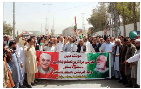
QUETTA: Activists of Pashtunkhwa Mili Awami Party (PKMAP) are holding protest demonstration for acceptance of their demands, outside Customs office in Quetta.