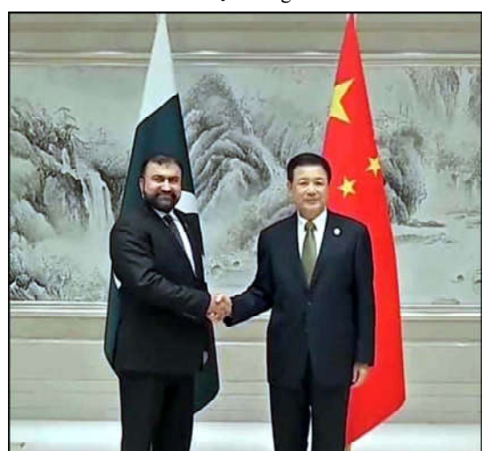
LIANYUNGANG: Federal Minister for Interior, Sarfraz Ahmad Bugti shaking hands with Wang Xiao Hong, Chinese State Councilor and Minister for Public Security in Lianyungang.

This was expressed in a bilateral meeting between caretaker Interior Minister Sarfraz Ahmad Bugti and his Chinese counterpart Wang Xiao Hong, Member of the Secretariat of CPC Central Committee, State Councilor and Minister for Public Security in Lianyungang City on the occasion of Global Public Security Cooperation Forum 2023 here Thursday.