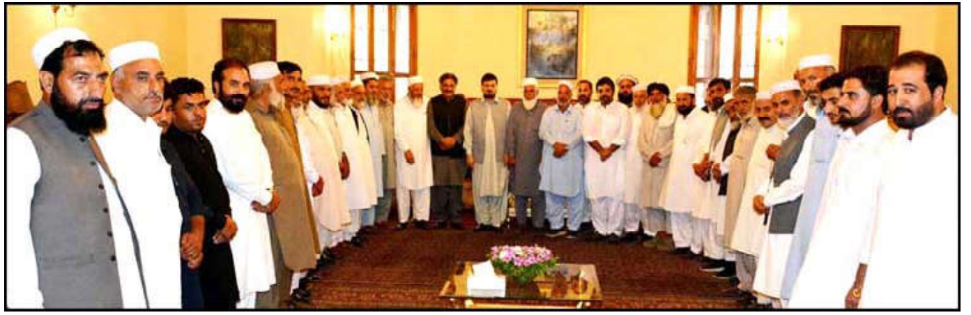
PESHAWAR: Khyber Pakhtunkhwa Governor Haji Ghulam Ali in a group photo with Dir Bala Public Jirga during meeting at Governor House.

this incident had exposed India's darker side, as well as the malicious intentions of the Modi government. Mushaal claimed that the Indian government was not only supporting terrorists but also promoting terrorism to suppress the movements for Khalistan and Kashmir freedom. She emphasised that Kashmiris had been struggling for their right to self-determination for the past 75 years, while India continued to use force to deny them their fundamental and constitutional rights. She expressed regret over the silence of the world's human rights advocates on the pressing issue, describing it as deeply unfortunate.