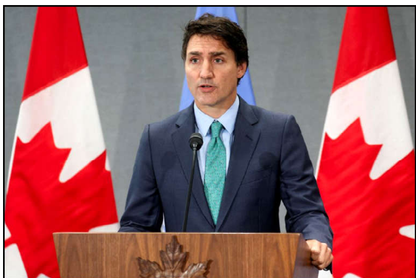
Canadian Prime Minister Justin Trudeau holds a press conference on the sidelines of the UNGA in New York, U.S.

resolutions," Yoon told fellow leaders on the second day of the U.N. General Assembly's annual gathering of leaders. He had been expected to raise the issue. Yoon said that if North Korea "acquires the information and technology necessary" to enhance its weapons of mass destruction in exchange for giving conventional weapons to Russia, that would also be unacceptable to the South. "Such a deal between Russia and the DPRK will be a direct provocation threatening the peace and security of not only Ukraine but also the Republic of Korea."