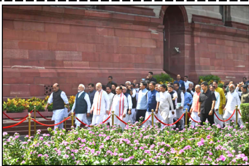
Indian Prime Minister Narendra Modi with other lawmakers walks in a procession to enter the new Parliament building, in New Delhi, India.