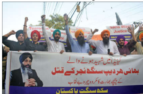
LAHORE: Sikh Community of Pakistan holds protest outside Press Club against the alleged death of Sikh person in Canada.