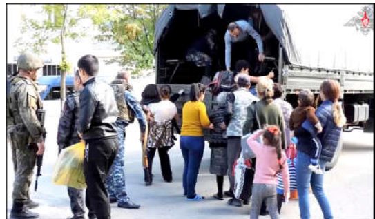
Russian peacekeepers evacuate civilians in the town of Askeran following the launch of a military operation by Azerbaijani forces in the region of Nagorno-Karabakh, a region inhabited by ethnic Armenians, in this still image from video published.

gave weapons or drones to the Russians after the war," he said, then they should produce it. Iranian officials have made a series of contradictory comments about the drones. U.S. and European officials say the sheer number of Iranian drones being used in the war in Ukraine shows that the flow of such weapons has not only continued but intensified after hostilities began. Despite his remarks about trust, Raisi's tone toward the United States wasn't all conciliatory; he had harsh words at other moments. Raisi said his country "sought good relations with all neighboring countries" in the Middle East, including Saudi Arabia and the United Arab Emirates.