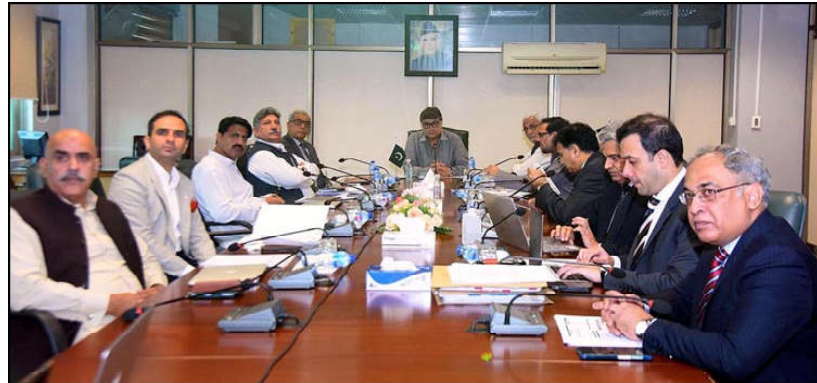
ISLAMABAD: Federal Minister for Privatization Fawad Hasan Fawad chaired a meeting on PIA in on September 20, 2023. Advisor to PM on Aviation was also present.