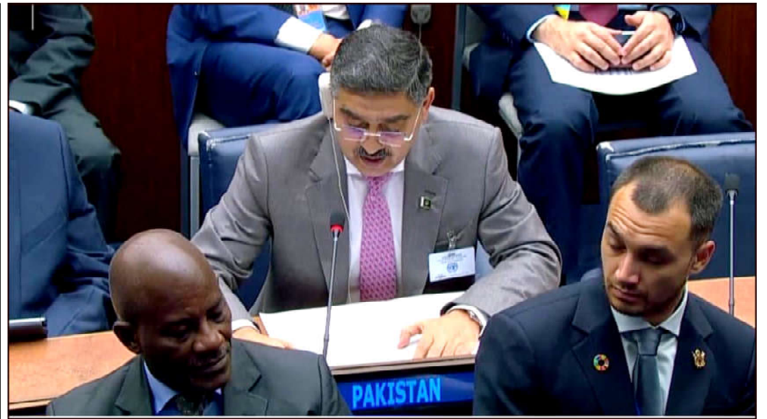
Caretaker Prime Minister Anwaar-ul-Haq Kakar addressing the Climate Ambition Summit 2023 held on the sidelines of 78th session of the United Nations General Assembly in New York

The Prime Minister further said that disaster risk management is a cross cutting priority in our national adaptation plan. Within the last year, we have taken significant steps in enhancing Pakistan's early warning capacity including by updating our national flood prediction plan. Talking about global warming, Anwaar-ul-Haq Kakar said although, Pakistan has not contributed to the problem of global warming, we have chosen to be a part of solution. He said Pakistan seeks to produce sixty percent of its energy from renewable resources by 2030.