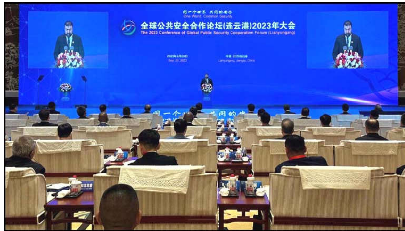
LIANYUNGANG: Federal Minister for Interior, Sarfraz Ahmed Bugti addressing the opening session of the 2023 Conference of Global Public Security Cooperation Forum in Lianyungang.