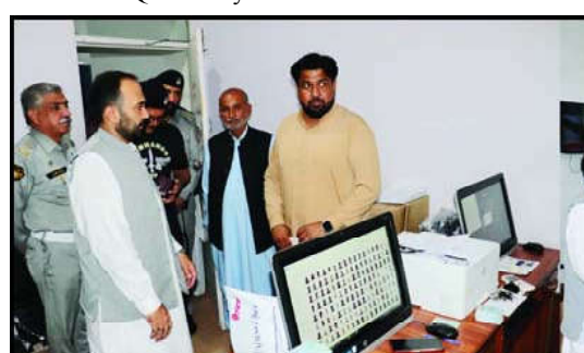
QUETTA: Provincial Home Minister Capt (Retd) Muhammad Zubair Jamali inspecting different sections during his visit to traffic police office