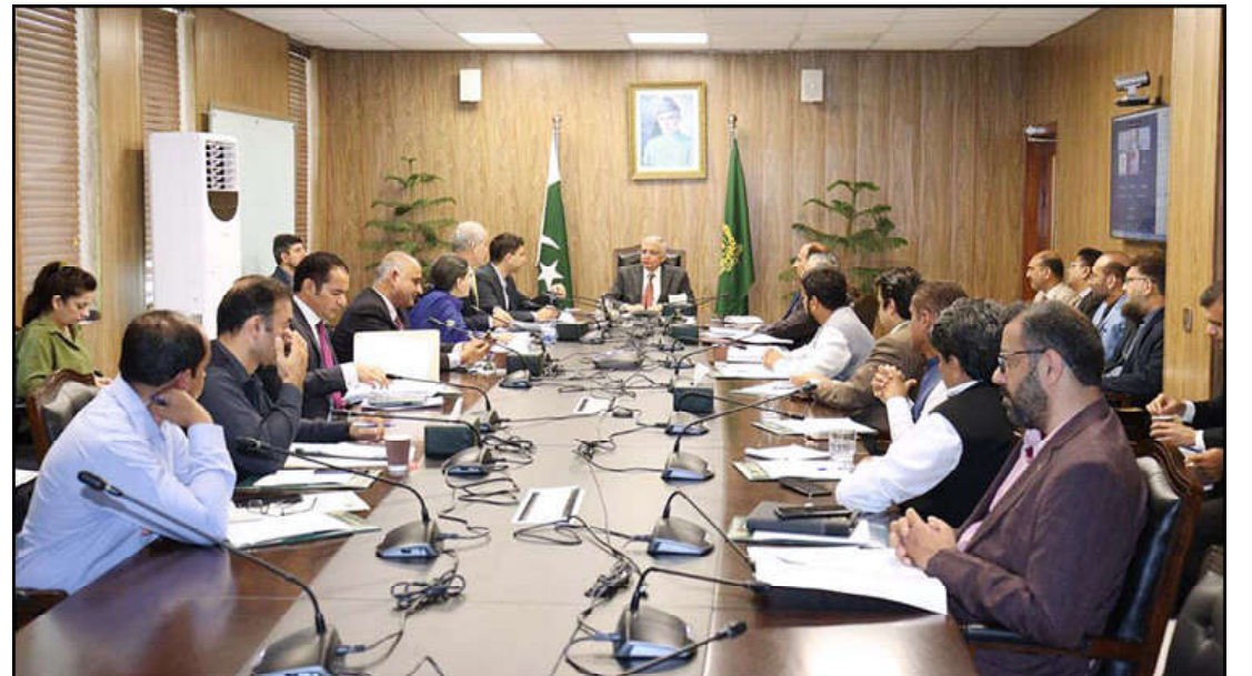
ISLAMABAD: The caretaker Minister for Planning, Development & Special Initiatives, Muhammad Sami Saeed on Wednesday chairs a meeting to "Build Consensus for Regulating Conversion of Agricultural Land to Housing Societies in Pakistan" at Planning Ministry.

containing all components of integrated balances, it is used to compute long-term energy prices under various scenarios. It is noted that in August 2022, IEP for Sustainable Development took the initiative of providing an in-person LEAP training program where relevant energy sector stakeholders were invited to participate in the training process. EPRC working under IEP started working on Pakistan's first LEAP energy model.