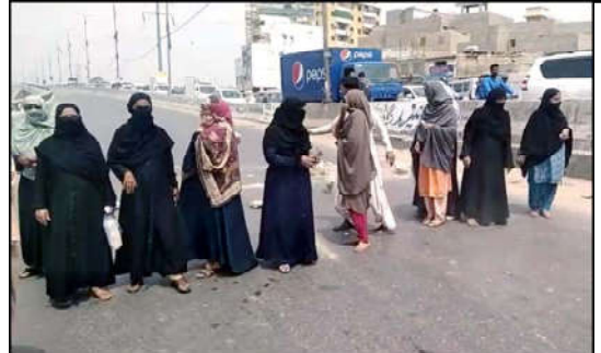
KARACHI: Residents of Mahmoudabad block road as they are holding protest demonstration against prolong electricity and sui-gas load shedding in their area, held at Baloch Colony road in Karachi.