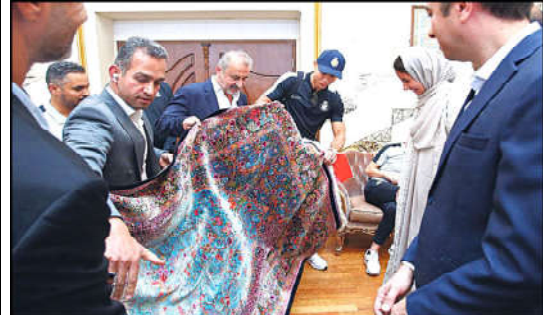
Saudi football club Al Nassr's Portuguese forward Cristiano Ronaldo (centre) being presented with a Persian rug as a gift upon arrival at Imam Khomeini International Airport, a day before a match against Iran's Persepolis club.

Monitoring Desk TAIPEI: Taiwan's defence ministry urged China on Monday to stop "destructive, unilateral action" after reporting a sharp rise in Chinese military activities near the island. The ministry said that since Sunday it had spotted 103 Chinese military aircraft over the sea, a number it called a "recent high". Its map of Chinese activities over the past 24 hours showed fighter jets crossing the median line of the strait which serves as an unofficial barrier between the two sides.