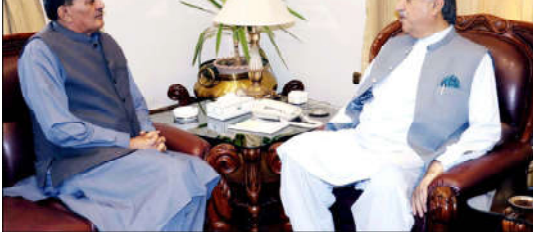
QUETTA: Caretaker Provincial Education Minister Qadir Bakhsh Baloch meeting with Governor Balochistan Malik Abdul Wali Khan Kakar

ISLAMABAD (APP): Pakistan's Ambassador to UN Munir Akram on Monday said Caretaker Prime Minister Anwaar-ul-Haq Kakar would highlight the country's core issues including Kashmir, Islamophobia and the economic situation in his address to the United Nations General Assembly on September 22.