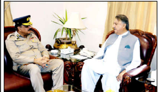
QUETTA: Inspector General National Highways, Motorway Police Sultan Ali Khawaja meeting with Governor Balochistan Malik Abdul Wali Khan Kakar

On the occasion also emphasized that every citizen should attain training of civil defence in the present circumstances, and a contingent of volunteers can be prepared by imparting training of civil defence to the students.