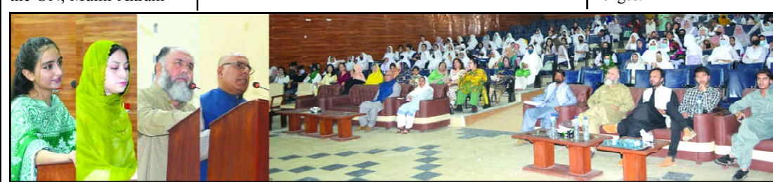
QUETTA: Caretaker Information Minister Jan Achakzai and others addressing participants of a ceremony organized by Aurat Foundation

he training programme is also aimed at enabling the talented youth of Balochistan through respectable livelihood, he added.