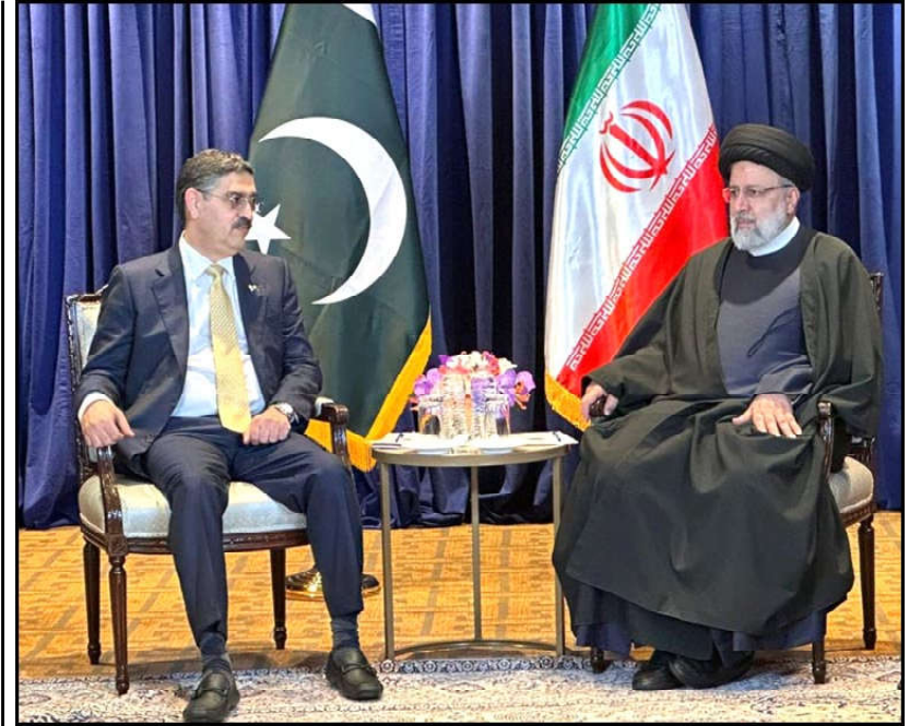
NEW YORK: Caretaker Prime Minister Anwaar-ul-Haq Kakar in a meeting with meeting with the President of Iran Ebrahim Raisi.

He expressed Pakistan's support for the GDI and commended the milestones achieved in its implementation, the most recent being the successful launch of the Inter-Agency Task Force on GDI.