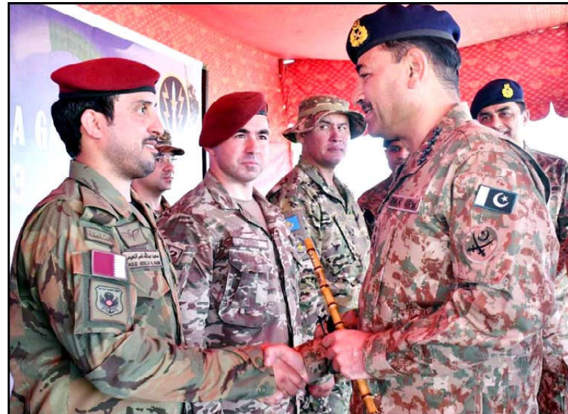
ATTOCK: Chief of Army Staff (COAS), General Syed Asim Munir interacts with participants during Opening Ceremony of Multi-National Special Forces Exercise "Eternal Brotherhood-II" at Barotha Garrison in Attock.

He assured that provincial government would extend every possible cooperation to WHO in its programmes.