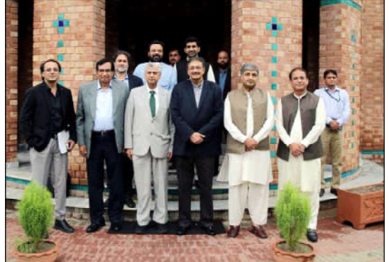
LAHORE: Caretaker Federal Minister for Information and Broadcasting Murtaza Solangi in a group photo with Pakistan Cricket Board Chairman Zaka Ashraf and other officials

were discussed in the meeting. Solangi said the PTV Sports had been playing a pivotal role to promote the sports culture and it had gained huge popularity among the viewers across the country. He reaffirmed the caretaker government's resolve and support for promoting the sports, especially cricket. The minister acknowledged the role of PCB in promoting cricket in the country.