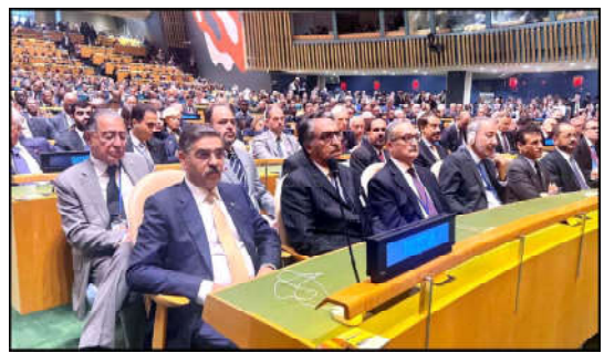
NEW YORK: Caretaker Prime Minister Anwaar-ul-Haq Kakar is attending the opening session of the General Debate of 78th UNGA session at the UN headquarters.

Earlier IMF had sought written agreement from ministry of finance on tough conditionalities to provide relief in electricity bills.