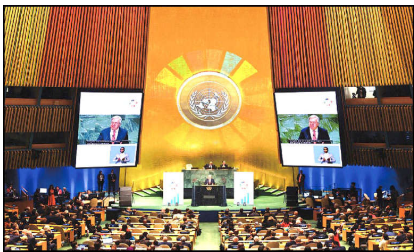
United Nations Secretary General Antonio Guterres delivers a statement during the opening of the Sustainable Development Goals Summit at UN headquarters in New York City.

adopt serious new actions to combat climate change. According to the schedule for UNGA, the "General Debate" (as it is formally known) will kick off today (Tuesday) with an address from UN Secretary-General Antonio Guterres, followed by the address by UNGA President Dennis Francis, a diplomat from Trinidad and Tobago, who will preside from the General Assembly dais for the entire week. As per longstanding tradition, Brazil will deliver the first address from a national delegation and the second one will be by the host country of the United Nations, i.e. the United States. But, in a departure from tradition, four out of the five veto-wielding permanent members of the Security Council have chosen to skip the 78th General Assembly. French President Emmanuel Macron will be busy in Paris, welcoming Britain's King Charles III on his inaugural visit to France as monarch on Sept. 20. And on Sept. 22, he is meeting Pope Francis.