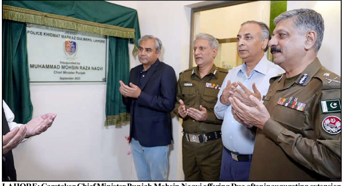
LAHORE: Caretaker Chief Minister Punjab Mohsin Naqvi offering Dua after inaugurating extension project of Police Helpline Centre at Liberty.