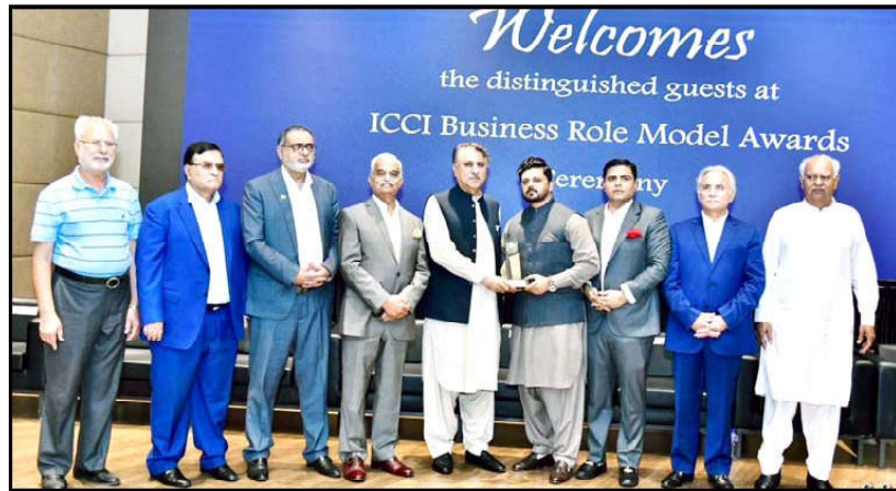
ISLAMABAD: Balochistan Governor Malik Abdul Wali Khan Kakar distributing awards under organized by Islamabad Chamber of Commerce and Industry.