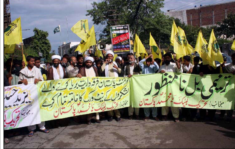
LAHORE: Members of Tehreek e Labbaik Ya Muhammad S.A.W Pakistan are holding protest demonstration against the Criminal Laws (Amendment) Bill 2023, held at Lahore press club.

ISLAMABAD (INP): In a crackdown on foreign immigrants staying illegally in Islamabad, a task force formed by intelligence agencies has rounded up 10 Afghan nationals. Sources said that those taken into custody were the supporters of a militant outfit, Daesh, and they were residing in different areas of the federal capital. They revealed that those arrested also had national identity cards (NICs) with them. Addressing a press conference in Islamabad most recently, Caretaker Prime Minister Anwaar ul Haq Kakar said that an effective policy had been put in place to stop Afghans from entering Pakistan illegally. He clarified that the policy would cover the Afghans without documents, and those who had created fake identities. He made it clear that illegal refugees would be sent back to their countries. "If someone wants to come to Pakistan, it should be through legal paths and through the issuance of visas," he said. Similarly, presiding over a meeting in Islamabad on Friday to review progress on the government's plan to crackdown on those involved in illegal practices, the prime minister said that the government would return all "illegal" Afghan immigrants to curb smuggling of goods and foreign currency so that the fast deteriorating country's economy could be revived.