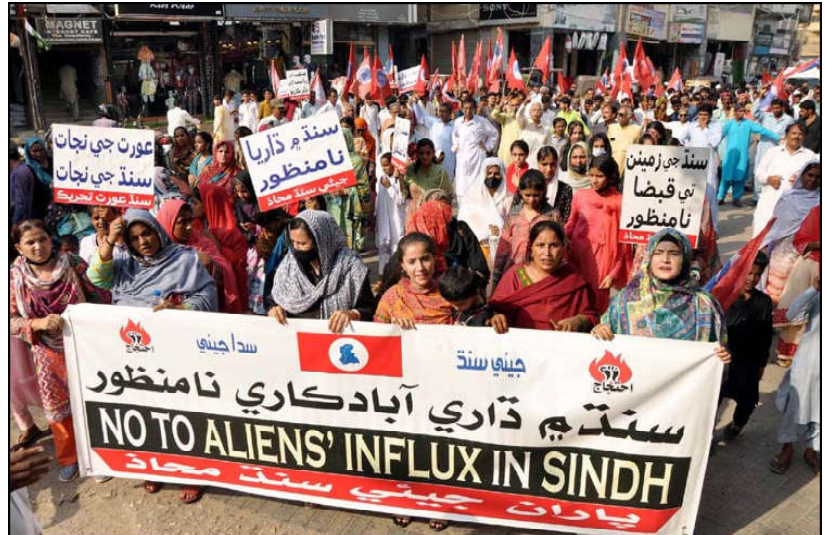
HYDERABAD: Members of Jeay Sindh Mahaz are holding protest demonstration for demanding expelling Afghan refugees from province, held in Hyderabad.