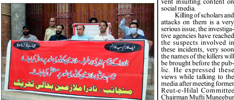
QUETTA: Members of NADRA Employees Bahali Committee are holding protest demonstration for acceptance of their demands, held at Quetta press club.

ISLAMABAD (INP): Former attorney general and prominent Supreme Court of Pakistan lawyer Irfan Qadir on Sunday said that the former chief justice had wrongfully suspended the Supreme Court (Practice and Procedure) Act 2023. In comments as Justice Qazi Faez Isa has sworn in as the 29th chief justice of Pakistan on Sunday (today), Irfan Qadir said that the incumbent CJP has to redress the decisions taken by the former chief justice of the top court. The Supreme Court (Practice and Procedure) Act 2023 — a bill that required the formation of benches on constitutional matters of public importance by a committee of three senior judges will be heard by a supreme court bench on Monday (tomorrow).