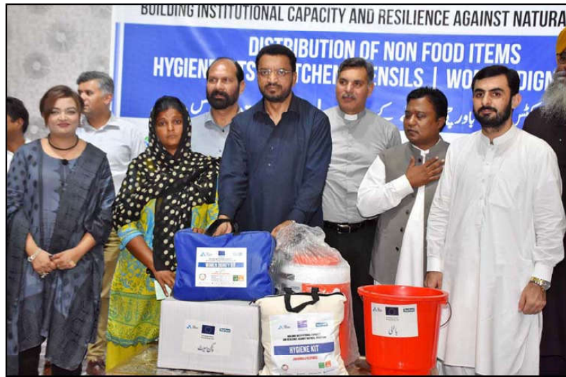
FAISALABAD: Caretaker Federal Minister for Human Rights and Women Empowerment, Khalil George, distributing non food items to the Christian community in Jaranwala.

immediate assistance and services to the flood victims during the 2022 flood are commendable. Governor Punjab further said that there are many challenges in the field of education and health for which the government is working. On this occasion, the Resident Representative of UNDP expressed interest in the possibility of collaboration with the Punjab Government in various projects to tackle the challenge of climate change.