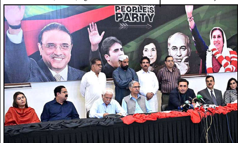
LAHORE: PPP Chairman Bilawal Bhutto Zardari talking to media persons after Central Executive Committee meeting.