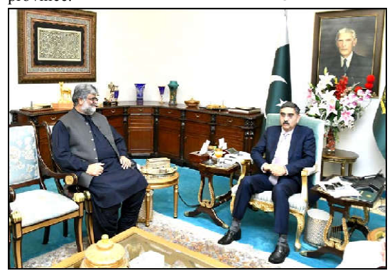
ISLAMABAD: Caretaker Chief Minister Balochistan Mir Ali Mardan Khan Domki meeting with Caretaker Prime Minister Anwarul Haq Kakar

The caretaker Chief Minister said that the circle around the hoarders and smugglers is being tightened. He appreciated the role of all institutions including forces, divisional and district administration in prevention of the hoarding and smuggling in the province.