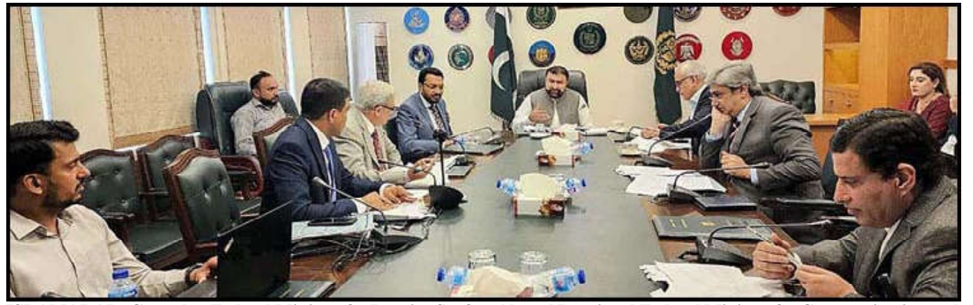
ISLAMABAD: Caretaker Federal Minister for Interior Sarfraz Ahmad Bugti and Federal Minister for Communication and Railways Shahid Ashraf Tarar during meeting of Cabinet Sub-Committee on ECL.