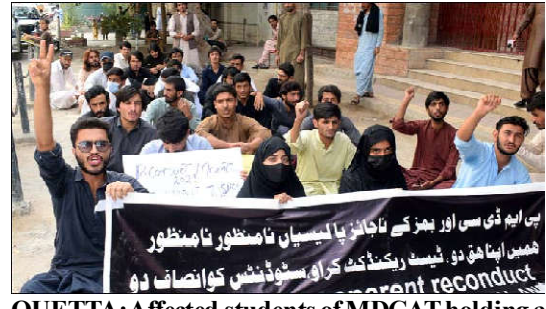
QUETTA: Affected students of MDCAT holding a protest