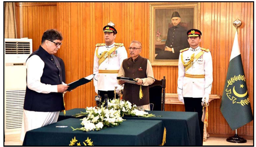
ISLAMABAD: President Dr. Arif Alvi administering the oath of office to Mr. Fawad Hasan Fawad as Caretaker Federal Minister, at Aiwan-e-Sadr.

He pointed out that operation is continuing against the power pilferers, hoarders, dollar mafia, sugar mafia and fertilizer mafia all over the country and it will continue.