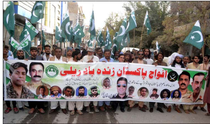
QUETTA: Members of Pakistan Muttahida Mahaz are holding rally to expressing their solidarity with Pakistan Armed Forces, at Quetta press club.

He reiterated the government's resolve to bring the elements involved in terrorism incident to justice. The Minister Information also said that the moral of security forces are high and the people are standing with them. He also asserted that no one would be allowed to spoil peaceful environment of the province.