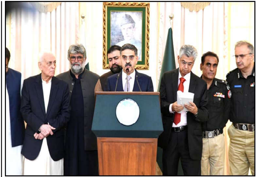
ISLAMABAD: Caretaker Prime Minister Anwarul Haq Kakar addressing a Press conference after a meeting. Caretaker Chief Minister Balochistan Mir Ali Mardan Khan Domki is also present