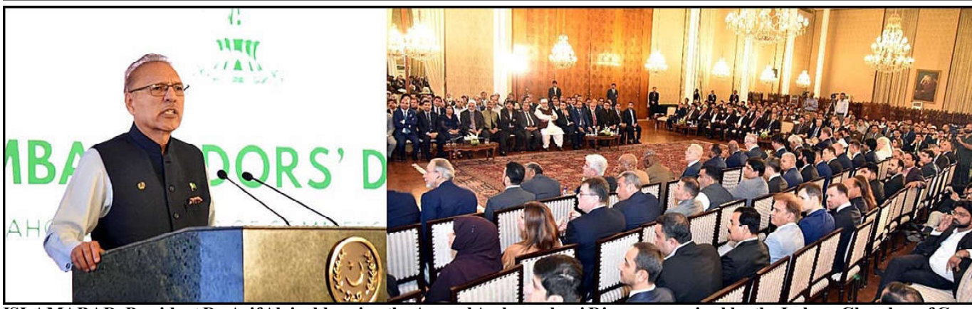
ISLAMABAD: President Dr. Arif Alvi addressing the Annual Ambassadors' Dinner, organized by the Lahore Chamber of Commerce & Industry, at Aiwan-e-Sadr.