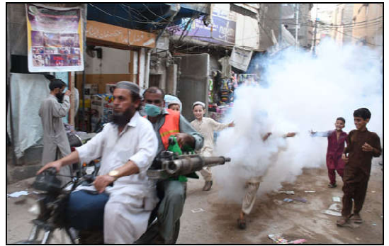
KARACHI: Workers of KMC are spraying Anti Dengue spray in the streets of Sultanabad area to decrease the rising ratio of Dengue patients in Provincial Capital.