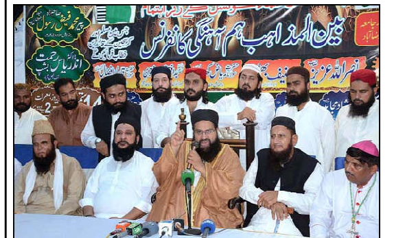
FAISALABAD: Chairman Pakistan Ulama Council & President International Faith Harmony Council Hafiz Tahir Mahmood Ashrafi is addressing to the "Interfaith Harmony Conference" at Razaabad.

He said that minorities were safe and enjoying their rights in the country and added that certain forces were fomenting strife and trying to wedge difference between majority and minority. He said the government was fully aware of these activities and resources were being utilized to wipe out enemies that were hidden. He also directed to construct damaged wall of Saint Lucas Church and assured steps to protect religious places of minorities. The minister said that matters would be reviewed about protection of temples and illegal allotment cases. The ceremony was also attended by minority community leaders, religious figures, deputy commissioner, District Khateeb and pastors of all the churches of Hazara.