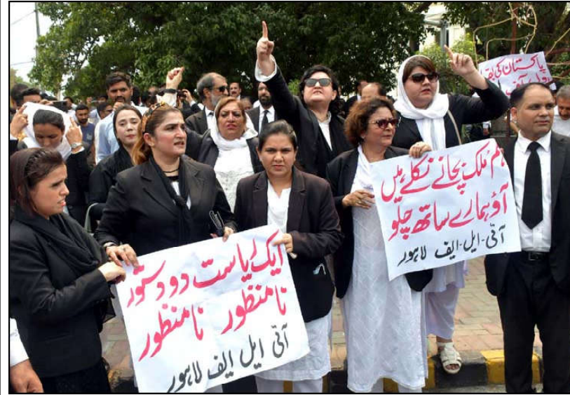
LAHORE: Members of Insaaf Lawyer Forum (ILF) are holding protest rally for demanding General Elections after the dissolution of the National Assembly, outside Punjab Assembly in Lahore.