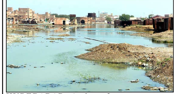
HYDERABAD: A view of sewerage water accumulated on the road outside railway workshop.