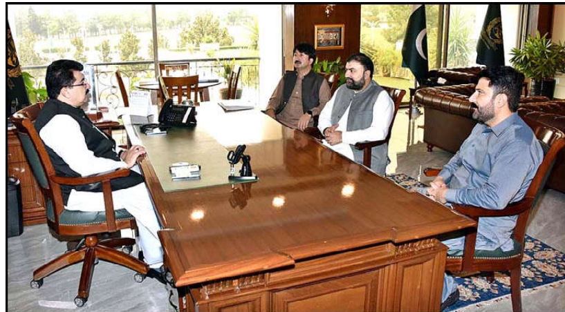
ISLAMABAD: Interim Interior Minister, Sarfraz Bugti called on Chairman Senate, Muhammad Sadiq Sanjrani at Parliament House.

while addressing a hurriedly called press conference at the Board office on Thursday afternoon. She declared the result of Intermediate examination for the year 2023 and announced that a total of 95,220 candidates had appeared in the examinations. Out of them, 88,732 candidates could pass the examinations showing pass percentage of 93.20 percent. The Controller informed that 2780 candidates remained absent during papers of different subjects in the examinations. Moreover, the result of 38 candidates were cancelled because of using unfair means in the annual examinations, she maintained.