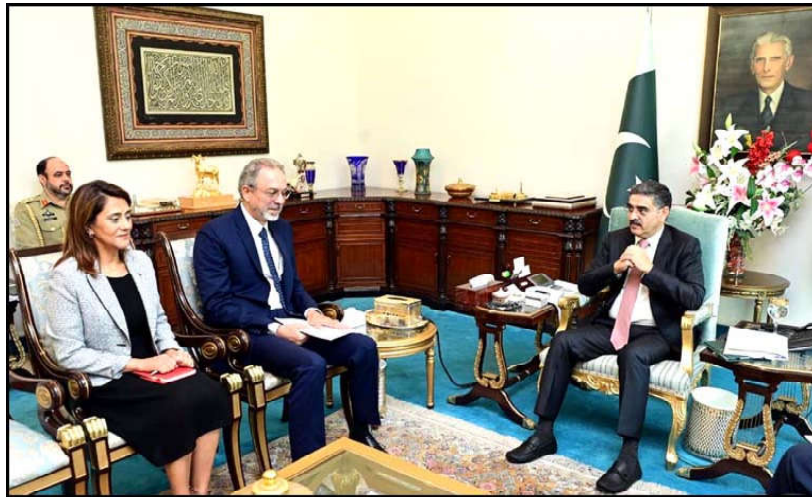
ISLAMABAD: Caretaker Prime Minister, Anwaar-ul-Haq Kakar exchanging views with Mehmet Pacaci, Ambassador of Turkiye during meeting held in Islamabad.

ISLAMABAD (INP): The inflation-hit masses are all set to get another shock, as the prices of petroleum products are expected to see a staggering rise over the weekend. A proposal prepared to increase the prices of petrol and diesel from September 16 has come to light. A working paper has been prepared for making changes in the prices of petroleum products. According to the working paper, the prices of petroleum products are proposed to be increased by Rs20 from September 16, sources say. It suggests that the price of petrol would be raised by Rs20, high speed diesel Rs14 per liter, kerosene oil Rs10 and light diesel Rs9, the sources added. It has also been proposed to increase the ex-refinery price of petrol by Rs13.5, the sources added, after which the ex-refinery price of petrol would rise from Rs228.59 to Rs242.10.