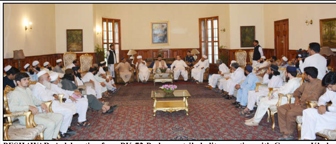
PESHAWAR: A delegation from PK-72 Peshawar tribal elites meeting with Governor Khyber Pakhtunkhwa Haji Ghulam Ali.

Mahmood Ashrafi announced the 'Seerat Rehmat-ul-Alameen Conference' to be held across the country from the first to the end of Rabi-ul-Awwal to educate the public about the teachings of the Prophet Muhammad (Peace Be Upon Him) regarding the rights of minorities, women and humanity as a whole. Furthermore, he said the PUC and Christian leadership would host joint Seerat Conferences in Lahore and Islamabad to facilitate dialogue and collaboration between Muslim and Christian leaders on matters of shared concern. He said Chief of Army Staff General Syed Asim Munir and Prime Minister Anwar ul Haq Kakar had jointly called for stringent actions against hoarders of dollars, flour, sugar, and those involved in electricity and gas theft. They emphasized that individuals responsible for exacerbating artificial economic crises should not be granted any leniency, he added. Ashrafi underscored the fundamental right of every Pakistani.