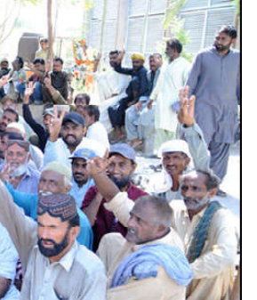
HYDERABAD: Leaders and workers of HDA Labor Union (CBA) hold a sit in protest after suspend water supply from the filter plants at Jamshoro road filter plant against non-payment of their salaries and pensions as water supply is suspended in Qasimabad and Latifabad area of the City.