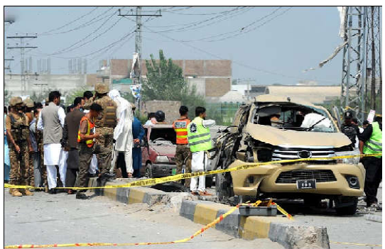
PESHAWAR: Pakistani security officers examine a damaged vehicle at the site of a roadside bombing in Peshawar.

The Asian Ombudsman Association is a major non-political, independent and professional body of international character representing more than two thirds of the world population.