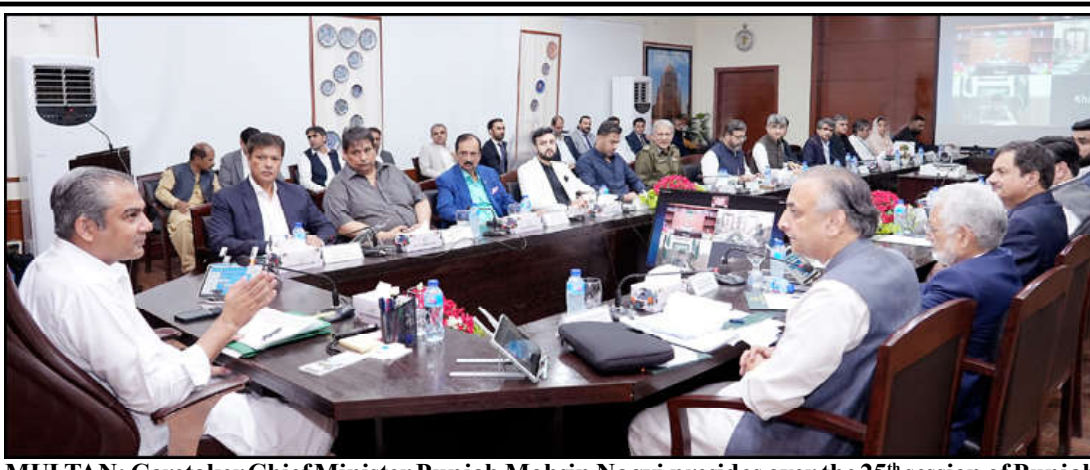
MULTAN: Caretaker Chief Minister Punjab Mohsin Naqvi presides over the 25 th session of Punjab cabinet South Punjab Secretariat Multan.