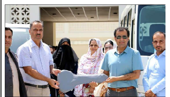
Chairman Gwadar Port handing over keys of coaster and van to Executive Director Pak-China Vocational Institute Gwadar University.

He said that if the people have any complaints regarding the PHE department, they can contact him directly.