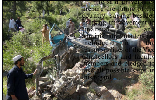
ABBOTTABAD: People standing near an accidental vehicle, on sherwan road as several people sustained serious injuries during the accident due to the over speeding.

irregularities in different universities, and inquiries conducted on the complaints filed by the students and general public. During the meeting, they also discussed matters relating to surplus staff and less number of students in the universities. Speaking on the occasion, Governor Khyber Pakhtunkhwa said that offices are sacred trust of the county and nation, saying performing duties with honesty should be the mission of all of us. He said that the prevailing financial problems of the universities are a matter of concern and that the situation of the public universities is hurting him.