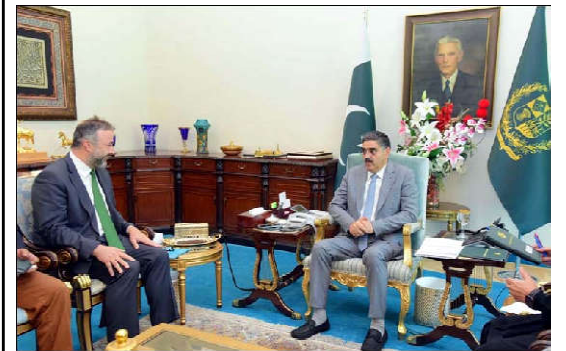
ISLAMABAD: Caretaker Prime Minister, Anwaar-ul-Haq Kakar exchanging views with Najib Benhassaine, Country Director World Bank during meeting held in Islamabad.

The Ministry of Foreign Affairs (MoFA) said that the closure of the Torkham crossing and fir