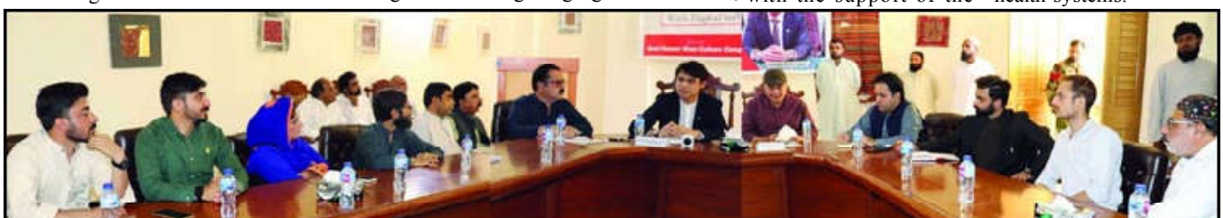
QUETTA: Caretaker Minister for Sports and Culture Nawabzada Jamal Raisani expressing his views during a ceremony regarding Digital Influencer.

The connections of the defaulters are also being disconnected.