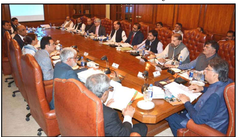
QUETTA: Governor Balochistan Malik Abdul Wali Khan Kakar presiding over meeting of Senate of Balochistan University

based operation was conducted in Kuchlak by the administration in collaboration with concerned agencies. During the IBO, three godowns were raided and recovered some 250 tons of sugar and 750 tons of Urea fertilizers from there. During the IBO, around