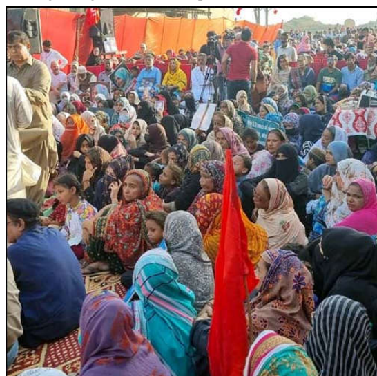
KARACHI: A large number of workers, heirs of the martyrs, political and social workers and civil society activists gather during condolence ceremony in connection of the 11th anniversary of Baldia factory fire tragedy arranged by National Trade Union Federation (NTUF) held in Karachi.