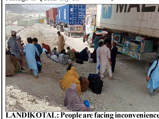
LANDIKOTAL: People are facing inconvenience after Torkham border closed due to an exchange of gunfire between Afghan and Pakistani forces, in Torkham Border.