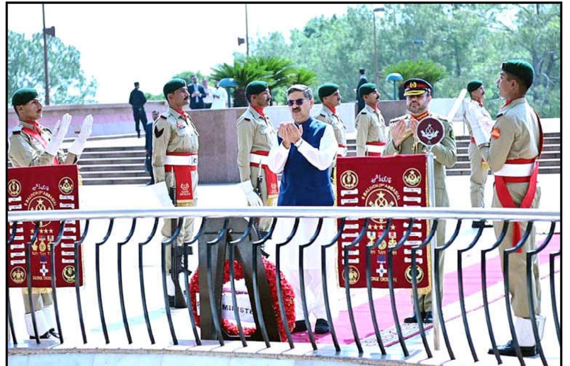
ISLAMABAD: DEFENCE & MARTYRS DAY: To pay homage and tribute to the Martyrs & Ghazis of the 1965 war, Caretaker Prime Minister Anwaar-ul-Haq Kakar laying floral wreath and offering Dua at Pakistan Monument.

He said the way the martyrs receive peace and blessings after death, they would have been longing for sacrificing their lives again and again.