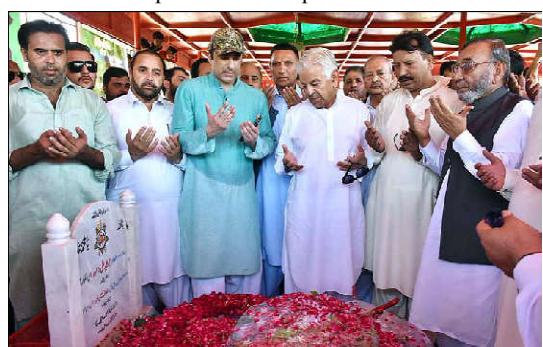
SIALKOT: Former Defence Minister Khawaja Muhammad Asif offering Fatcha after laying wreath on the grave of Army Martyrs at Chawinda.