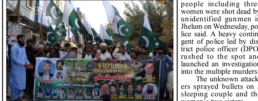
QUETTA: Members of Pak Civil Soldier Organization are holding celebration demonstration to pay homage to the Ghazis and Shuhada of 06 September 1965 Indo-Pak War on the occasion of Defence Day of Pakistan, at Quetta press club.