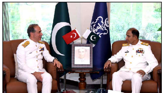
ISLAMABAD: Chief of the Naval Staff, Admiral Muhammad Amjad Khan Niazi exchanging views with Admiral Erucment Tatlioglu, Commander Turkish Naval Forces during meeting held at Naval Headquarters in Islamabad.

Moreover, the prompt implementation of the proposed federal projects of dams in Panjgur and Awaran should also be ensured, the caretaker Chief Minister directed further.