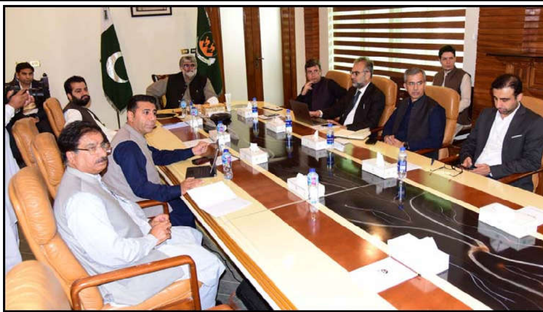
QUETTA: Caretaker Chief Minister Balochistan Mir Ali Mardan Khan Domki being briefed about affairs of Irrigation department

Force and nation responded to Indian aggression on every front. Pakistani Armed Forces did not allow the enemy to take even an inch of the motherland, for which the entire nation paid tribute to the Pakistani armed Forces. By showing courage and bravery, our Armed Forces sacrificed their lives to protect Pakistan and uprooted the enemy's feet and became invincible for the defense of the motherland, she noted. Senator Samina Mumtaz Zehri said, "Today we have to renew our pledge that we would not let the sacrifices of our great martyrs go in vain and we could always maintain the same spirit of faith."