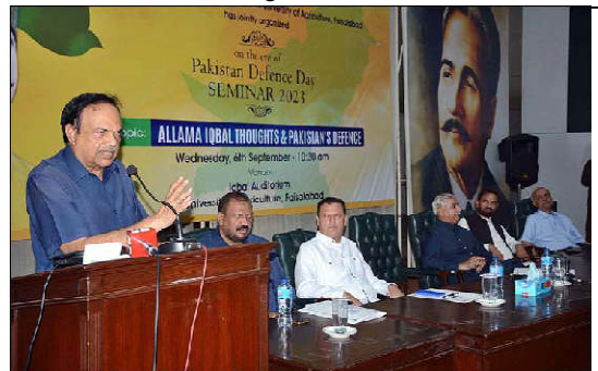
FAISALABAD: Caretaker Provincial Minister for Law & Parliamentary Affairs Punjab Kanwer Muhammad Dilshad is addressing a seminar on "Allama Iqbal Thoughts & Pakistan's Defence" arranged by University of Agriculture Faisalabad (UAF) to mark Pakistan Defense Day.

MULTAN (APP): Pakistan People's Party (PPP) Senator, Syed Yusuf Raza Gilani, said that the Armed Forces defending our borders were our heroes and they would not compromise on their respect and reverence. In a message on Defence Day issued here on Wednesday, he said it was a day of renewed pledge to defend our motherland, and they would not hesitate in rendering sacrifices for it. The former Prime Minister informed that the Armed Forces, with the backing of the nation, repulsed the attack on Lahore, Sialkot, and desert areas of Sindh on September 6, 1965, with full force. Senior leader PPP stated that the Armed Forces set unprecedented examples of gallantry by laying their lives in the war adding that his party had always taken extraordinary steps for the forces in its regimes.