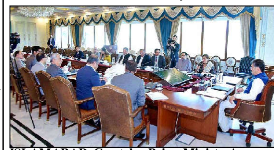
ISLAMABAD: Caretaker Prime Minister Anwaar-ul-Haq Kakar chairs a meeting on Federal Board of Revenue and Privatisation.

ISLAMABAD (APP): Speaker National Assembly Raja Pervez Ashraf Wednesday said that people and Pakistan's armed forces are intertwined in an unbreakable bond. He said that the Pakistani people and its Armed Forces are always ready to offer any kind of sacrifice for the protection of the country. He also said that Pakistan is bound to progress and develop as it is blessed with patriotic people. Raja Pervez Ashraf expressed these views while talking to media representatives during his visit to the tomb of Shaheed Captain Sarwar Muhammad Shaheed in Gujranwala on the occasion of Defence Day. The speaker said that the people of Gujranwala, a land of Martyrs, would continue to sacrifice their lives to protect Pakistan. He said, "We are a nation of peaceful people but would prove an unbreakable wall to defend our motherland from any nefarious designs of enemies. While denouncing the 9th May vandalism he said, any action to create a chasm between people of Pakistan and its Armed Forces would never succeed." He said that no sane individual can dare to create a chasm between people and their forces. Raja Pervez Ashraf said that sacrifices rendered by our Armed Forces personnel are written in golden words in the bright annals of Pakistan's history. Later on, the speaker also visited the mausoleum of Shaheed Sawar Muhammad Hussain Shaheed in Gujranwala. He said that Pakistan is blessed with brave Armed Forces who are always ready to sacrifice their lives for the protection of the country.