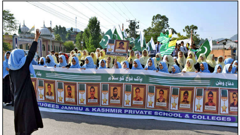
MUZAFFERABAD: Students of different Schools and Colleges shouting slogans in the favor Pak Army and Pakistan during demonstrations to mark the "Defense Day" in the Capital of A.J.K.