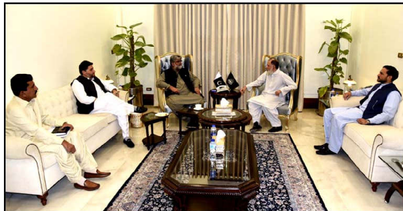
QUETTA: Caretaker Provincial Minister Prince Ali Ahmed Baloch meeting with Caretaker Chief Minister Balochistan Mir Ali Mardan Khan Domki