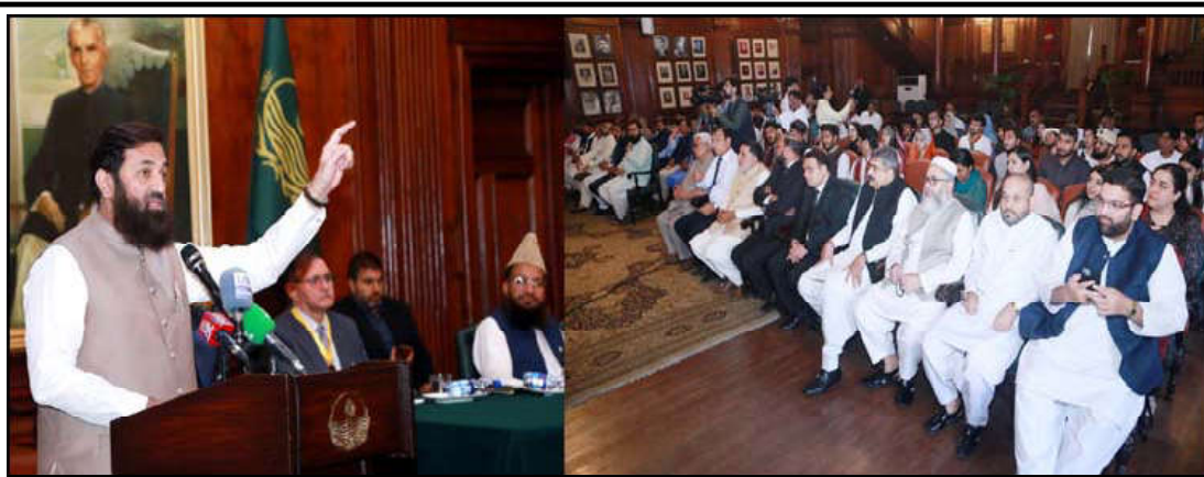
LAHORE: Governor Punjab Muhammad Balighur Rehman addressing ceremony organized in connection with Pakistan Defence Day at Governor House

aminations every month to detect breast cancer at early stages and seek medical advice in case of any abnormalities. Highlighting that women make up almost 50 percent of the population, she emphasized the importance of broadcasting messages related to breast cancer and mental health through various media channels, including TV, radio, dramas and newspapers. The First Lady also advocated for individuals with disabilities, calling for their job quotas in both the public and private sectors. She applauded the progress made in spreading awareness about breast cancer over the past five years, resulting in a higher number of cases being diagnosed at stages 1 or 2, which are curable. She stressed the need for con-