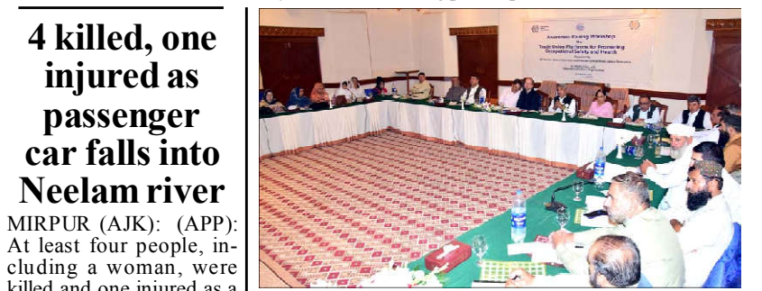
QUETTA: President All Pakistan Labour Federation Sultan Muhammad Khan and others addressing awareness-raising workshop on Trade Union Platforms for promoting Occupational Safety and Health.