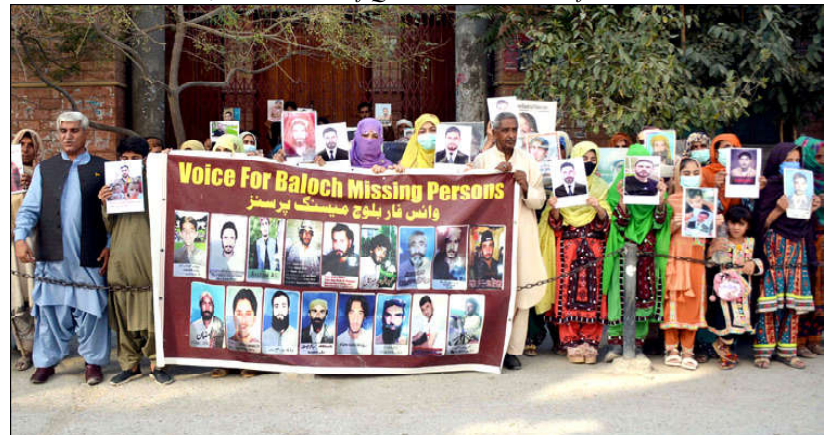
QUETTA: Relatives of Missing persons hold a protest in favor of their demands outside press club, in Provincial Capital.

While per kilogram sugar was available at Rs. 210 per kilogram in the main and other parts of the city, the same was being sold at Rs. 220 per kilogram in the outskirts of Quetta, the sources informed.