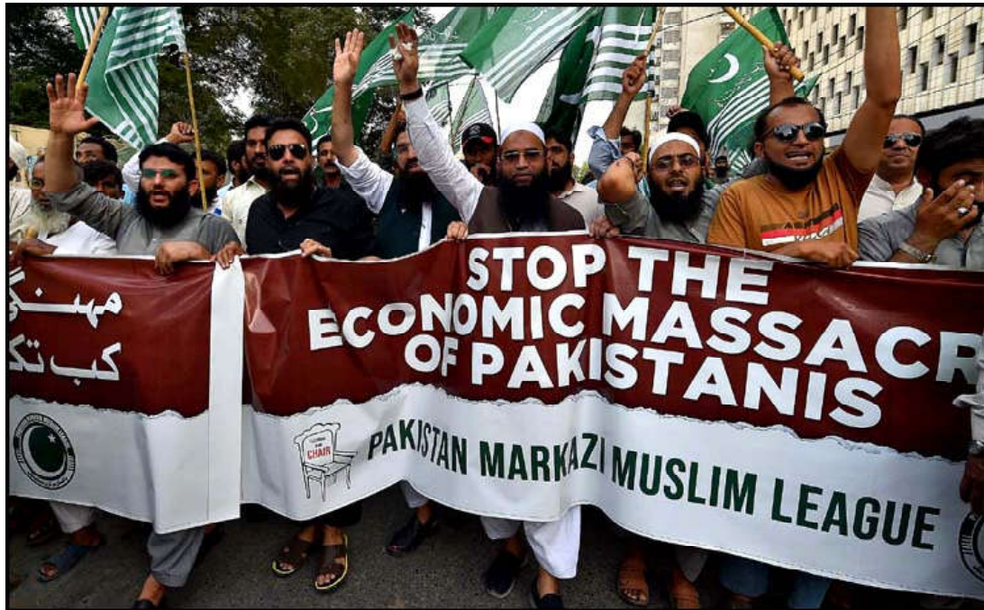
KARACHI: Activists of Pakistan Central Muslim League hold a protest in favor of their demands outside press club, in Provincial Capital.