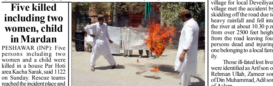
QUETTA: Members of Tanzeem Hidayat Noor League are holding protest demonstration against desecration of Holy Quran in Sweden and Denmark, at Quetta Press Club.