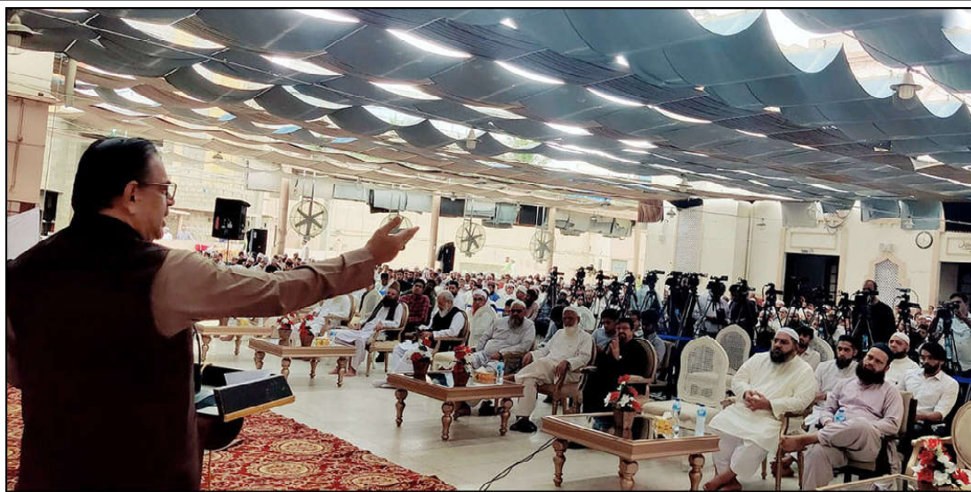
KARACHI: Caretaker Federal Minister for Religious Affairs and Interfaith Harmony Aneeq Ahmed addresses to teachers, students at Jamia Banoria Almia.