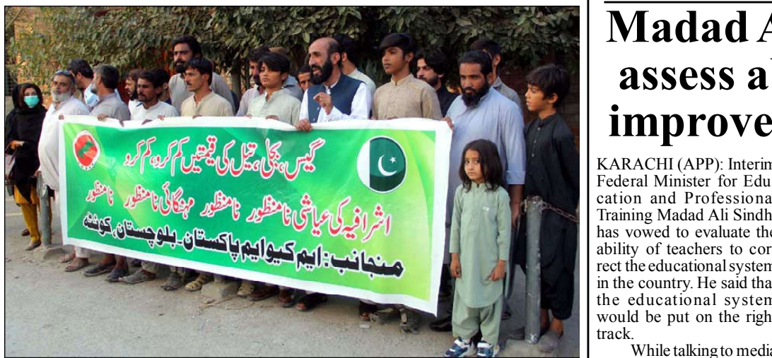
QUETTA: Activists of Muttahida Qaumi Movement (MQM-P) are holding protest demonstration against massive unemployment, increasing price of daily use products, inflation price hiking and the highly inflated electricity bills, at Quetta Press Club.