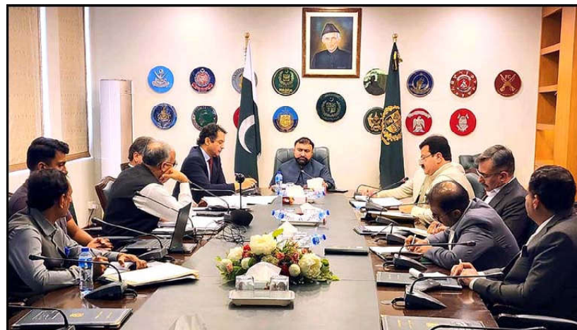
ISLAMABAD: Caretaker Federal Minister for Interior, Sarfraz Ahmad Bugti chairing meeting regarding anti smuggling measures.

Under the given situation, the Balochistan government urged all the stakeholders to give priority to welfare and safety of the affected persons instead of taking political advantage of the issue.