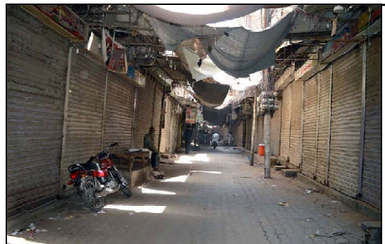
MULTAN: View of business activities seen closed while market gives desert look during the shutdown strike called by trader community against inflation price hiking and the highly inflated electricity bills, in Multan.

He appreciated the efforts of KPCTA to promote tourism and facilitate visitors and said that the hospitality of KP people in well known in the world. He also highlighted the steps of KPCTA to boost tourism and said that the government would provide all the needed assistance and cooperation to visitors.