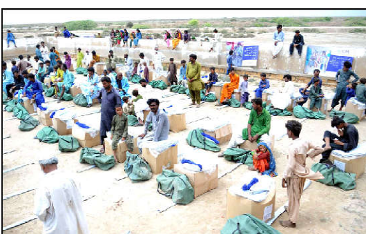
THATA: Villagers of Coastal belt near Ketibandar district Thatta sits with tool kits and NFIs kits, during distribution of Emergency kits for survival in disaster, by Welfare Foundation with collaboration with IOM (International Organization for Migration, a part of UN).