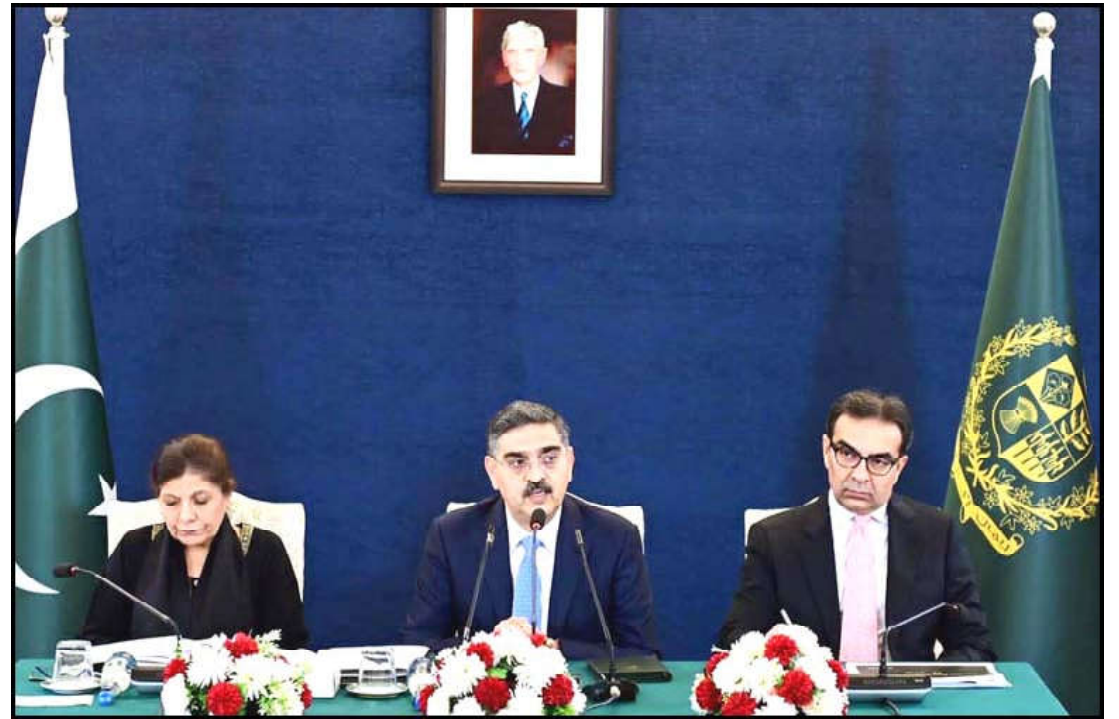
ISLAMABAD: Caretaker Prime Minister Anwaar-ul-Haq Kakar talking to Anchors and Journalists in a meeting at the Prime Minister's House.

He said the caretaker government was formed for the continuity of constitutional order, and was dealing with economic and security challenges.