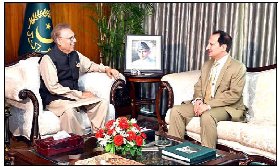
ISLAMABAD: Caretaker Federal Minister for National Health Services Regulations and Coordination, Dr Nadeem Jan, calls on President Dr Arif Alvi, at Aiwan-e-Sadr.