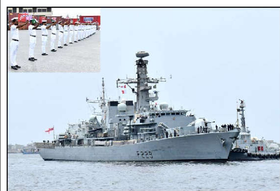
UK Ship HMS LANCASTER arrives at Karachi port

Suffice to observe here that this petition was admitted for regular hearing, when this news became talk of the town that vacancies in the Government departments in general and in the Education department in particular are offered to be sold out against illegal gratification and even during course of hearing of this petition along with connected petitions, a number of litigants are appearing before the court and lamenting complaining about the issue, therefore, it appears that the recruitment process in the public sector departments are neither transparent nor impartial.