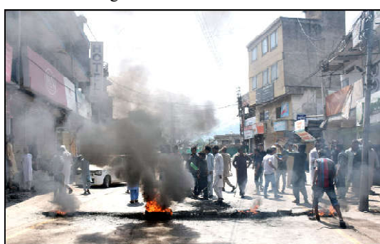
MUZAFFERABAD: People burn tyre during protest by Awami Action Committee against unjust price hike of electricity and unbearable inflation in the Capital of Azad Jammu and Kashmir.