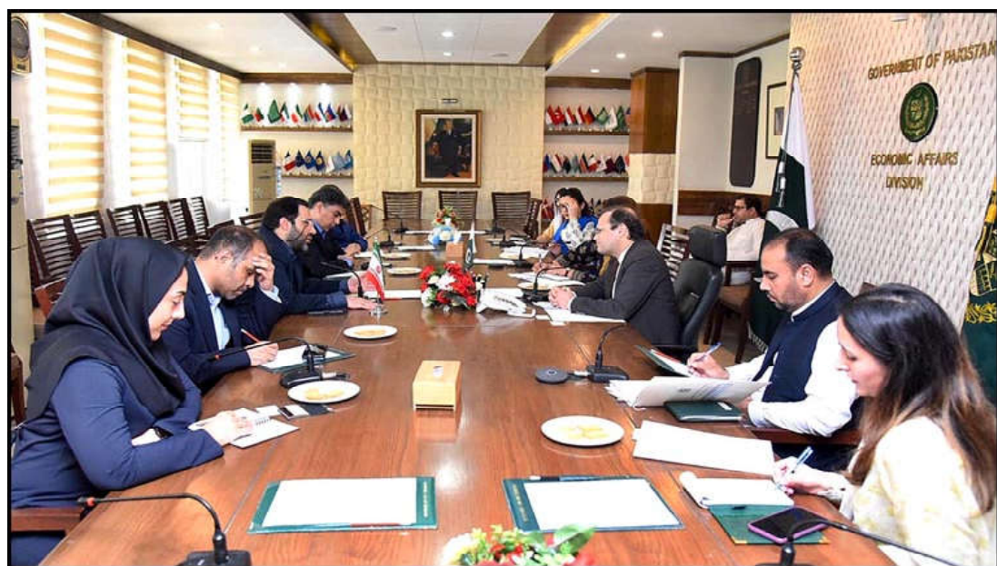
ISLAMABAD: Iranian Deputy Minister for Economics and Finance calls on the Acting Secretary Ministry of Economic Affairs.