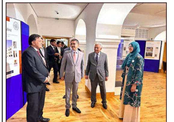
Caretaker Prime Minister Anwaar-ul-Haq Kakar visits the Oxford Centre for Islamic Studies

Regarding alleged US involvement in PTI Chief's ousting from the power, he said PTI members have retrieved from that allegation.