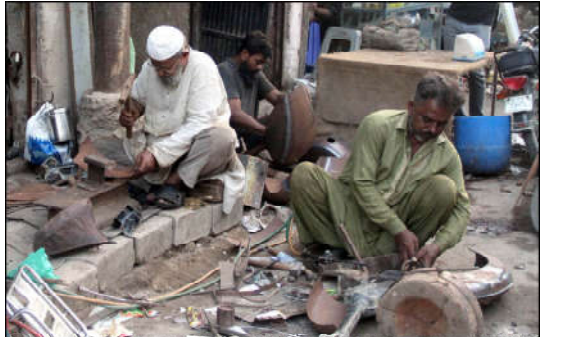
KARACHI: An iron smiths are busy in their work at shop in Eid Gah area in Provincial Capital.

for Commerce, Industries and Production Dr. Gohar Ejaz, also suggested carrying out a Forensic Audit of all recent imports of Plastics (Polyethylene) during the last four to six months and the importers should be asked to clarify how and through what channel the payments have been made to foreign suppliers for import from a neighbouring country.