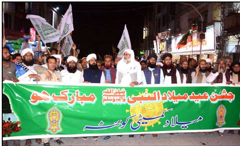
QUETTA: Members of Milad Committee hold rally in connection with 12 Rabi Ul Awwal.