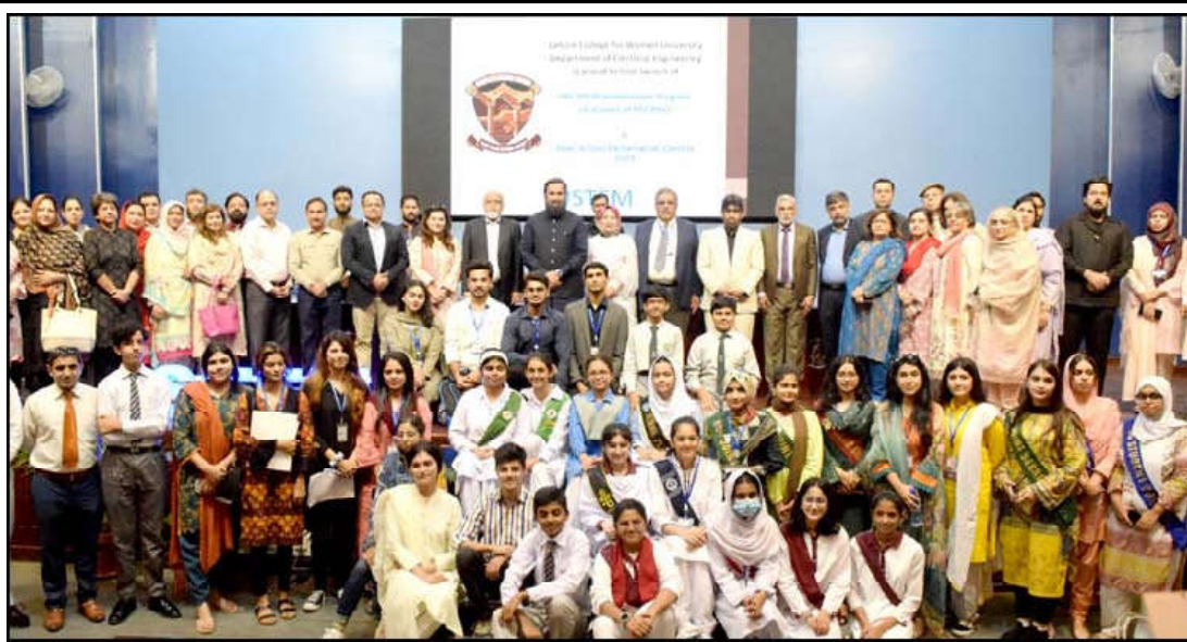
LAHORE: Governor Punjab Muhammad Balighur Rehman in a group photo with Vice Chancellor and others during a ceremony of Stem Ambassador Program at Lahore College for Women University.

the STEM initiative of PEC, he said that arranging activities in various educational institutions for the promotion of scientific studies among the youth under STEM is commendable. He said that this program will help universities and schools to work together and impart science education to the children. It will definitely help in increasing the trend of STEM education, he added.