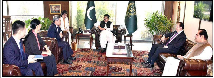
ISLAMABAD: Chinese Ambassador to Pakistan, Jiang Zaidong calling on Chairman Senate of Pakistan Muhammad Sadiq Sanjrani at the Parliament House.

Chairman Senate expressed his intent to draw inspiration from China's experiences in the realms of agriculture and mining, culminating in the potential strengthening of a "Strategic Cooperation Partnership" that would further enhance Pakistan-China relations.