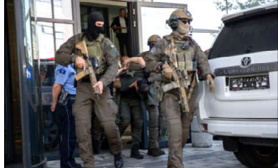
Kosovo police members of Special Intervention Unit escort one of the arrested Serb gunman out of the court after the Kosovo shootout in capital Pristina.

not the only, headwind is Russia's war of aggression against Ukraine, and how China positions itself on this issue," he said. Dombrovskis spoke before high-level economic and trade talks with Chinese Vice Premier He Lifeng. EU leaders have expressed concern about the bloc's growing trade deficit with China, which reached 396 billion euros last year. European Commission President Ursula von der Leyen recently announced an investigation into Chinese subsidies to electric vehicle makers, saying a flood of cheaper Chinese cars is distorting the European market.