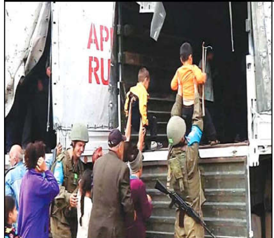
KHANKENDI: In this videograb released by the Russian Defence Ministry, Russian peacekeepers help evacuate refugees from this town, also called Stepanakert.

bid and forward it to the Turkish parliament on July 10 after meeting NATO Secretary General Jens Stoltenberg and Swedish Prime Minister Ulf Kristersson. A day after the announcement, the Biden administration said that it would move forward with the sale of F-16s to Turkey. Ankara requested to buy $20 billion of F-16 aircraft and nearly 80 modernization kits for its existing warplanes from the U.S. in October 2021. Since then, neither the ratification of Sweden's NATO bid nor the sale of the jets have been finalized.