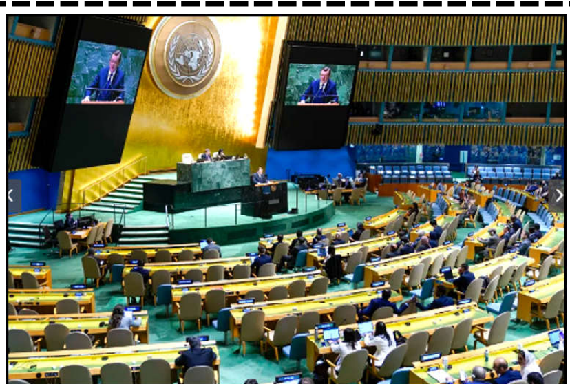
Belarus Foreign Minister Sergei Aleinik addresses the 78th session of the United Nations General Assembly.

Monitoring Desk SWEDEN: Swedish police said on Tuesday that they were investigating whether a fire that reduced a mosque to rubble the previous day in central Sweden was arson. "The investigation into the fire is continuing. Police will question witnesses and verify whether there were security cameras in the area," the police said in a statement on their website. The fire broke out on Monday around noon in Eskilstuna, a town of 108,000 people 150 kilometres (93 miles) west of Stockholm, causing no injuries, a police spokesman told AFP. There are no suspects and no arrests have been made. "The mosque is almost completely destroyed, nothing can be saved," mosque spokesman Anas Deneche told AFP. Deneche said the mosque had been the target of several acts of violence in the past year and his family had been threatened.