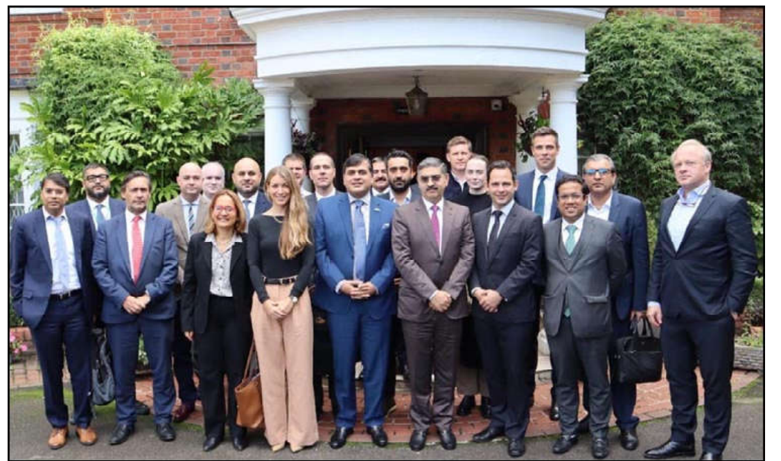
LONDON: Senior leaders of London's capital and financial market cell on the caretaker Prime Minister Anwaar-ul-Haq Kakar.

improvements such as reduced inflation with expected sustained decline, and upcoming growth in agriculture and industry. He mentioned improved trade after removal of restrictions on imports and fiscal measures for monetary support and medium-term inflation targets. The prime minister highlighted Pakistan's pro-investment efforts, introducing the Special Investment Facilitation Council (SIFC). This initiative, led by the prime minister himself.