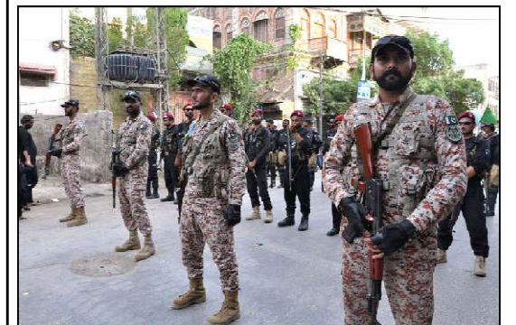
HYDERABAD: Security officials are standing high alert to avoid untoward incident during the Shiite procession of Chup-Lazia on the occasion of 8th Rabiul-Awwal every year to commemorate the death of Hazrat Imam Hasan al-Askari (R.A), in Hyderabad.

LAHORE (INP): The Drug Regulatory Authority of Pakistan (DRAP) on Monday launched a crackdown against medicine distributors amid the rising cases of vision loss due to the use of substandard injections in Punjab, says in media reports. Initially, it was reported that the eyesight of over 400 diabetes patients was affected in Punjab after which the provincial caretaker government imposed a two-week ban on Avastin's sales.