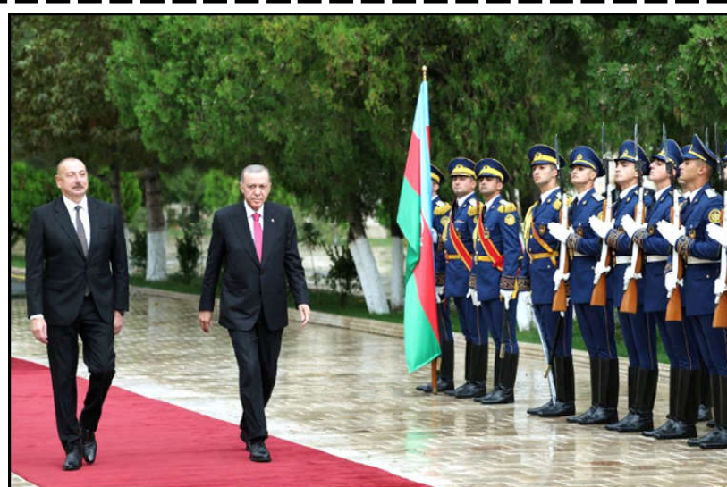
Turkish President Tayyip Erdogan and Azerbaijani President Ilham Aliyev attend a welcoming ceremony in Nakhchivan, Azerbaijan.

"The new target of Azerbaijan and Turkey is Syunik (a province in southern Armenia through which such a corridor would pass). They are already openly declaring it. Active preparations for war are underway," it said.