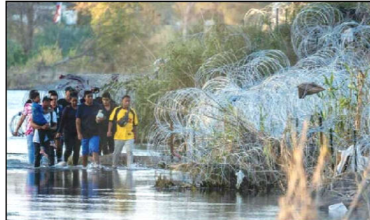
Migrants walk along razor wire looking for a place to cross the Rio Grande river, near the US-Mexico border.

Dombrovskis spoke before high-level economic and trade talks with Chinese Vice Premier He Lifeng. EU leaders have expressed concern about the bloc's growing trade deficit with China, which reached 396 billion euros last year. European Commission President Ursula von der Leyen recently announced an investigation into Chinese subsidies to electric vehicle makers, saying a flood of cheaper Chinese cars is distorting the European market.