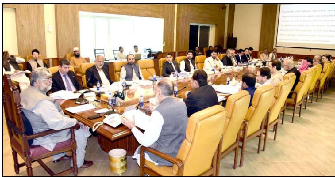
QUETTA: Caretaker Chief Minister Mir Ali Mardan Khan Domki presiding over meeting of Provincial Committee formed for first Cloud Policy 2023 of Balochistan.

The Governor Balochistan said that the national level policies should not only be reflective of the social requirements and present situation, but they should also be the guarantor of sustainable solution to the real issues of the masses.