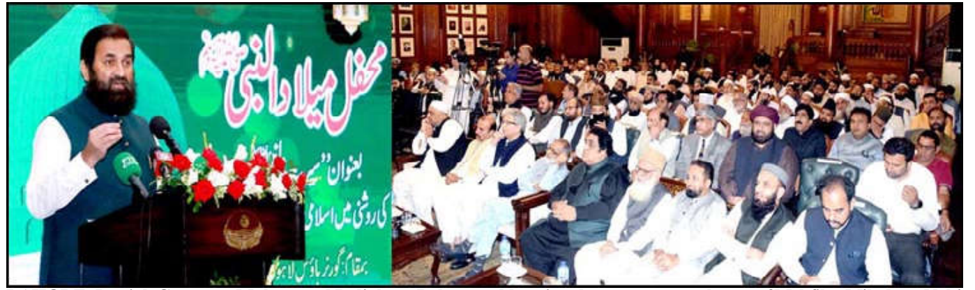
LAHORE: Punjab Governor Muhammad Baligh-ur-Rehman addressing the ceremony on the eve of Mehfil-e-Milad-un-Nabi (SAWW) at Governor House.

conventional roads, these innovative constructions are not susceptible to rain-induced damage. Moreover, the financial outlay for constructing a plastic road has been significantly reduced, with this project amounting to Rs 2 crore as opposed to the standard Rs 6 crore for a regular road. A crucial environmental benefit is that the plastic used in these roads is sourced from recycled materials, effectively repurposing plastic waste that would otherwise contribute to environmental pollution. This eco-friendly approach to road construction not only minimizes costs but also serves as a sustainable solution.