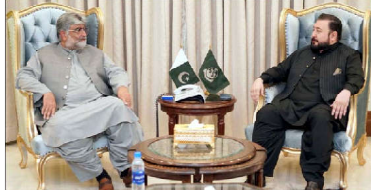
QUETTA: Senator Prince Agha Umar Ahmedzai meeting with Caretaker Chief Minister Mir Ali Mardan Khan Domki

ISLAMABAD (APP): Minister for Planning, Development and Special Initiatives Muhammad Sami Saeed on Monday chaired a meeting of the National Price Monitoring Committee (NPMC) to review the prices of essential commodities, directing the quarters concerned to maintain food prices and provide relief to the common man. The minister emphasized zero-tolerance against hoarders and profiteers, directing the provincial governments to engage their respective Commissions, Deputy Commissioners and Magistrates against the elements involved in hoarders, a news release said. Among others, the meeting was attended by the Chief Statistician from the Pakistan Bureau of Statistics (PBS), representatives from all provinces, the Federal Board of Revenue (FBR), Ministry of Food Security & Industries, and other relevant stakeholders. During the meeting, the PBS officials presented the price and inflation data, while representatives from Punjab, Khyber Pakhtunkhwa, Sindh and Balochistan apprised the forum on the current production and supply of wheat, sugar and other essential commodities, which remained satisfactory. The meeting decided that the PBS would give access to its App to the provinces so that prices could be monitored and controlled effectively. It also highlighted the importance of minimizing the price difference between wholesale and retail items and directed the relevant stakeholders.