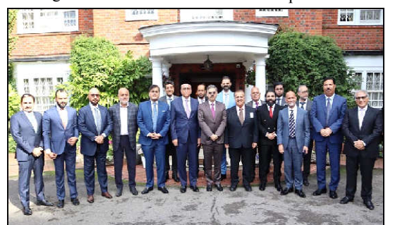
LONDON: A delegation of prominent British Pakistani businessmen call on the Caretaker Prime Minister Anwaar-ul-Haq Kakar.

This initiative aims at enhancing ease of doing business, removing bureaucratic hurdles, and creating a long-term investment roadmap. Moreover, Prime Minister Kakar also shared the government's resolve and commitment to privatize loss-making state-owned enterprises.