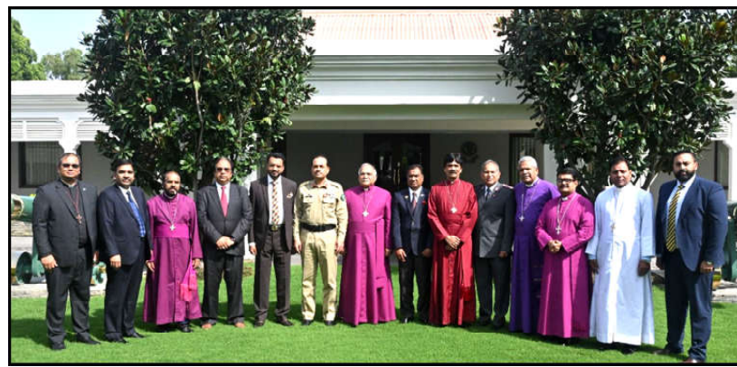
RAWALPINDI: Moderator and President Bishops (Church of Pakistan and Bishop of Raiwind) Dr. Azad Marshall along with 13 members' delegation of Christian Community called on the Chief of Army Staff (COAS) General Syed Asim Munir at General Headquarters