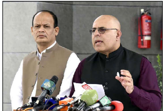
QUETTA: Caretaker Information Minister Jan Achakzai talking with mediapersons