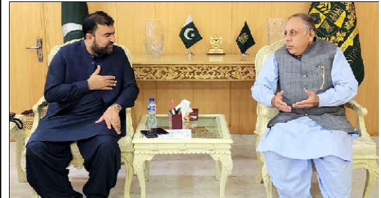
Caretaker Federal Minister for Interior Sarfaraz Ahmed Bugti in a meeting with Former Federal Minister Mir Changaz Khan Jamali in Islamabad.

ISLAMABAD (APP): The EU has released an additional €1 million in humanitarian aid to respond to the floods that have affected Pakistan in the past weeks, which have directly or indirectly affected some 900,000 people. The funding will help address the most pressing needs of vulnerable people in the provinces of Balochistan, Sindh, Punjab and Khyber Pakhtunkhwa (KP), as the areas hit the hardest, said a news release. Commissioner for Crisis Management, Janez Lenarcic, said: "One year after the tragic floods that caused tremendous suffering in Pakistan, the EU remains committed to helping those most in need. As a new rain season has again displaced thousands of people in parts of the country, this additional EU funding will help support vulnerable communities as they try to recover their former lives." This allocation will be used to provide multi-sectoral humanitarian assistance to those who remain displaced, as well as those who have returned to their place of origin, given the level of damage to houses and key basic services such as water and sanitation or health. As the winter season approaches, multi-purpose cash assistance, shelter and non-food items will be prioritized. This new funding comes in addition to the €16.5 million already allocated in humanitarian assistance to Pakistan earlier this year, in order to assist the most vulnerable population affected by conflict and climate-induced disasters.