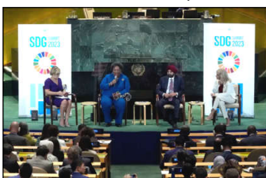
Gillian Tett of the Financial Times, moderator, Prime Minister of Barbados Mia Amor Mottley, Wold Bank Group President Ajay Banga and Carolina Cosse, Mayor of Montevideo, Uruguay, participate in the United Nations Sustainable Development Forum.

The legislation now requires approval from Parliament's upper house and half of the country's 28 state legislatures, which is considered likely. Shah said it will be implemented in the 2029 national elections following a new census and an adjustment of voting districts after next year's elections.