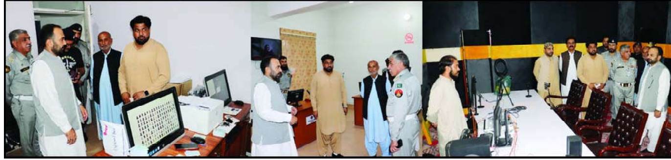
QUETTA: Provincial Home Minister Capt (Retd) Muhammad Zubair Jamali inspecting different sections during his visit to traffic police office