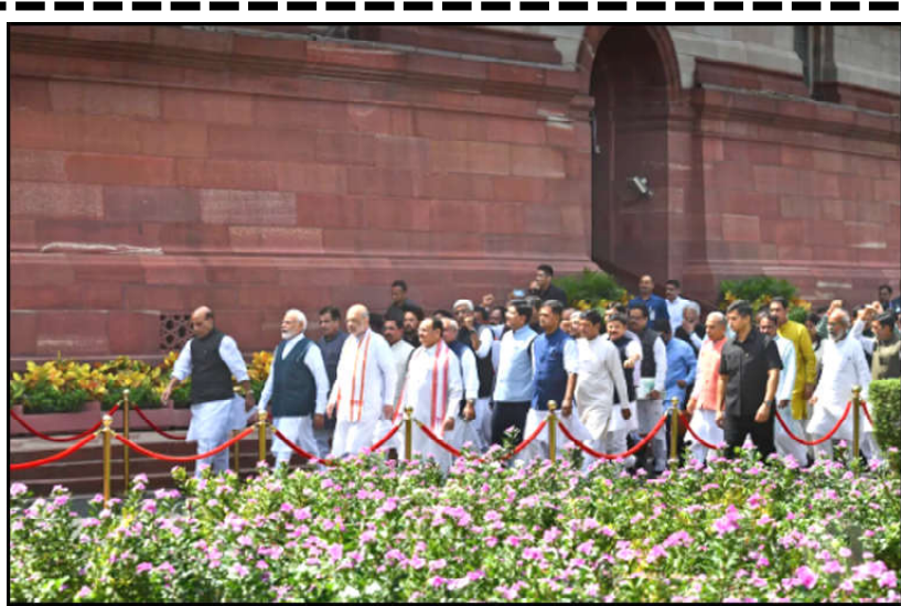
Indian Prime Minister Narendra Modi with other lawmakers walks in a procession to enter the new Parliament building, in New Delhi, India.