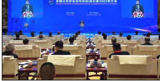
LIANYUNGANG: Federal Minister for Interior, Sarfraz Ahmed Bugti addressing the opening session of the 2023 Conference of Global Public Security Cooperation Forum in Lianyungang.