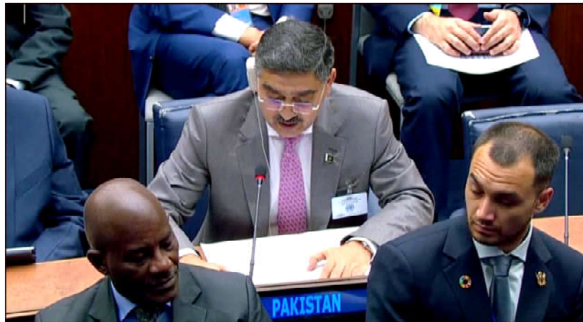
Caretaker Prime Minister Anwaar-ul-Haq Kakar addressing the conference on "Pandemic Prevention, Preparedness and Response" held on the sidelines of 78th session of the United Nations General Assembly in New York

Umar Farooq informed that Tech Valley is also working to digitalize the information department of Balochistan under a pilot programme besides the Google career certificates programme.