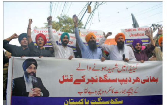
LAHORE: Sikh Community of Pakistan holds protest outside Press Club against the alleged death of Sikh person in Canada.

The Sikh community also raised slogans against the Indian government and demanded that the international community must take notice of the atrocities and ethnic cleansing perpetrated against Sikhs by the Modi government.