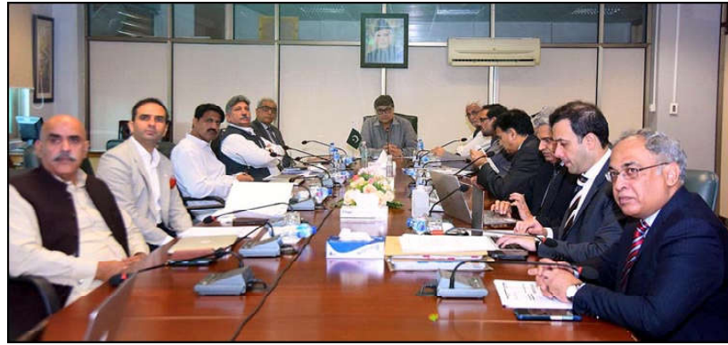
ISLAMABAD: Federal Minister for Privatization Fawad Hasan Fawad chaired a meeting on PIA in on September 20, 2023. Advisor to PM on Aviation was also present.