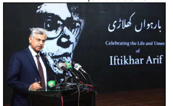
ISLAMABAD: Federal Caretaker Minister for Information and Broadcasting Murtaza Solangi addressing during screening of documentary on the life and achievements of Iftikhar Arif Titled "Barhwaan Khiladi" at Information Services Academy.

He said UNICEF is currently taking care of 2400 schools and the number of these schools could be enhanced to 3600 if there is strong coordination between the education department and UNICEF.