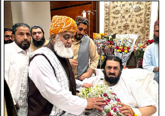
KARACHI: Amir Jamiat Ulema-e-Islam Maulana Fazur Rehman enquiring about health of Hafiz Hamdullah who was injured in Mastung blast.

Undoubtedly, he mentioned that the signers and artists happen to be the ambassadors of social activities as such there is a dire need to encourage and financially support those associated with them. He also stressed the need to honour the democratic behaviours and difference of opinion and maintain the environment of peace and harmony so as to create more stability, equality and mutual trust in the society.