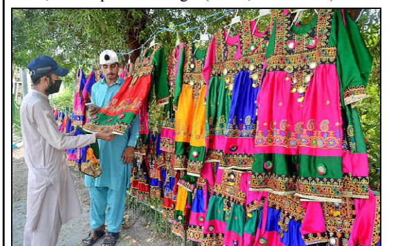
MULTAN: Roadside vendor displaying colorful fancy dresses to attract customers.

The main commodities of exports during August 2023 were Knitwear (Rs. 117,892 million), readymade garments (Rs. 83,447 million), bedwear (Rs. 74,081 million), cotton cloth (Rs. 47,002 million), cotton yarn (Rs. 30,793 million), towels (Rs.25,567 million).