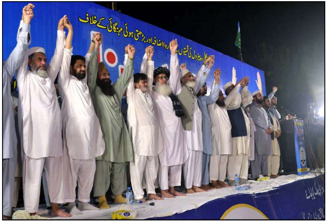
PESHAWAR: Jamat-e-Islami (JI) Chief, Siraj-ul-Haq along with other leaders joint hand with other leaders to express their solidarity during protest demonstration against massive unemployment, increasing price of daily use products, inflation price hiking and the highly inflated electricity bills, held near Governor House building in Peshawar.

The 4FR document suggested effective coordination and participation arrangements among the federal and provincial governments, development partners, donors, international and national NGOs, academia and private sectors. The majority of the projects for the flood-affected areas are being executed by the provinces which have been already approved by the Central Development Working Party and ECNEC (Executive Committee of the National Economic Council.) On the occasion, the WB Country Director WB appreciated the facilitation and proactive role of the Planning Ministry which established a green channel for the quick approval.