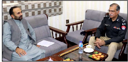
QUETTA: Additional IG Jawad Dogar meeting with Caretaker Home Minister Caption (ret'd) Muhammad Zubair Jamali

Bilawal's comments came after the PPP rejected even the possibility of such an alliance with the PTI while the member parties of the Pakistan Democratic Movement (PDM) drift apart.