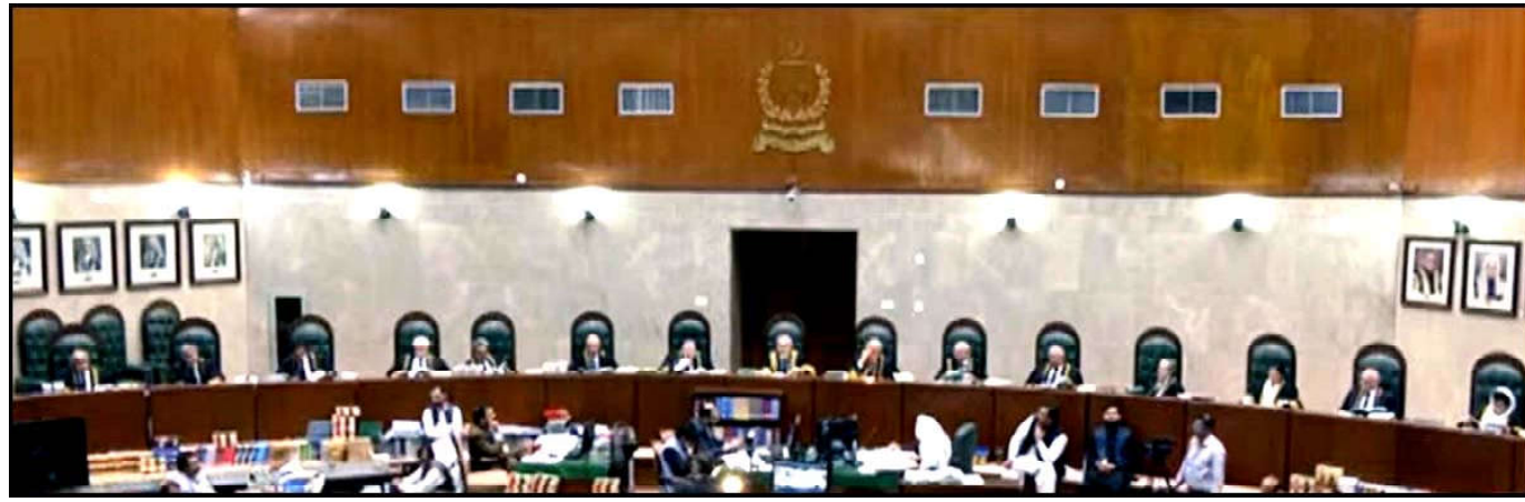
ISLAMABAD: Chief Justice of Pakistan, Justice Qazi Faez Isa presides over the hearing of petitions challenging the Supreme Court (Practice and Procedure) Act 2023, held at Supreme Court of Pakistan Building in Islamabad.

Ph: 2841470/2841473 Vol: XVI No. 120, Rabi-ul-Awwal 02, 1445 AH Tuesday September 19, 2023, Pages 08, Price Rs.15