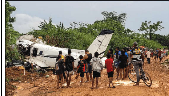
People stand looking at the site where an Embraer EMB-110 aircraft of the Manaus Aerotaxi airline crashed, causing the deaths of 14 people during the plane's landing the previous day at Barcelos airport, about 400 km from Manaus, Amazonas state, Brazil.

Monitoring Desk OTTAWA: Canada will contribute C$33 million ($24.5 million) to a British-led partnership that is buying air defense equipment for Ukraine to help it fend off Russian missile and drone attacks, Defence Minister Bill Blair said on Sunday. In a statement, Blair said the contribution was part of the C$500 million worth of military aid for Kyiv that Prime Minister Justin Trudeau announced in June.