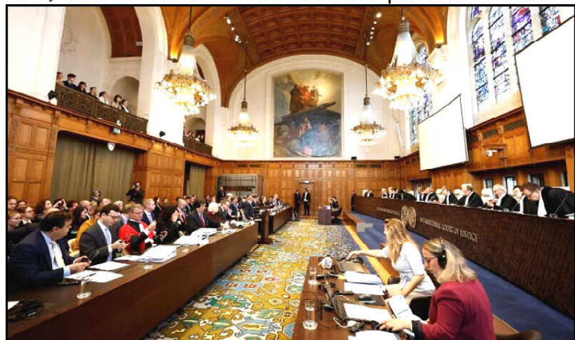
Members of the World Court listen as Russia begins presenting its objections against the jurisdiction of the World Court in a genocide case brought by Ukraine which claims Moscow falsely applied genocide law to justify its February 24, 2022 invasion, in The Hague, Netherlands.

tory, has conducted increasingly large military drills in the air and waters around Taiwan as tensions have grown between the two and with the United States. The U.S. is Taiwan's main supplier of arms and opposes any attempt to change Taiwan's status by force. The Chinese government would prefer that Taiwan come under its control voluntarily and last week unveiled a plan for an integrated development demonstration zone in Fujian province, trying to entice Taiwanese even as it threatens the island militarily in what experts say is China's long-running carrot.