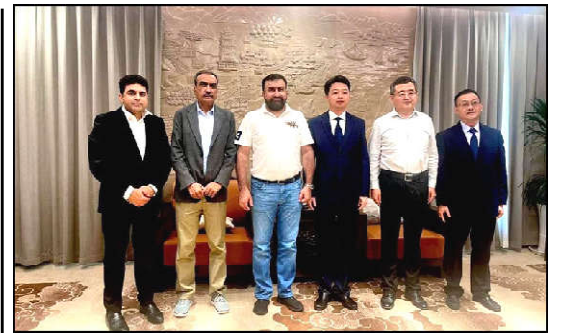
Federal Minister for Interior Sarfaraz Bugti received by Mayor Lianyungang on his arrival to attend 2023 Conference of Global Public Security Cooperation Forum.

The federal government has said in the reply that parliament can legislate under article 191 of the constitution. Article 191 of the constitution does not stop the parliament from legislating. The independence of the judiciary is not affected by practice and procedure act. The reply said no power of SC has been returned under practice and procedure act.