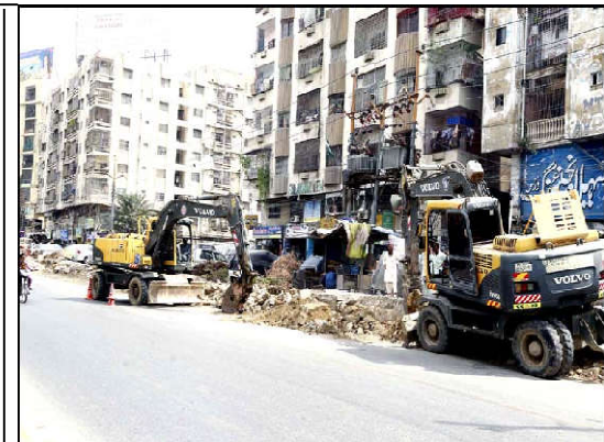
KARACHI: Construction works of new development projects for extending road is underway under the supervision of local government department, as slow pace of construction work is creating problems for commuters due to traffic jam and they demand to concerned department to complete work as soon as possible, located on Shahrah-e-Faisal road in Karachi.

search, Innovation and Commercialization were present on this occasion. As per the MoU, Plus W would give three months of short-course certification in Artificial Intelligence, Big Data, Blockchain, Deep Learning, Machine Learning, and other technologies. Besides, offering the latest IT course the Plus W would also engage KU students in business Japanese language classes so that they could easily communicate with the Japanese business community.