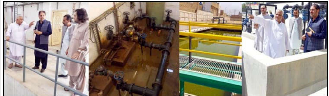
QUETTA: Caretaker Provincial Minister for PHE & Population Welfare Sardar Ejaz Ahmed Khan Jaffar inspecting water treatment plant and booster pump at Sabzal road.

also approach the Supreme Court against the excessive increases in electricity and petrol prices. It is noteworthy that JI has also announced protests in Lahore on September 21, in Quetta on September 24, and in Karachi on October 6, all in front of governor houses, to continue their anti-inflation campaign.