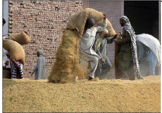
FAISALABAD: Workers spreading the rice crop for drying at a rice warehouse.

Encouragingly, asset quality indicators improved: net non-performing loans (NPLs) to loans ratio lowered to 0.45 percent at end June-23 (0.68 percent in Jun-22) as banks set aside higher amount of provisioning from steady earnings.